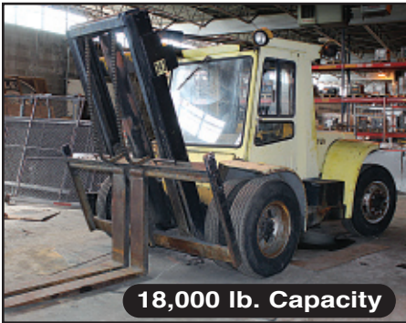
18,000 lb. Capacity