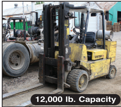
12,000 lb. Capacity