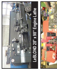
LeBLOND 28" x 98" Engine Lathe