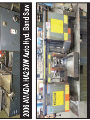
2006 AMADA HA250W Auto Hyd. Band Saw