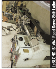
LeBLOND 18" x 54" Regal Servo Shift Lathe

TERMS: 18% Buyers Premium online @ Bidspotter.com plus 6% PA Sales Tax, unless exempt. Full Payment within 24 hours of Receipt of Invoice in Cash, Bank Check, Wire Transfer or Business Check with Bank Letter of Guarantee.