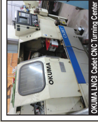
OKUMA LNC8 Cadet CNC Turning Center