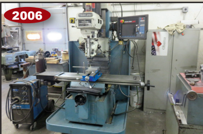
View of TRAK CNC Mill & MILLER 251 Welder

964 Pottstown Pike, Chester Springs, PA (Set back from road behind Pickering Valley Contractors in Lines Storage Complex)