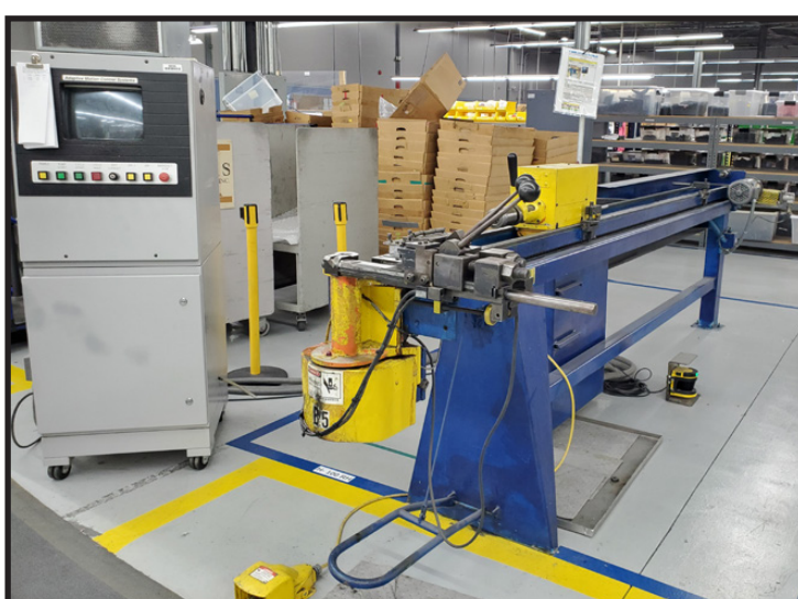
CNC EATON LEONARD TUBE BENDER Model: H100, semi automatic, 1" Cap., Adaptive Motion Control, Upgraded, S/N VBH 10.5