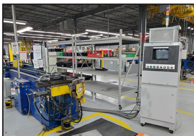
CNC EATON LEONARD TUBE BENDER Model: VB75-GP, 3/4" Cap., Adaptive Motion Control, Upgraded, S/N VB75-55-GL