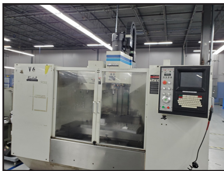
4020 FADAL CNC VERTICAL MACHINING CENTER