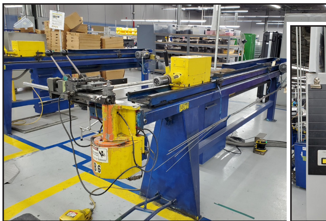
CNC EATON LEONARD TUBE BENDER Model: H100, Semi-Automatic, 1" Cap., Adaptive Motion Control, Upgraded, S/N VBH 10.8