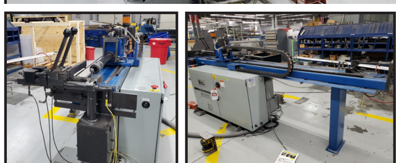
CNC EATON LEONARD TUBE BENDER Model: VBCE25, 1" Cap., Premier Control S/N 25RH 8606761PC12/08 - NEW 2008