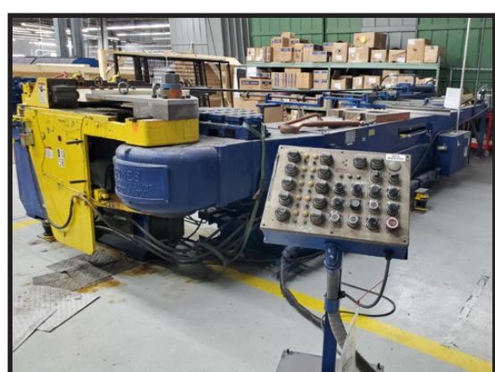
MODEL #4 PINES PIPE AND TUBE BENDER 6" Cap. x .250 Wall Thickness - LOTS of TOOLING S/N 101-2F-53-2114