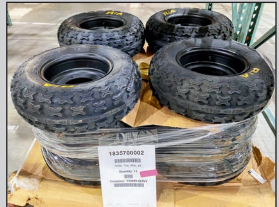
SAMPLE ASSORTED TIRES