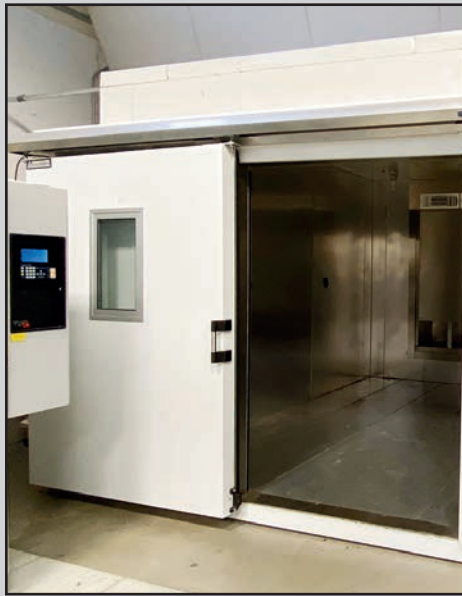
WALK-IN ENVIRONMENTAL TEST CHAMBER WITH TIDAL SYNERGY PLC CONTROLS