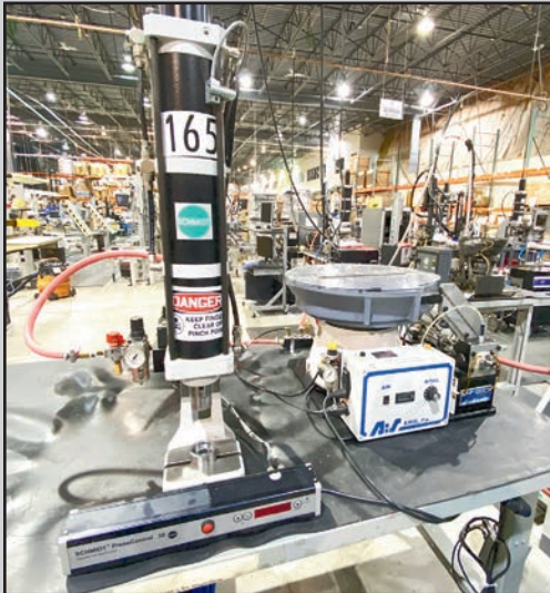
SCHMIDT PNEUMATIC PRESS WITH PARTS FEEDER CUBE