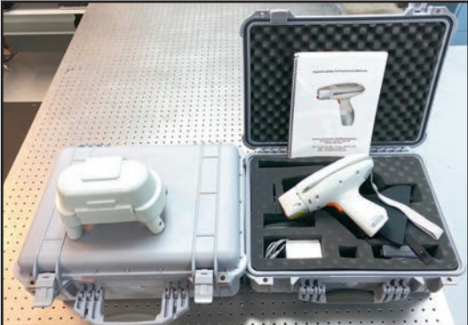
THERMO SCIENTIFIC NITON XLT XFR-LIBS ANALYZER WITH BENCH STAND