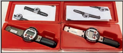
DIGITAL TORQUE METERS