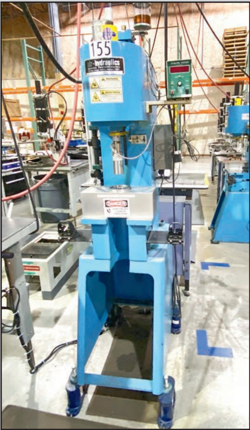
AIR-HYDRAULICS INC. C-400 AIR OVER HYDRAULIC C-FRAME PRESS