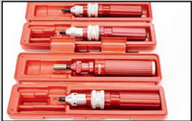
PROTO TORQUE SCREWDRIVERS