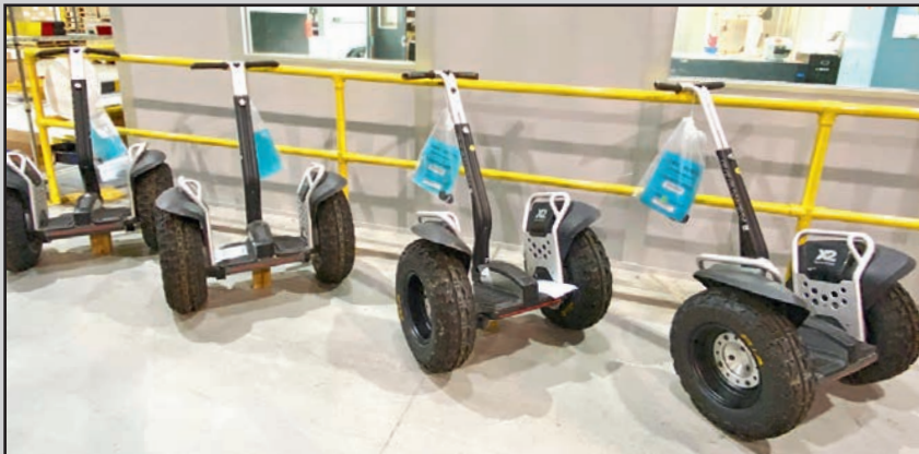
OFF LEASE SEGWAY X-25