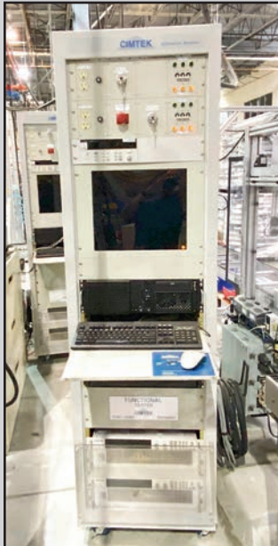
SAMPLE CIMTEK STAND-ALONE FUNCTIONAL TEST SYSTEM