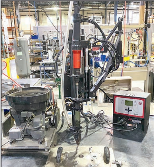
SAMPLE ELECTRONIC TORQUE DRIVER WITH PART INSERTER AND CONTROLS