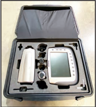
OLYMPUS I-SPEED 2 HIGH-SPEED VIDEO CAMERA SYSTEM

For complete catalog crgllc.com 1.800.300.6852