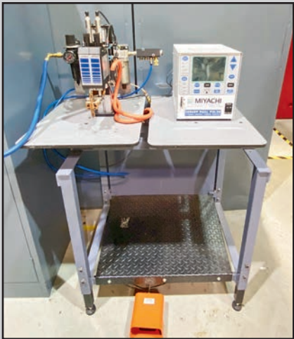
AMADA MIYACHI 300ADP DUAL PULSE WELDING PRESS