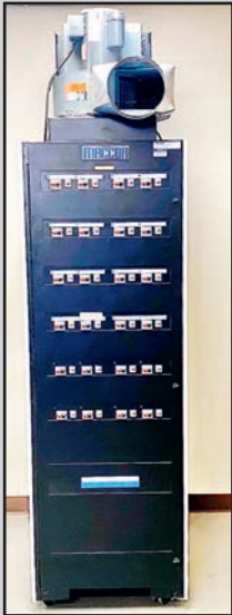
MACCOR SERIES 4000 BATTERY TESTER