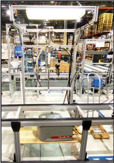
SAMPLE ASSEMBLY STATION