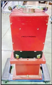
(1 OF 2) ACCUTRONIC SINGLE AXIS ROTARY TEST STANDS