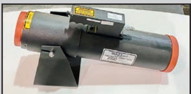
DMC PNEUMATIC CRIMPING TOOL