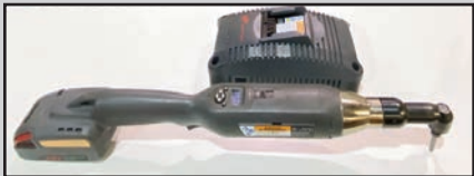
SAMPLE INGERSOLL RAND CORDLESS RIGHT ANGLE DRIVER