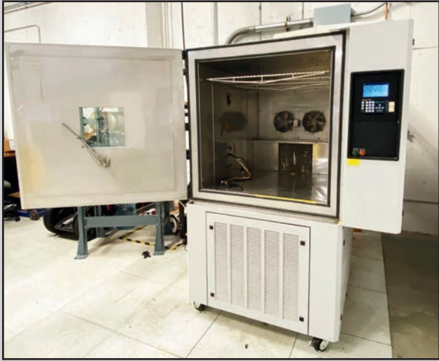
ENVIROTRONICS STAINLESS STEEL INTERIOR ENVIRONMENTAL TEST CHAMBER