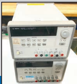
AGILENT E3631A TRIPLE OUTPUT DC POWER SUPPLIES