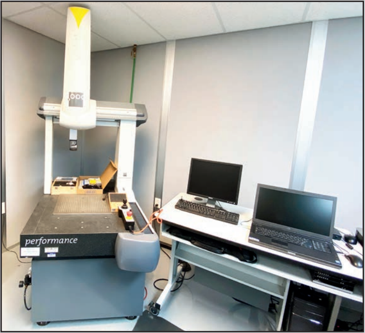
BROWN & SHARPE GLOBAL PERFORMANCE BRIDGE TYPE CMM