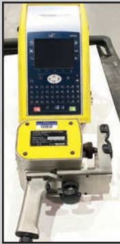
DAPRA HANDHELD DOT PEEN MARKING SYSTEM