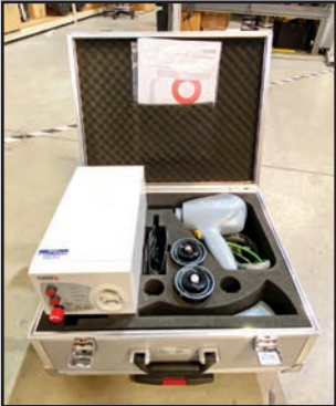
TESEQ NSG 438A ESD SIMULATOR