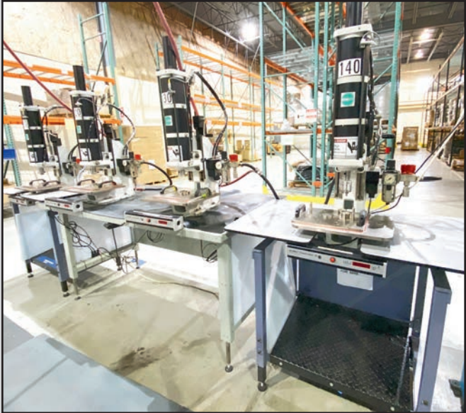
SAMPLE SCHMIDT PNEUMATIC PRESSES