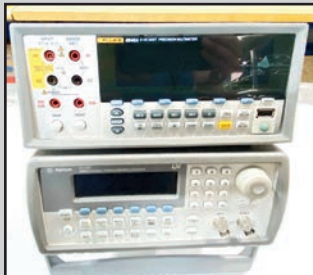
SAMPLE ASSORTED TEST GEAR