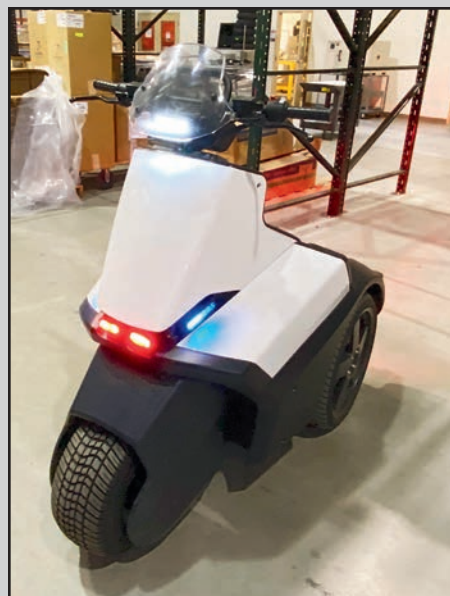
SEGWAY SE-3 PATROLLER WITH POLICE LIGHT PACKAGE