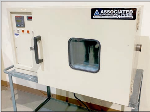
(1 OF 3) ASSOCIATED ENVIRONMENTAL SYSTEMS BENCHTOP ENVIRONMENTAL TEST CHAMBERS