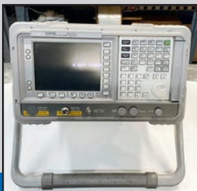
AGILENT 4402B SPECTRUM ANALYZER