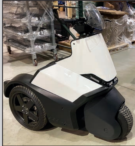
SEGWAY SE-3 PATROLLER WITH POLICE LIGHT PACKAGE