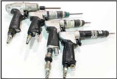
SAMPLE PNEUMATIC PISTOL GRIP DRIVERS