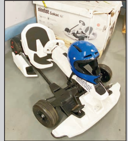
NINEBOT GO KARTS – NEW IN BOXES