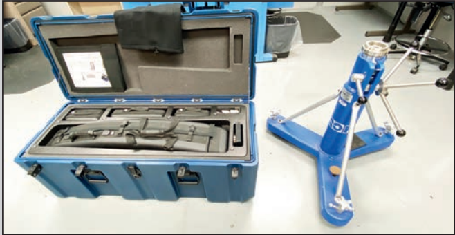
FARO PLATINUM ARM PORTABLE CMM WITH ROLLING TRIPOD – COMPLETE IN CASE