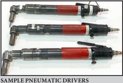
SAMPLE PNEUMATIC DRIVERS