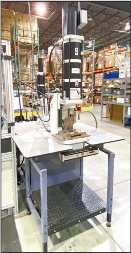
SCHMIDT 7,000-LB. PNEUMATIC PRESS