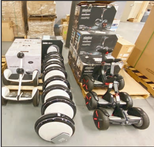
SAMPLE ASSORTED NINEBOT INVENTORY