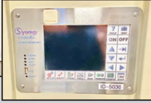
CONTROLS FOR TEST CHAMBER