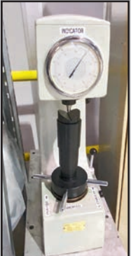
ROCKWELL HARDNESS TESTER