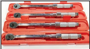
NEW TORQUE WRENCHES IN CASES