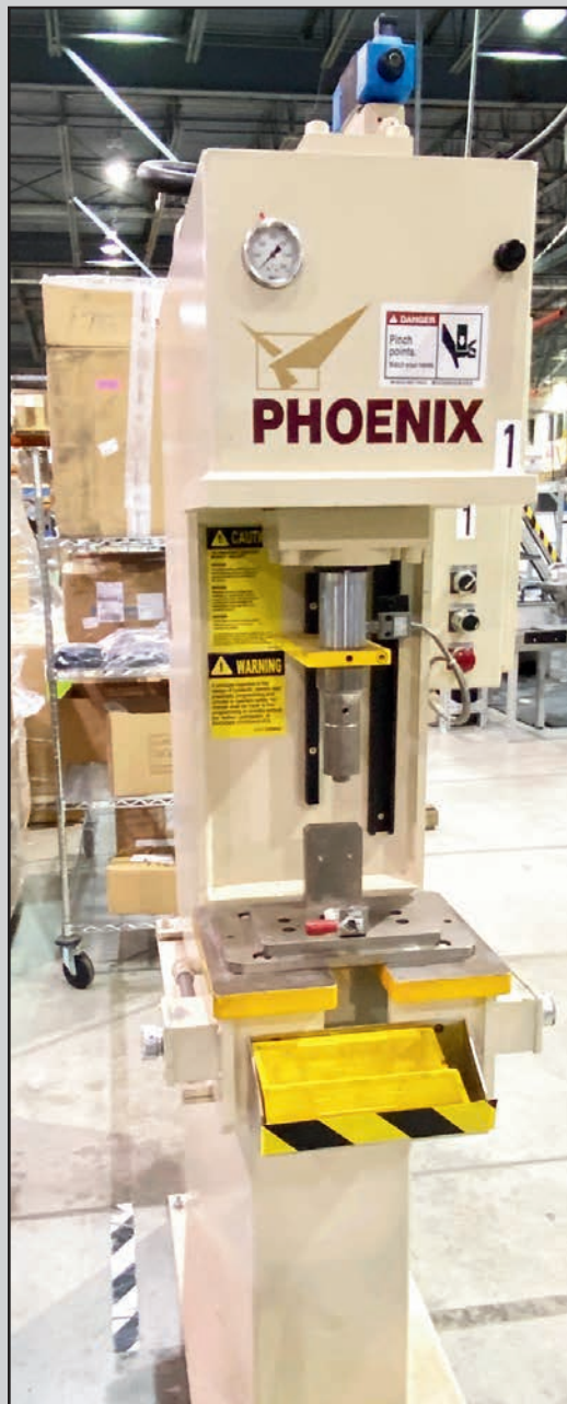
PHOENIX PHX-12 C-FRAME HYDRAULIC PRESS