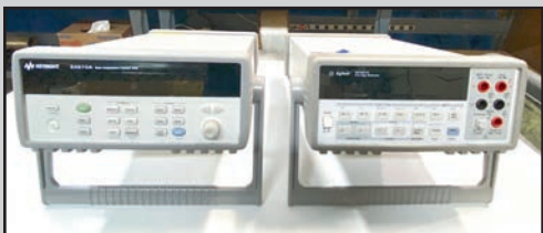
SAMPLE ASSORTED TEST GEAR