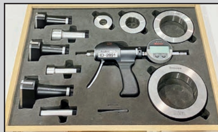
STARRETT ACCUBORE DIGITAL BORE GAUGE SET