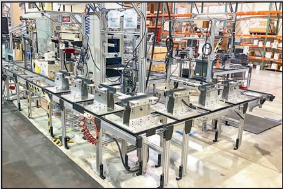
PALLET CONVEYOR SYSTEM