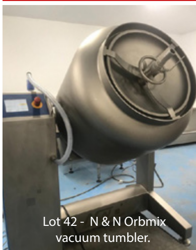
Lot 42 - N & N Orbmix vacuum tumbler.