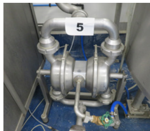
Diaphragm pump Lot 5