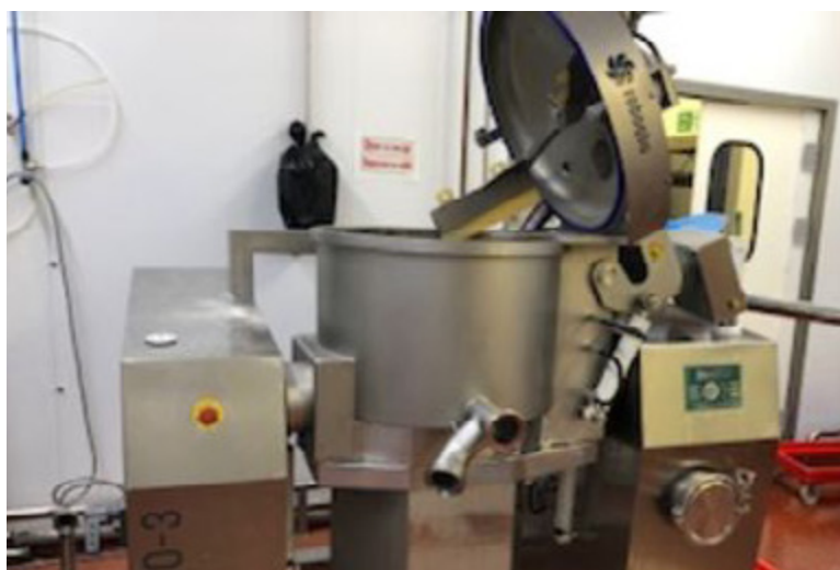
Holmech Roboqbo Lot 63