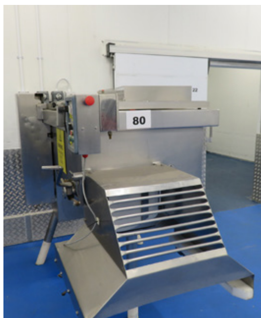
Risco 450 twin shaft paddle mixer Lot 80