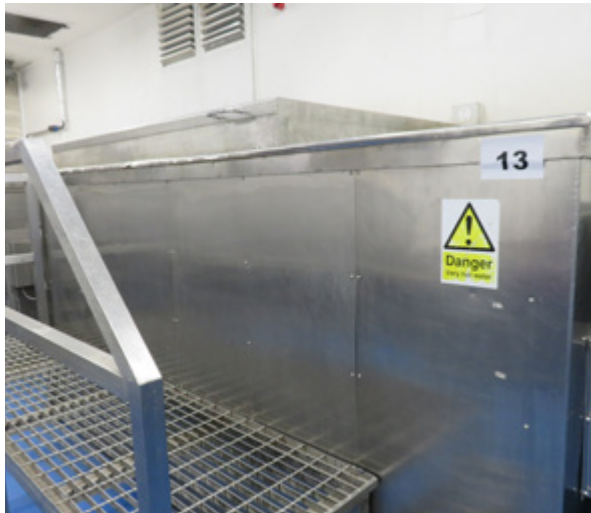
2 x Cooking tanks Lot 13