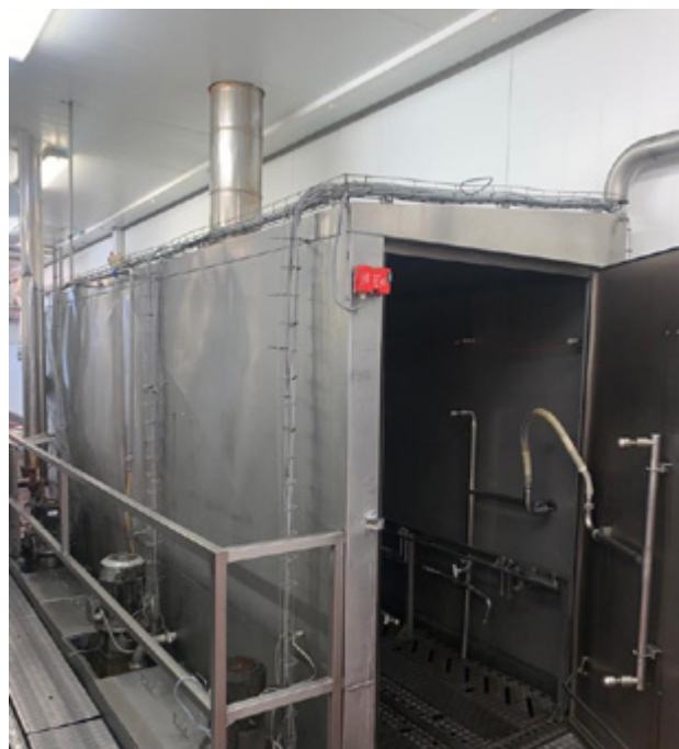
Unitech inline rack washer Lot 31