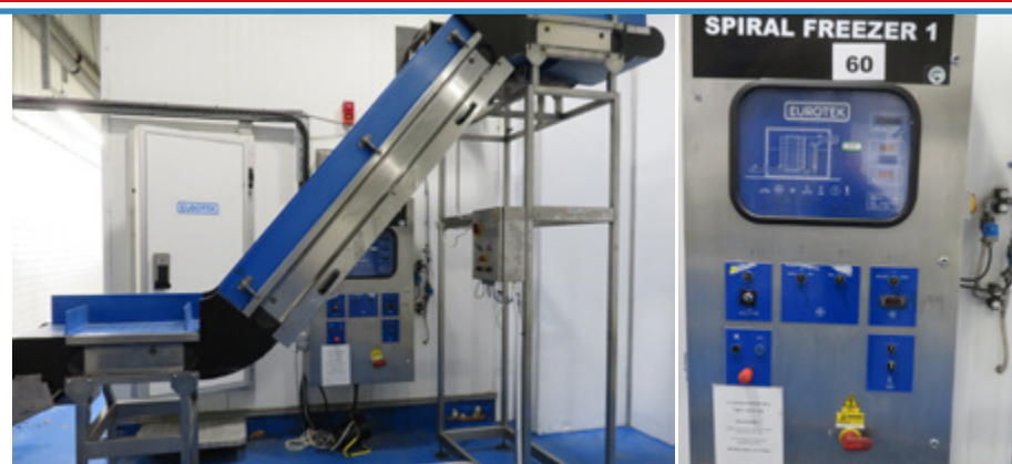
One of the Eurotek spiral freezers - 2 Available 16 & 17 tier