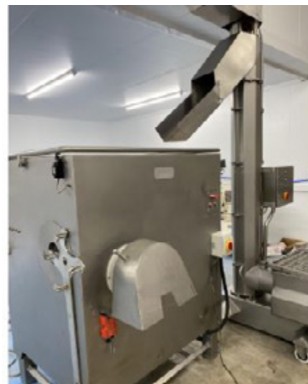
Cato crossfeed mincer Lot 33