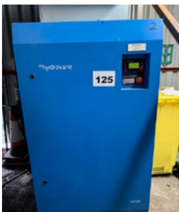
Hydrovane compressor Lot 125