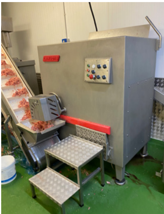
Lakidis Automix grinder Lot 26