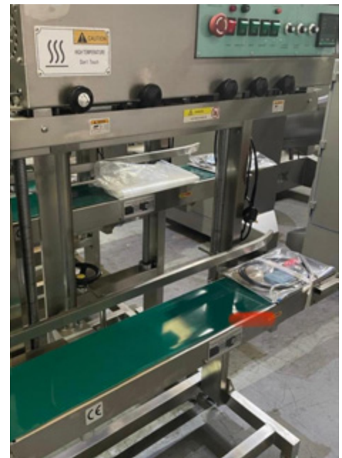
FRL bag sealer. Year 2020 Lot 30