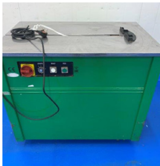
Strapping machine Lot 40