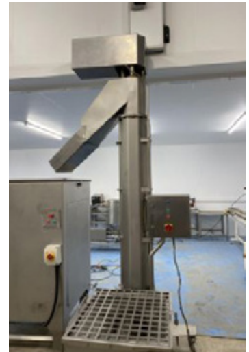
Screw elevator Lot 34