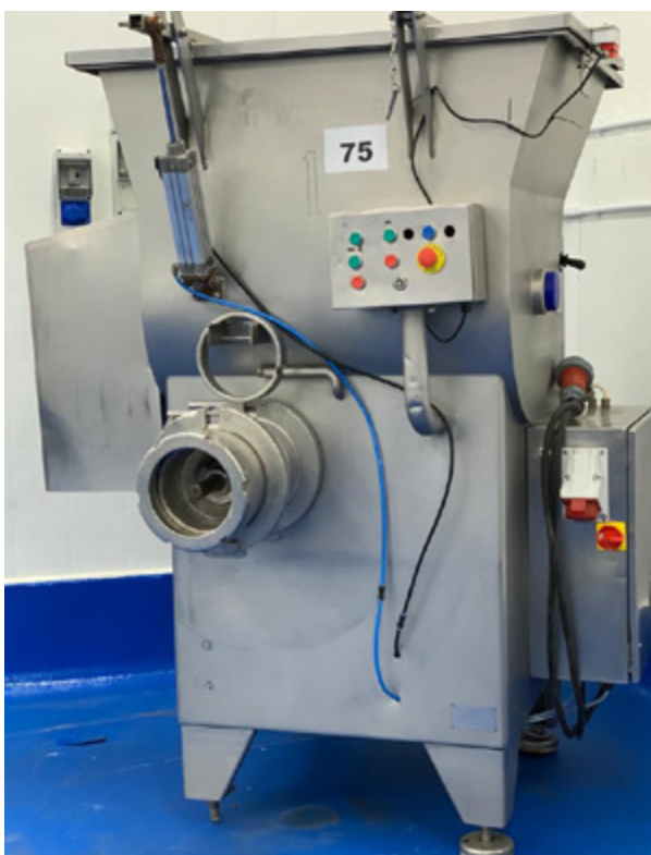
Wolfking SFG400/200 grinder Lot 75