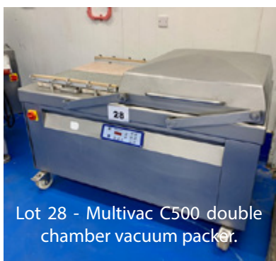
Lot 28 - Multivac C500 double chamber vacuum packer.