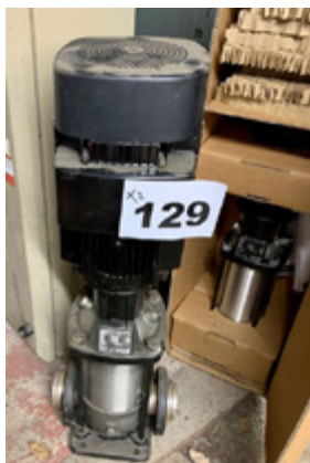
One of the Grundfos pumps Lot 129