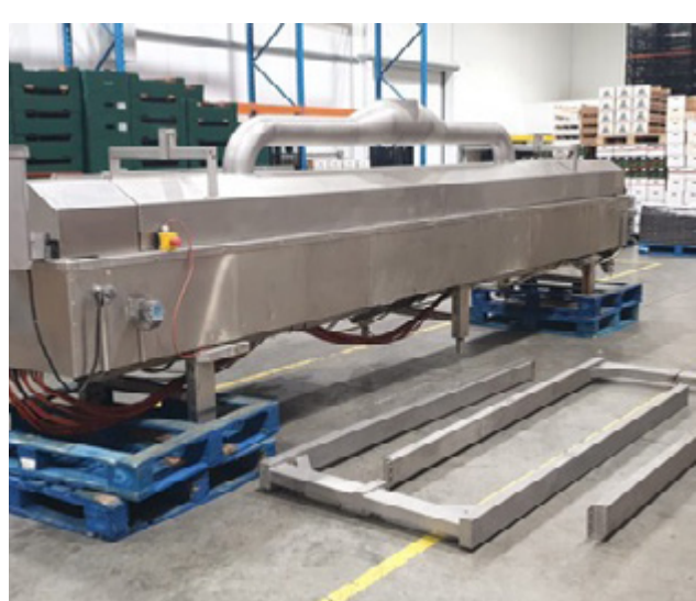
Electric fryer Lot 66