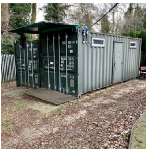
Container Lot 132