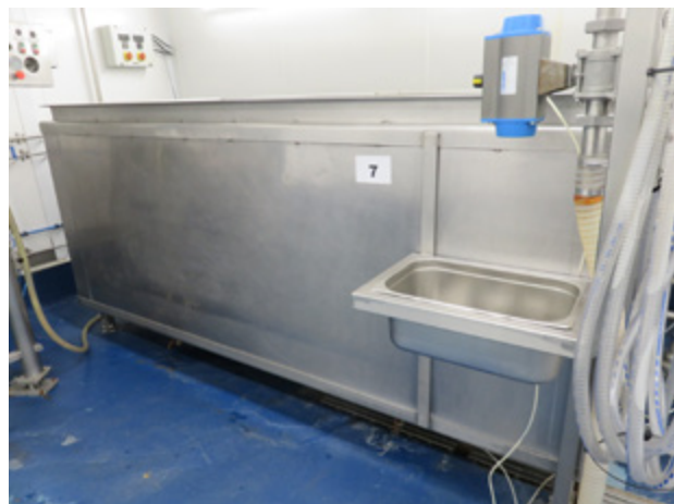
Insulated chilled water tank Lot 7