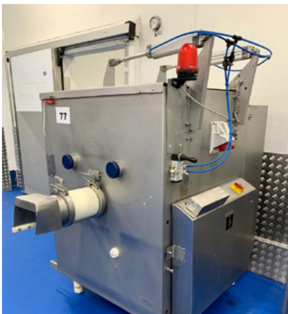
Wolfking TSMG 400 twin shaft mixer grinder Lot 77