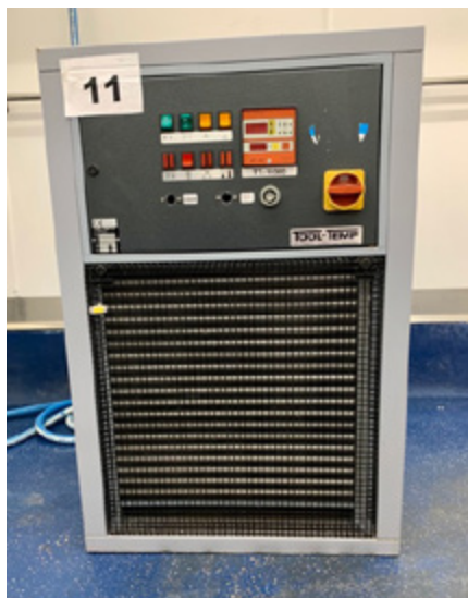
Tool temp water chiller Lot 11