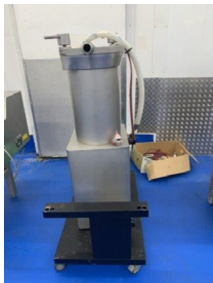
Ramon sausage filler Lot 41