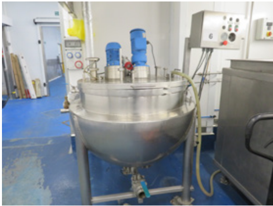
Jacketed vessel Lot 6