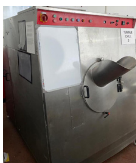
DC Norris TC 75 Lot 64