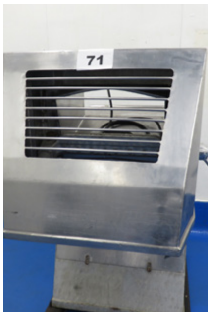
Laska GS520 guillotine Lot 71