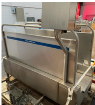
Unitch boot scrubber Lot 67