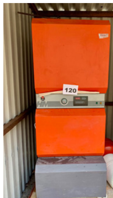
ACM HM boiler for hot water Lot 120