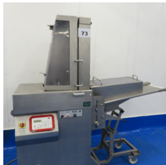
Treif divider Lot 73