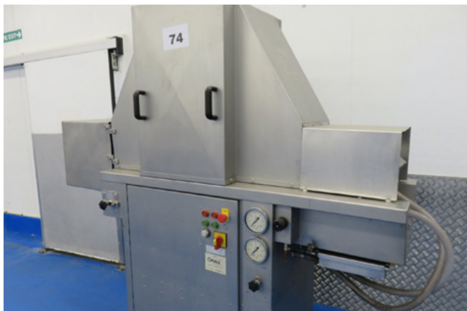
Dorit injector model O'Mat Lot 74