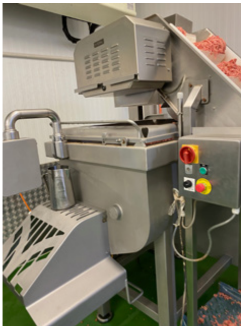
Laskidis 450 litre paddle mixer Lot 27