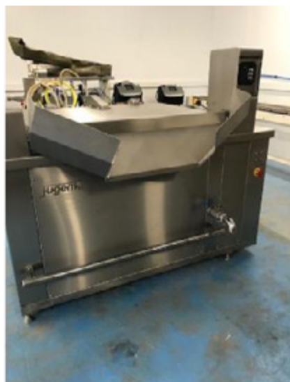
Jugema 300 litre boiler Lot 61