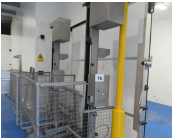
Mobile s/s hoist Lot 76