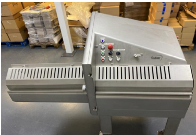
Dadaux chop cutter Lot 45