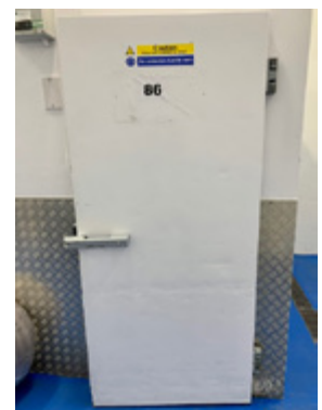
Various refrigeration doors throughout the plant