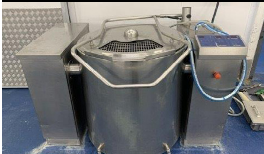
Joni kettle Lot 37