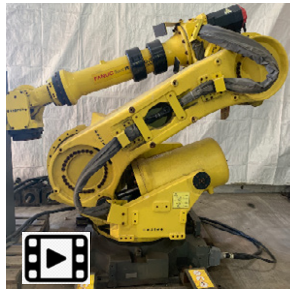
FANUC R-2000iA 6-AXIS ROBOT ARM.