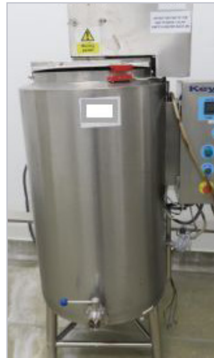
KEYCHOC JACKETED MELTING TANK.