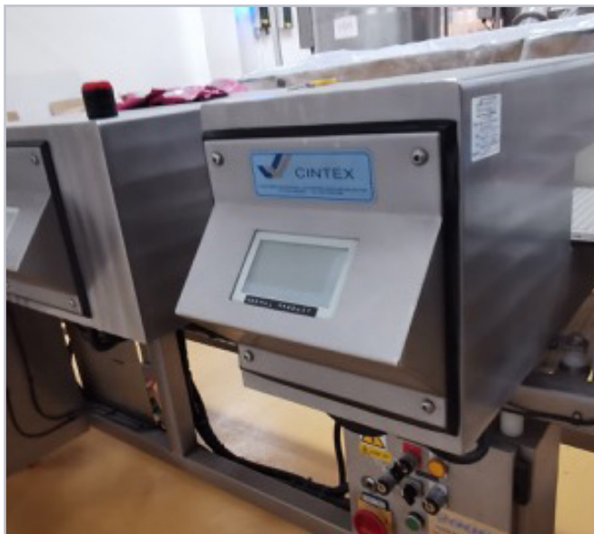
CINTEX TWIN HEAD FERROUS AND NON FERROUS METAL DETECTOR.