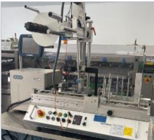
METRONIC UDA 150S SLEEVER.