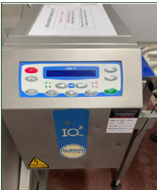
LOMA COMBI UNIT WITH IQ HEAD.