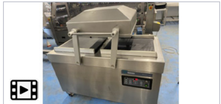
HENKELMAN TOTALLY S/S VACUUM PACKER.