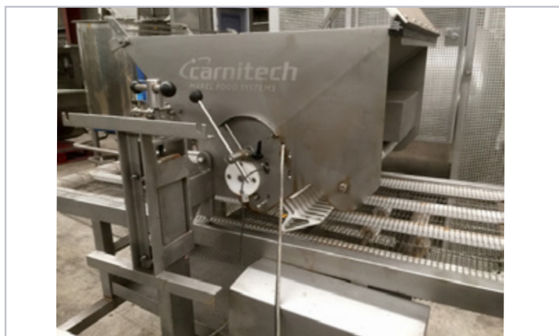
CARNITECH/MAREL FOOD SYSTEMS SALTING MACHINE.