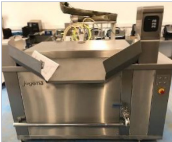
300 LITRE JUGEMA COOKING BOILER. BRAND NEW.