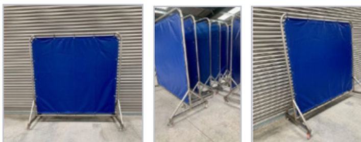
SYSPAL S/S MOBILE WASH SCREENS/PARTITIONS.