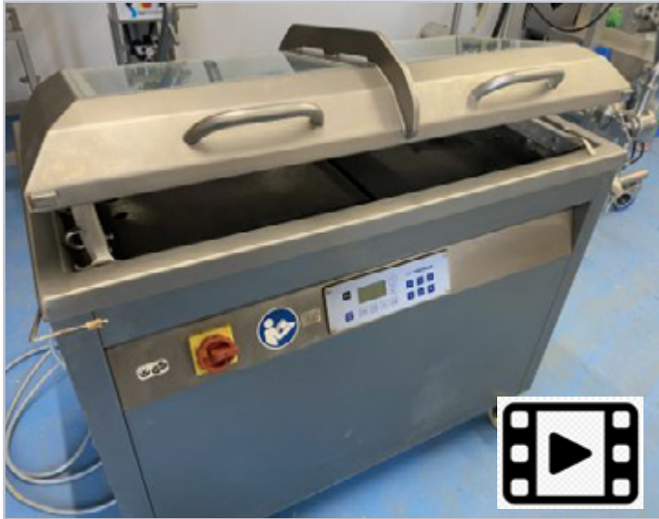
MULTIVAC C370 TWIN SEALING VACUUM PACKER.