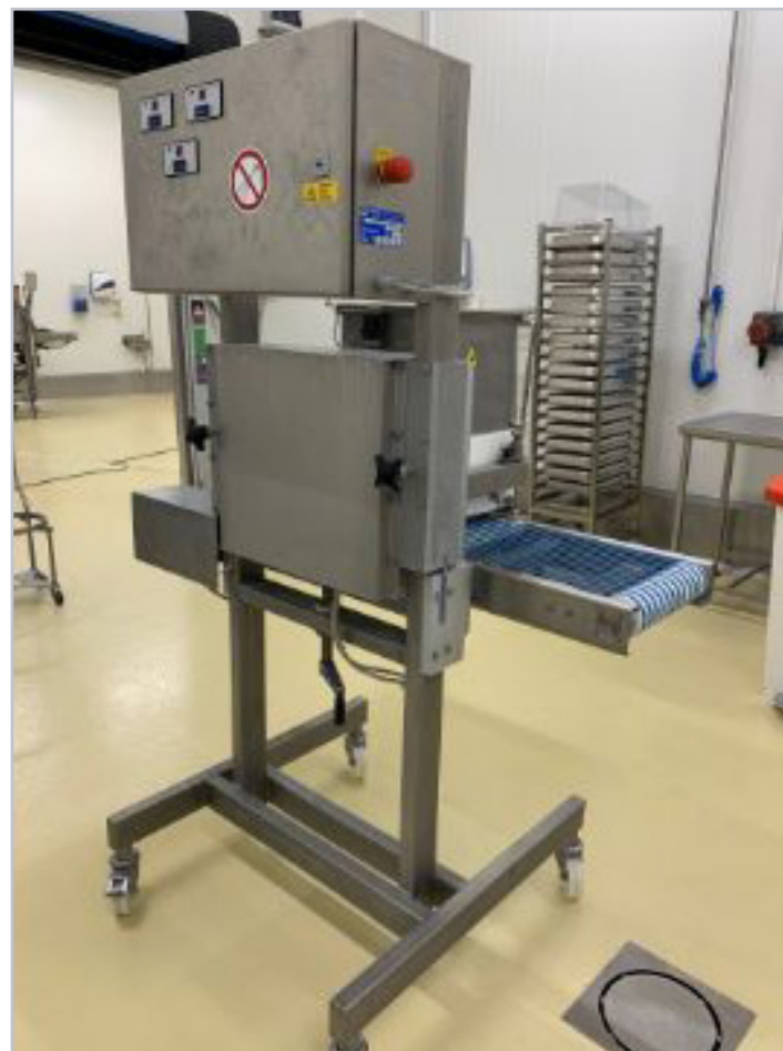
KRUMBEIN RATIONELL BUTTERING SYSTEM.