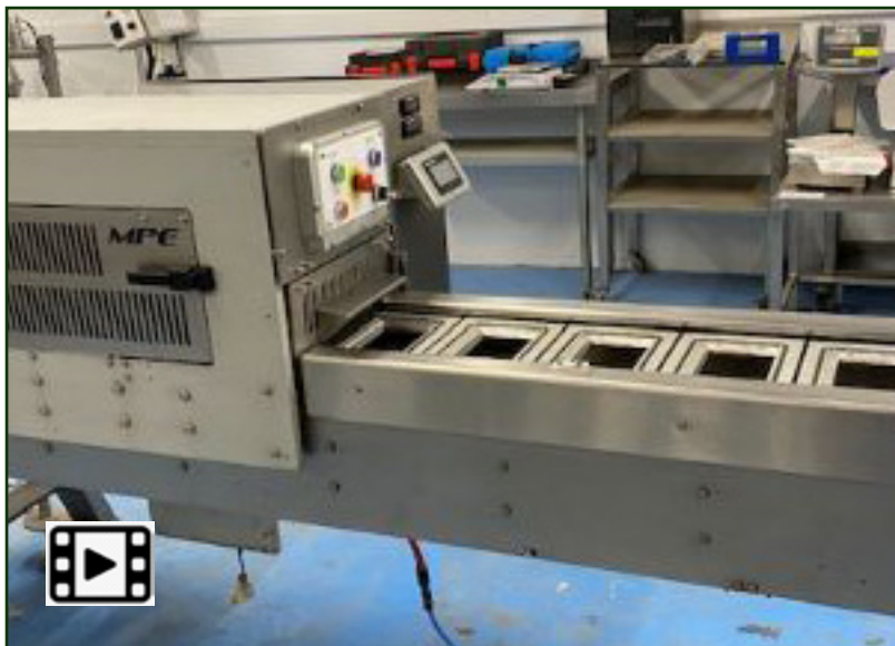
MPE SANDWICH SEALER.