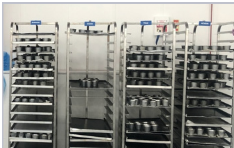
LARGE QUANTITY OF RACKS FOR TRAYS.