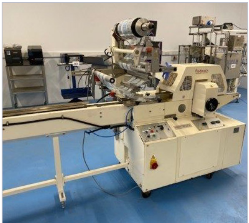
REDPACK PACER FLOWWRAPPER.