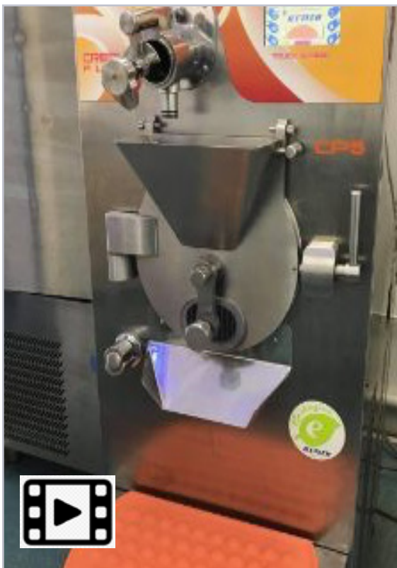
ICETECH CREAM PLUS MACHINE.