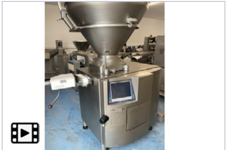
HANDTMANN 622 VAC FILLER WITH HIGH SPEED CUTTER.