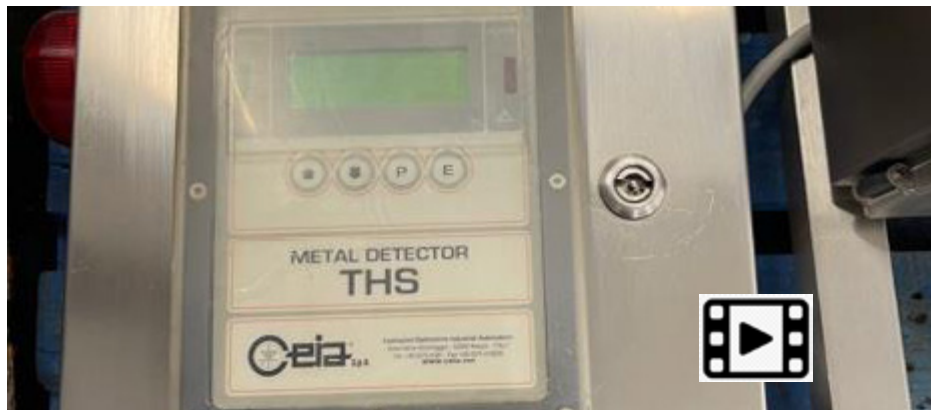
CEIA THS PIPELINE METAL DETECTOR