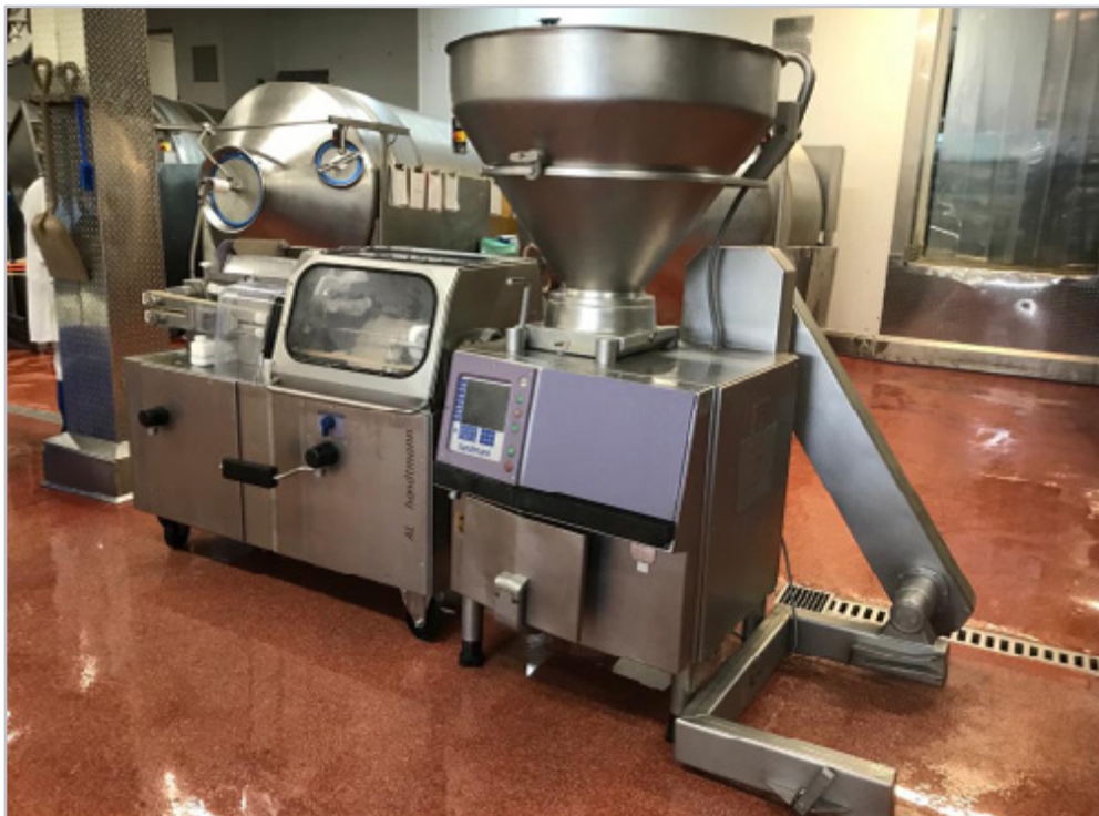
HANDTMANN VF300 VACUUM FILLER WITH HIGH SPEED CUTTER.