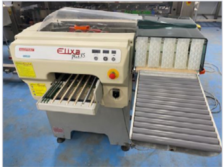
WALDYSSA ELIXA PLUS XS PACKING MACHINE.