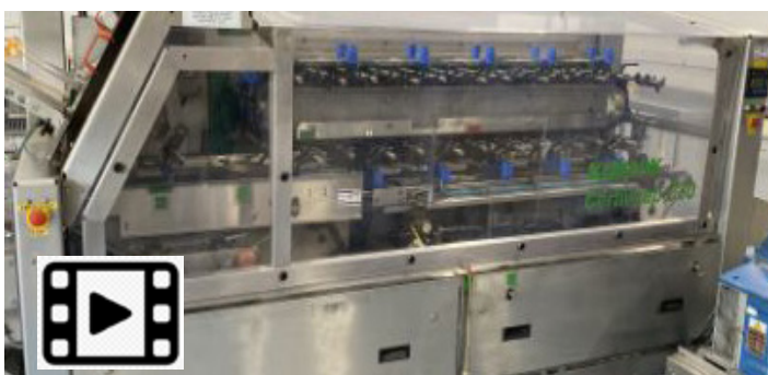
KLIKLOK CERTI WRAP C80 MACHINE.