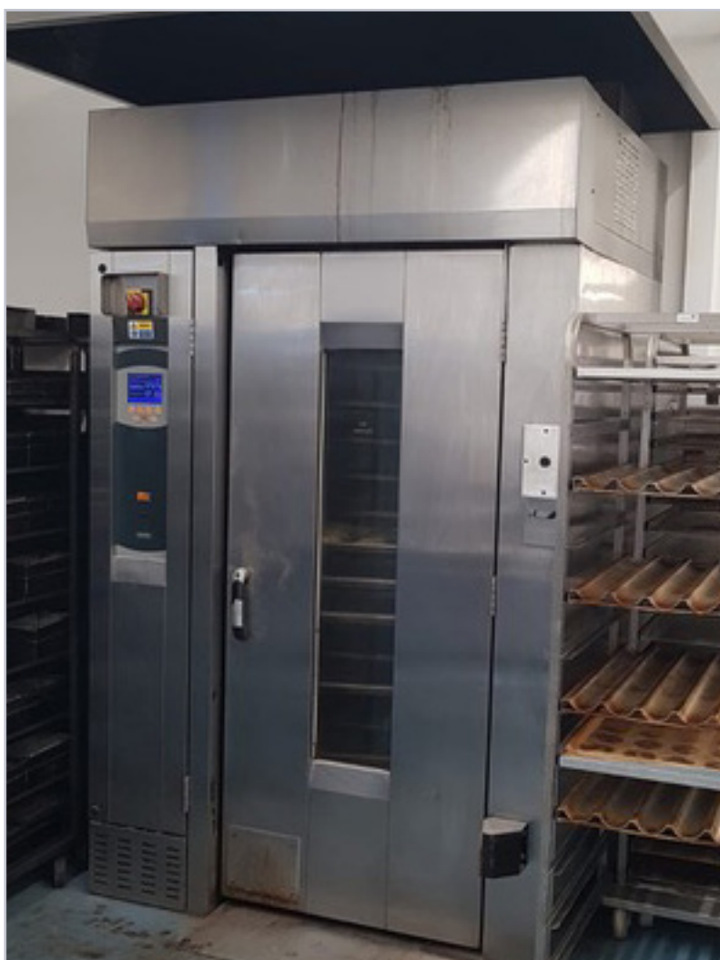
MONO RX ROTARY OVEN.