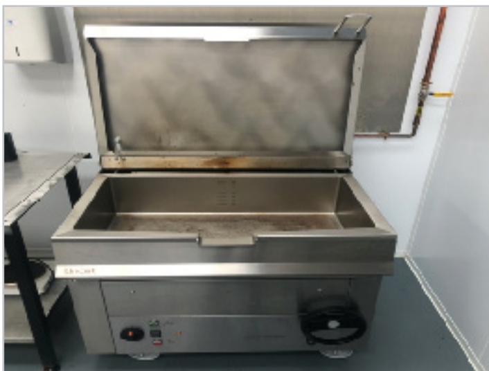
LINCAT BRATT PAN.