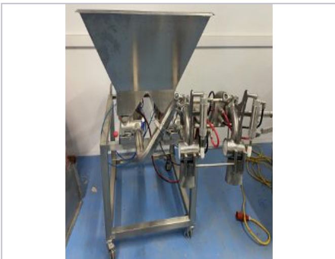
UNIFILLER DUAL HEAD DEPOSITOR.