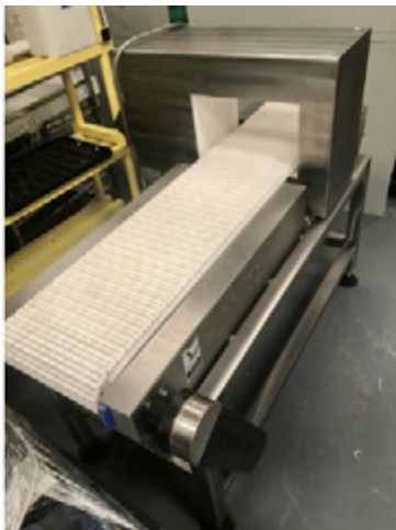
METAL DETECTOR. APERTURE 150 X 300 MM.