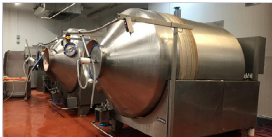
LUTETIA T5 VACUUM TUMBLER.