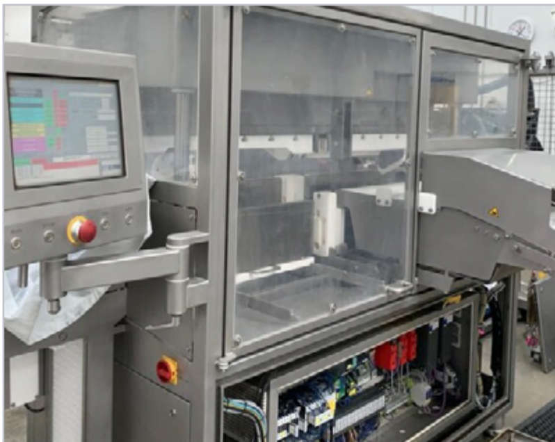
GMS 1200 MULTICUT FORMING & CUTTING MACHINE.