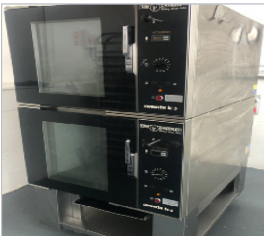
2 X TOM CHANDLEY OVENS.