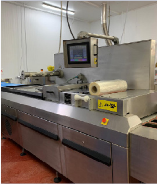
ROSS TRAY SEALER WITH D2 TOOLING.