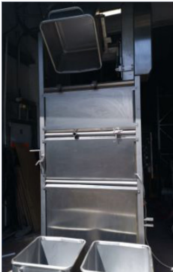
SYSPAL TOTE BIN HOIST (BINS NOT INCLUDED)