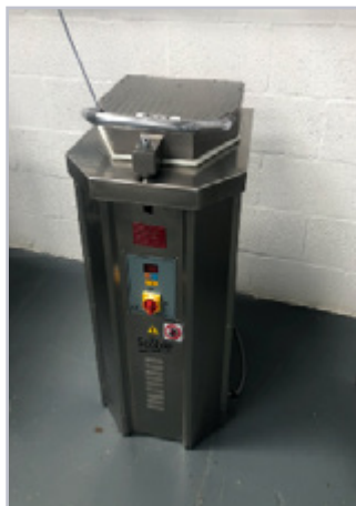
NOVAPAN PASTRY DIVIDER.