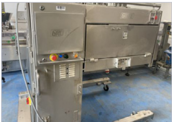
GROTE 25/30-E SLICER.