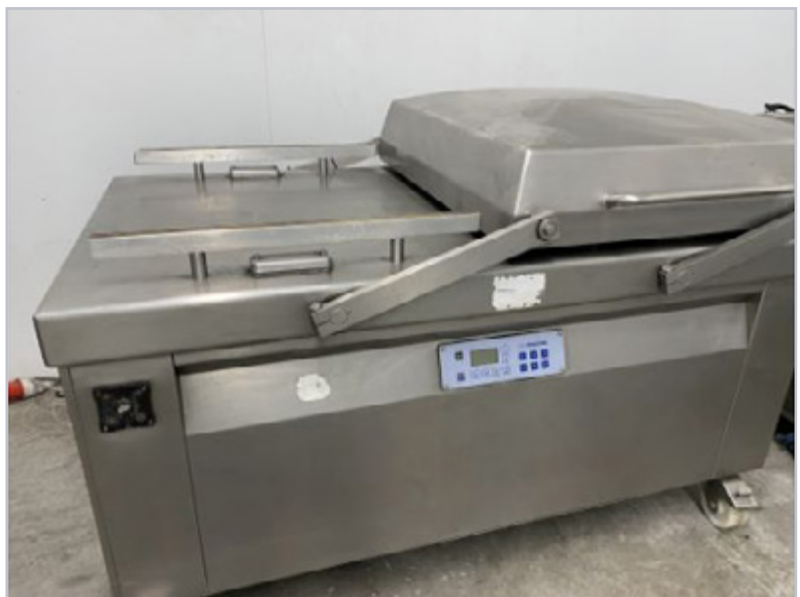
MULTIVAC C500 DOUBLE CHAMBER VACUUM PACKER.