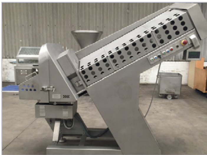
THURNE JUNIOR SLICER