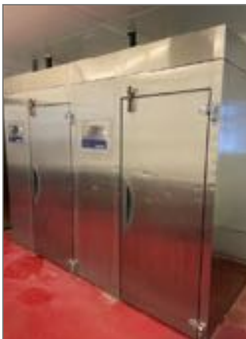
WILLIAMS BLAST CHILLER.