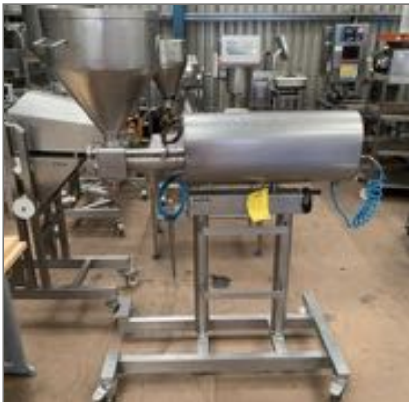
OPTIFILL 750 SINGLE HEAD DEPOSITOR.