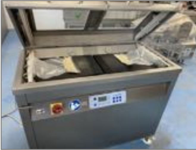
MULTIVAC C370 VAC PACKER.