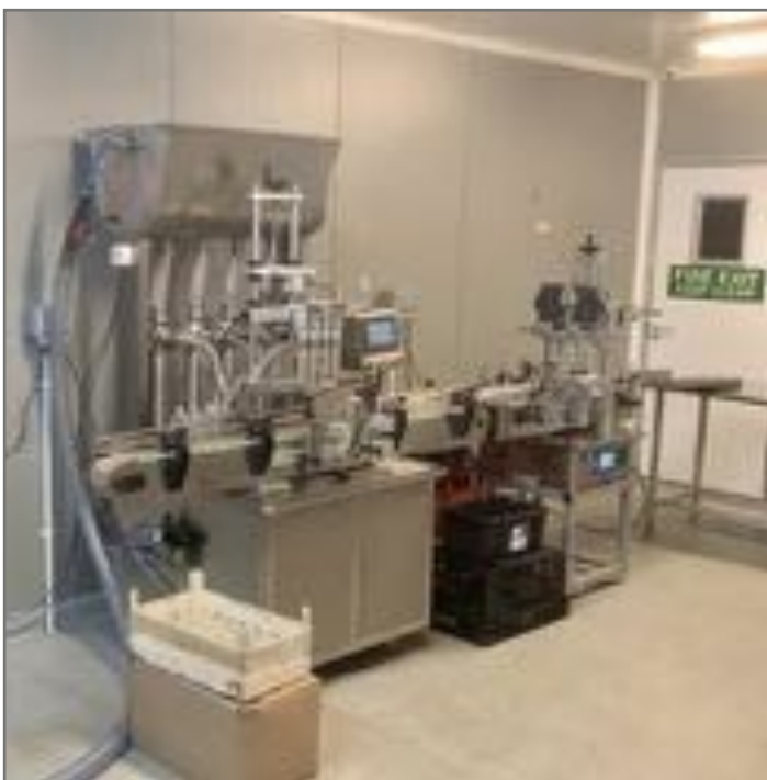
COMPLETE BOTTLING LINE.