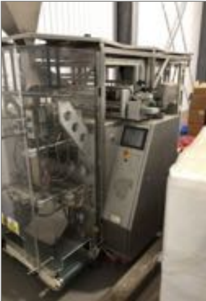
LINE EQUIPMENT BAGGING MACHINE.