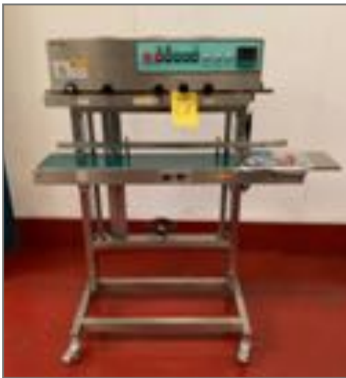
VERTICAL BAG SEALER.