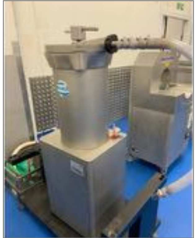
RAMON SC400 SAUSAGE FILLER.