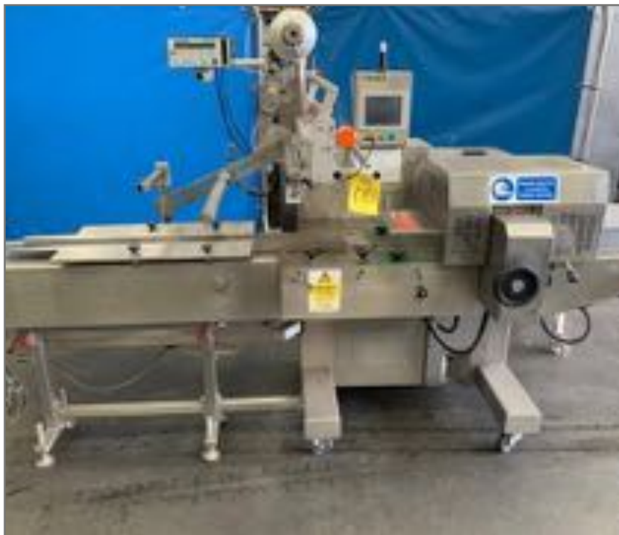
REDPACK P200ESS FLOWWRAPPER.