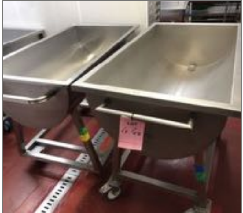
HALF MOON SHAPED BATHS.