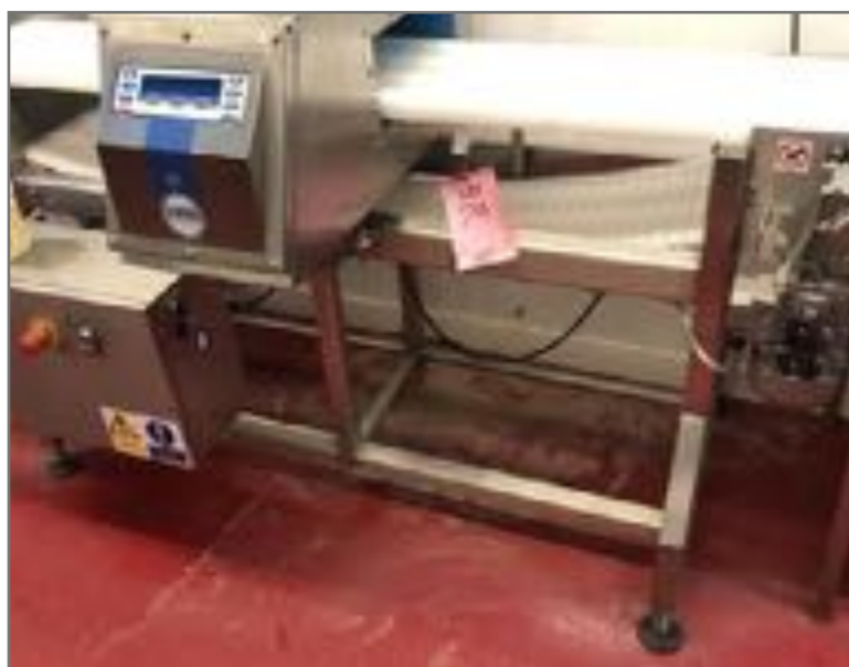
LOMA IQ3 METAL DETECTOR.