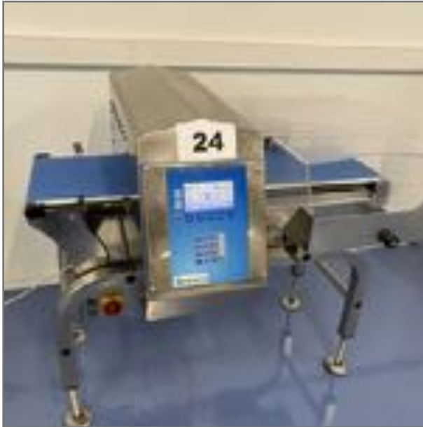
PRISMA METAL DETECTOR.