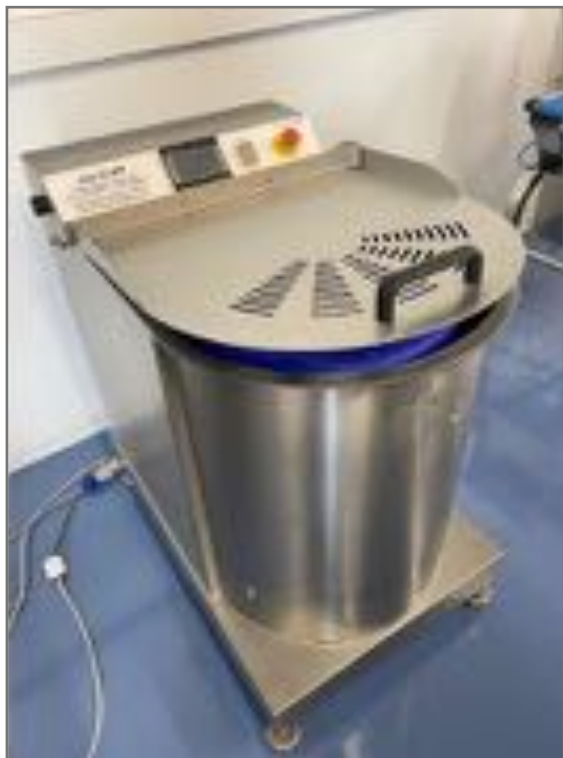
JAYCRAFT SALAD SPINNER.