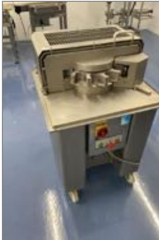
AFT TOMATO/EGG SLICER.