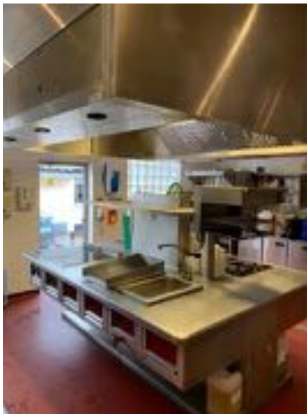
CHARVET PROFESSIONAL COOK SUITE.