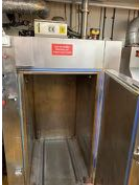
GMC RAPIDAIRE COOKER.