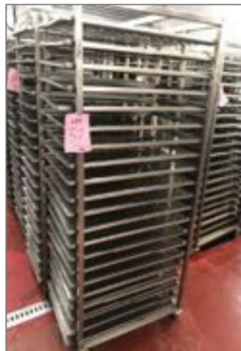
MOBILE TRAY RACKS.