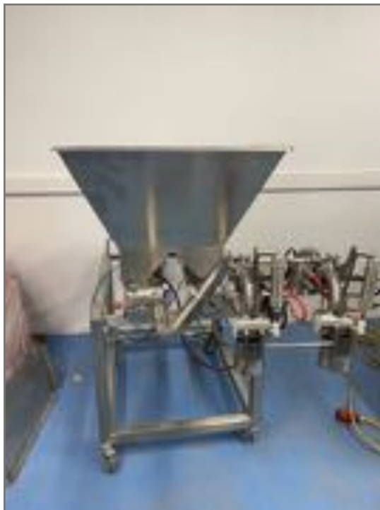
DUAL HEAD UNIFILLER.