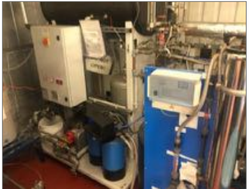
CERTUSS JUNIOR STEAM GENERATOR.