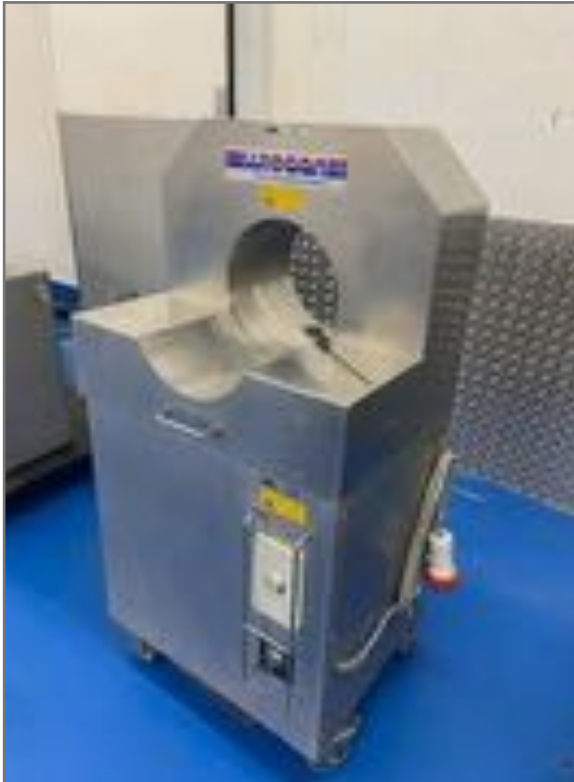
WIEGAND R30E STRINGING MACHINE