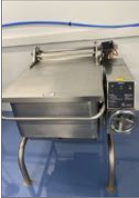
GROEN ECLIPSE BRATT PAN.