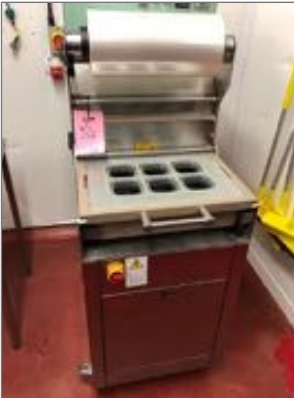
POLYMOON TRAY SEALER.