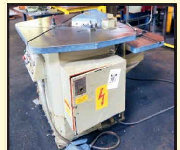
AMADA CORNER NOTCHING MACHINE