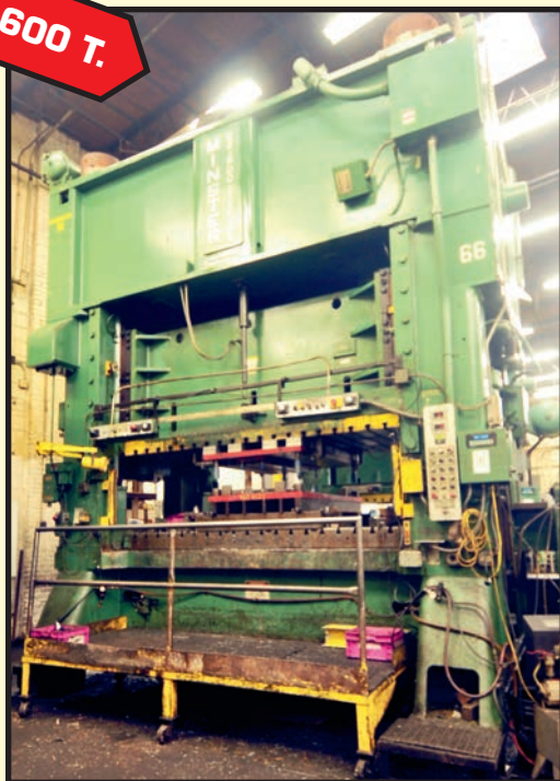
MINSTER E2-600-120-60 "HEVI-STAMPER" STRAIGHT SIDE ECCENTRIC GEARED PRESS