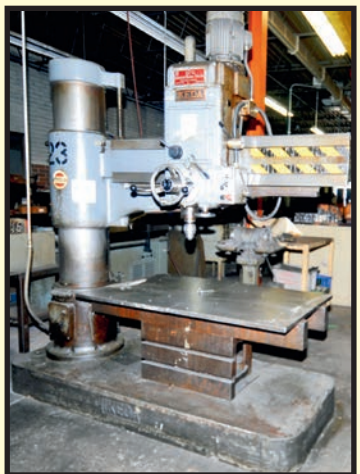
IKEDA 5' X 13" RADIAL ARM DRILL