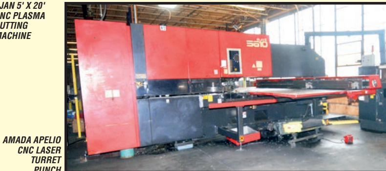
AMADA APELIO CNC LASER TURRET PUNCH