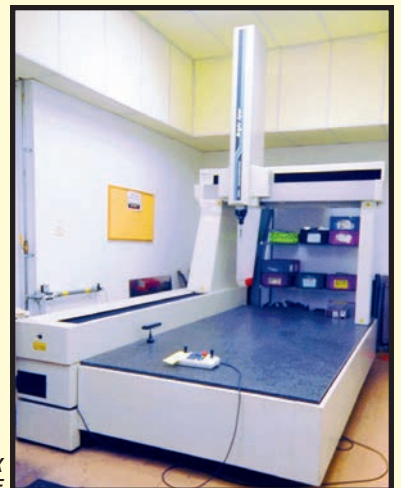
MITUTOYO BRIGHT APEX COORDINATE MEASURING MACHINE

WILSON MDL. 4TT ROCKWELL TESTER; ACCUPRO ROCKWELL HARDNESS TESTER; MISAWA SEIKI ROCKWELL HARDNESS TESTER; DETROIT MDL. NST TENSILE TESTER, PIN GAUGES; HARDENED AND GROUND PARALLELS; GAUGE BLOCKS; CALIPERS; MITUTOYO HEIGHTMASTER; CADILLAC HEIGHTMASTER; GRANITE SURFACE PLATES; END MEASURING RODS; MICROFLAT 48" X 48" GRANITE SURFACE PLATE.