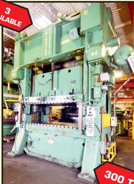
MINSTER E2-300-96-48 "HEVI-STAMPER" STRAIGHT SIDE ECCENTRIC GEARED PRESS