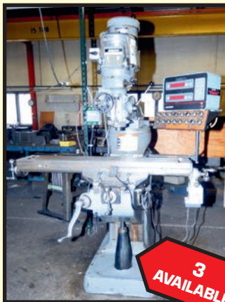
BRIDGEPORT SERIES 1 VERTICAL TURRET MILLING MACHINE