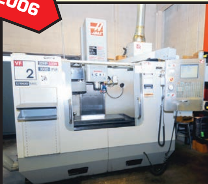
HAAS VF-2 VERTICAL MACHINING CENTER