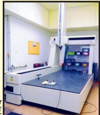
MITUTOYO BRIGHT APEX COORDINATE MEASURING MACHINE