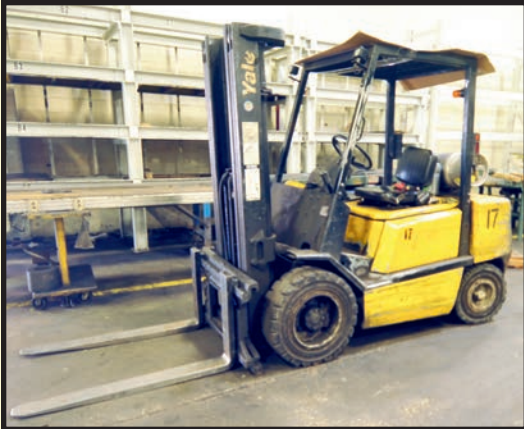
YALE 5,000-LB. LP FORKLIFT