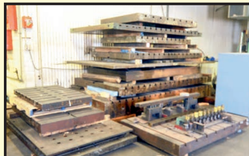
VIEW OF T-SLOTTED BOLSTERS