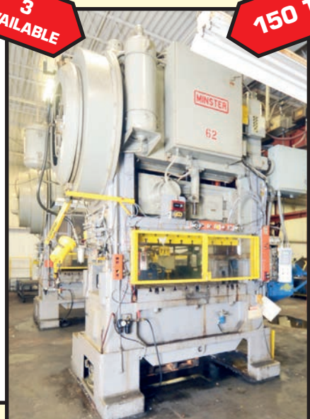
MINSTER P2-150 "PIECEMAKER" HIGH SPEED DOUBLE CRANK STRAIGHT SIDE PRESS