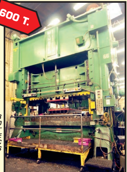
MINSTER E2-600-120-60 "HEVI-STAMPER" STRAIGHT SIDE ECCENTRIC GEARED PRESS

Live Onsite w/Webcast - At the Premises of MIDLAND STAMPING & MACHINING 9500 AINSLIE STREET SCHILLER PARK, IL 60176 (See Directions on Page 11)