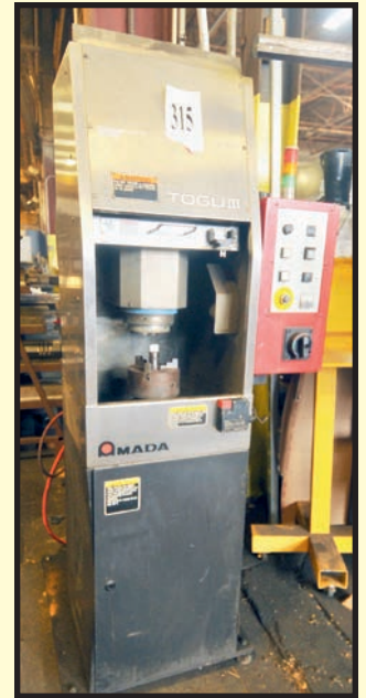
AMADA TOGU III PUNCH AND DIE GRINDER