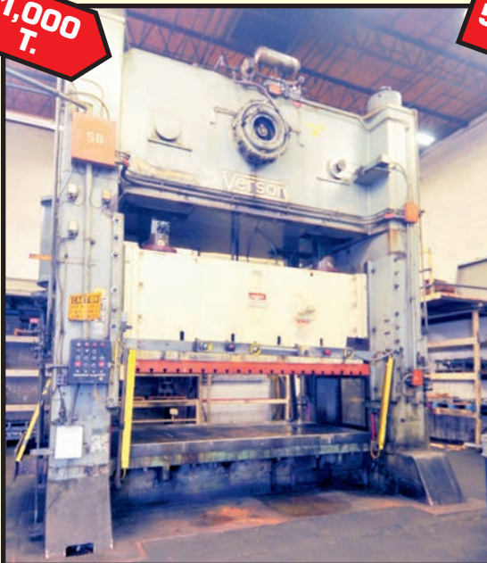
VERSION S4-1000-132-72 4-POINT ECCENTRIC GEARED STRAIGHT SIDE PRESS