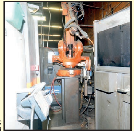
ABB FLEXARC MDL. K , new 2003, Miller Auto Invision 2 pwr. supply, ABB Mdl. IRB2400-M2000 6-axis welding robot, Binzel torch cleaner, Mdl. IRBP250K 2-pos. rotary picture frame positioner, skid mtd., S/N 239-251-0001.

FANUC ROBOTIC WELDING SYSTEM ABB ROBOTIC WELDING SYSTEM