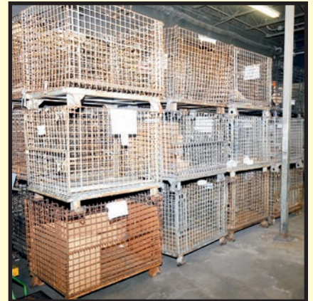
HUNDREDS OF COLLAPSIBLE WIRE BASKETS

ORION H66-9 STRETCH WRAP MACHINE ; (2) 20,000-LB. DIGITAL PLATFORM SCALES , w/84" x 60" platform; YALE 5,000-LB. CAP. ELECTRIC PALLET JACK ; HYDRAULIC PALLET JACKS ; BANDING CARTS ; PNEUMATIC BANDING TOOLS ; (2) POLYCHEM PLASTIC AND STEEL PNEUMATIC BANDING TOOLS ; ASSORTED ELECTRIC CHAIN AND WIRE ROPE HOISTS up to 4 T. cap; ASSORTED HEAVY LIFTING CHAINS ; (6) SINGLE SIDE CANTILEVER RACKS , 48" arms, adj. ht., w/large qty. of perforated material, carbon steel, stainless steel, some aluminum; (100's) OF COLLAPSIBLE WIRE BASKETS.