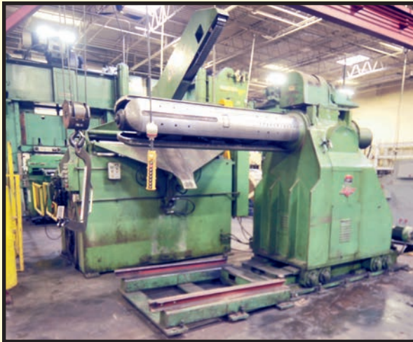
LITTELL 72" SERVO COIL FEED LINE