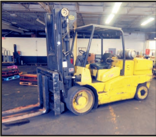
HOIST 20,000-LB. LPG FORKLIFT