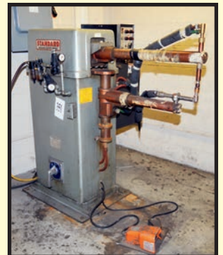
STANDARD ROCKER ARM SPOT WELDER