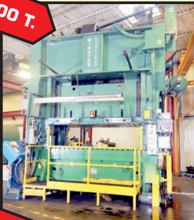
MINSTER E2-400-108-54 "HEVI- STAMPER" STRAIGHT SIDE ECCENTRIC GEARED PRESS