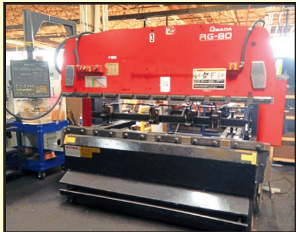
AMADA 80 T. CAP. RG80 CNC PRESSBRAKE