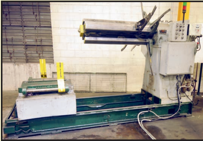
LITTELL 10,000-LB. POWERED COIL REEL