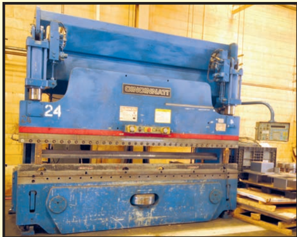
CINCINNATI 135 T. X 12' FORM MASTER II CNC PRESS BRAKE