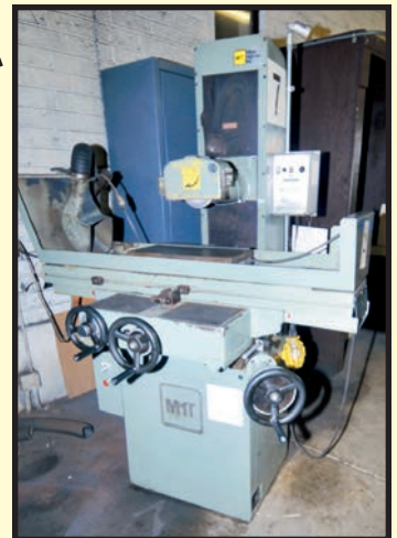
MITSUI HAND FEED SURFACE GRINDER