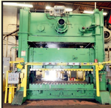
VERSION S4-600-132-68T 4-POINT ECCENTRIC GEARED STRAIGHT SIDE PRESS