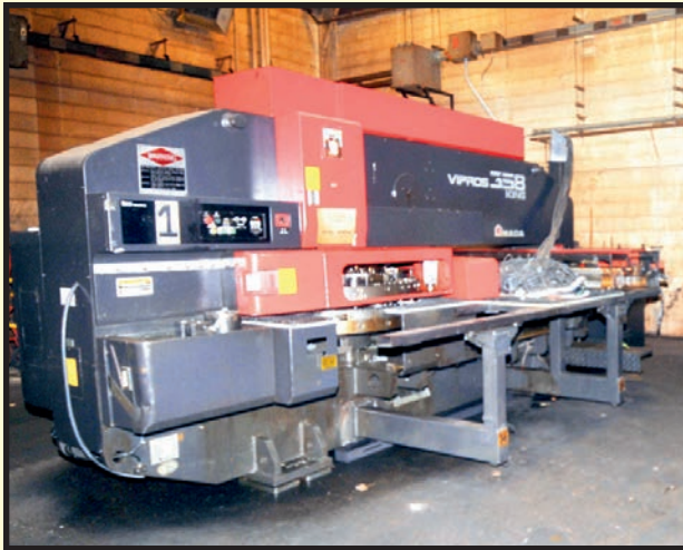
AMADA VIPROS 350 KING CNC TURRET PUNCH