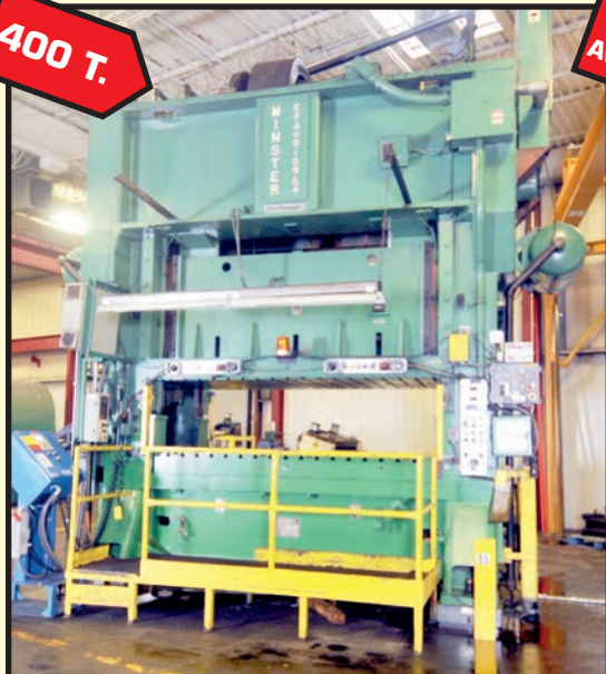
MINSTER E2-400-108-54 "HEVI-STAMPER" STRAIGHT SIDE ECCENTRIC GEARED PRESS