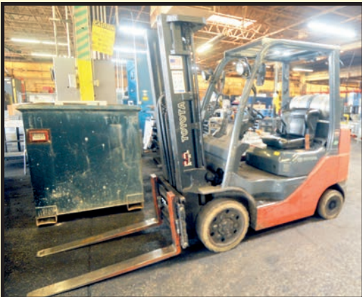
TOYOTA 5,000-LB. LPG FORKLIFT