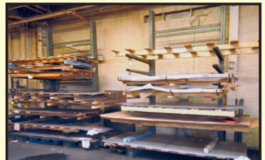
CANTILEVER RACKS AND SHEET STOCK