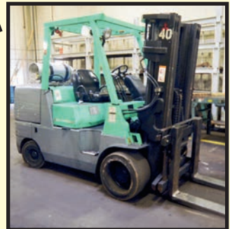
MITSUBISHI 11,000-LB. LPG FORKLIFT