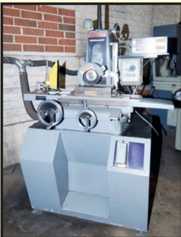
HARIG HAND FEED SURFACE GRINDER

ST INDUSTRIES 14" MDL. 20-3500-00 , Series 3500, D.R.O. box, 10X and 20X lenses, assorted accessories, on cabinet base.