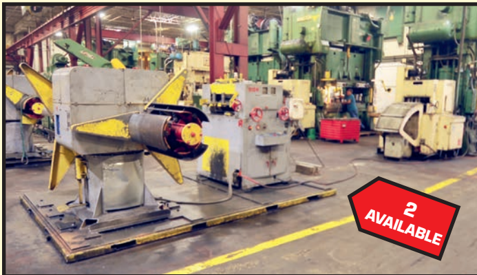
AIDA 24" SERVO COIL FEED LINE