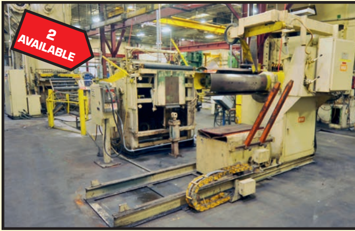
ROWE 40" SERVO COIL FEED LINE