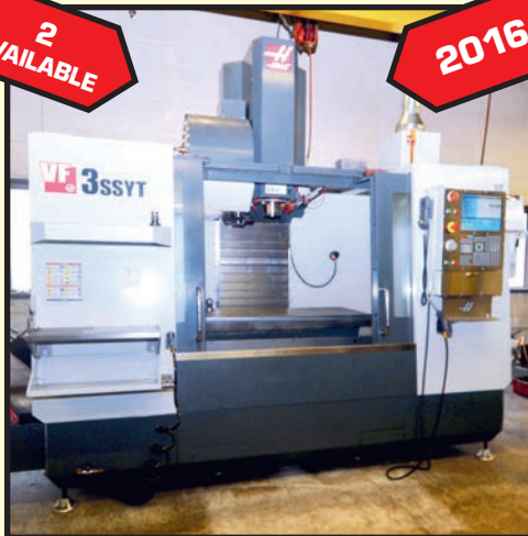
HAAS VF-3SSYT VERTICAL MACHINING CENTER