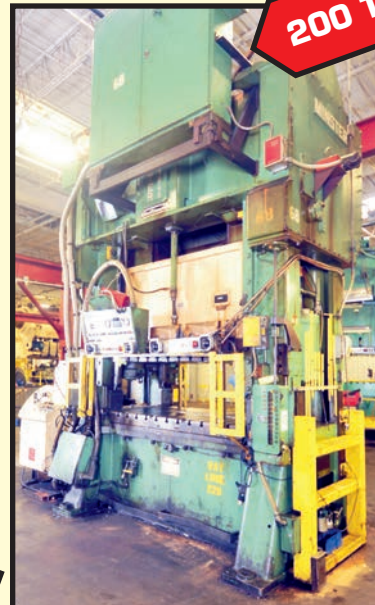
MINSTER E2-200-72-42 "HEVI-STAMPER" STRAIGHT SIDE ECCENTRIC GEARED PRESS