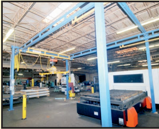
GORBEL 1 T. FREE STANDING CRANE SYSTEM