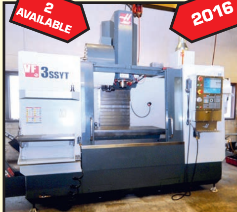
HAAS VF-3SSYT VERTICAL MACHINING CENTER