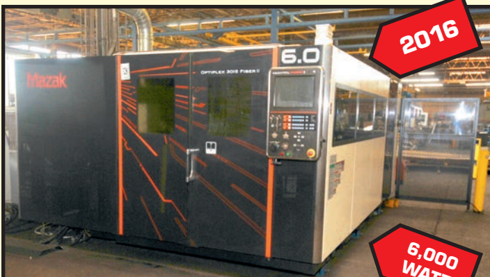
MAZAK OPTIFLEX 3015 CNC FIBER LASER CUTTING MACHINE