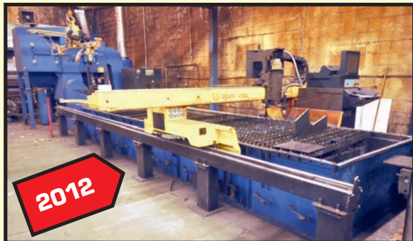
AJAN 5' X 20' CNC PLASMA CUTTING MACHINE