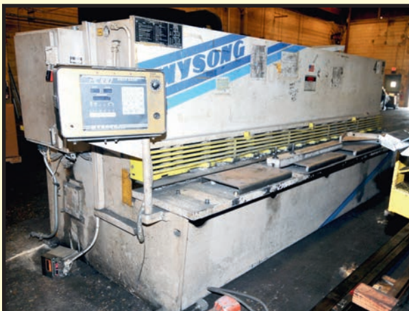
WYSONG 12' X 1/4" HYDRAULIC SHEAR