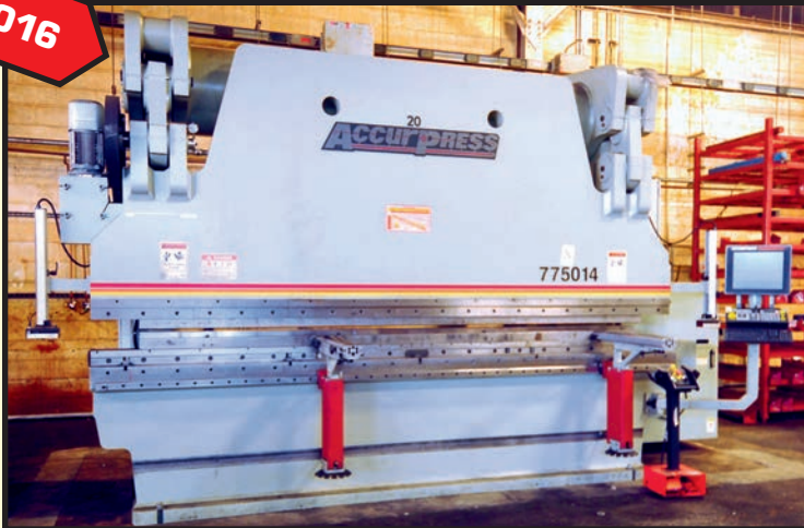
ACCURPRESS 750 T. X 14' CNC PRESS BRAKE