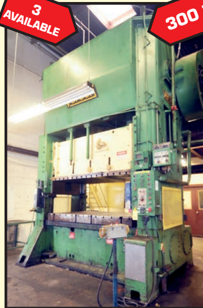
VERSION S2-300-96-54T STRAIGHT SIDE DOUBLE CRANK PRESS