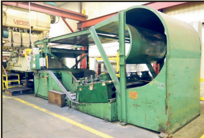
72" FEEDLEASE/DALLAS AIR FEED COIL LINE