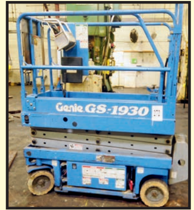
GENIE SELF-PROPELLED SCISSOR LIFT