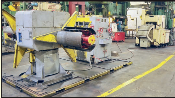
AIDA 24" SERVO COIL FEED LINE