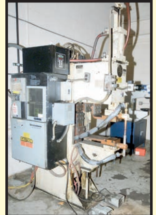
PROJECTION SPOT WELDER

(2) SHEFFIELD MDL. CORDAX 3000 COORDINATE MEASURING MACHINES , 26" x 37" steel tbls.