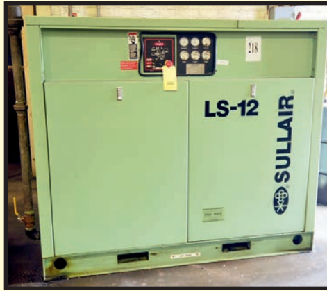
SULLAIR LS-12 ROTARY SCREW AIR COMPRESSOR