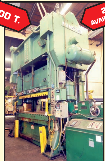
MINSTER E2-400-108-54 "HEVI-STAMPER" STRAIGHT SIDE ECCENTRIC GEARED PRESS

Read Partial Terms & Conditions on Page 11