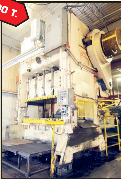
VERSION S2-500-96-60T STRAIGHT SIDE DOUBLE CRANK PRESS