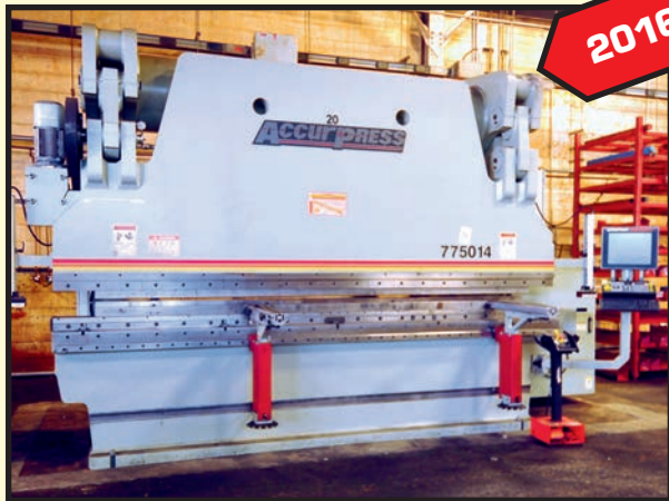
ACCURPRESS 750 T. X 14' CNC PRESS BRAKE