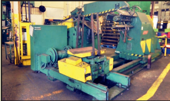
MINSTER/LITTELL 32" SERVO FEEDLINE