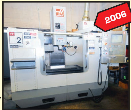
HAAS VF-2 VERTICAL MACHINING CENTER