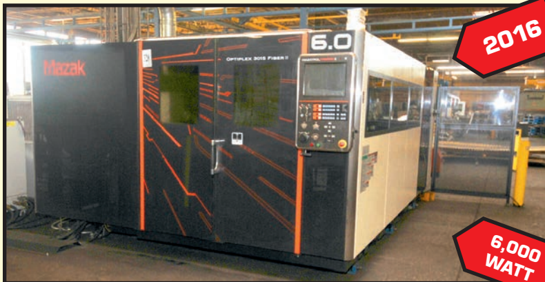
MAZAK OPTIFLEX 3015 CNC FIBER LASER CUTTING MACHINE

AMADA APELIO MDL. AP2357F10 , (1998), Fanuc 05PLA CNC control, Fanuc 2,000 watt laser, 50 T. cap. punch, (44) turret stations, Koolant Koolers chiller system, 2 kW laser, Torit cartridge style dust collector, 25,112 H.O.M., S/N 23570365.