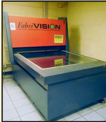
AMADA FABRIVISION SCANNER