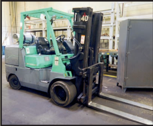
MITSUBISHI 11,000-LB. LPG FORKLIFT