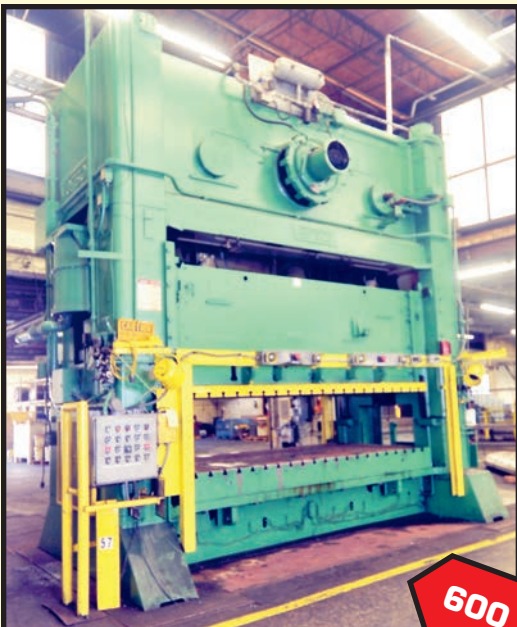
VERSION S4-600-132-68T 4-POINT ECCENTRIC GEARED STRAIGHT SIDE PRESS