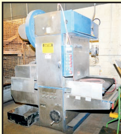
RAMCO WET BELT GRINDING MACHINE