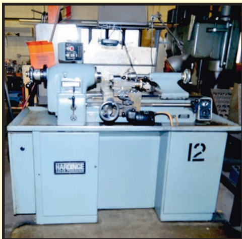
HARDINGE HLV-H PRECISION LATHE

MOORE NO. 3 JIG BORER , assorted accessories, S/N B641; JOHANSSON 3' SLIDING HEAD DRILL , adj. ht. tbl., swivel base; CLAUSING MDL. 2286 PRODUCTION DRILL , variable spd., oil groove tbl., S/N 525019; HAMMOND MDL. 1000-VW-B ABRASIVE BELT GRINDER , 10" belt, tilting tbl., cabinet base, 7-1/2 HP, S/N 1793; BALDOR DOUBLE END PEDESTAL GRINDER , 3 HP, cast iron base; TORIT MDL. VS1500 CABINET STYLE DUST COLLECTOR , 5 HP, S/N IG321456; HUPPERT 8 X 12 X 18" CAP. FURNACE , Type ST, electric fired, S/N 532; HUPPERT 8 X 8 X 12" CAP. FURNACE , Type ST, electric fired, S/N 215; HOPKINS MACHINE SCREW PRESS , S/N 27882; DIACRO 12" HAND SHEAR ; DEE-BLAST BLAST CABINET , cabinet style; JET 3 T. CAP. MDL. AP3 ARBOR PRESS ; FANUC TAPECUT-W1 WIRE EDM MACHINE ; LINCOLN IDEALARC MDL. TIG300/300 TIG WELDER , foot pedal, TIG torch, cooler, S/N AC632600.