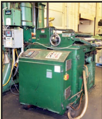
CLOSEUP OF MINSTER SERVO FEEDER