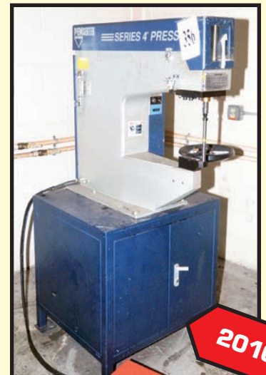
PEMSERTER SERIES 4 HARDWARE PRESS