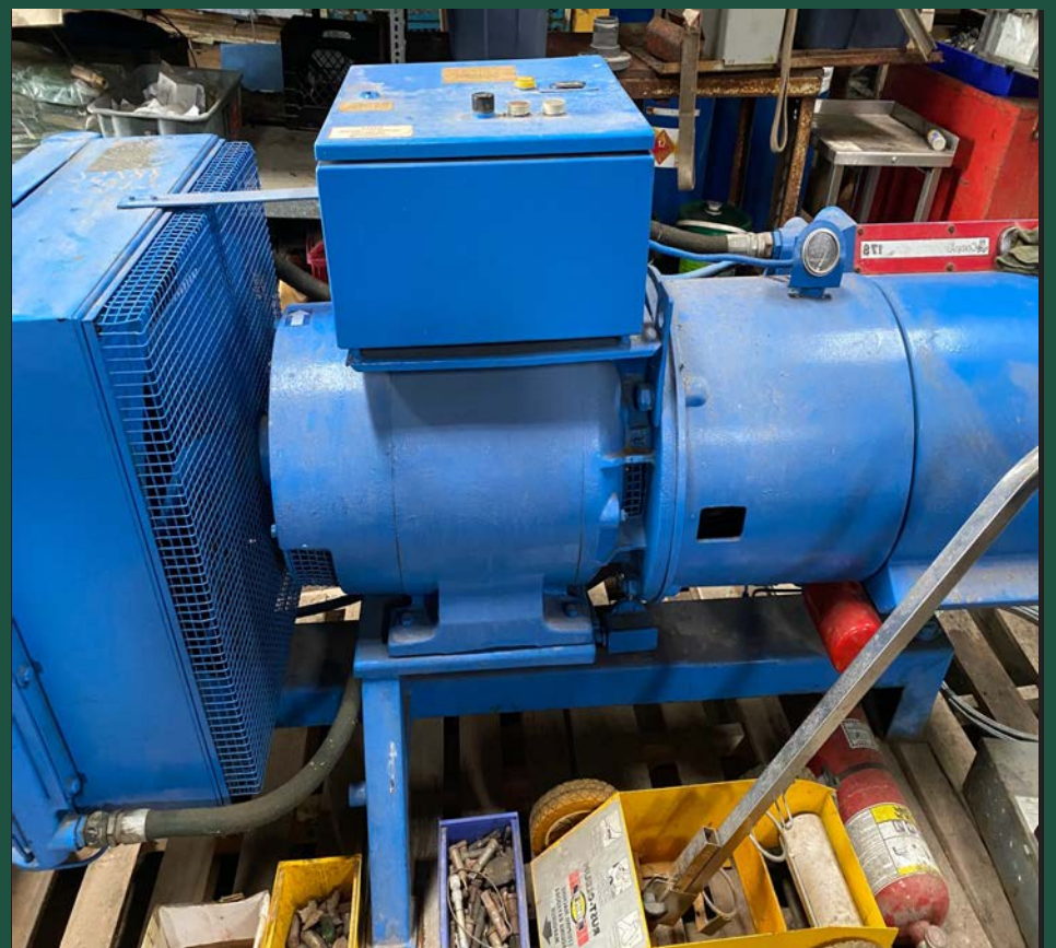
SCREW AIR COMPRESSOR