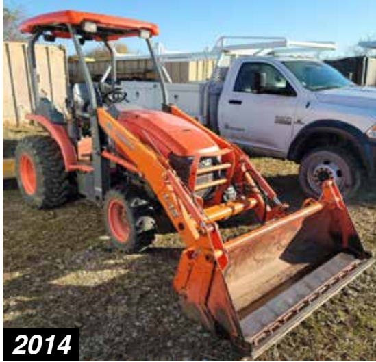
2014 KUBOTA L45 TRACTOR