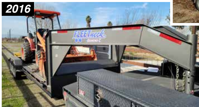
2016 FLEETNECK TRAILER