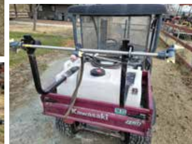
KAWASAKI 4WD MAINTENANCE CART