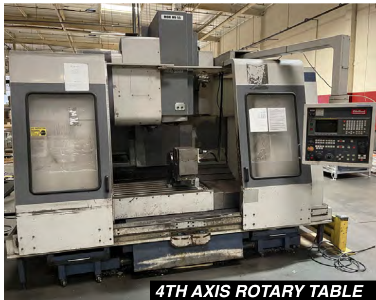
4TH AXIS ROTARY TABLE

(2) MORI SEIKI MH-63 HORIZONTAL MACHINING CENTERS, MORI SEIKI MV 55/50 & (2) MATSUURA MC-1000 V7 VERTICAL MACHINING CENTERS, HDYROBLAST HIGH PRESSURE PARTS WASHER, STORAGE CONTAINERS, PALLET RACKING, FACILITY SUPPORT EQUIPMENT, TOOLING, TOY HAULER, TOY STORE, 1980 CHEVROLET CORVETTE CUSTOM ORDERED BY VIC EDELBROCK, JR. AND RELATED