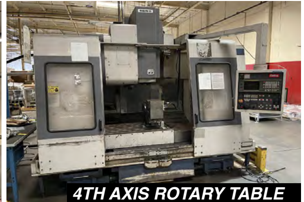
4TH AXIS ROTARY TABLE