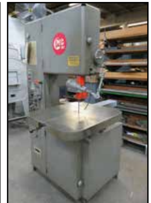
GROB 4V-18 18" VERTICAL BANDSAW