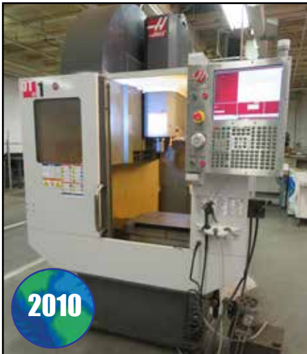
HAAS DT-1 CNC VERTICAL DRILLING & TAPPING MACHINE