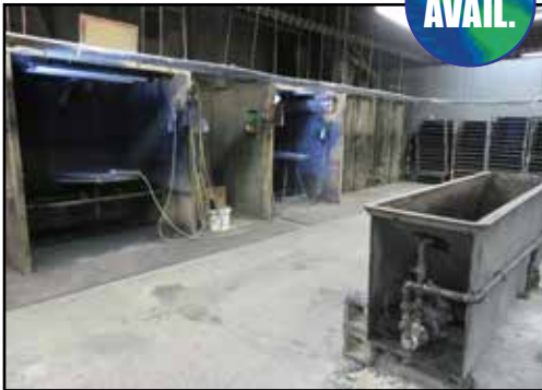
(2) 5' W X 12' D X 6' H WET PAINT SPRAY BOOTHS