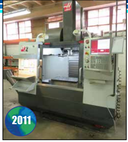
HAAS VF-2 CNC VERTICAL MACHINING CENTER