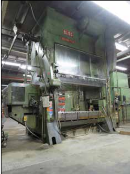
BLISS 200 TON STRAIGHT SIDE PRESS