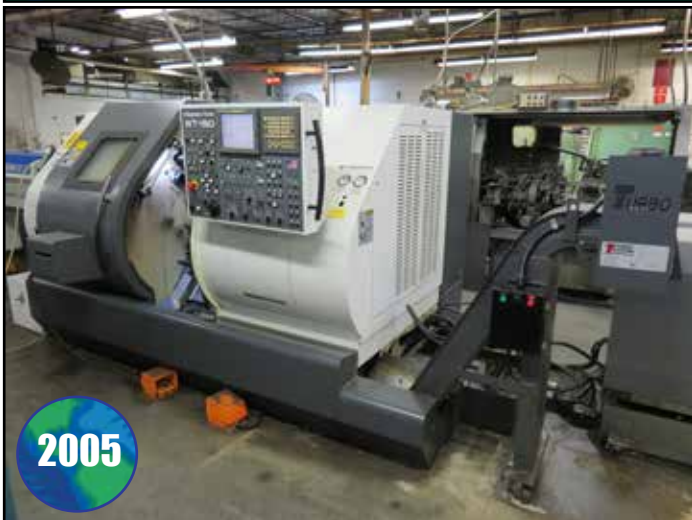
NAKAMURA-TOME WT-150 CNC TURNING CENTER

Download a lot book at www.asset-sales.com