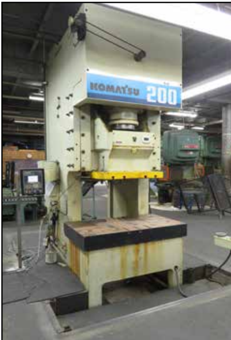
KOMATSU OBS200L-VS-3 200 TON HYDRAULIC GAP FRAME PRESS