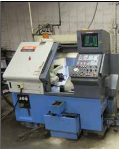
MAZAK QUICK TURN NEXUS 10 CNC TURNING CENTER