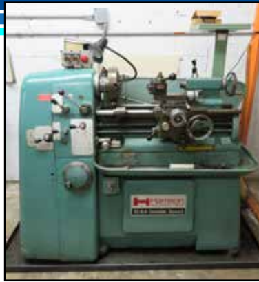
HARRISON 10-AA 11" X 19" TOOLROOM ENGINE LATHE