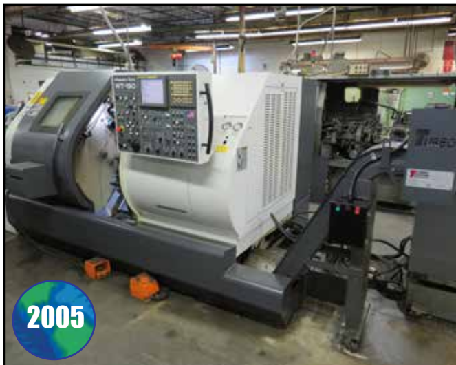
NAKAMURA-TOME WT-150 CNC TURNING CENTER