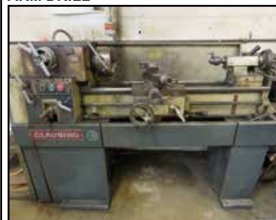
CLAUSING 13" X 36" ENGINE LATHE