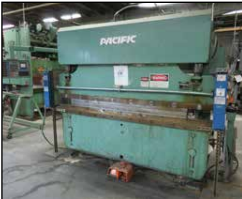
PACIFIC 55 TON HYDRAULIC PRESS BRAKE