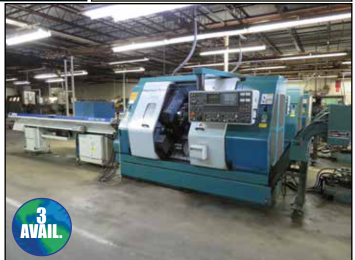
(3) NAKAMURA-TOME TW-10 CNC TURNING CENTERS