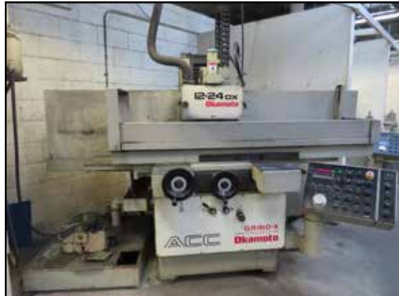
OKAMOTO ACC-1224DX 12" X 24" HYDRAULIC SURFACE GRINDER