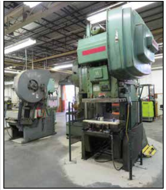
BLISS C-75 & MINSTER 60 OBI PUNCH PRESSES