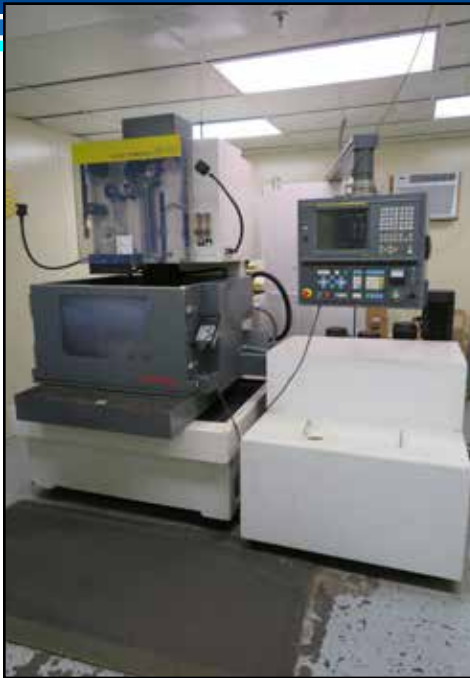
FANUC ROBOCUT ALPHA-1C CNC WIRE EDM