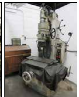
MOORE JIG GRINDER