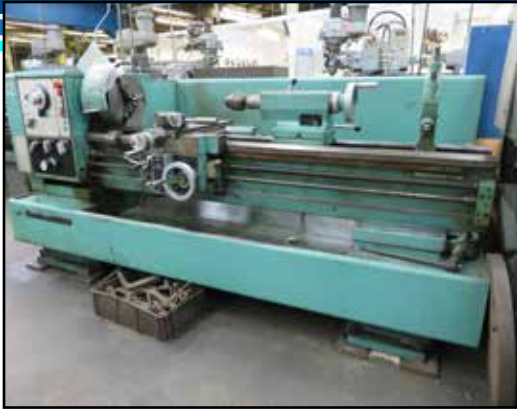
HARRISON M400 16" X 60" TOOLROOM ENGINE LATHE