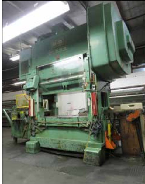
BLISS 150 TON STRAIGHT SIDE PRESS