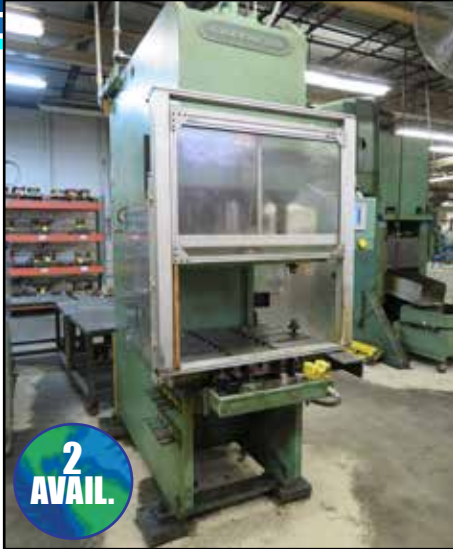
(2) GREENERD HCA-100-42R10 100 TON HYDRAULIC GAP FRAME PRESSES