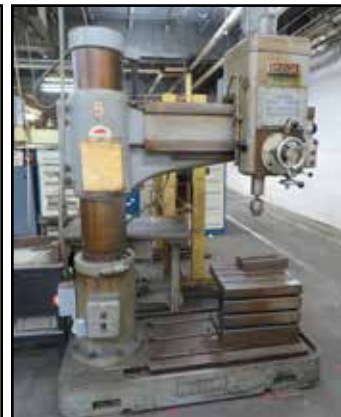
IKEDA 3' X 11" COLUMN RADIAL ARM DRILL

GROB 4V-18 18" Vertical Bandsaw with Power Feed Table, Blade Welder & Grinder, sn:3116