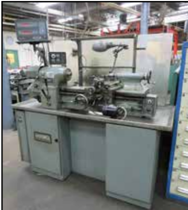
HARDINGE HLV-H PRECISION LATHE