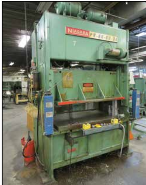
NIAGARA 60 TON STRAIGHT SIDE PRESS

NIAGARA PN-60-60-36 60-Ton Straight Side Press with 36" x 60" Bed, 5" Stroke, 5" Stroke Adjustment, 40 Strokes Per Minute, Approx. 8" x 16" Window, 13" Shut Height, TRIAD Light Curtain Push Button Operator Controls, sn:52052