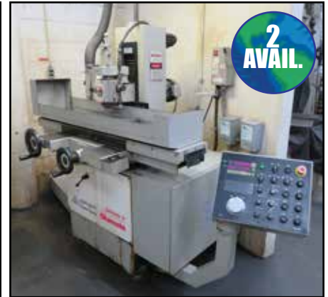
(2) OKAMOTO ACC-618DX3 6" X 18" HYDRAULIC SURFACE GRINDERS