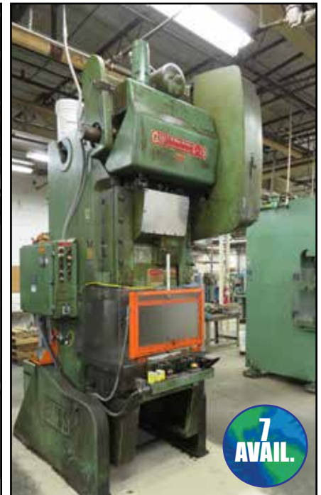
(7) BLISS C75 75 TON OBI PUNCH PRESSES