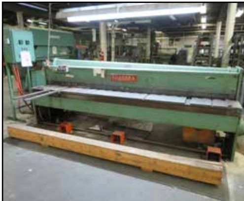
NIAGARA 10' POWER SQUARING SHEAR