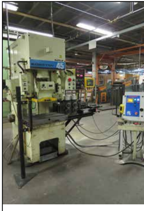
KOMATSU OBS45-3 49.6 TON HYDRAULIC GAP FRAME PRESS