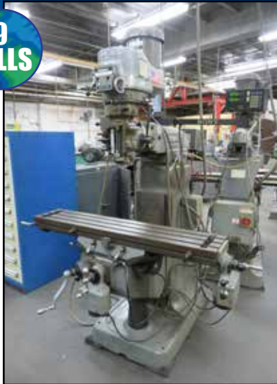
BRIDGEPORT EZ TRAK DX & SERIES II VERTICAL KNEE MILLS