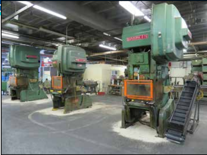
BLISS C-75 & C-60 OBI PUNCH PRESSES