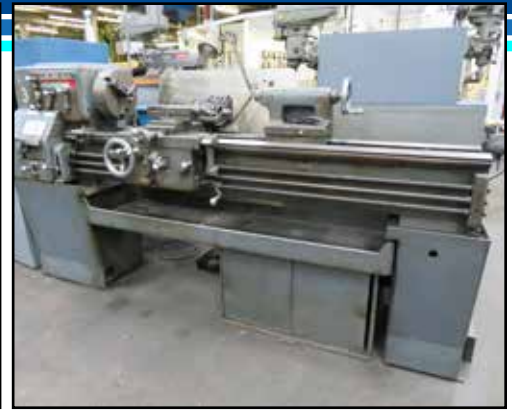
LEBLOND REGAL 15" X 48" TOOLROOM ENGINE LATHE