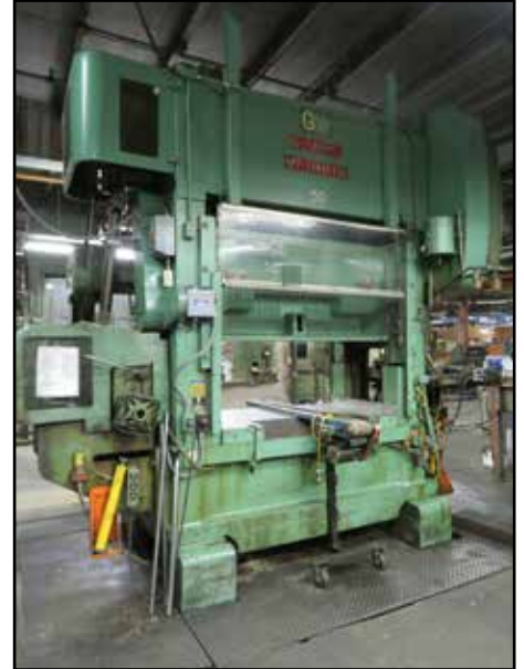
BLISS 150 TON STRAIGHT SIDE PRESS