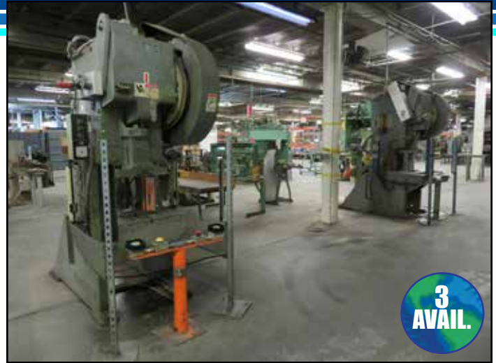
(3) MINSTER 5 45 TON OBI PUNCH PRESSES