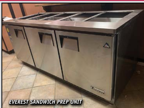
EVEREST SANDWICH PREP UNIT