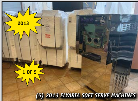
(5) 2013 ELYRIA SOFT SERVE MACHINES

WEDNESDAY, JULY 13 TH AT 11:00 A.M. (ET) 55 STATE STREET SPRINGFIELD, MASSACHUSETTS