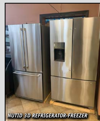
NUTID 3D REFRIGERATOR-FREEZER