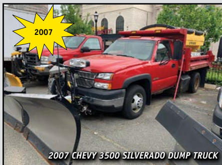
2007 CHEVY 3500 SILVERADO DUMP TRUCK

15% BUYERS PREMIUM APPLIES ON ALL ONSITE PURCHASES 18% BUYERS PREMIUM APPLIES ON ALL ONLINE PURCHASES