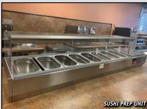
SUSHI PREP UNIT