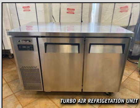
TURBO AIR REFRIGETATION UNIT