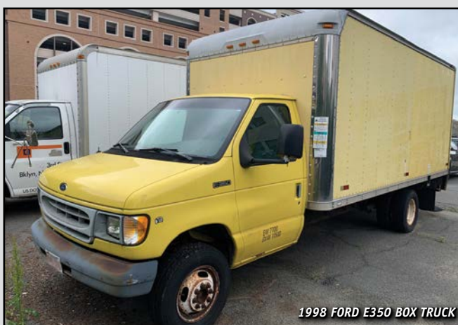
1998 FORD E350 BOX TRUCK