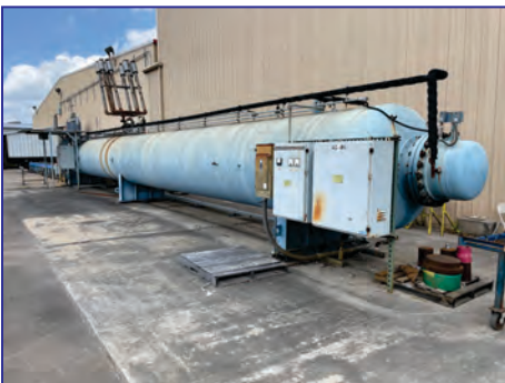
50' Anchor Autoclave, 150 PSI @ 450 F