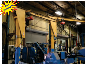
Floor Mount Jib Cranes