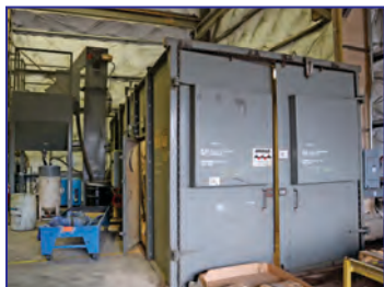
25' x 10' x 10' Breco Master Blast Bunker