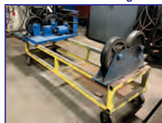
Pipe Turning Rolls