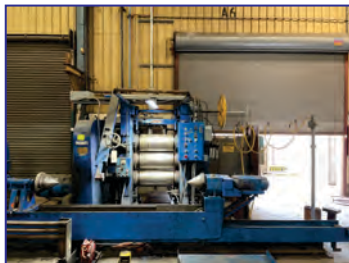
Farrel-Birmingham 4-Roll Rubber Mill