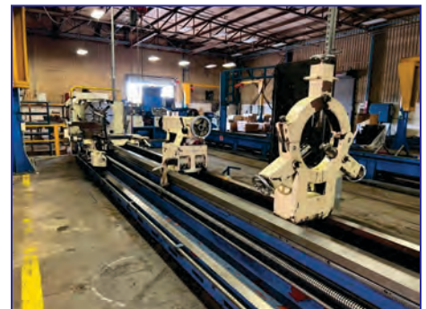
42" x 320" Summit Lathe with 9" Bore