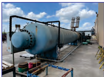
50' Anchor Autoclave, 150 PSI @ 450° F