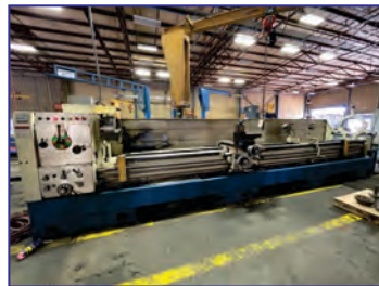
30" x 200" Summit Lathe with 6" Bore