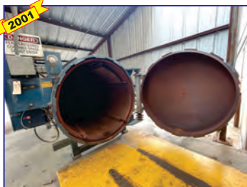
10' Spallinger Autoclave, New 2001