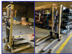
Jet JHS-2200 Hyd. Stacker