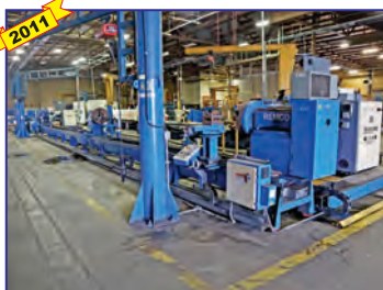
Remco TSB 3100T Thermoset Strip Builder