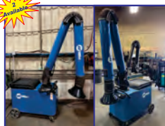
Miller MWX-D Fume Extractors