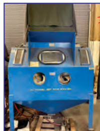
Sand Blast Cabinet