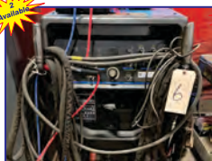
Miller Synchrowave 350