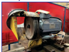
Remco 10" Grinder Attach.