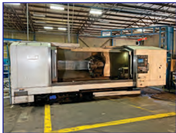
Mori Seiki NL3000MC/300 CNC Lathe