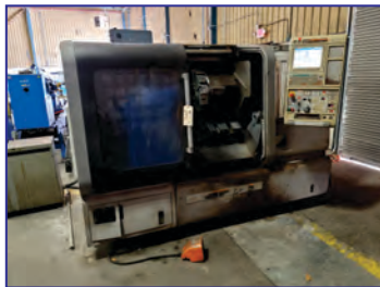
Mori Seiki NLX2500/700 CNC Lathe