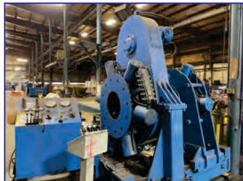
RP Mfg TW-7000 Bucking Machine