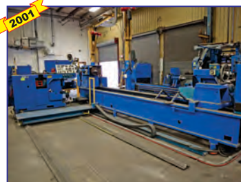
Remco MSB 250T Thermoset Strip Builder