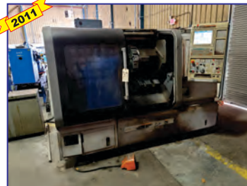
Mori Seiki NLX2500/700 CNC Lathe