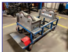
Profax Mdl 1500 Turning Rolls