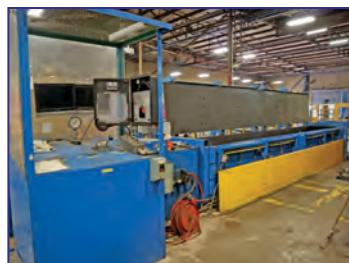
25' Hydro Test Chamber with Control Station