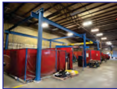
3 Ton Overhead Bridge Crane