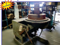
Bowers Welding Positioner