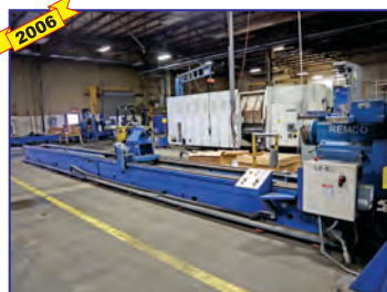
Remco TSB 250T Thermoset Strip Builder