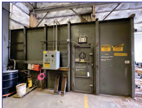
Breco Master Blast Bunker w/ Hankison HPR Plus Air Dryer