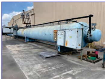
50' Anchor Autoclave, 150 PSI @ 450 F