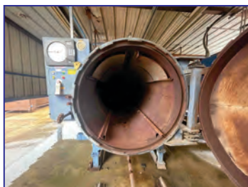
30' Cedco Autoclave, 100 PSI @ 450° F