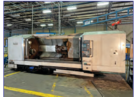
Mori Seiki NL3000MC/300 CNC Lathe