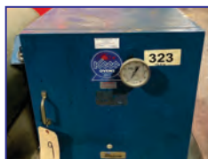
Keen Dry Rod Oven