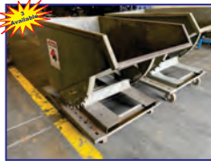
6500 Lb. Hippo Hoppers