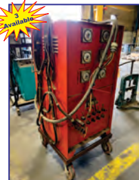
Cooper Heat/Pre-Heat/ Post-Heat System