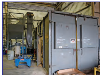
Breco Walk-in Blast Chamber