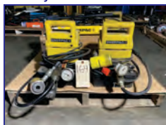
Enerpac Flow Pumps