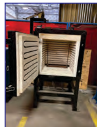
Baker Mdl 80 Lab Furnace