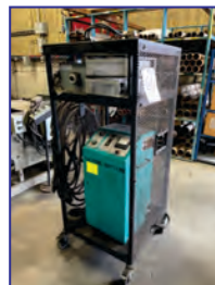
Proscio Elastomer Cutting System