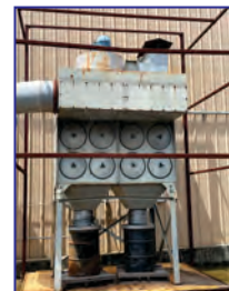
Dust Collector for Breco