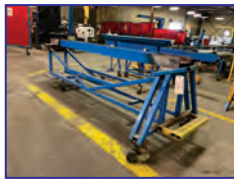
Heavy Duty Fixture Roller