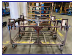
Material Moving Carts