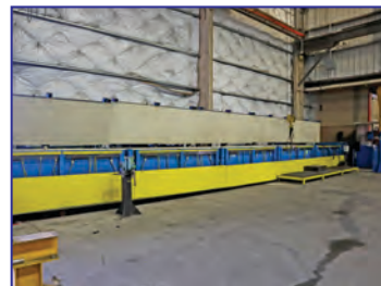
50' Hydro Test Chamber