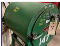
Phoenix Dry Rod Oven