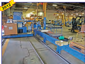
Remco TSB 4100T Thermoset Strip Builder

Featured Machines: Remco TSB 4100T Thermoset Strip Builder with Spin Station, Remco TSB 3100T Thermoset Strip Builder with Spin Station, Remco MSB 250T Thermoset Strip Builder with Spin Station, Remco TSB 250T Thermoset Strip Builder with Spin Station, Remco USB 250T Thermoset Strip Builder with Spin Station, Farrel-Birmingham 4-Roll Rubber Mill, 50' Anchor Autoclave, 50' Hydro Test Chamber, 25' Hydro Test Chamber, Breco Walk-in Blast Chamber, Mori Seiki NL3000MC/300 Long Bed CNC Lathe, Mori Seiki NLX2500/700 CNC Lathe, 42" x 320" Summit Engine Lathe with 9" Bore, 30" x 200" Summit Engine Lathe with 6" Bore, Elastomer Cutting Systems, Welding Power Sources, Welding Positioners, Shop Tools, and More!