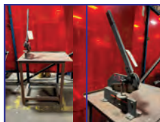
Dayton 8" Plate Shear