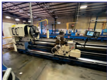
42" x 320" Summit Lathe with 9" Bore