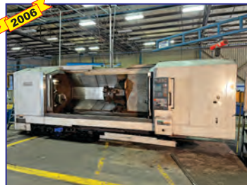
Mori Seiki NL3000MC/300 CNC Lathe