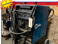
Miller Synchrowave 250