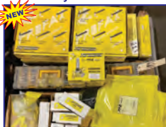
Profax Welding Consumables