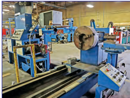
Remco TSB 3100T Thermoset Strip Builder