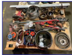
Misc. Shop Tools & Equipment