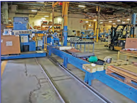
Remco TSB 4100T Thermoset Strip Builder