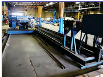
Remco USB 250T Thermoset Strip Builder