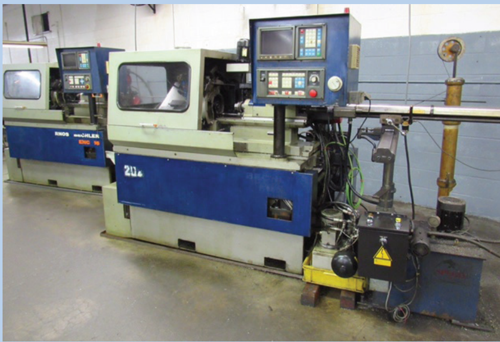
TORNOS-BECHLER ENC16T Swiss-Type CNC Screw Machines with Fanuc OT Control