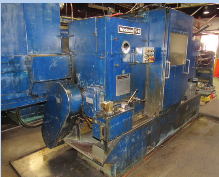
WICKMAN Automatic 6-Spindle Screw Machines (11 Available)