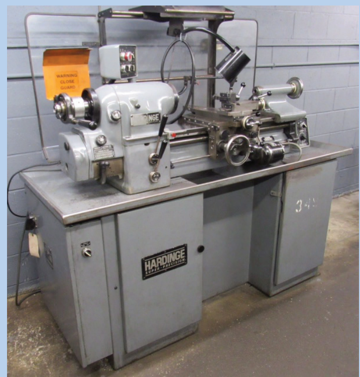
HARDINGE "Super Precision" HLV-H Precision Toolroom Lathe