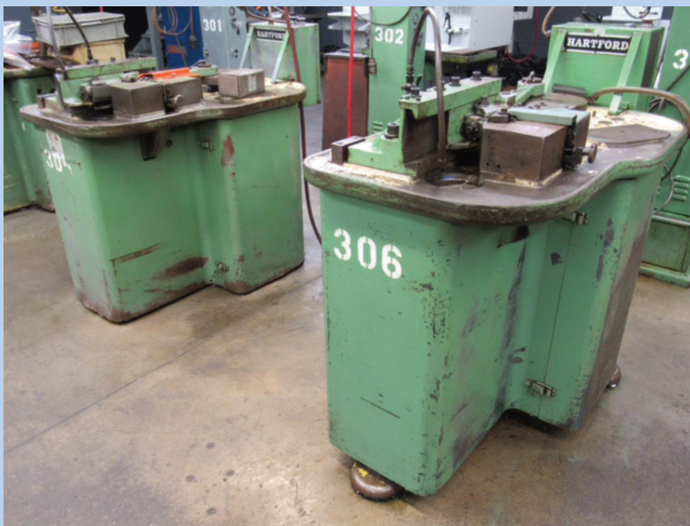
HARTFORD 190MV Thread Rolling Machine (3 Available)