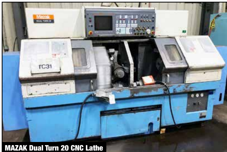
MAZAK Dual Turn 20 CNC Lathe