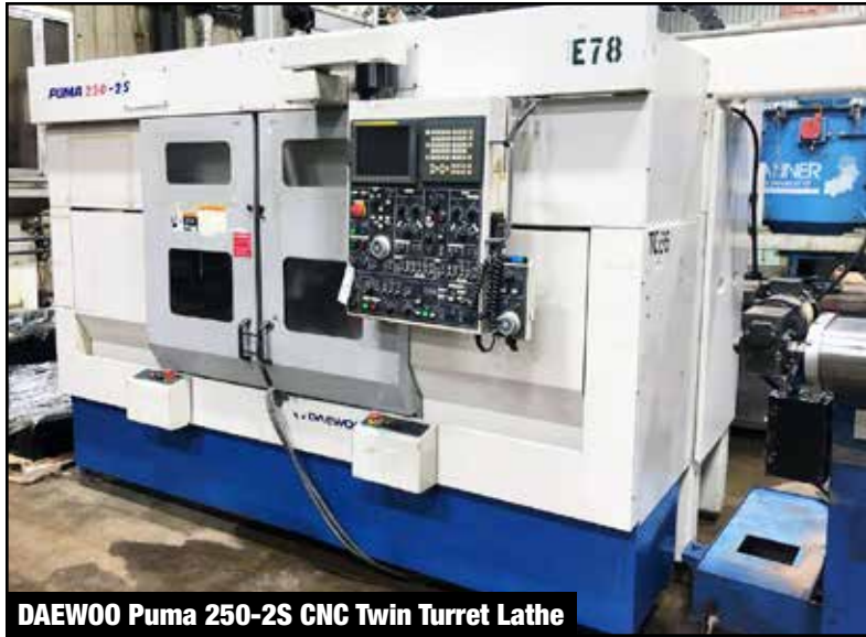
DAEWOO Puma 250-2S CNC Twin Turret Lathe