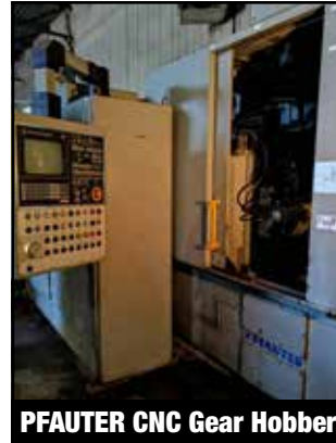
PFAUTER CNC Gear Hobber