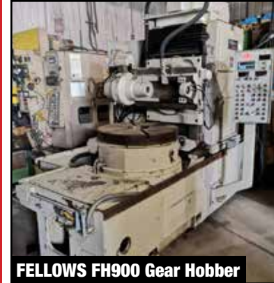
FELLOWS FH900 Gear Hobber