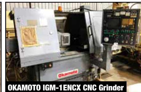
OKAMOTO IGM-1ENCX CNC Grinder