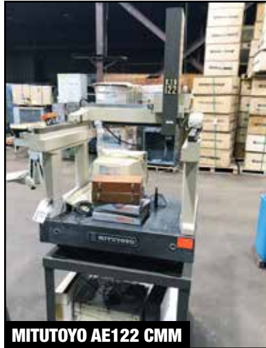
MITUTOYO AE122 CMM