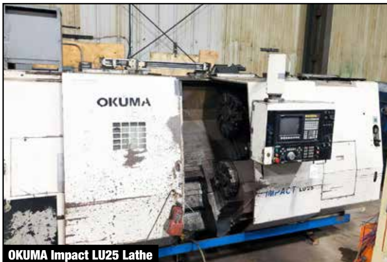
OKUMA Impact LU25 Lathe