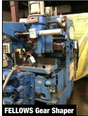
FELLOWS Gear Shaper