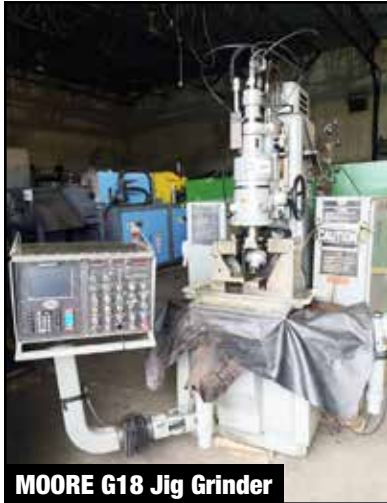
MOORE G18 Jig Grinder