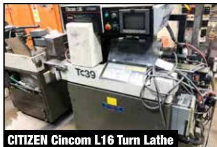
CITIZEN Cincom L16 Turn Lathe