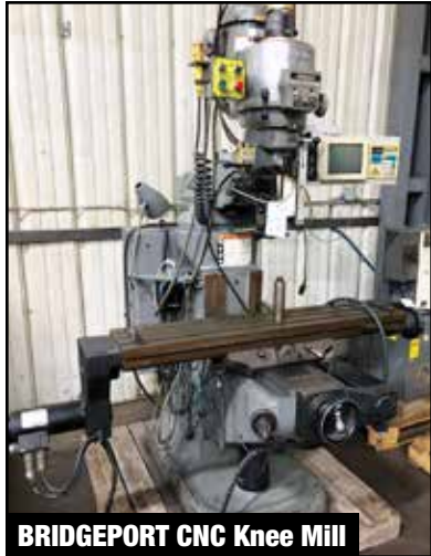
BRIDGEPORT CNC Knee Mill