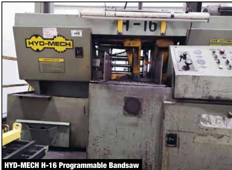
HYD-MECH H-16 Programmable Bandsaw

FEATURING A LARGE QUANTITY OF GEAR MANUFACTURING, CNC MACHINING, HEAT TREAT & SUPPORT EQUIPMENT