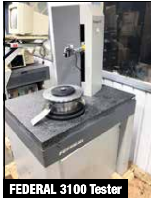
FEDERAL 3100 Tester