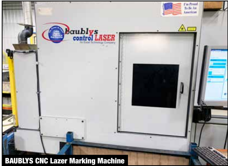
BAUBLYS CNC Lazer Marking Machine

FEATURING A LARGE QUANTITY OF GEAR MANUFACTURING, CNC MACHINING, HEAT TREAT & SUPPORT EQUIPMENT