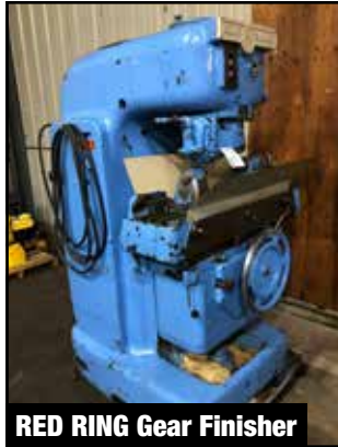
RED RING Gear Finisher