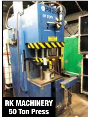
RK MACHINERY 50 Ton Press