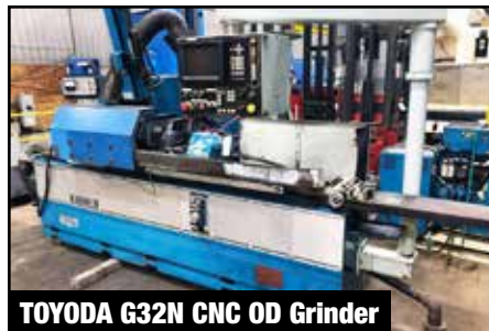
TOYODA G32N CNC OD Grinder