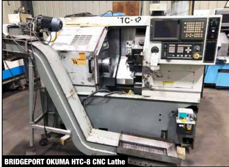
BRIDGEPORT OKUMA HTC-8 CNC Lathe