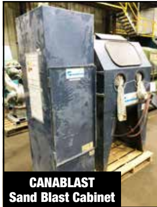
CANABLAST Sand Blast Cabinet