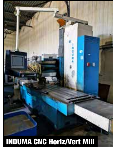
INDUMA CNC Horiz/Vert Mill