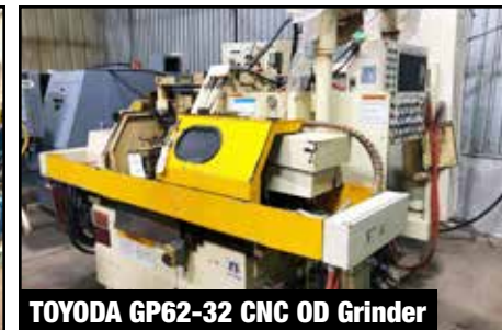
TOYODA GP62-32 CNC OD Grinder