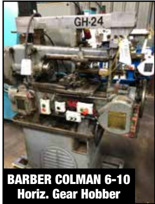
BARBER COLMAN 6-10 Horiz. Gear Hobber