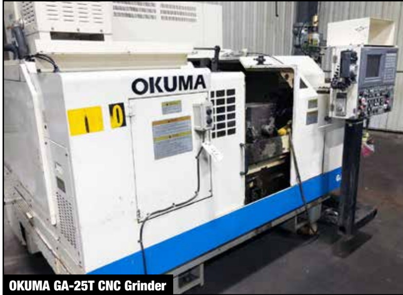
OKUMA GA-25T CNC Grinder

PLACE YOUR BID NOW! Register at bidspotter.com or maynards.com