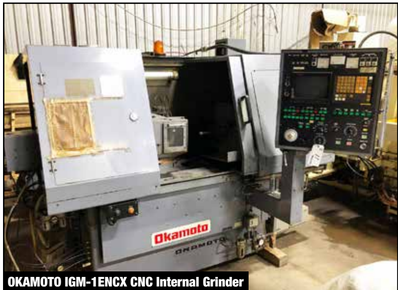
OKAMOTO IGM-1ENCX CNC Internal Grinder

For Complete Information Please Contact: Mike McIntosh | 647-828-8895 | MMcintosh@maynards.com