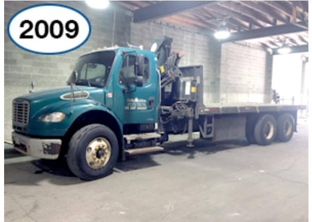
Freightliner M2 Knuckle Boom Truck