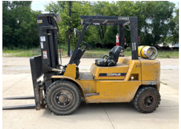
Caterpillar GP40KL Forklift