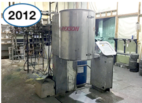
Rexson Colorpoint CP32