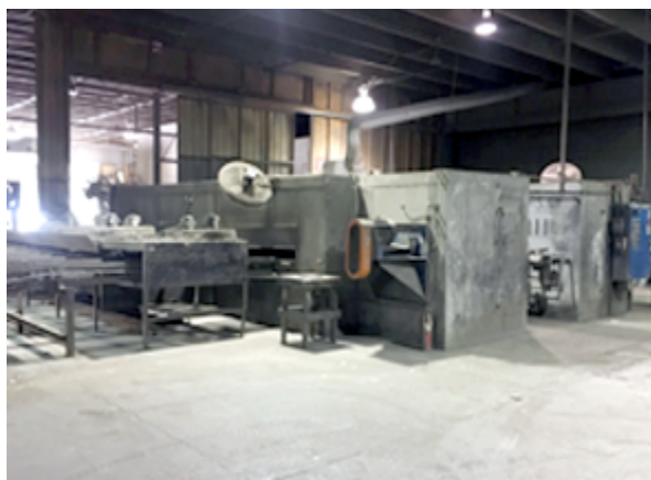
Shake Coating Line Oven