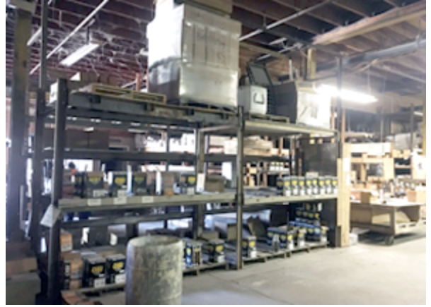
Large Quantity Building Supplies