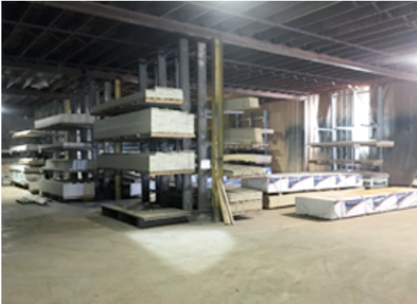
Large Quantity of Building Inventory