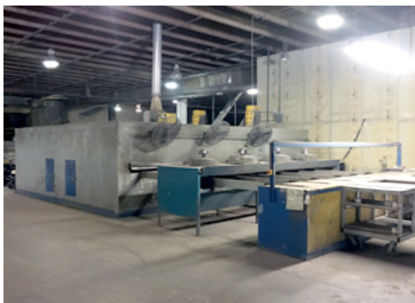
View of Coating Line

INSPECTION LOCATION: 147 E. 2nd Avenue, Rochelle, IL 61068