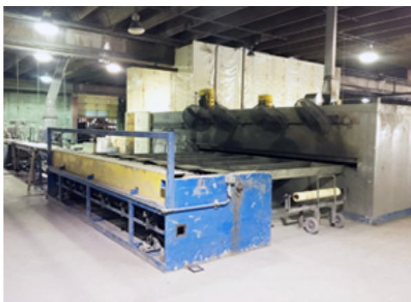
Trim Coating Line with Oven