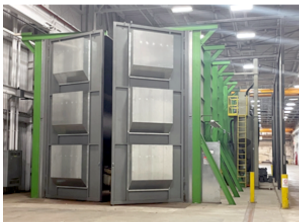
Global Finishing Crossdraft Booth