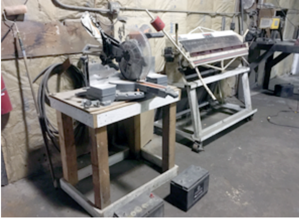
View of Shop Equipment