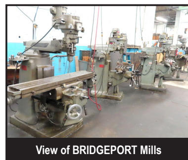
View of BRIDGEPORT Mills