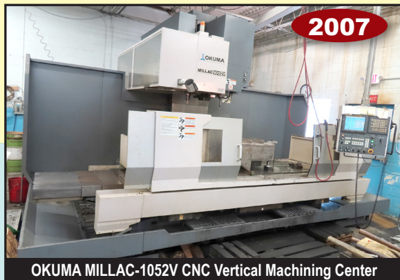
OKUMA MILLAC-1052V CNC Vertical Machining Center

October 20th through October 27th (Closing Begins at Noon) TOOLING, MEASURING & SUPPORT EQUIPMENT