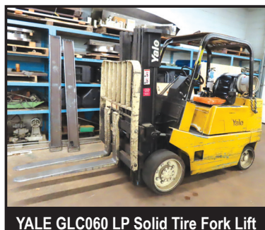
YALE GLC060 LP Solid Tire Fork Lift

Tuesday, October 25th at 11:00 am MACHINERY, FORK LIFT, CMM