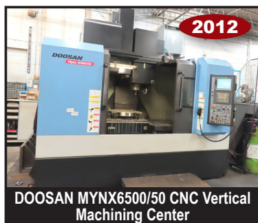
DOOSAN MYNX6500/50 CNC Vertical Machining Center