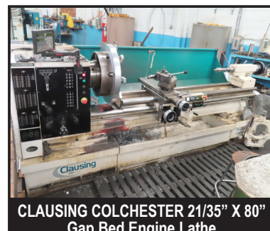
CLAUSING COLCHESTER 21/35" X 80" Gap Bed Engine Lathe