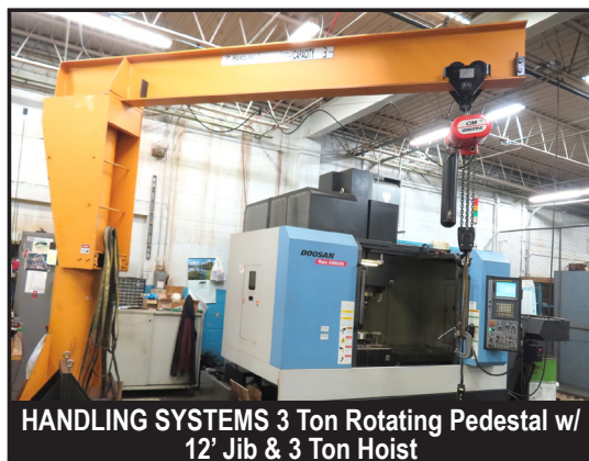
HANDLING SYSTEMS 3 Ton Rotating Pedestal w/ 12' Jib & 3 Ton Hoist