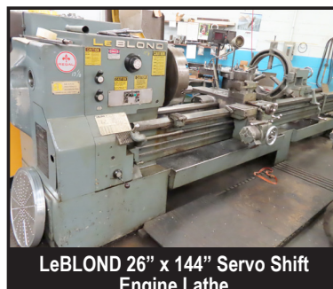
LeBLOND 26" x 144" Servo Shift Engine Lathe