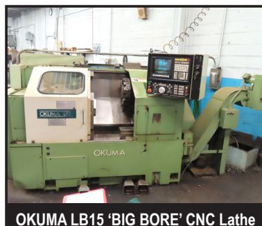
OKUMA LB15 'BIG BORE' CNC Lathe