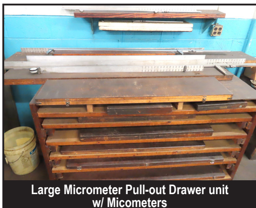
Large Micrometer Pull-out Drawer unit w/ Micrometers