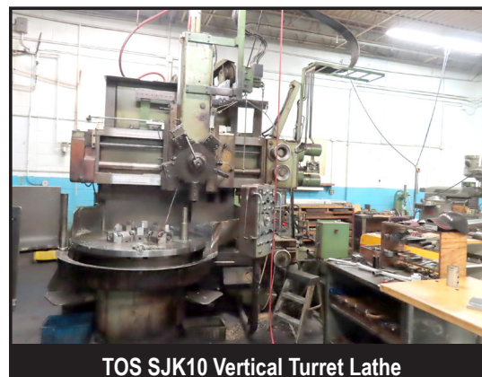
TOS SJK10 Vertical Turret Lathe