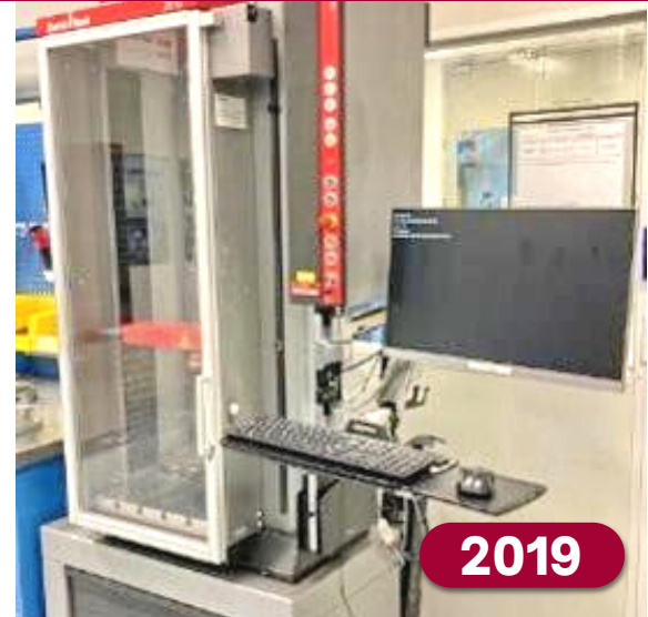
(2) MAGTROL TESTING STATIONS WITH DYNAMOMETERS, ELECTRONICS & SOFTWARE