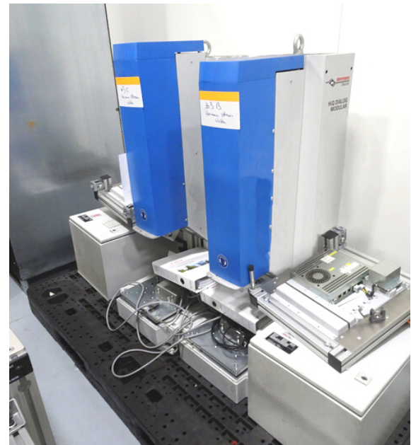
(3) HERRMANN ULTRASONIC WELDER MODEL H10