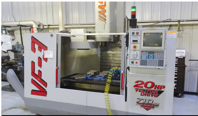
(2) HAAS VF3 VERTICAL MACHINING CENTER