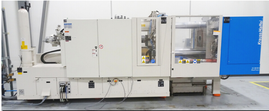
2016 KRAUSS MAFFEI 300/1000CX 300-TON HYDRAULIC MOLDING MACHINE

Fletcher, North Carolina Closes Dec 7 at 10:00 AM (EST)