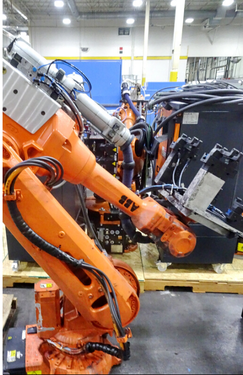
NUMEROUS LATE MODEL KUKA, ABB & MITSUBISHI ROBOTS ASSORTED MODELS & SIZES (APPROX. 15 TOTAL)