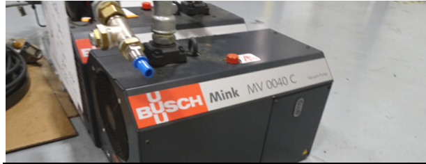
BUSCH ROTARY CLAW VACUUM PUMPS