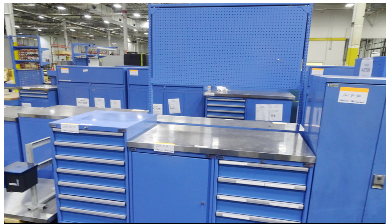
LARGE QUANTITY OF VIDMAR AND LISTA WORKBENCHES AND CABINETS

MACHINE SHOP & SUPPORT: DoAll horizontal band saw c916-s; Bridgeport milling machine; Vectrax milling machine; National Press Brake 16 gauge model L16-12016; (12) PowerPallet electric pallet jacks model PPR2000; Portacool Jetstream 270 Tennant model 3640; Walk behind sweeper; Angle vises; angle plates; tilting angle plates; mag mates; taps; reamers; endmills; Drills and More!