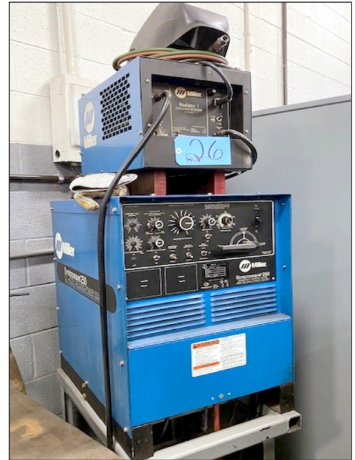
Miller Syncrowave 250 Welder, with Miller Chiller