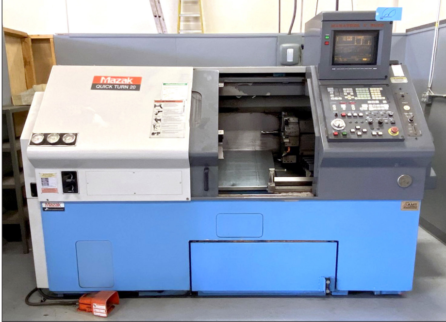
Mazak Quick Turn 20 CNC Lathe