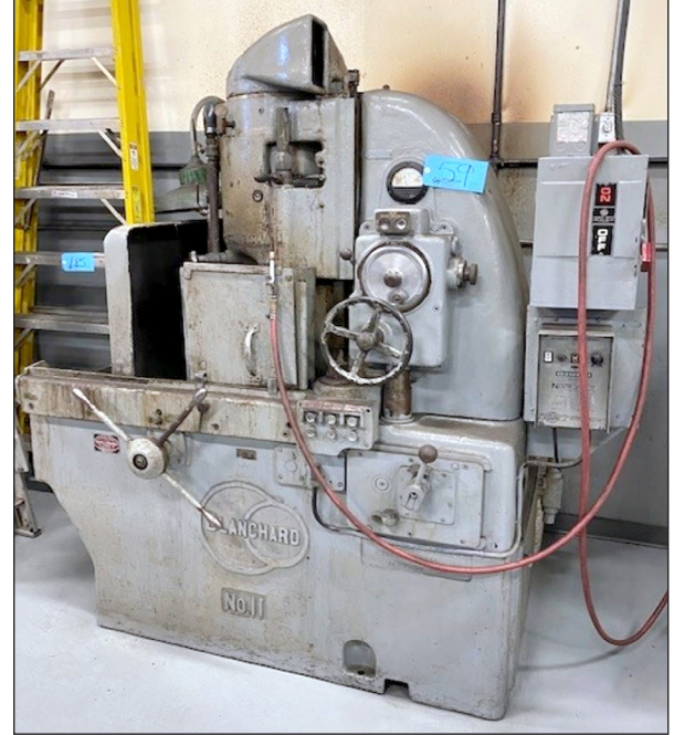
Blanchard No. 11 Rotary Surface Grinder