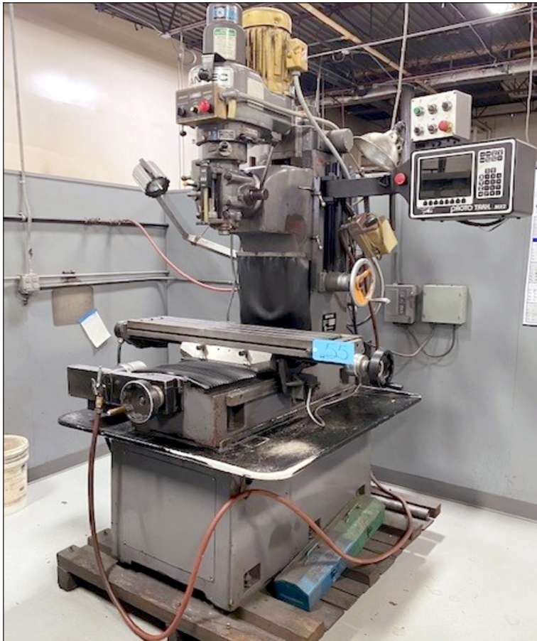
Santec RB-10, 2-Axis CNC Vertical Bed Milling Machine

LOCATION: 1270 Rankin Drive, Troy, MI 48083