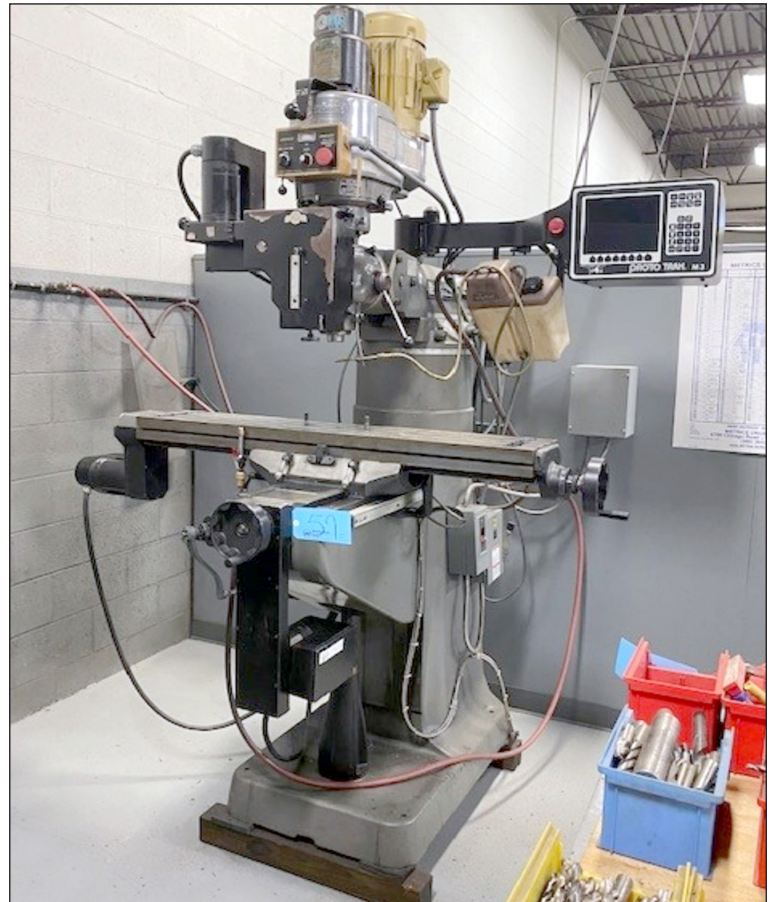
Bridgeport 3-Axis CNC Vertical Milling Machine