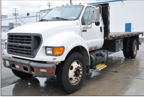
2000 FORD F-650 Super Duty 26,000-LB GVWR Diesel Stake Truck

OFFERING ONLINE BIDDING ONLY, SIGN UP NOW!