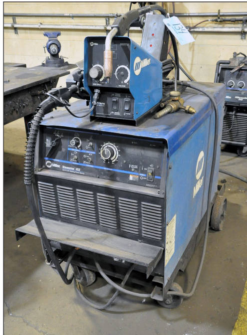
Miller Dimension 452 450-AMP CC/CV-DC Welding Power Source