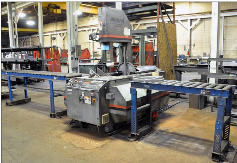
Armstrong-Blum Marvel Series 8 Mark III 18" Vertical Power Tilting Metal Cutting Bandsaw