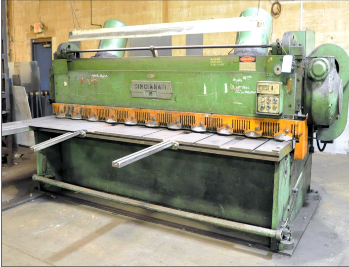
Cincinnati 1810 10' x 1/4" Mild Steel Power Squaring Shear

OFFERING ONLINE BIDDING ONLY, SIGN UP NOW!