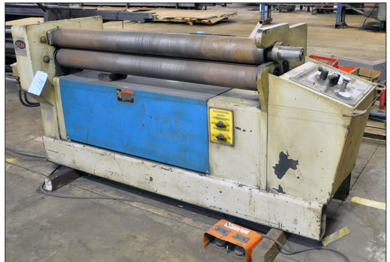
WDM HIP-5-60 10-Gauge x 5' Capacity Hydraulic Initial Pinch Sheet Bending Roll