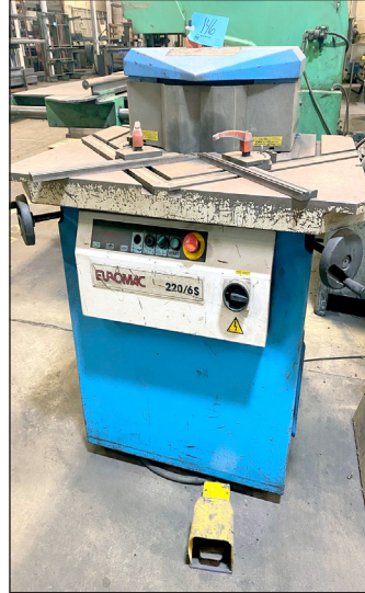
Euromac 220/6S Variable Angle Hydraulic Corner Notcher