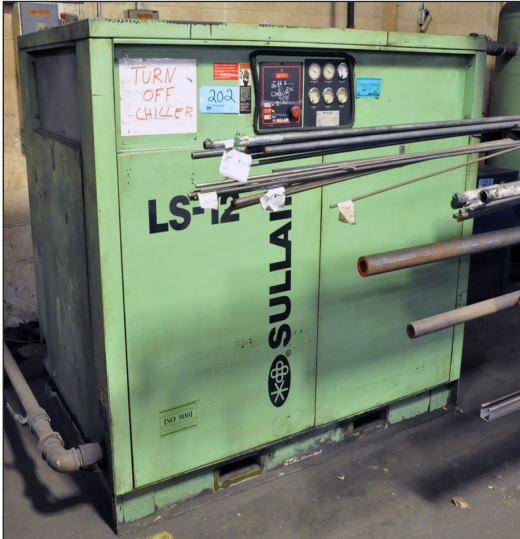
Sullair L612-30 HH A/C SULL 30-HP 150-PSI Rotary Screw Air Compressor