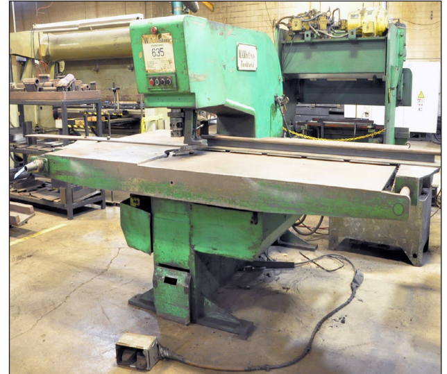
W.A. Whitney 635 30-Ton Hydraulic Punch Press