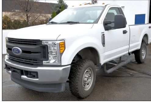
2017 Ford F-250XL Super Duty 4X4 Gas Pickup Truck