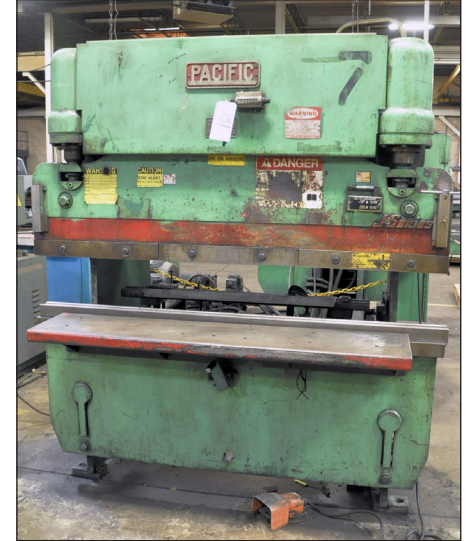
Pacific J Series J40-6, 40 Ton (12-Gauge) x 6' Hydraulic Press Brake