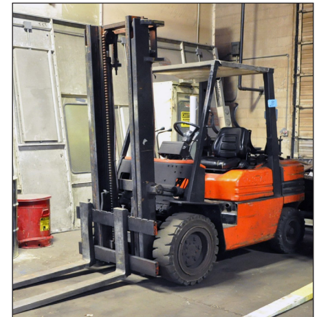
Toyota 02-5FG30 5,100-LB Capacity x 185" Lift LP Gas Forklift Truck