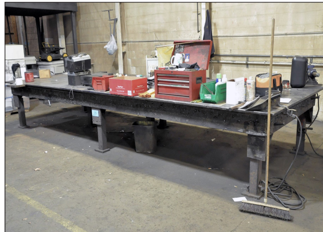
225" L x 75" W x 33" H x 1" Thick Steel Welding Table