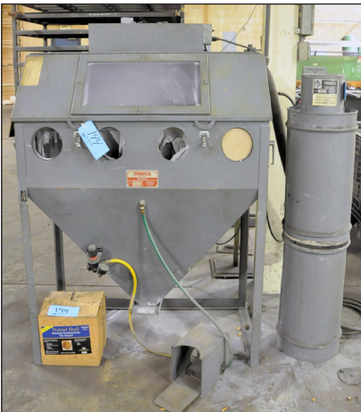
Trinco 487BP 2-Hole Dry Shot Blast Cabinet