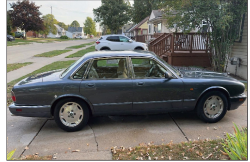
1995 Jaguar XJ6 RWD Sedan 4-Door