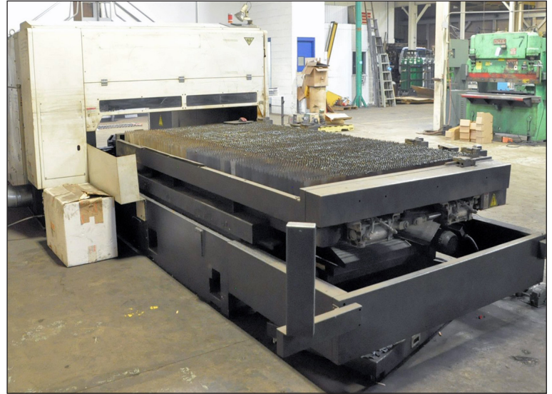
Mazak Super Turbo-X510 MKII, CO2 Laser Cutting Machine