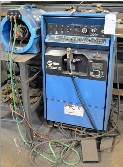
Miller Syncrowave 351 350-AMP CC-AC/DC Welding Power Source