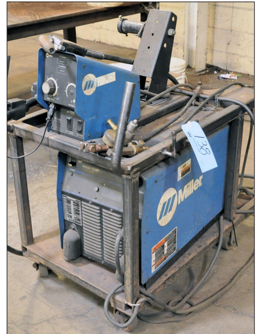
Miller Invision 456MP 450-AMP DC Inverter Arc Welder