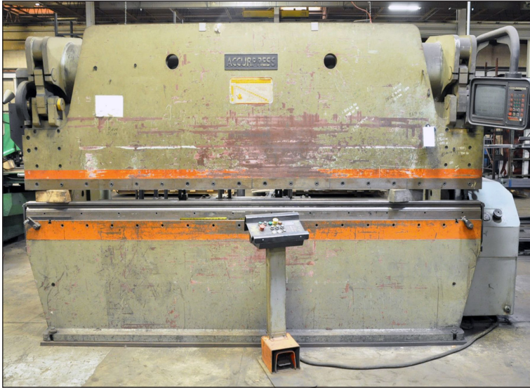
Accupress 717512 12' 175-Ton CNC Hydraulic Press Brake

LOCATION: 28514 Hayes Road, Building D, (Rear of Complex), Roseville, MI 48066