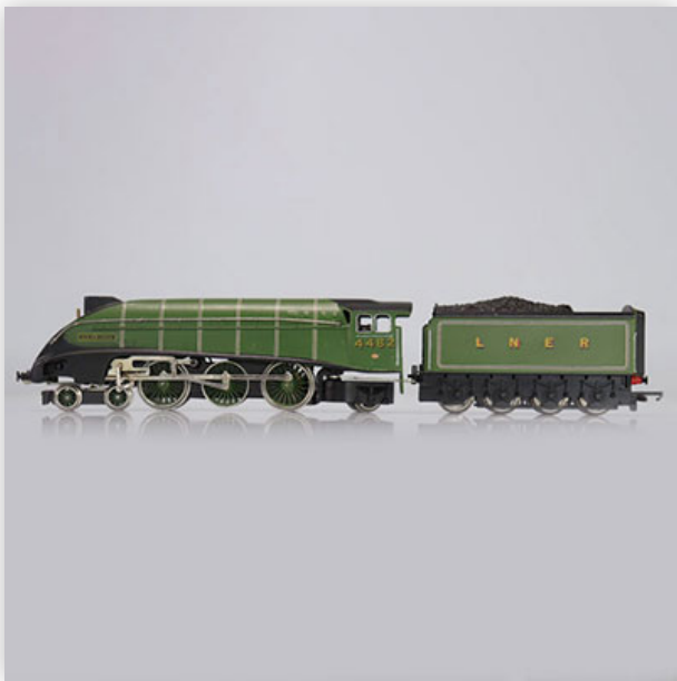
105 Wrenn locomotive / Reference: W2209 / 4482 / Type: Pacific A4 Golden Eagle

Référence: GFAB6230 — Poids: 590 g — Region: England — Sizes: Avec boîte= H=65mm L=220mm — Condition: At first glance - very good condition - no restoration - no repair