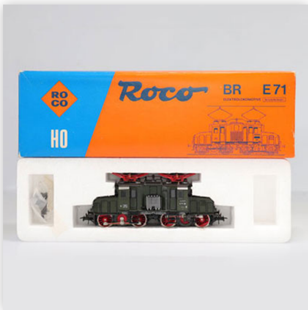
295 Roco locomotive / Reference: 04196A / Type: Elektrolokomotive Bre17 E7133

Référence: GFAB6429 — Poids: 330 g — Sizes: L=135mm — Condition: At first glance - very good condition - no restoration - no repair