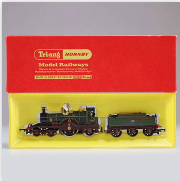
133 Hornby / Reference locomotive: ? / Type: Lord of the Isles 3046

Référence: GFAB6259 — Poids: 350 g — Sizes: L=260mm — Condition: At first glance - very good condition - no restoration but outbox