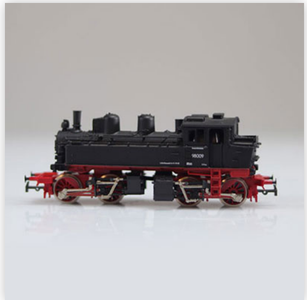
80 Rivarossi locomotive / Reference: - / Type: locotender 4-4 #98009

Référence: GFAB6205 — Poids: 216 g — Sizes: L=150mm — Condition: At first glance - very good condition - no restoration - no repair