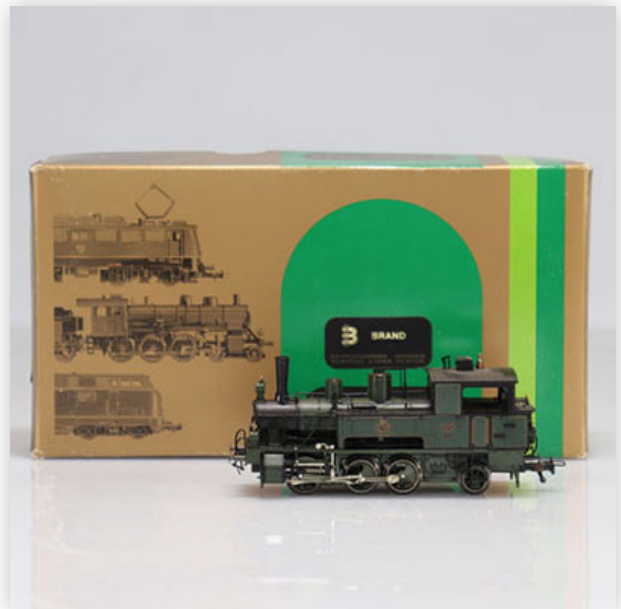
256 Trix locomotive / Reference: 22405 / Type: 0.6.2

Référence: GFAB6390 — Poids: 200 g — Sizes: L=110mm — Condition: At first glance - very good condition - no restoration - no repair