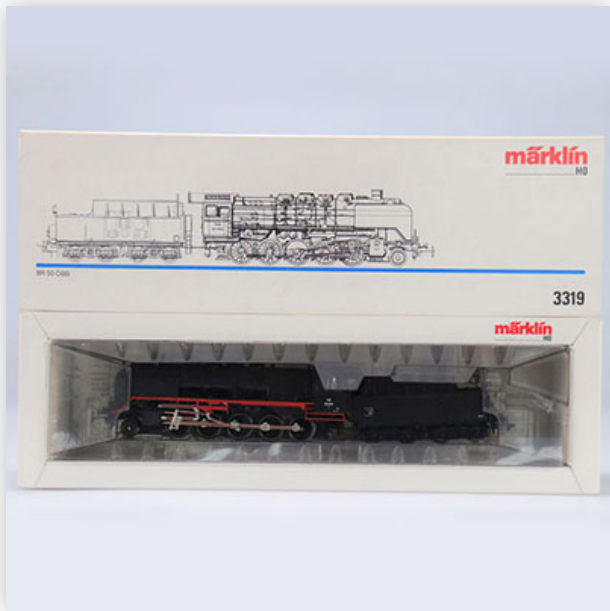
239 Marklin locomotive / Reference: 3319 / Type: 2.10.0 / 50.1805

Référence: GFAB6373 — Poids: 780 g — Region: Allemagne — Sizes: Avec boîte= H=65mm L=360mm — Condition: At first glance - very good condition - no restoration - no repair