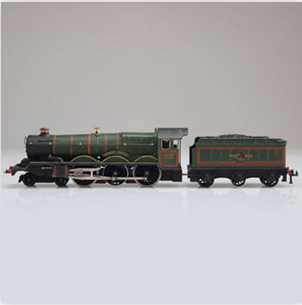
169 Hornby locomotive / Reference: 2220 / Type: Steam 4-6-0 Denbigh Castle...

Référence: GFAB6296 — Poids: 600 g — Sizes: L=280mm — Condition: At first glance - very good condition - no restoration - no repair