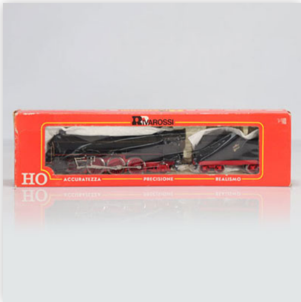
7 Rivarossi locomotive / Reference: 1132 / Type: GR 746.048

Référence: GFAB6141 — Poids: 450 g — Sizes: L=290mm — Condition: At first glance - very good condition - no restoration - no repair