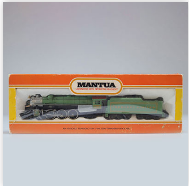
406 Mantua locomotive / Reference: 311 45 / Type: Pacific 1398

Référence: GFAB6543 — Poids: 780 g — Sizes: L=320mm — Condition: At first glance - very good condition - no restoration - no repair