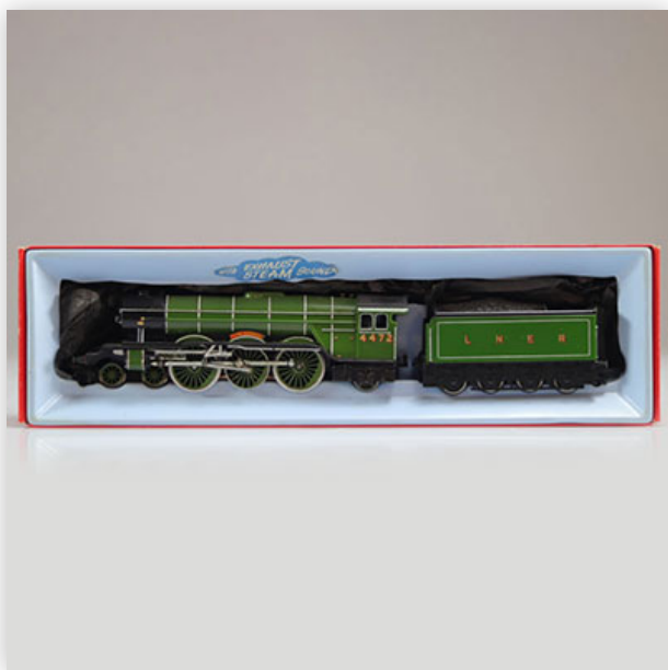
135 Hornby locomotive / Reference: R855N / Type: 4.6.2 Flying Scotsman 4472

Référence: GFAB6261 — Poids: 530 g — Sizes: L=280mm — Condition: At first glance - very good condition - no restoration - no repair