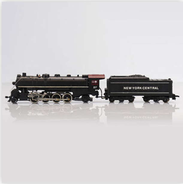
61 Rivarossi locomotive / Reference: - 217 / Type: steam 2-8-2 #217

Référence: GFAB6185 — Poids: 800 g — Sizes: L=325mm — Condition: At first glance - very good condition - no restoration - no repair