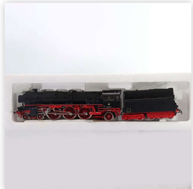
252 Marklin locomotive / Reference: 8385 / Type: Steam loco 4-6-2 #012081-6

Référence: GFAB6386 — Poids: 645 g — Sizes: Avec boîte= H=60mm L=330mm — Condition: At first glance - very good condition - no restoration - no repair