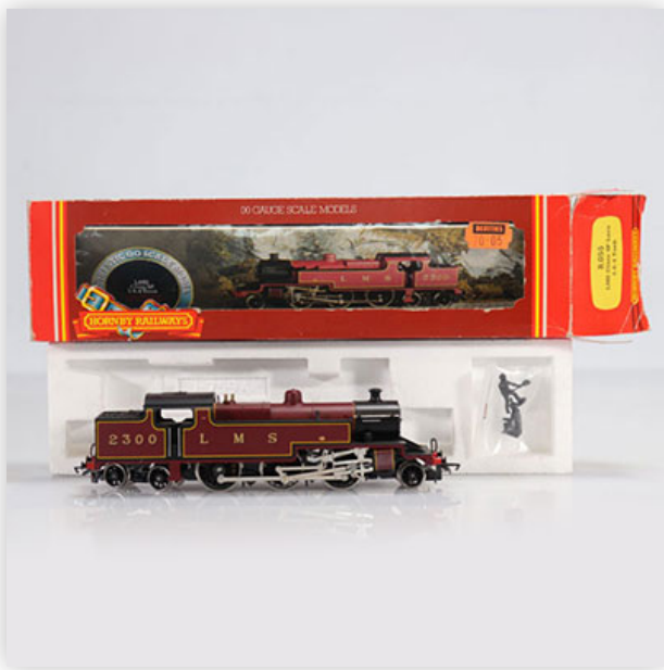
165 Hornby locomotive / Reference: R055 / Type: Class 4p Loco 2-6-4 Tank

Référence: GFAB6291 — Poids: 330 g — Sizes: L=200mm — Condition: At first glance - very good condition - no restoration - no repair