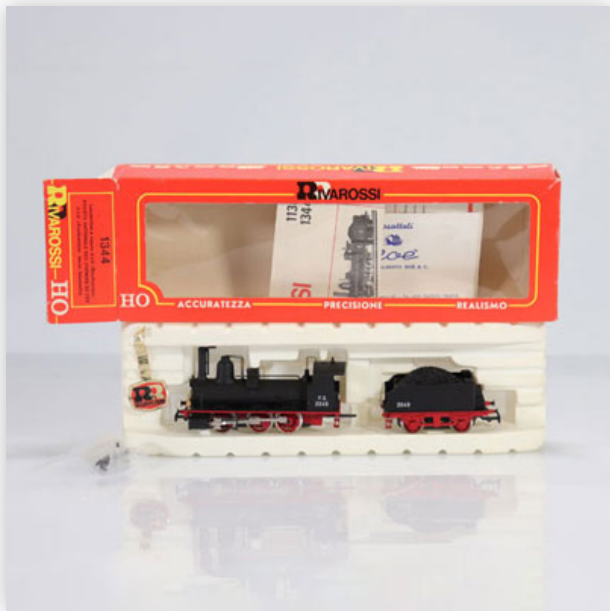
3 Rivarossi locomotive / Reference: 1344 / Type: O_3_0 "Bourbonnais"

Référence: GFAB6137 — Poids: 230 g — Sizes: L=180mm — Condition: At first glance - very good condition - no restoration - no repair