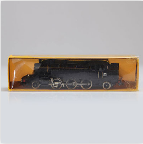
385 Meccano locomotive / Reference: 131TB (Hornby) / Type: 131 TB is

Référence: GFAB6521 — Poids: 405 g — Sizes: L=175mm — Condition: At first glance - good condition - no restoration - no repair (damaged box)