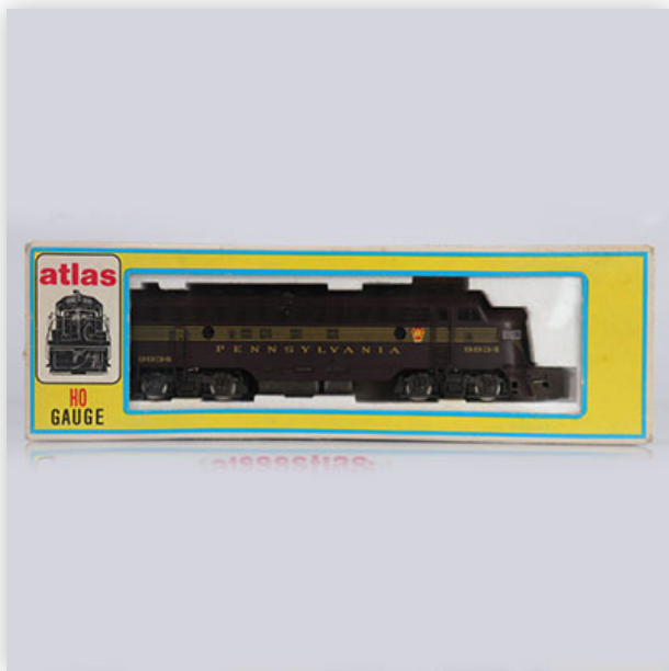
509 Atlas locomotive / Reference: 7043 / Type: FP7 Diesel (9834)

Référence: GFAB6658 — Poids: 445 g — Region: Amérique — Sizes: Avec boîte= H=45mm L=275mm — Condition: At first glance - very good condition - no restoration - no repair