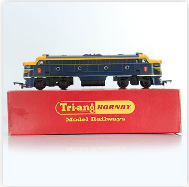
166 Hornby locomotive / Reference: R159 (Tri-Ang) / Type: Double Ended Diesel

Référence: GFAB6293 — Poids: 465 g — Sizes: Avec boîte= H=65mm L=260mm — Condition: At first glance - very good condition - no restoration - no repair