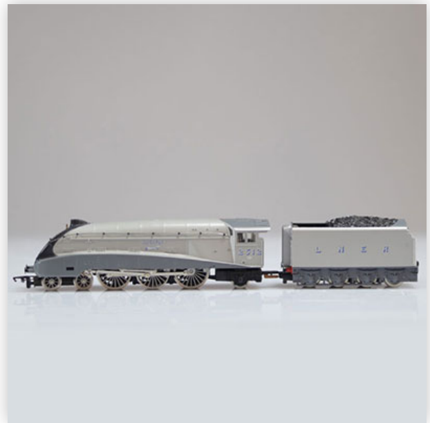
142 Hornby locomotive / Reference: R099 / Type: A4 Class Loco "Silver Fox"...

Référence: GFAB6268 — Poids: 523 g — Sizes: L=300mm — Condition: At first glance - very good condition - no restoration - no repair