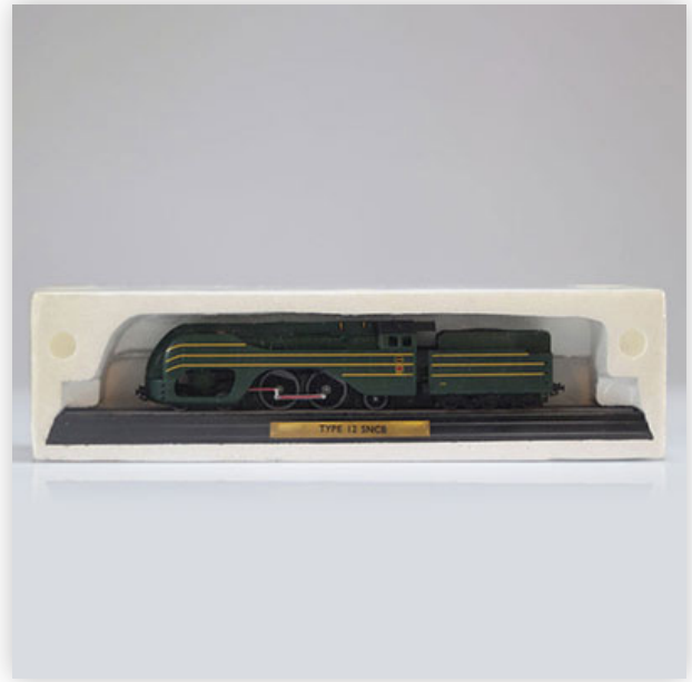
450 Locomotive Model / Reference: 2 115 209 / Type: Type 12

Référence: GFAB6596 — Poids: 365 g — Sizes: L=215mm — Condition: At first glance - very good condition - no restoration - no repair