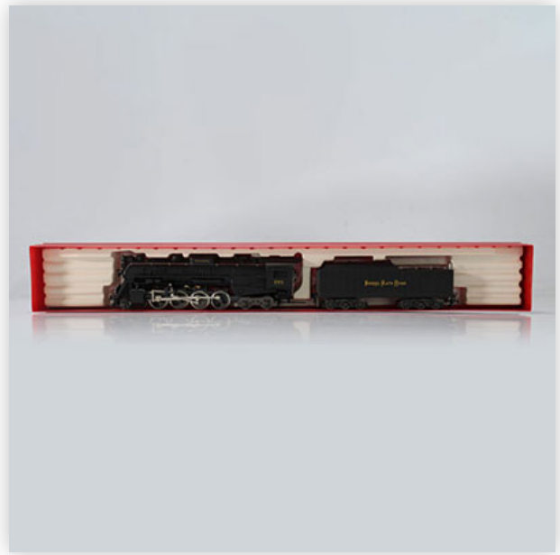
62 Rivarossi locomotive / Reference: 1244 / Type: locomotive 2-8-4 class...

Référence: GFAB6186 — Poids: 750 g — Region: Amérique — Sizes: Avec boîte= H=50mm L=525mm — Condition: At first glance - very good condition - no restoration - no repair