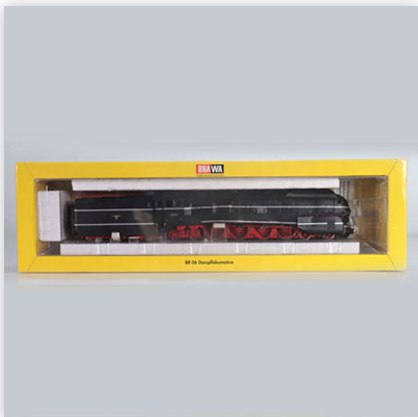
511 Brawa locomotive / Reference: 630 / Type: BR06 Dampflokomotive 4-8-4

Référence: GFAB6660 — Poids: 1.14 kg — Region: Allemagne — Sizes: Avec boîte= H=55mm L=415mm — Condition: damaged