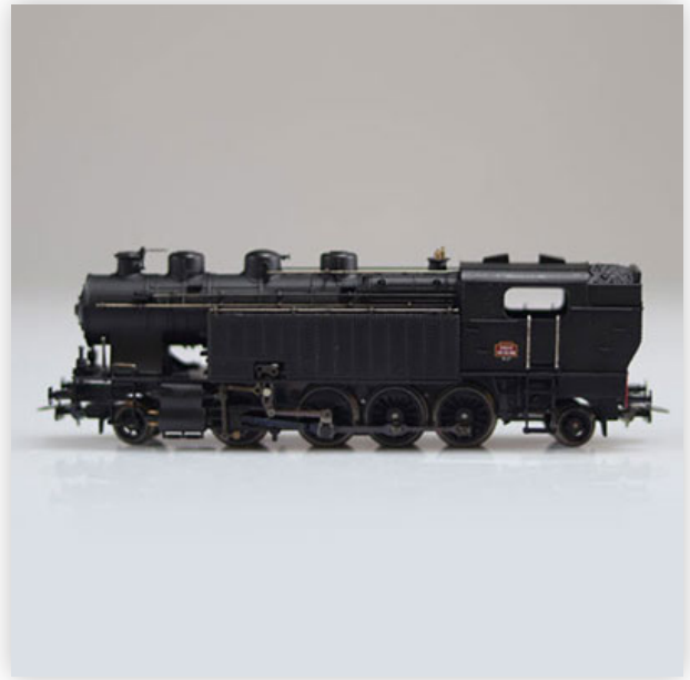
438 Jouef locomotive / Reference: - / Type: locotender 2-8-2 #141TA416

Référence: GFAB6577 — Poids: 255 g — Sizes: L=160mm — Condition: At first glance - very good condition - no restoration - no repair