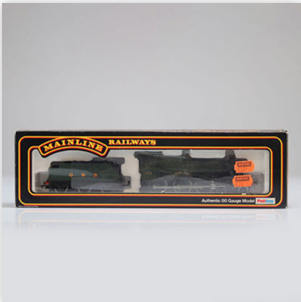
271 Mainline locomotive / Reference: 37079 /7819 / Type: 4-6-0 Manor Class...

Référence: GFAB6405 — Poids: 400 g — Sizes: L=265mm — Condition: At first glance - very good condition - no restoration - no repair