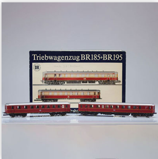
363 Piko locomotive / Reference: 5/0732/020 / Type: Triebwagenzug BR185+BR195...

Référence: GFAB6499 — Poids: 600 g — Sizes: L=460mm — Condition: At first glance - very good condition - no restoration - no repair