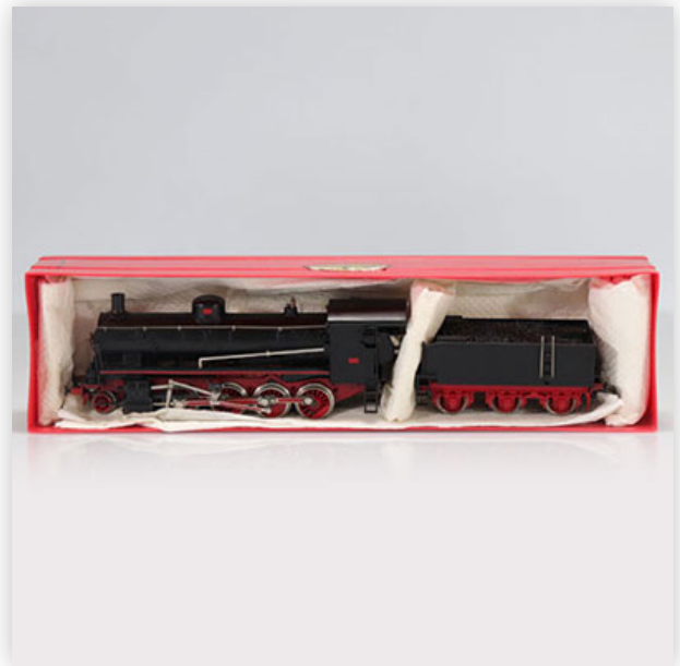
48 Rivarossi locomotive / Reference: 1121 / Type: GR. 740

Référence: GFAB6172 — Poids: 500 g — Sizes: L=220mm — Condition: At first glance - very good condition - no restoration - no repair