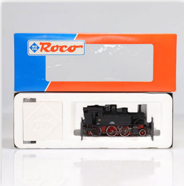
293 Roco locomotive / Reference: 43277 / Type: GRUPPO 880 BREDA

Référence: GFAB6427 — Poids: 300 g — Sizes: L=110mm — Condition: At first glance - very good condition - no restoration - no repair