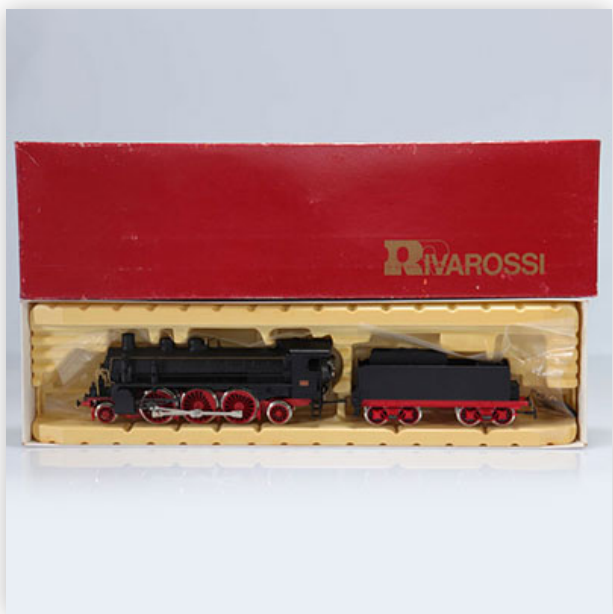
51 Rivarossi locomotive / Reference: 1135 / Type: GR S 685 584

Référence: GFAB6175 — Poids: 500 g — Sizes: L=250mm — Condition: At first glance - very good condition - no restoration - no repair