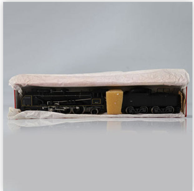
60 Rivarossi locomotive / Reference: 1336 / Type: Pacific 4.6.2. E13 23i.e.13

Référence: GFAB6184 — Poids: 515 g — Sizes: Avec boîte= H=50mm L=330mm — Condition: At first glance - very good condition - no restoration - no repair