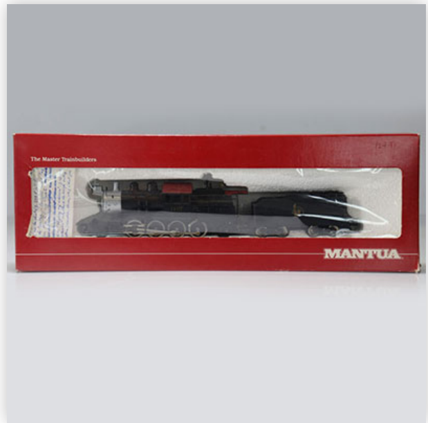
410 Mantua locomotive / Reference: 322_034 / Type: Camel Back #1107

Référence: GFAB6547 — Poids: 560 g — Region: Amérique — Sizes: H=40mm L=380mm — Condition: At first glance - very good condition - no restoration - no repair