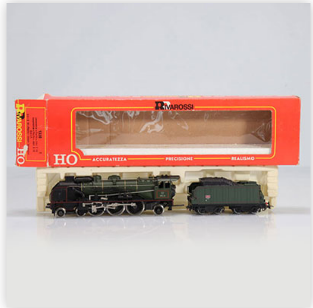
44 Rivarossi locomotive / Reference: 1336 / Type: Pacific 4.6.2. E13 Calais...

Référence: GFAB6168 — Poids: 570 g — Sizes: L=300mm — Condition: At first glance - very good condition - no restoration - no repair