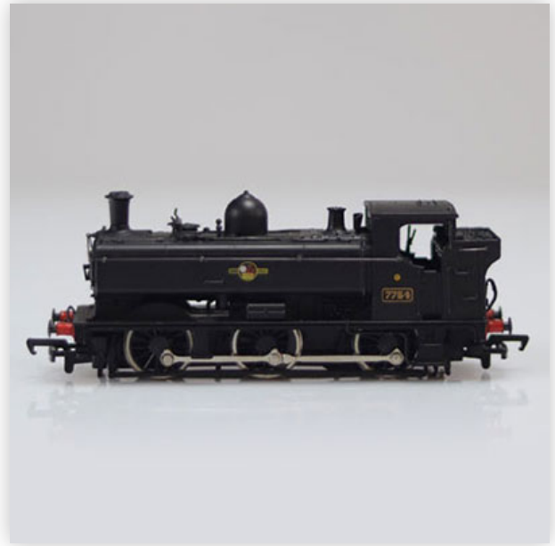
218 Bachmann locomotive / Reference: - / Type: locotender 0-6-0 #7754

Référence: GFAB6350 — Poids: 283 g — Sizes: L=130mm — Condition: At first glance - very good condition - no restoration - no repair