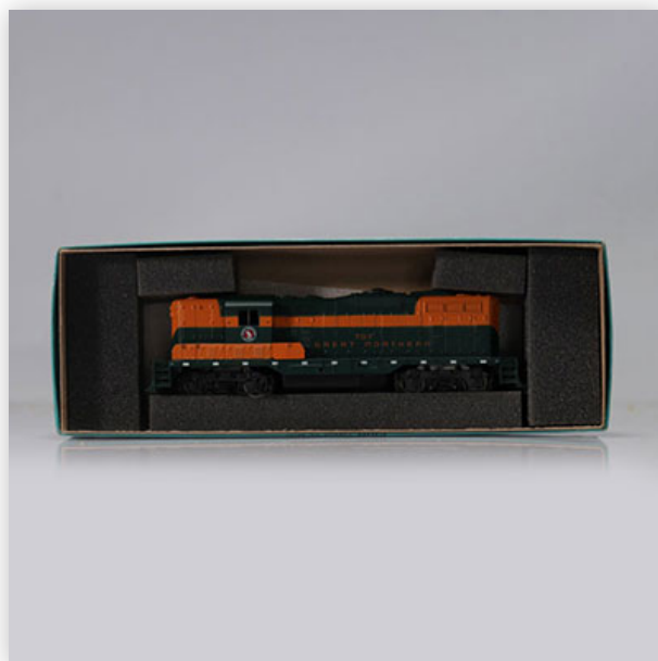
488 Athearn locomotive / Reference: 3157 / Type: GP9 PWR #707

Référence: GFAB6637 — Poids: 385 g — Region: Amérique — Sizes: Avec boîte= H=40mm L=270mm — Condition: At first glance - very good condition - no restoration - no repair