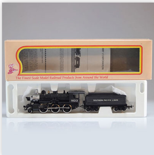
402 IHC locomotive / Reference: 822000 / Type: 2.6.0. Mogul 1623

Référence: GFAB6539 — Poids: 400 g — Sizes: L=240mm — Condition: At first glance - very good condition - no restoration - no repair