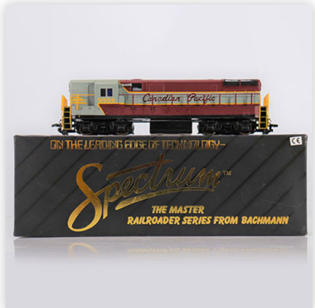
212 Bachmann locomotive / Reference: Spectrum 81209 / Type: Fairbanks Morse...

Référence: GFAB6344 — Poids: 480 g — Region: Amérique — Sizes: Avec boîte= H=45mm L=255mm — Condition: At first glance - very good condition - no restoration - no repair