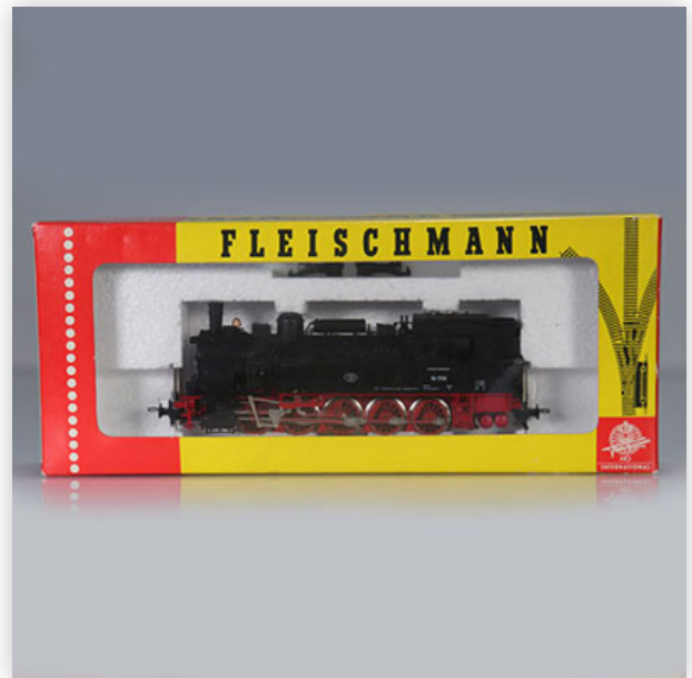
84 Fleischmann locomotive / Reference: 4094 / Type: 050 T

Référence: GFAB6209 — Poids: 415 g — Region: Allemagne — Sizes: Avec boîte= H=50mm L=250mm — Condition: At first glance - very good condition - no restoration - no repair