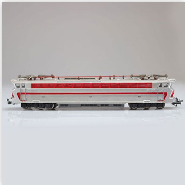
447 Jouef locomotive / Reference: - / Type: locomotive CC 40101

Référence: GFAB6593 — Poids: 300 g — Sizes: L=260mm — Condition: At first glance - very good condition - no restoration - no repair