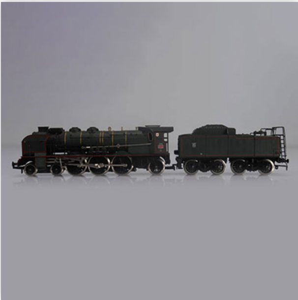
433 Jouef locomotive / Reference: 8255 / Type: Loco Pacific 231-82

Référence: GFAB6572 — Poids: 460 g — Region: France — Sizes: Avec boîte= H=50mm L=385mm — Condition: At first glance - very good condition - no restoration - no repair