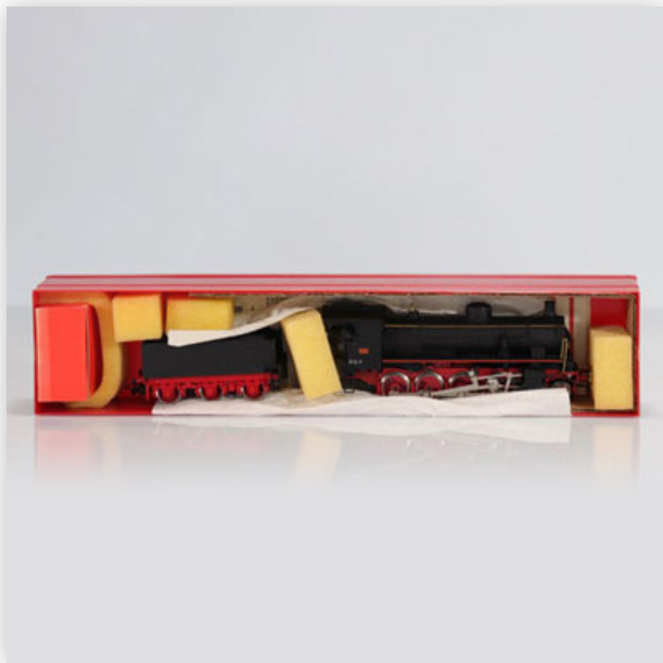
15 Rivarossi locomotive / Reference: 11145 / Type: GR 740 050

Référence: GFAB6149 — Poids: 500 g — Sizes: L=220mm — Condition: At first glance - very good condition - no restoration - no repair