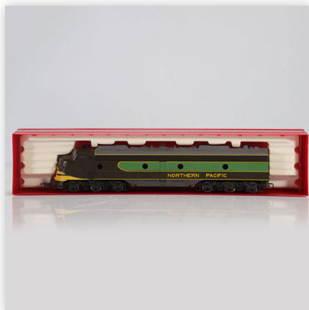
56 Rivarossi locomotive / Reference: 1825 / Type: EMD-E8 electric diesel

Référence: GFAB6180 — Poids: 330 g — Sizes: Locomotive L=255mm — Condition: At first glance - very good condition - no restoration - no repair