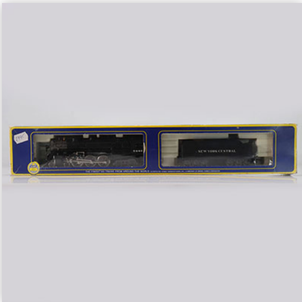
319 AHM locomotive / Reference: 5102 02 / Type: 4-6-4 Hudson, (5442)

Référence: GFAB6454 — Poids: 530 g — Region: Amérique — Sizes: Avec boîte= H=45mm L=515mm — Condition: At first glance - very good condition - no restoration - no repair