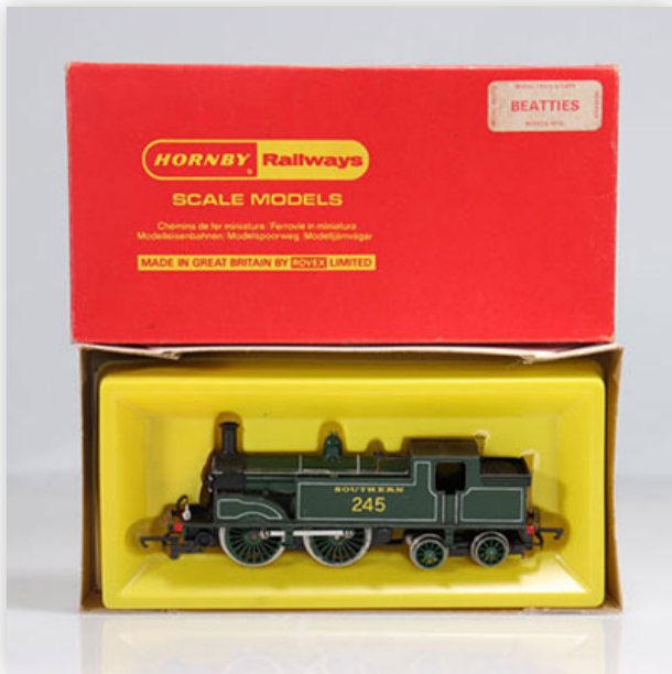
149 Hornby locomotive / Reference: R868 / Type: 0.4.4 M7 Tank Locomotive 245

Référence: GFAB6275 — Poids: 280 g — Sizes: L=140mm — Condition: At first glance - very good condition - no restoration - no repair