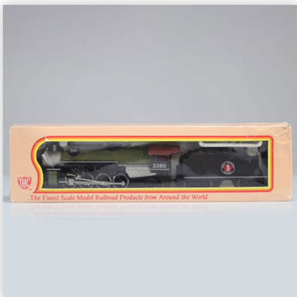
401 IHC locomotive / Reference: M9355 / Type: Mikado 3380 2.8.2

Référence: GFAB6538 — Poids: 470 g — Sizes: L=300mm — Condition: At first glance - very good condition - no restoration - no repair