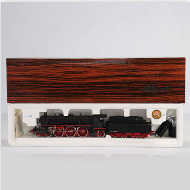
379 Liliput locomotive / Reference: 1801 / Type: 4.6.2 / 18451

Référence: GFAB6515 — Poids: 642 g — Sizes: L=265mm — Condition: At first glance - very good condition - no restoration - no repair