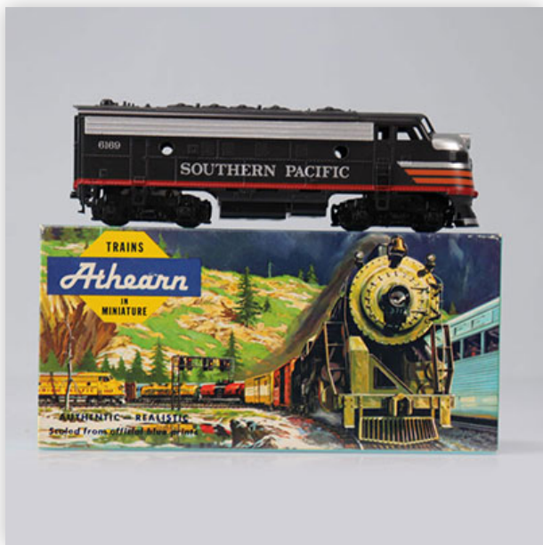
493 Athearn locomotive / Reference: 3041 / Type: F7A DMY SP Black Widow #6169

Référence: GFAB6642 — Poids: 250 g — Region: Amérique — Sizes: H=50mm L=170mm — Condition: Repaired