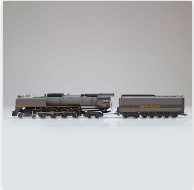
78 Rivarossi locomotive / Reference: - / Type: steam 4-8-4 #836

Référence: GFAB6203 — Poids: 580 g — Sizes: L=400mm — Condition: At first glance - very good condition - no restoration - no repair