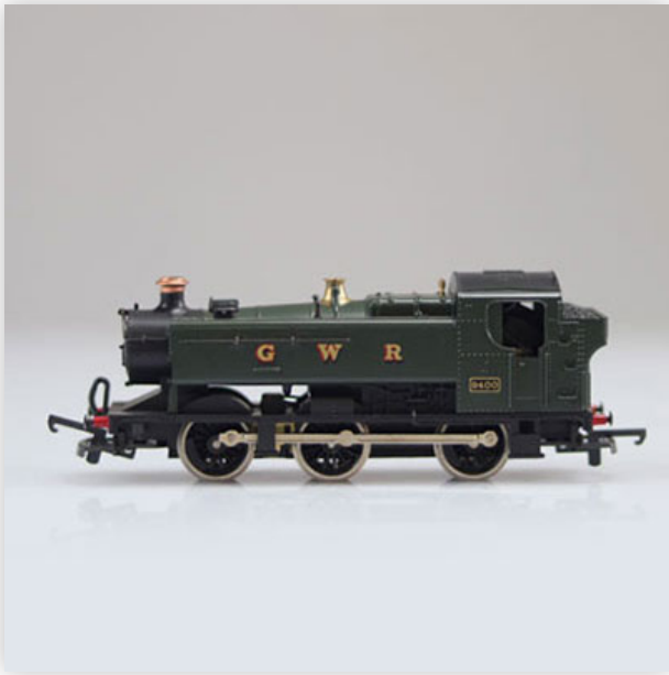
281 Lima locomotive / Reference: - / Type: locotender 0-6-0 #9400

Référence: GFAB6415 — Poids: 234 g — Sizes: L=150mm — Condition: At first glance - very good condition - no restoration - no repair