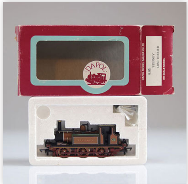
400 Dapol locomotive / Reference: D102 / Type: Stepney Terrier 55

Référence: GFAB6537 — Poids: 140 g — Sizes: L=120mm — Condition: At first glance - very good condition - no restoration - no repair