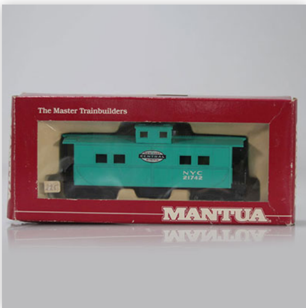
411 Mantua locomotive / Reference: 7266_022 / Type: Heavy 36 'Caboose #21742

Référence: GFAB6548 — Poids: 165 g — Region: Amérique — Sizes: H=35mm L=190mm — Condition: At first glance - very good condition - no restoration - no repair