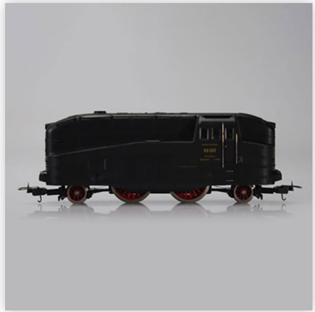
278 Lima locomotive / Reference: 60001 / Type: Loco Carrossée 6001 2-4-2 Hamburg

Référence: GFAB6412 — Poids: 230 g — Region: Allemagne — Sizes: H=55mm L=195mm — Condition: At first glance - very good condition - no restoration - no repair