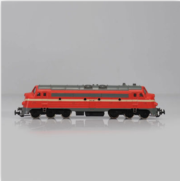
333 Piko locomotive / Reference: - / Type: Diesel M61.001

Référence: GFAB6468 — Poids: 412 g — Sizes: Locomotive L=225mm — Condition: At first glance - very good condition - no restoration - no repair