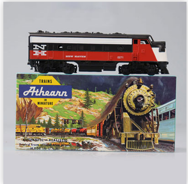
492 Athearn locomotive / Reference: 3221 / Type: F7A Supergeated RTR #0721

Référence: GFAB6641 — Poids: 540 g — Region: Amérique — Sizes: H=50mm L=170mm — Condition: At first glance - very good condition - no restoration - no repair