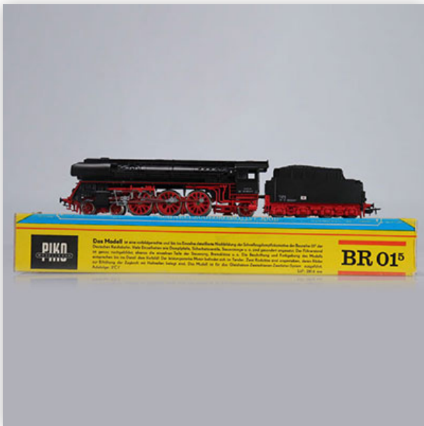
327 Piko locomotive / Reference: 5/6329 / Type: BR01 011512-1

Référence: GFAB6462 — Poids: 700 g — Region: Allemagne — Sizes: Avec boîte= H=50mm L=360mm — Condition: At first glance - very good condition - no restoration - no repair