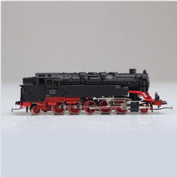
317 Hrushka locomotive / Reference: 399/832 / Type: BR 840001

Référence: GFAB6452 — Poids: 497 g — Sizes: L=185mm — Condition: At first glance - very good condition - no restoration - no repair