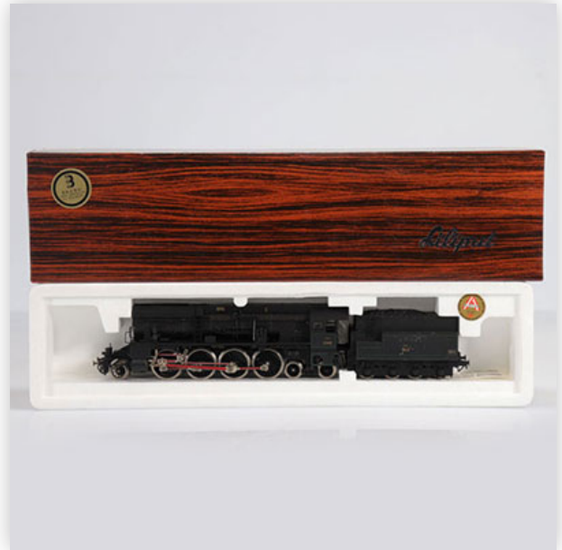
378 Liliput locomotive / Reference: 10610 / Type: 214.10

Référence: GFAB6514 — Poids: 710 g — Sizes: L=270mm — Condition: At first glance - very good condition - no restoration - no repair