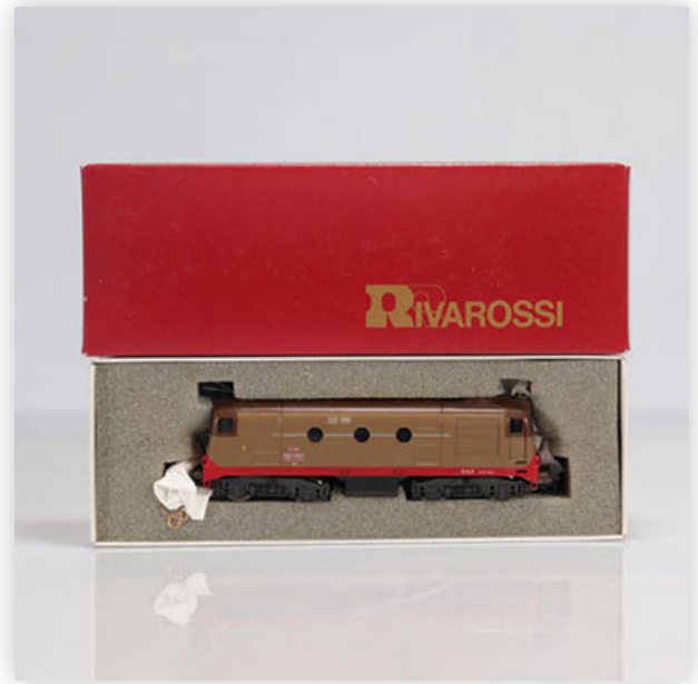
38 Rivarossi locomotive / Reference: 1782 / Type: D 341 2002

Référence: GFAB6162 — Poids: 350 g — Sizes: L=175mm — Condition: At first glance - very good condition - no restoration - no repair