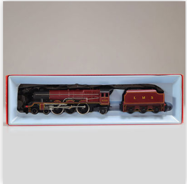
126 Hornby locomotive / Reference: R258AS / Type: 4.6.2. Princess Elizabeth

Référence: GFAB6252 — Poids: 556 g — Sizes: L=270mm — Condition: At first glance - very good condition - no restoration - no repair