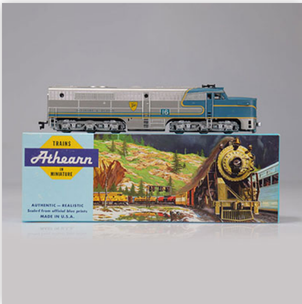
475 Athearn locomotive / Reference: 3308 / Type: PA-1 PWR

Référence: GFAB6624 — Poids: 500 g — Region: Amérique — Sizes: H=50mm L=220mm — Condition: At first glance - very good condition - no restoration - no repair