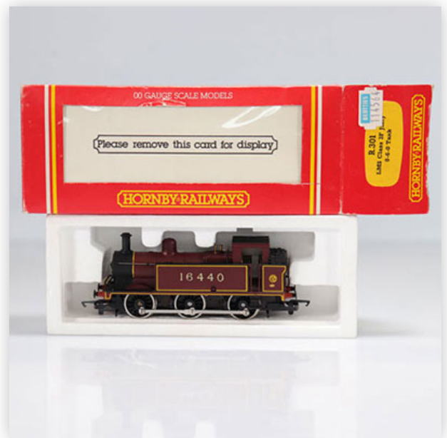
132 Hornby locomotive / Reference: R301 / Type: 0.6.0 Tank Class 3F Jimy 16440

Référence: GFAB6258 — Poids: 220 g — Sizes: L=120mm — Condition: At first glance - very good condition - no restoration - no repair