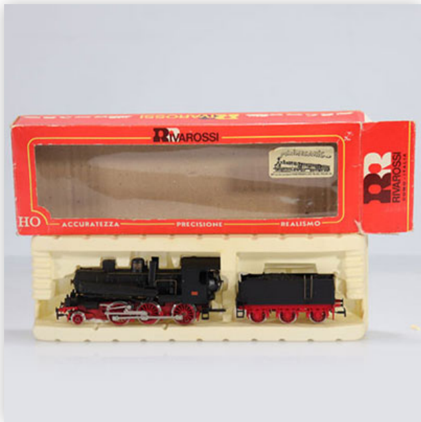
47 Rivarossi locomotive / Reference: 1133 / Type: GR 623 114

Référence: GFAB6171 — Poids: 350 g — Sizes: L=225mm — Condition: At first glance - very good condition - no restoration - no repair