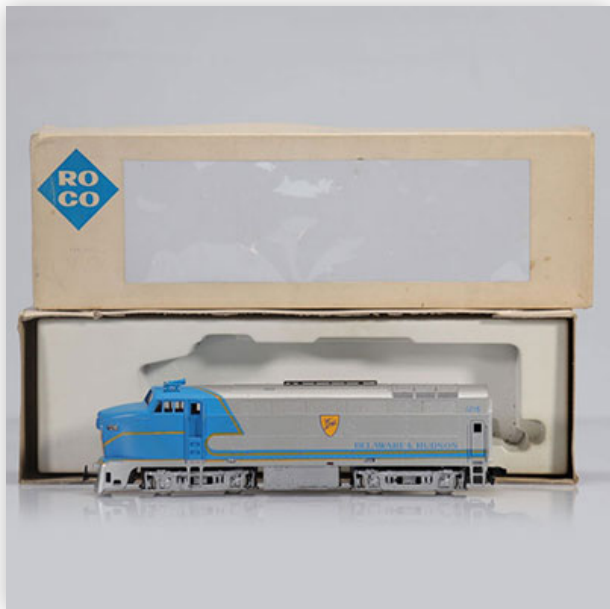
299 Roco locomotive / Reference: - Shark nose / Type: loco diesel 1216 Shark...

Référence: GFAB6433 — Poids: 300 g — Sizes: Locomotive L=200mm — Condition: At first glance - very good condition - no restoration - no repair