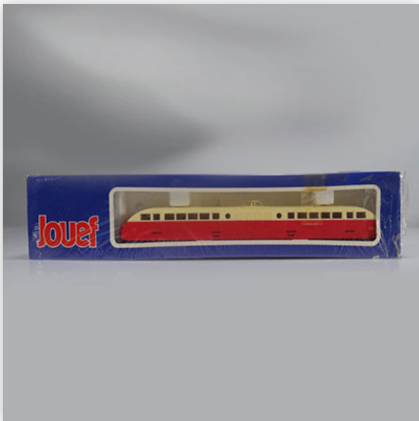
419 Jouef locomotive / Reference: 860200 / Type: Autoraill Bugatti Presidential...

Référence: GFAB6558 — Poids: 320 g — Region: France — Sizes: Avec boîte= H=50mm L=360mm — Condition: At first glance - very good condition - no restoration - no repair