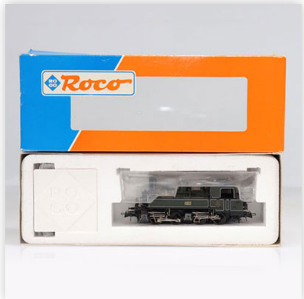
290 Roco locomotive / Reference: 43281 / Type: BBII series MALLETT / 2502

Référence: GFAB6424 — Poids: 290 g — Sizes: L=110mm — Condition: At first glance - very good condition - no restoration - no repair