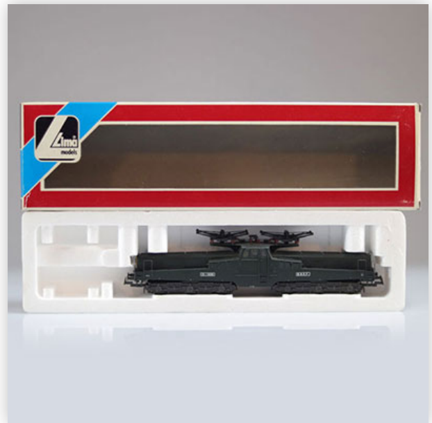
274 Lima locomotive / Reference: 20 8170 LP / Type: CC141100 - CC14129

Référence: GFAB6408 — Poids: 390 g — Sizes: L=220mm — Condition: At first glance - very good condition - no restoration - no repair