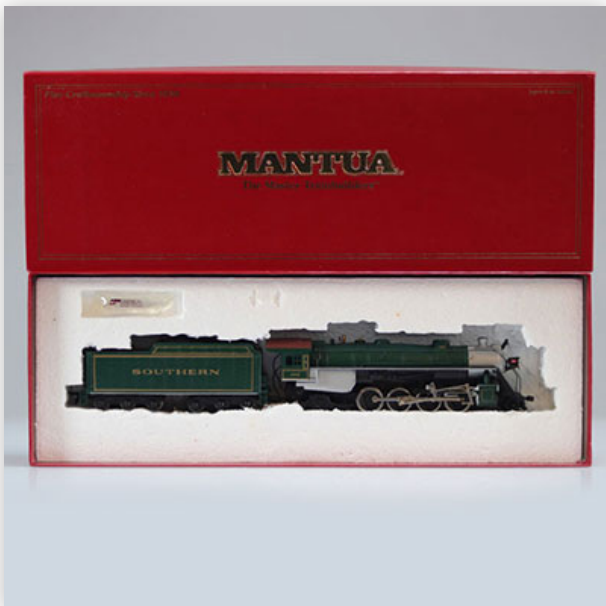
407 Mantua locomotive / Reference: 386 040 / Type: 1.4.14501 (Mikado)

Référence: GFAB6544 — Poids: 891 g — Sizes: L=315mm — Condition: At first glance - very good condition - no restoration - no repair