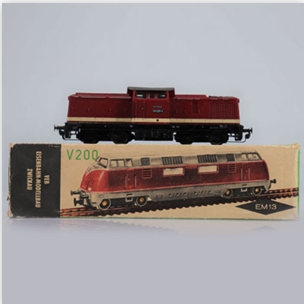
227 VEB Eisenbahn locomotive / Reference: 190 18 R / Type: 110 025-4

Référence: GFAB6361 — Poids: 335 g — Sizes: Avec boîte= H=60mm L=230mm — Condition: At first glance - very good condition - no restoration - no repair