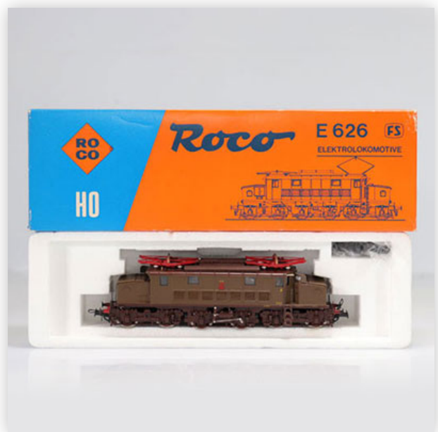
292 Roco locomotive / Reference: 04187A / Type: Electric locomotive E626

Référence: GFAB6426 — Poids: 430 g — Sizes: L=180mm — Condition: At first glance - very good condition - no restoration - no repair