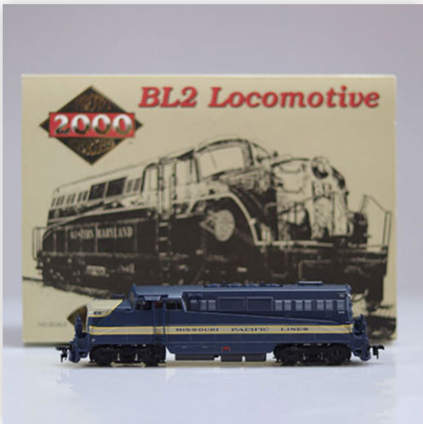
499 Proto series 2000 locomotive / Reference: 8351 / Type: BL2

Référence: GFAB6648 — Poids: 975 g — Sizes: L=205 — Condition: At first glance - very good condition - no restoration - no repair