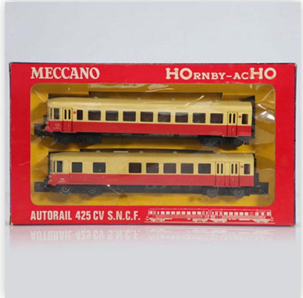
222 AS locomotive / Reference: 6370 / Type: Autorail 424 CV

Référence: GFAB6355 — Poids: 555 g — Sizes: Locomotive L=230mm — Condition: At first glance - good condition - no restoration - no repair