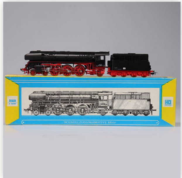
328 Piko locomotive / Reference: 05 6327 / Type: BR01 010503-1

Référence: GFAB6463 — Poids: 680 g — Region: Allemagne — Sizes: H=50mm L=300mm — Condition: At first glance ? good condition - no restoration - no repair