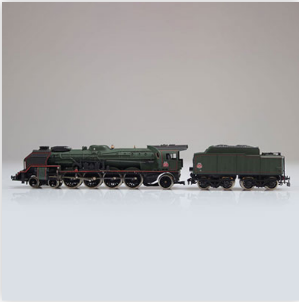
437 Jouef locomotive / Reference: - / Type: steam 4-8-2 #241.p7 Nevers

Référence: GFAB6576 — Poids: 450 g — Sizes: L=320mm — Condition: At first glance - very good condition - no restoration - no repair