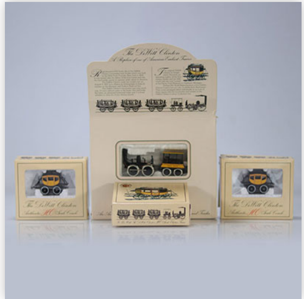
214 Bachmann locomotive / Reference: 41500 / Type: The Dewitt Clinton (1831)...

Référence: GFAB6346 — Poids: 220 g — Region: Amérique — Sizes: Divers — Condition: At first glance - very good condition - no restoration - no repair