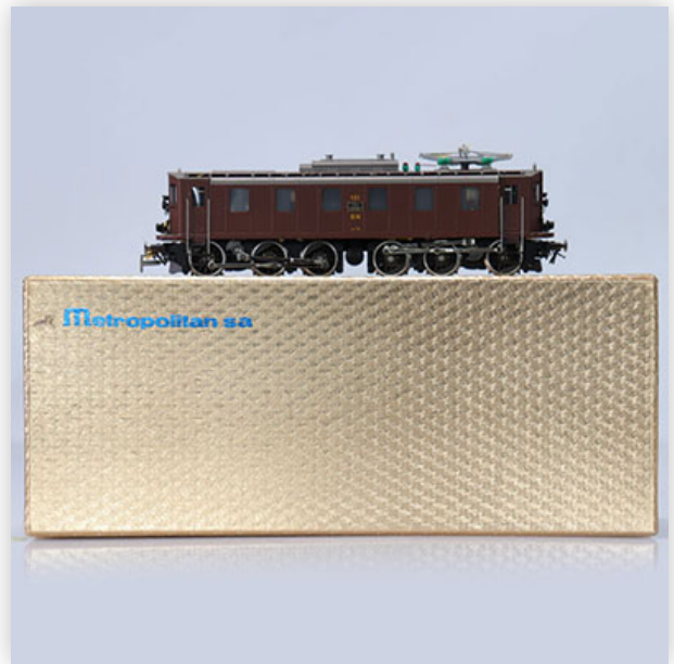
314 Metropolitan locomotive / Reference: 122 / Type: BN CE 6/6 #121

Référence: GFAB6449 — Poids: 760 g — Sizes: Avec boîte= H=70mm L=255mm — Condition: At first glance - very good condition - no restoration - no repair