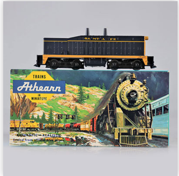
490 Athearn locomotive / Reference: 4030 / Type: Sw7 "Calf"

Référence: GFAB6639 — Poids: 260 g — Region: Amérique — Sizes: H=50mm L=145mm — Condition: At first glance - very good condition - no restoration - no repair