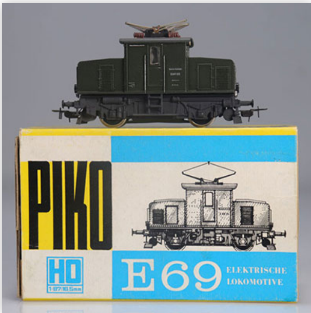
351 Piko locomotive / Reference: 5 6210 / Type: E 69 Elektrische Lokomotive...

Référence: GFAB6486 — Poids: 250 g — Region: Allemagne — Sizes: Avec boîte= H=55mm L=150mm — Condition: At first glance - very good condition - no restoration - no repair