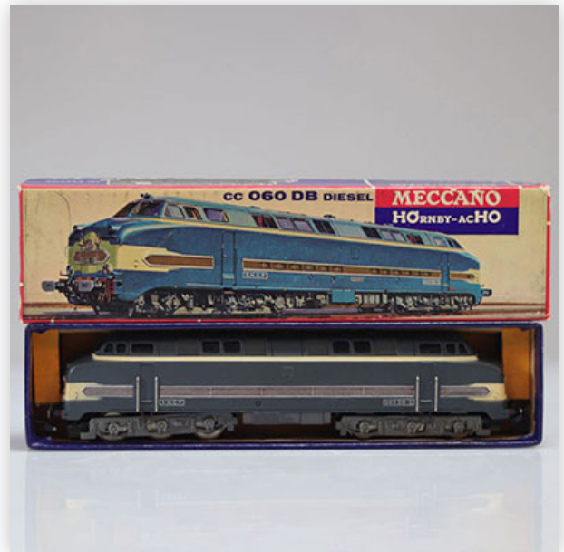
388 Meccano locomotive / Reference: CC 060 dB (Hornby) / Type: CC 060 - 5...

Référence: GFAB6524 — Poids: 611 g — Sizes: L=230mm — Condition: At first glance - very good condition - no restoration - no repair