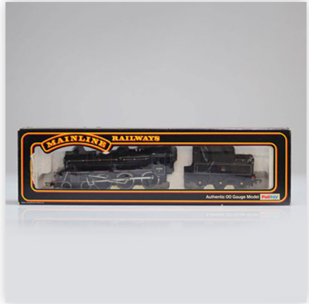
270 Mainline locomotive / Reference: 37052 /75006 / Type: 4-6-0 Standard Class...

Référence: GFAB6404 — Poids: 475 g — Sizes: l=265mm — Condition: At first glance - very good condition - no restoration - no repair