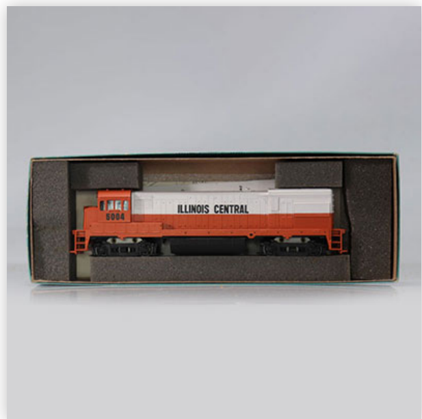
496 Athearn locomotive / Reference: 3442 / Type: U3OB PWR #5004

Référence: GFAB6645 — Poids: 420 g — Region: Amérique — Sizes: Avec boîte= H=40mm L=270mm — Condition: At first glance - very good condition - no restoration - no repair