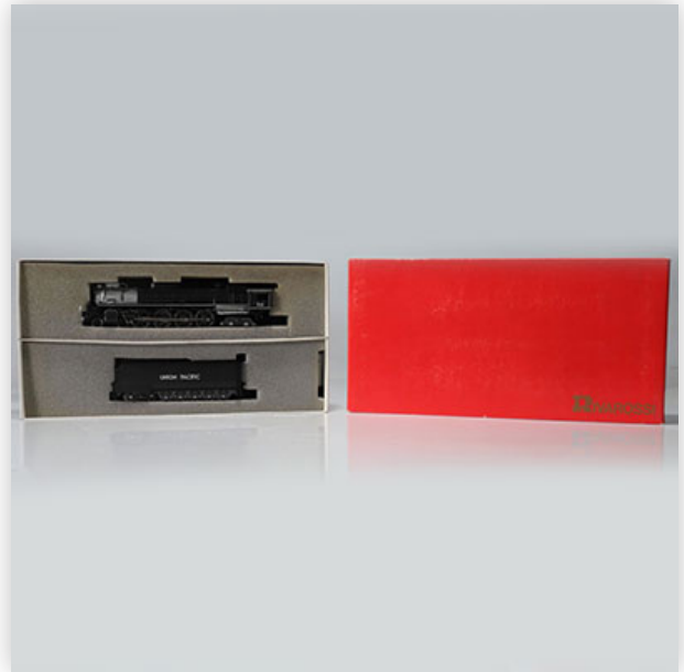
58 Rivarossi locomotive / Reference: 1578 / Type: 4-8-4 FEF 3 #841

Référence: GFAB6182 — Poids: 830 g — Region: Amérique — Sizes: Avec boîte= H=45mm L=380mm — Condition: At first glance - very good condition - no restoration - no repair