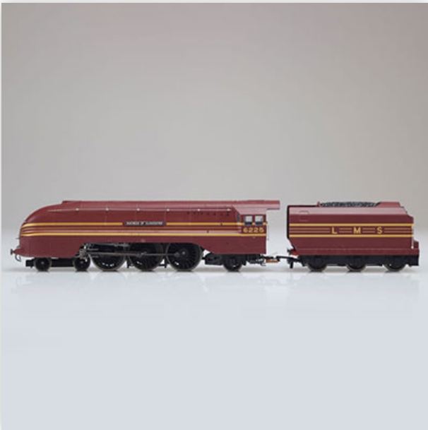
171 Hornby / Reference locomotive:? / Type: steam 4-6-2 Duchess of Gloucester...

Référence: GFAB6298 — Poids: 462 g — Sizes: L=300mm — Condition: At first glance - very good condition - no restoration - no repair