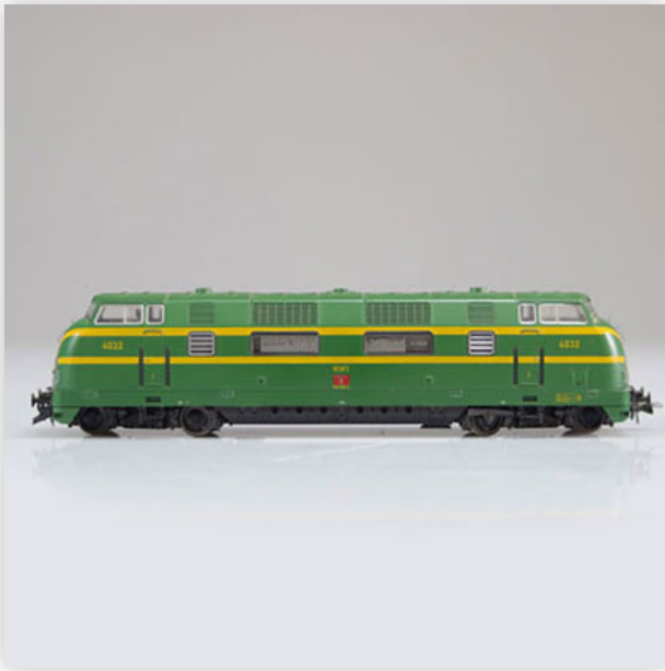
309 Roco locomotive / Reference: - / type: motor 4032 340_032_2

Référence: GFAB6444 — Poids: 600 g — Sizes: L=220mm — Condition: At first glance - very good condition - no restoration - no repair