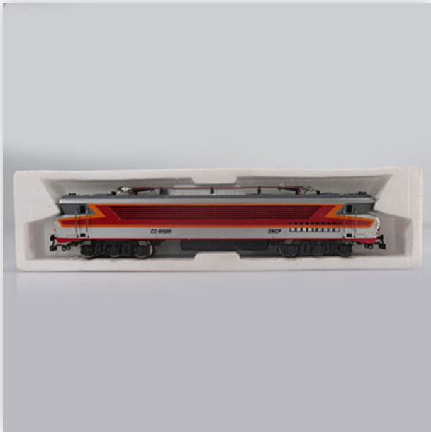
425 Jouef locomotive / Reference: 8435 / Type: CC 6505 Electromotor

Référence: GFAB6564 — Poids: 430 g — Region: France — Sizes: Avec boîte= H=50mm L=280mm — Condition: At first glance - very good condition - no restoration - no repair