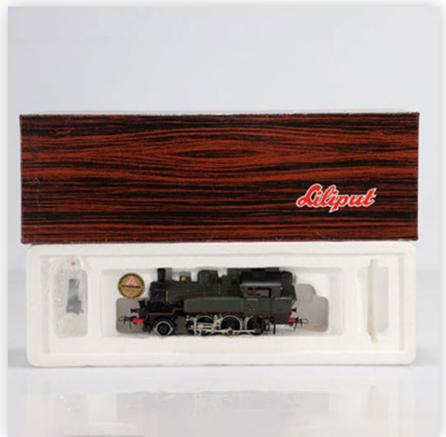
372 Liliput locomotive / Reference: 9172 / Type: 130 / 2.6.0. / 93011

Référence: GFAB6508 — Poids: 250 g — Sizes: L=135mm — Condition: At first glance - very good condition - no restoration - no repair