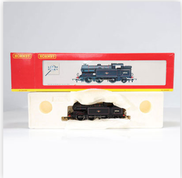
164 Hornby locomotive / Reference: R 2178A / Type: Class 2 64546 / 0.6.2

Référence: GFAB6290 — Poids: 350 g — Sizes: L=150mm — Condition: At first glance - very good condition - no restoration - no repair