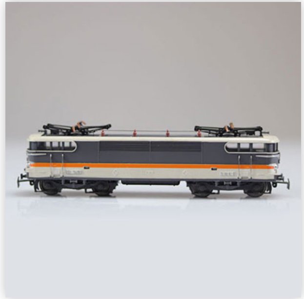
454 Locomotive Model / Reference: - / Type: BB 9281 electric locomotive

Référence: GFAB6603 — Poids: 200 g — Sizes: L=190mm — Condition: At first glance - very good condition - no restoration - no repair