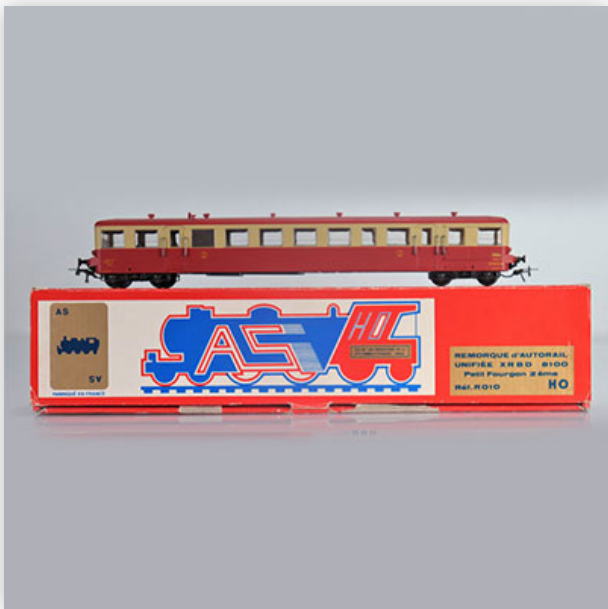
223 AS locomotive / Reference: R010 / Type: Selfrail XRBD 8100

Référence: GFAB6357 — Poids: 220 g — Region: France — Sizes: Avec boite= H=40mm L=300mm — Condition: At first glance - very good condition - no restoration - no repair