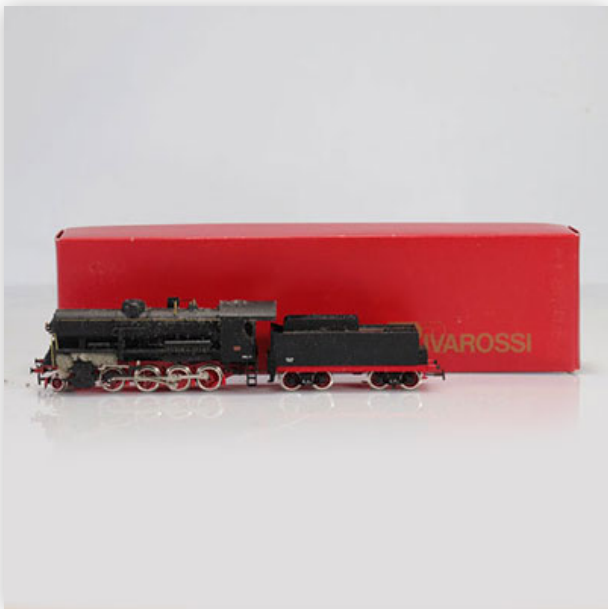
27 Rivarossi locomotive / Reference: 1142 / Type: GR 741 401

Référence: GFAB6151 — Poids: 450 g — Sizes: L=250mm — Condition: At first glance - very good condition - no restoration - no repair