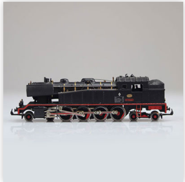
456 Ibertren locomotive / Reference: - / Type: locotender 4-8-4 242-0231 #157

Référence: GFAB6605 — Poids: 336 g — Sizes: L=190mm — Condition: At first glance - very good condition - no restoration - no repair