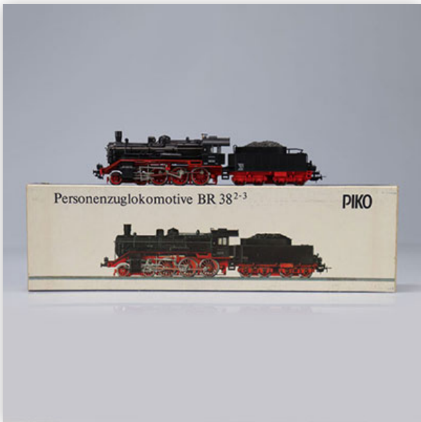
335 Piko locomotive / Reference: 5 6333 / Type: BR38 (2-3) 38234

Référence: GFAB6470 — Poids: 570 g — Region: Allemagne — Sizes: H=500mm L=230mm — Condition: At first glance - very good condition - no restoration - no repair