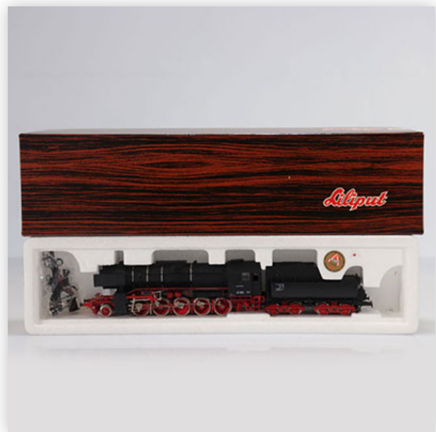
368 Liliput locomotive / Reference: 4203 / Type: 2.10.0 Kriegslokomotive

Référence: GFAB6504 — Poids: 580 g — Sizes: L=275mm — Condition: At first glance - very good condition - no restoration - no repair