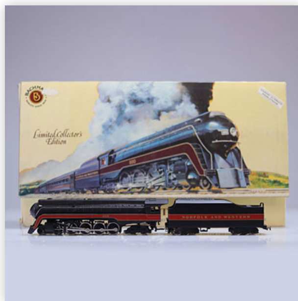
208 Bachmann locomotive / Reference: 41 0658 A4 / Type: 4.8.2 Class J

Référence: GFAB6340 — Poids: 846 g — Sizes: L=360mm — Condition: At first glance - very good condition - no restoration - no repair