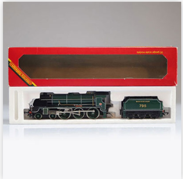
156 Hornby locomotive / Reference: R154 / Type: 2.6.0. Class NR 15 "Sir Dinadan"

Référence: GFAB6282 — Poids: 440 g — Sizes: L=270mm — Condition: At first glance - very good condition - no restoration - no repair