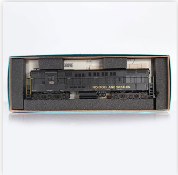
476 Athearn locomotive / Reference: 4310 / Type: Trainmaster PWR (150)

Référence: GFAB6625 — Poids: 490 g — Region: Amérique — Sizes: Avec boîte= H=40mm L=270mm — Condition: At first glance - very good condition - no restoration - no repair