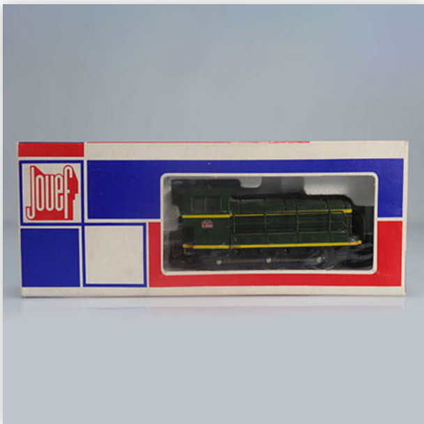
415 Jouef locomotive / Reference: 8503 / Type: C61004 0.6.0

Référence: GFAB6554 — Poids: 220 g — Region: France — Sizes: Avec boîte= H=50mm L=200mm — Condition: At first glance - very good condition - no restoration - no repair