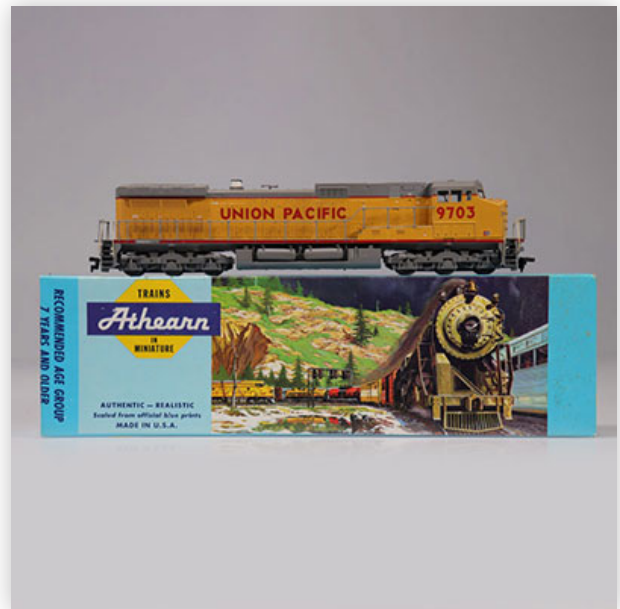
480 Athearn locomotive / Reference: 4910 / Type: C44-9W Power (9703)

Référence: GFAB6629 — Poids: 540 g — Region: Amérique — Sizes: H=50mm L=250mm — Condition: At first glance - very good condition - no restoration - no repair