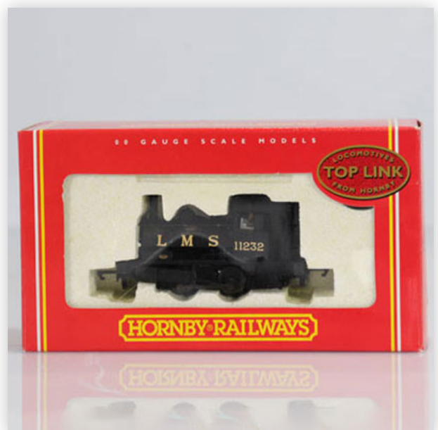
120 Hornby locomotive / Reference: R2065 / Type: 0.4.0 PUG Locomotive 11232

Référence: GFAB6246 — Poids: 170 g — Sizes: L=90mm — Condition: At first glance - very good condition - no restoration - no repair