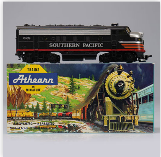
484 Athearn locomotive / Reference: 3241 / Type: F7A Super Power Sp Black...

Référence: GFAB6633 — Poids: 540 g — Region: Amérique — Sizes: H=50mm L=170mm — Condition: At first glance - very good condition - no restoration - no repair