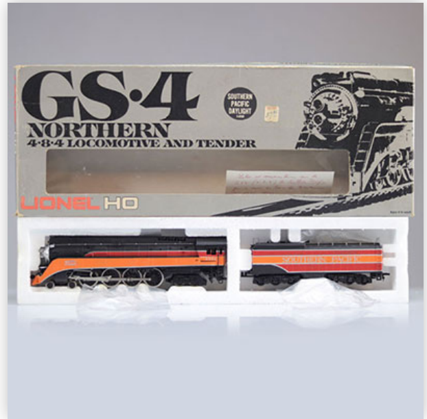
318 Lionel locomotive / Reference: 5 6500 / Type: 4.8.4 GS4 Northern

Référence: GFAB6453 — Poids: 600 g — Sizes: L=370mm