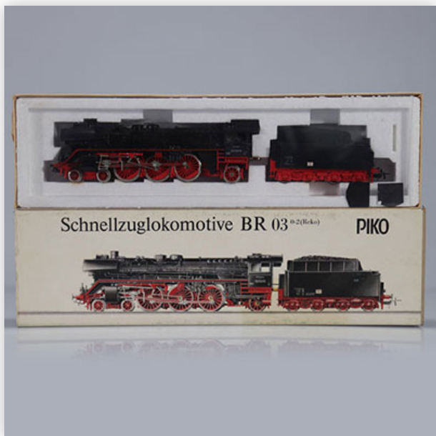
357 Piko locomotive / Reference: 5 6334 / Type: Schnellzuglokomotive BR 03...

Référence: GFAB6492 — Poids: 732 g — Sizes: Locomotive L=290mm — Condition: At first glance - good condition -small piece to be glued