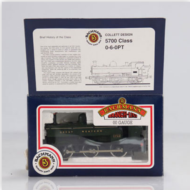
193 Bachmann locomotive / Reference: 31902 /2744 / Type: 5700 Class 0-6-0pt

Référence: GFAB6321 — Poids: 340 g — Sizes: L=115mm — Condition: At first glance - very good condition - no restoration - no repair