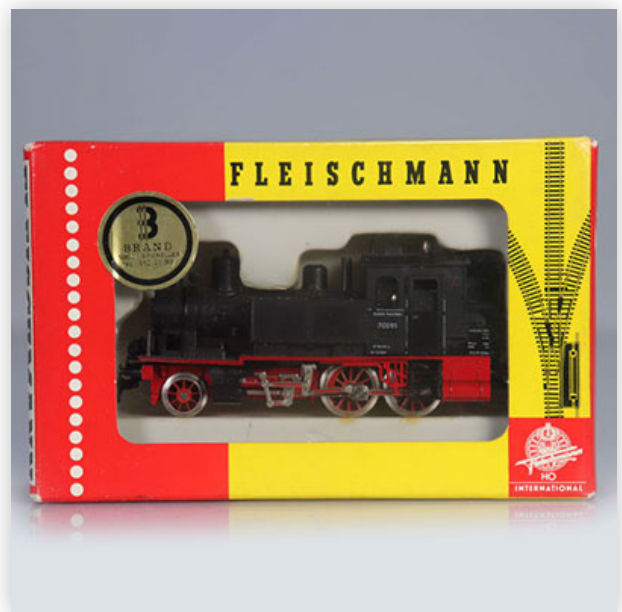
88 Fleischmann locomotive / Reference: 4016 / Type: 1-2-0 / 70091

Référence: GFAB6213 — Poids: 290 g — Region: Allemagne — Sizes: Avec boite= H=45mm L=160mm — Condition: At first glance - very good condition - no restoration - no repair