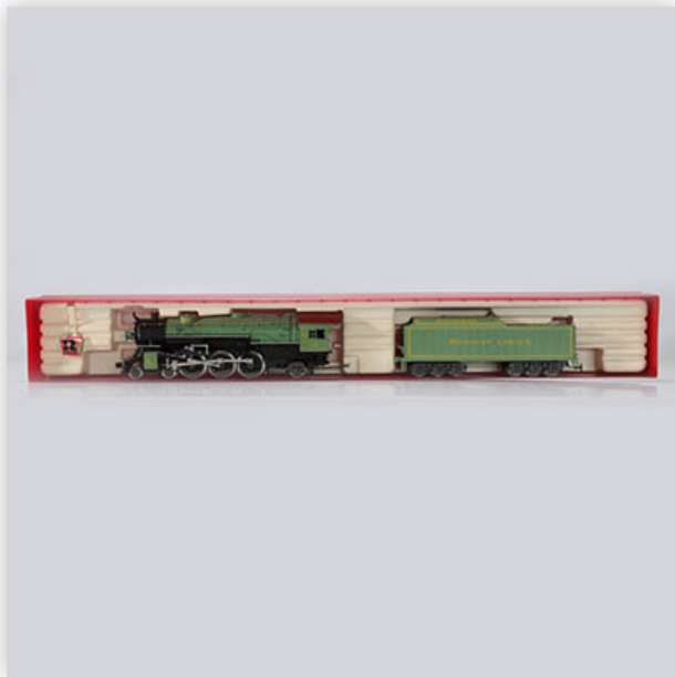
65 Rivarossi locomotive / Reference: 1285 / Type: locomotive 4-6-2 Crescent...

Référence: GFAB6189 — Poids: 710 g — Region: Amérique — Sizes: Avec boîte= H=50mm L=520mm — Condition: At first glance - very good condition - no restoration - no repair