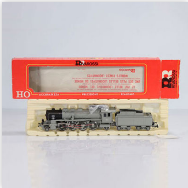
11 Rivarossi locomotive / Reference: 1347 / Type: P10 N 2811

Référence: GFAB6145 — Poids: 400 g — Sizes: L=270mm — Condition: At first glance - very good condition - no restoration - no repair