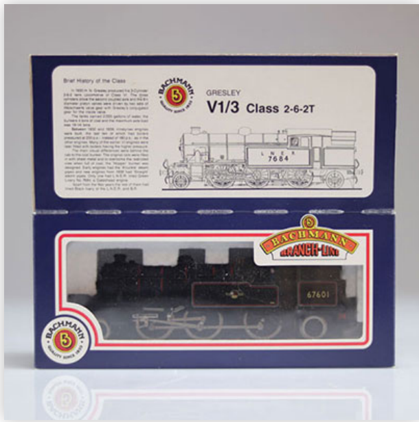
181 Bachmann locomotive / Reference: 31 601/67601 / Type: V1 / 3 Class 2_6_2T

Référence: GFAB6309 — Poids: 380 g — Sizes: L=165mm — Condition: At first glance - very good condition - no restoration - no repair