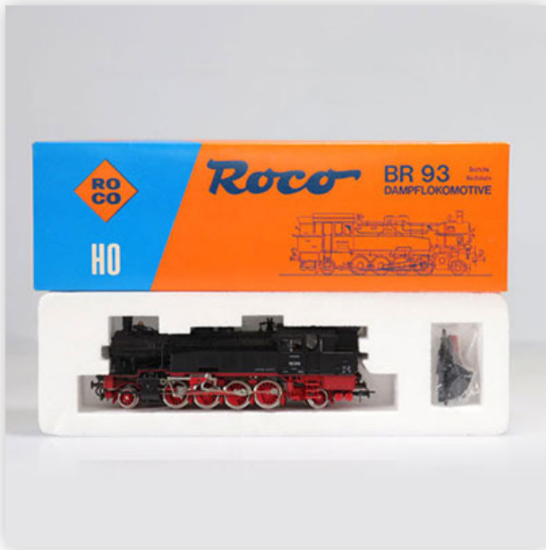
297 Roco locomotive / Reference: 04122A / Type: Steam BR93 / 2.8.2 / 93374

Référence: GFAB6431 — Poids: 400 g — Sizes: L=150mm — Condition: At first glance - very good condition - no restoration - no repair