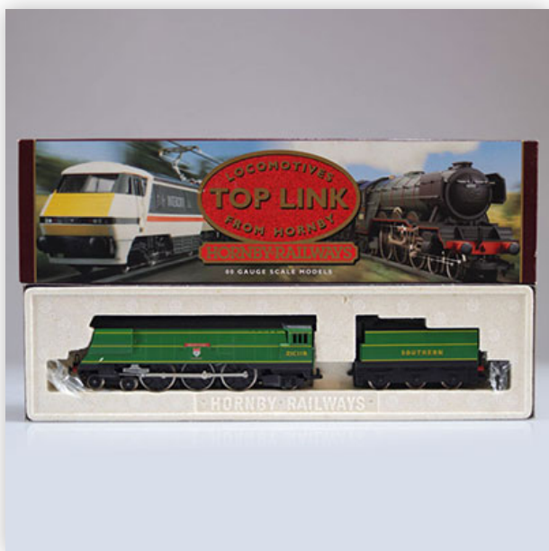
121 Hornby locomotive / Reference: R265 / Type: 4.6.2. Bideford West Country...

Référence: GFAB6247 — Poids: 550 g — Sizes: L=270mm — Condition: At first glance - very good condition - no restoration - no repair