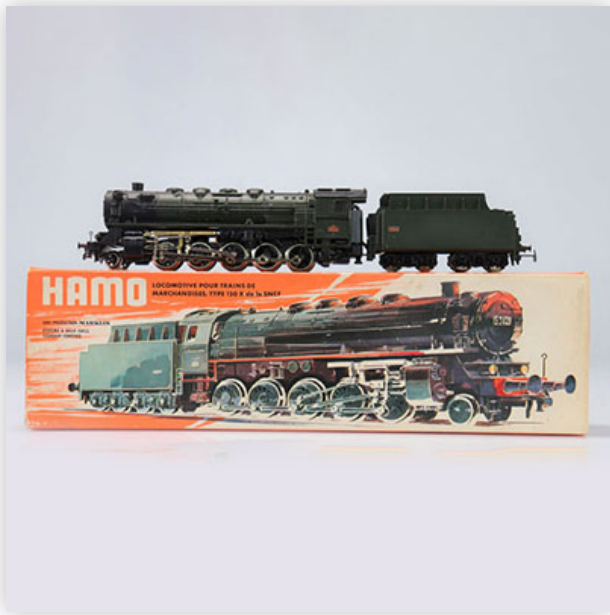
237 Marklin locomotive / Reference: 8346 hamo / Type: 2.10.0

Référence: GFAB6371 — Poids: 790 g — Region: Allemagne — Sizes: Avec boîte= H=55mm L=330mm — Condition: At first glance - very good condition - no restoration - no repair