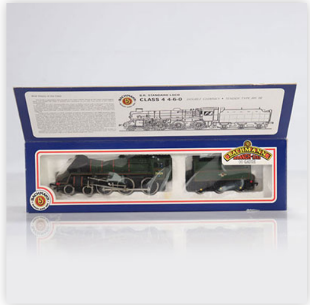
182 Bachmann locomotive / Reference: 31106 // Type: 4_6_0

Référence: GFAB6310 — Poids: 500 g — Sizes: L=260mm — Condition: At first glance - very good condition - no restoration - no repair