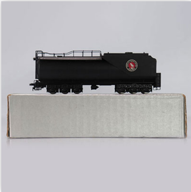
393 Tenshodo locomotive / Reference: T134 / Type: Tender GN 4-8-4

Référence: GFAB6530 — Poids: 350 g — Region: Amérique — Sizes: Avec boîte= H=55mm L=100mm — Condition: At first glance - very good condition - no restoration - no repair