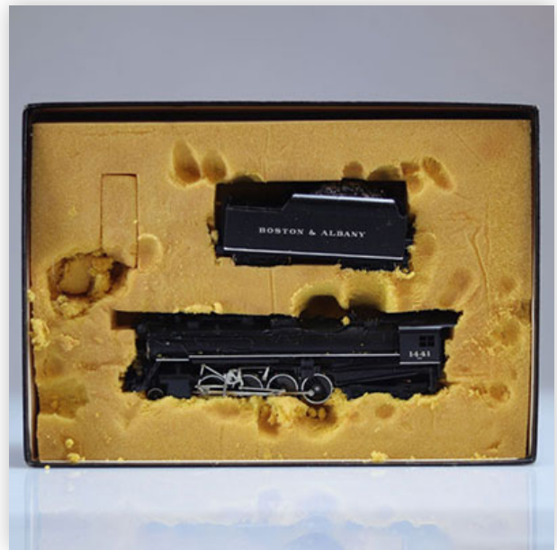
98 Plate Nickel locomotive / Reference: 2796 / Type: 02-08-2004 (brass)

Référence: GFAB6223 — Poids: 1.00 kg — Sizes: L=300mm — Condition: At first glance - very good condition - no restoration - no repair (attention foam)