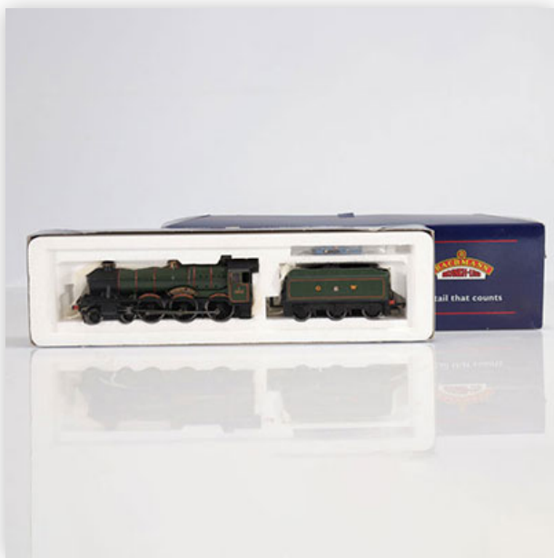
187 Bachmann locomotive / Reference: 31,777/6962 / Type: Modified Hall 4-6-2...

Référence: GFAB6315 — Poids: 460 g — Sizes: L=250mm — Condition: At first glance - very good condition - no restoration - no repair