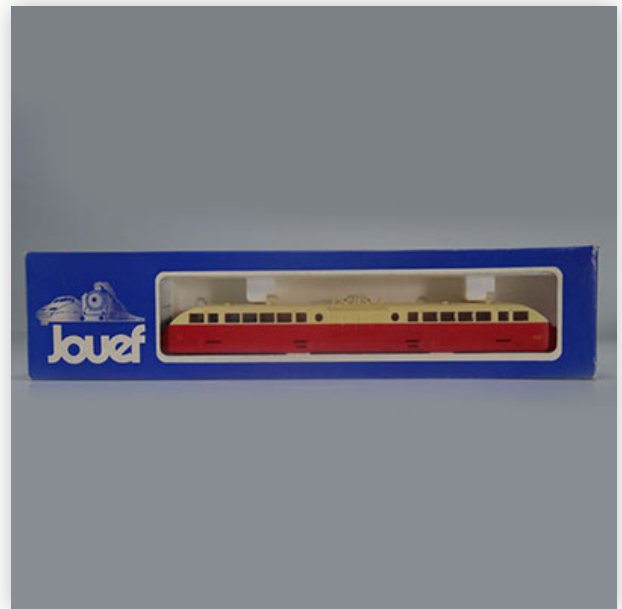
428 Jouef locomotive / Reference: 8602 / Type: Autoraill Bugatti "Batignolles"...

Référence: GFAB6567 — Poids: 315 g — Region: France — Sizes: Avec boîte= H=50mm L=360mm — Condition: At first glance - very good condition - no restoration - no repair