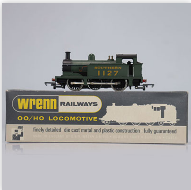
115 Wrenn locomotive / Reference: W2207 / 1127 / Type: 0.6.0 Tank

Référence: GFAB6240 — Poids: 300 g — Region: England — Sizes: Avec boîte= H=45mm L=235mm — Condition: At first glance - very good condition - no restoration - no repair