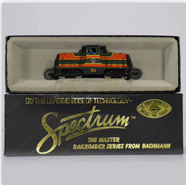
211 Bachmann locomotive / Reference: Spectrum 80011 / Type: GE-44 Ton Switcher...

Référence: GFAB6343 — Poids: 260 g — Region: Amérique — Sizes: Avec boîte= H=50mm L=255mm — Condition: At first glance - very good condition - no restoration - no repair