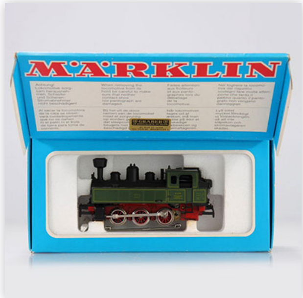
228 Marklin locomotive / Reference: 3087 / Type: 0.6.0

Référence: GFAB6362 — Poids: 300 g — Region: Allemagne — Sizes: Avec boîte= H=55mm L=190mm — Condition: At first glance - very good condition - no restoration - no repair