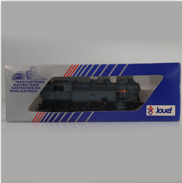
417 Jouef locomotive / Reference: 828900 / Type: 5462 / 2.8.2

Référence: GFAB6556 — Poids: 290 g — Region: France — Sizes: Avec boîte= H=50mm L=245mm — Condition: At first glance - very good condition - no restoration - no repair