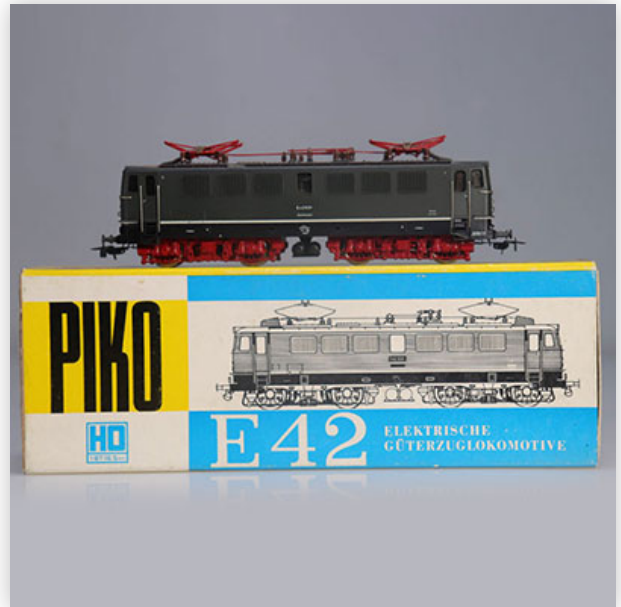
348 Piko locomotive / Reference: 5 6213 / Type: E42 Elektrische Güterzuglokomotive...

Référence: GFAB6483 — Poids: 500 g — Region: Allemagne — Sizes: Avec boite= H=50mm L=260mm — Condition: At first glance - very good condition - no restoration - no repair