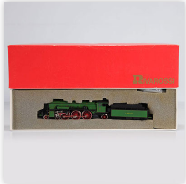
42 Rivarossi locomotive / Reference: 1377 / Type: 4.6.2. / 3634

Référence: GFAB6166 — Poids: 700 g — Sizes: L=265mm — Condition: At first glance - very good condition - no restoration - no repair