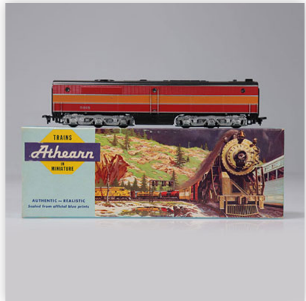
478 Athearn locomotive / Reference: 3366 / Type: 6.98 SP Daylight Alco PB1...

Référence: GFAB6627 — Poids: 450 g — Region: Amérique — Sizes: H=50mm L=210mm — Condition: At first glance - very good condition - no restoration - no repair