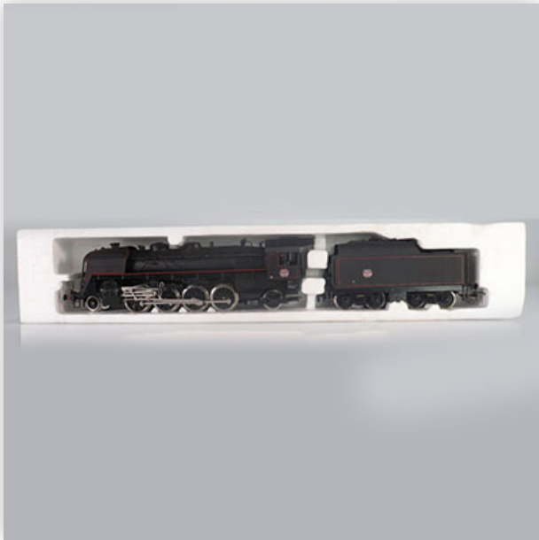
421 Jouef locomotive / Reference: 8273 / Type: 141 Fuel / 141r 1246 Miramas

Référence: GFAB6560 — Poids: 500 g — Region: France — Sizes: Avec boîte= H=50mm L=360mm — Condition: At first glance - very good condition - no restoration - no repair