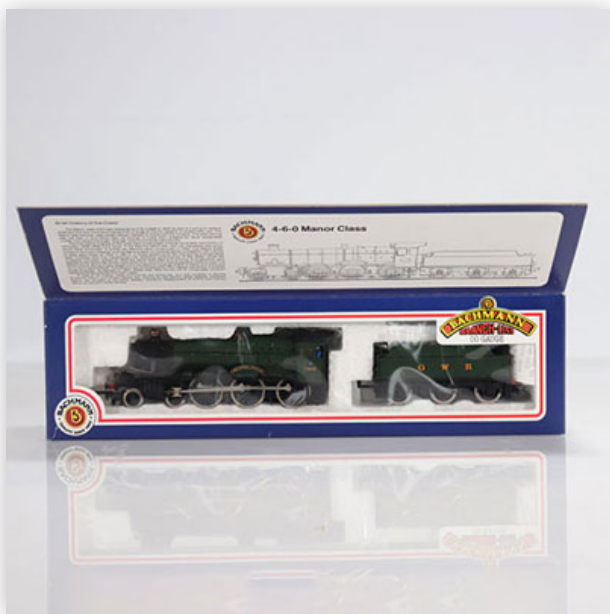
183 Bachmann locomotive / Reference: 31 300/7802 / Type: 4_6_0 Manor Class

Référence: GFAB6311 — Poids: 440 g — Sizes: L=250mm — Condition: At first glance - very good condition - no restoration - no repair