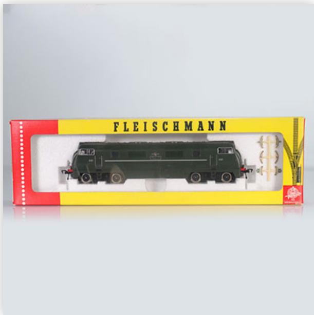
89 Fleischmann locomotive / Reference: 4246 / Type: Warship Diesel D821 Greyhound

Référence: GFAB6214 — Poids: 440 g — Sizes: Avec boîte= H=50mm L=340mm — Condition: At first glance - very good condition - no restoration - no repair