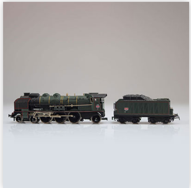
440 Jouef locomotive / Reference: - / Type: steam 4-6-2 #231.k.72 Dijon

Référence: GFAB6580 — Poids: 429 g — Sizes: L=280mm — Condition: At first glance - very good condition - no restoration - no repair