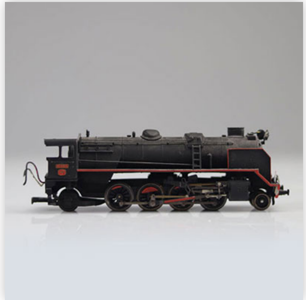
18 Jouef locomotive / Reference: - / Type: steam 2-8-2 #141-2413

Référence: GFAB6579 — Poids: 330 g — Sizes: L=160mm — Condition: Cabin to be glued