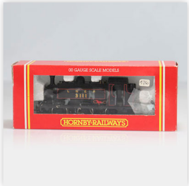
158 Hornby locomotive / Reference: R504 / Type: 0.6.0 OST Loco Class J52 3111

Référence: GFAB6284 — Poids: 230 g — Sizes: L=120mm — Condition: At first glance - very good condition - no restoration - no repair