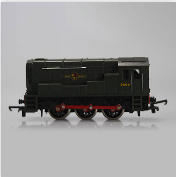
283 Lima locomotive / Reference: - / Type: Autorail W30W

Référence: GFAB6417 — Poids: 265 g — Region: England — Sizes: H=40mm L=175mm — Condition: At first glance - very good condition - no restoration - no repair