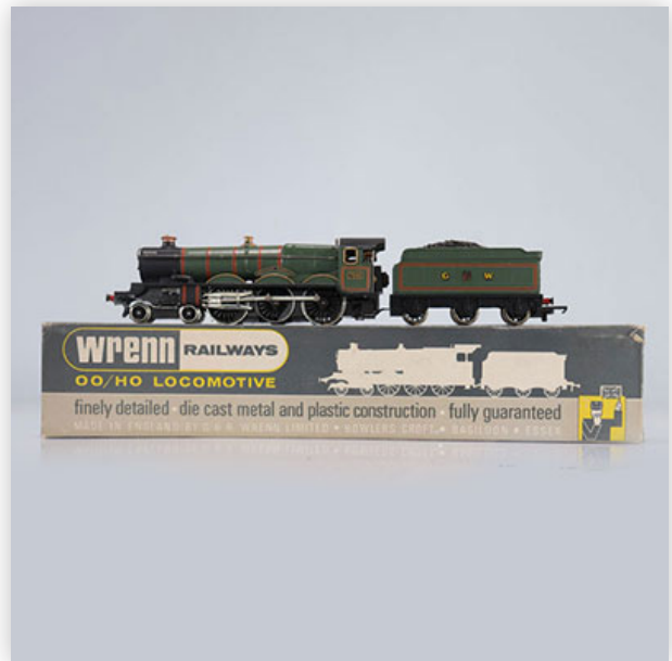
108 Wrenn locomotive / Reference: W2222 / Type: 4.6.0. Devize Castle

Référence: GFAB6233 — Poids: 760 g — Region: England — Sizes: Avec boîte= H=45mm L=355mm — Condition: At first glance - very good condition - no restoration - no repair