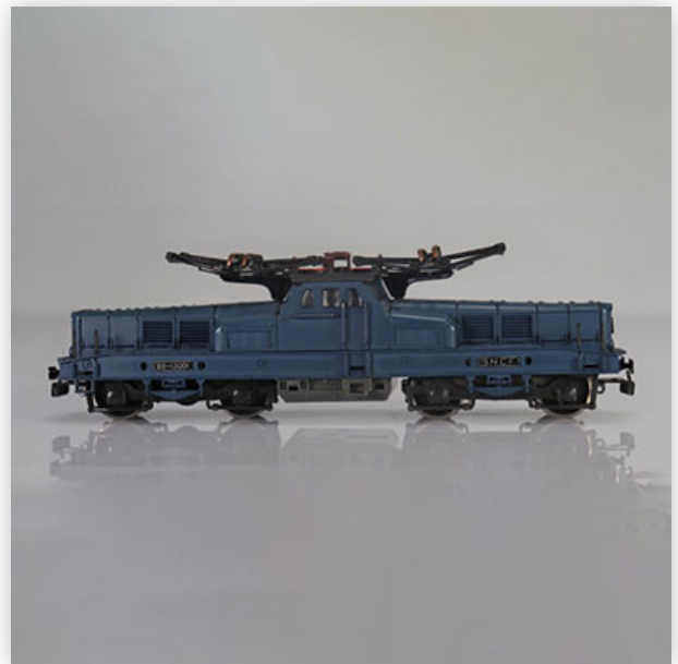
424 Jouef locomotive / Reference: BB1300 / Type: BB-13001 Electromotor

Référence: GFAB6563 — Poids: 220 g — Region: France — Sizes: Avec boîte= H=50mm L=180mm — Condition: At first glance - very good condition - no restoration - no repair