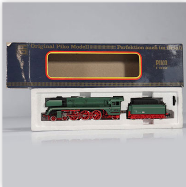
358 Piko locomotive / Reference: 5 6329 / Type: Dampflokomotive Pacific (01504)

Référence: GFAB6493 — Poids: 638 g — Sizes: Locomotive L=300mm — Condition: At first glance - very good condition - no restoration - no repair (2.287 FB in 1990)