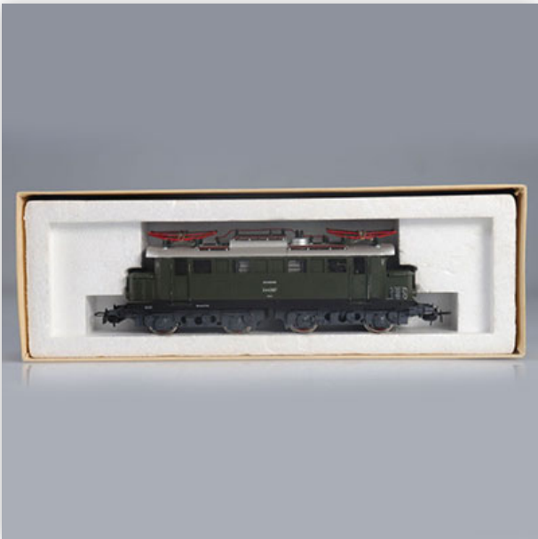
347 Piko locomotive / Reference: 5 6211 / Type: E44 Elektrische Personenzug...

Référence: GFAB6482 — Poids: 420 g — Region: Allemagne — Sizes: Avec boite= H=50mm L=260mm — Condition: At first glance - very good condition - no restoration - no repair