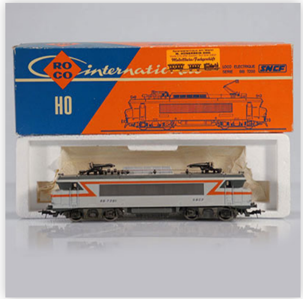
298 Roco locomotive / Reference: 4199 / Type: BB 7200 electric loco

Référence: GFAB6432 — Poids: 460 g — Sizes: Locomotive L=205mm — Condition: At first glance - very good condition - no restoration - no repair