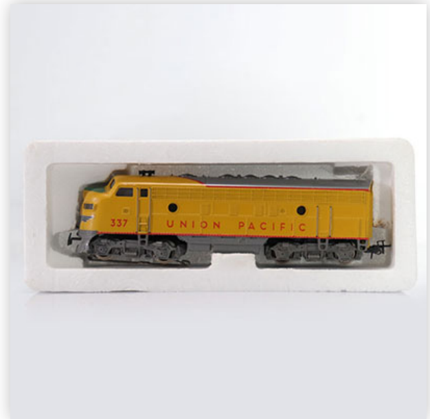
250 Marklin locomotive / Reference: 3061 / Type: Diesel 3061 #337

Référence: GFAB6384 — Poids: 580 g — Region: Amérique — Sizes: Avec boîte= H=50mm L=230mm — Condition: At first glance - very good condition - no restoration - no repair