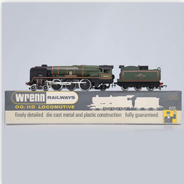
109 Locomotive Wrenn / Reference: W2236 / 34042 / Type: 4.6.2 West Country...

Référence: GFAB6234 — Poids: 795 g — Region: England — Sizes: Avec boîte= H=45mm L=355mm — Condition: At first glance - very good condition - no restoration - no repair