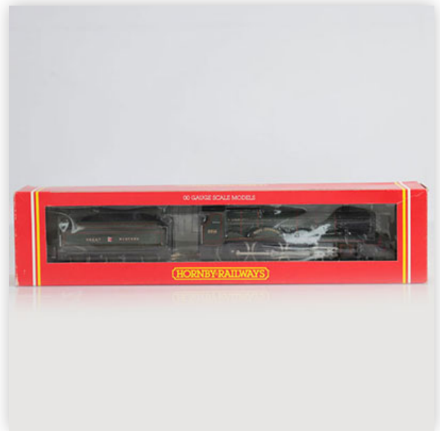
130 Hornby locomotive / Reference: R141 / Type: 4.6.0. Loco Saint Class "Saint..."

Référence: GFAB6256 — Poids: 450 g — Sizes: L=270mm — Condition: At first glance - very good condition - no restoration - no repair