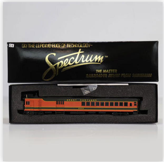
198 Bachmann locomotive / Reference: 81407 Spectrum / Type: Automotor 2320

Référence: GFAB6327 — Poids: 460 g — Sizes: L=250mm — Condition: At first glance - very good condition - no restoration - no repair