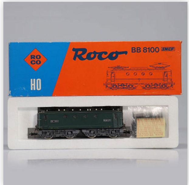
300 Roco locomotive / Reference: HO 04157D / Type: Electric loco BB 8100 (BB...

Référence: GFAB6434 — Poids: 397 g — Sizes: Locomotive L=160mm — Condition: At first glance - good condition - no restoration - no repair