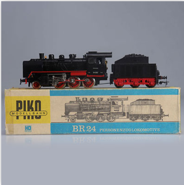
349 Piko locomotive / Reference: 190 10 / Type: BR24 Personenzuglokomotive...

Référence: GFAB6484 — Poids: 355 g — Region: Allemagne — Sizes: Avec la boîte= H=45mm L=230mm — Condition: At first glance - very good condition - no restoration - no repair