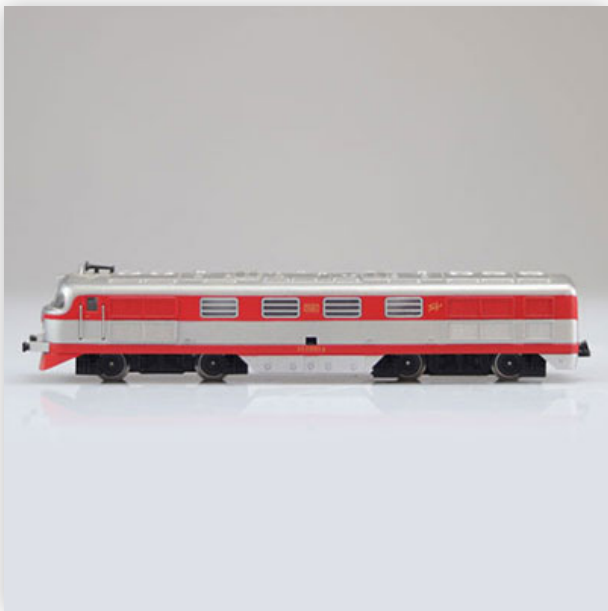
463 Ibertren locomotive / Reference: - / Type: motor 352.0053 #2005t Virgen...

Référence: GFAB6612 — Poids: 370 g — Sizes: L=210mm — Condition: At first glance - very good condition - no restoration - no repair