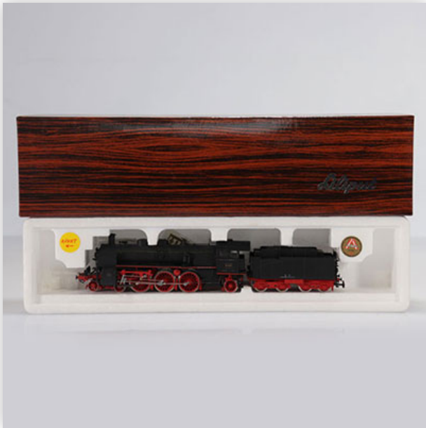
377 Liliput locomotive / Reference: 1802 / Type: Pacific (4.6.2) / 18505

Référence: GFAB6513 — Poids: 526 g — Sizes: L=255mm — Condition: At first glance - very good condition - no restoration - no repair