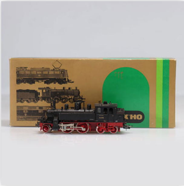
257 Trix locomotive / Reference: 2430 / Type: locotender 2-4-4

Référence: GFAB6391 — Poids: 290 g — Sizes: L=140mm — Condition: At first glance - very good condition - no restoration - no repair