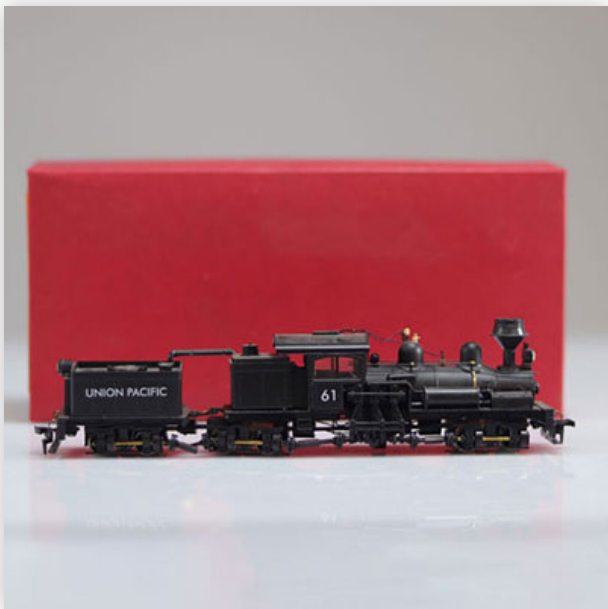
311 Roundhouse locomotive / Reference: 372 / Type: Class C 70-Ton 3-Truck

Référence: GFAB6446 — Poids: 350 g — Sizes: L=210mm — Condition: At first glance - good condition - no restoration - no repair