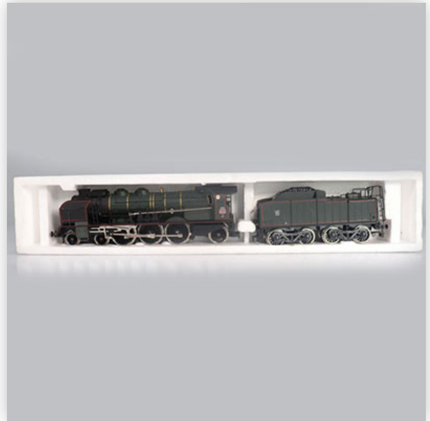
422 Jouef locomotive / Reference: 8355 / Type: Pacific 231K. 82 Calais

Référence: GFAB6561 — Poids: 480 g — Region: France — Sizes: Avec boîte= H=50mm L=360mm — Condition: At first glance - very good condition - no restoration - no repair