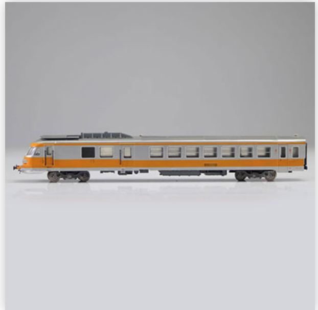
20 Jouef locomotive / Reference: - / Type: motor 2047

Référence: GFAB6583 — Poids: 156 g — Sizes: L=300mm — Condition: At first glance - very good condition - no restoration - no repair