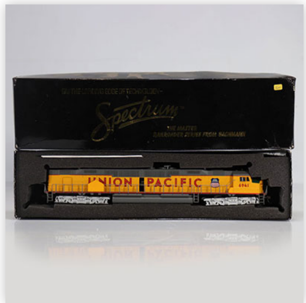
200 Bachmann locomotive / Reference: 81307 / Type: DD40AX 16 Wheel Drive Diesel

Référence: GFAB6329 — Poids: 925 g — Sizes: L=340mm — Condition: At first glance - very good condition - no restoration - no repair