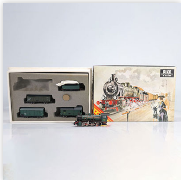
364 Piko locomotive / Reference: 5/0727 / Type: locomotive 0-8-0 # 81340 FHS

Référence: GFAB6500 — Poids: 1.05 kg — Sizes: L=580mm — Condition: At first glance - very good condition - no restoration - no repair