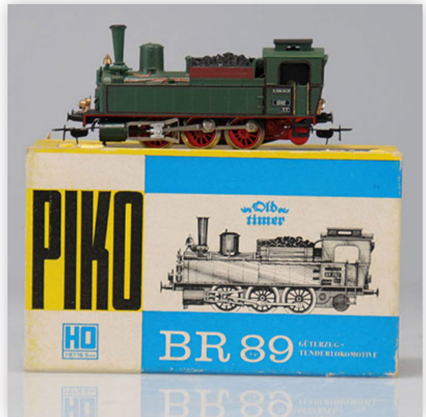
320 Piko locomotive / Reference: 5/6314 / Type: BR89 VT 1592 0.6.0

Référence: GFAB6455 — Poids: 275 g — Region: Allemagne — Sizes: H=45mm L=110mm — Condition: At first glance - very good condition - no restoration - no repair