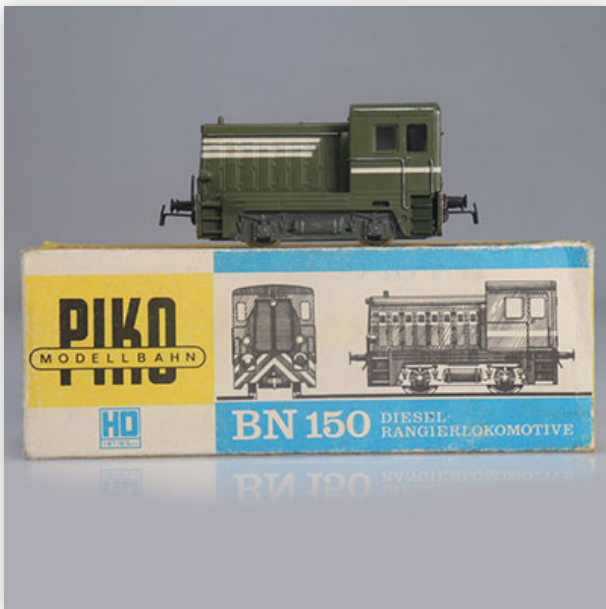
343 Piko locomotive / Reference: BN150 / Type: Electric BN150

Référence: GFAB6478 — Poids: 190 g — Region: Allemagne — Sizes: Avec boite= H=50mm L=165mm — Condition: At first glance ? good condition - no restoration - no repair