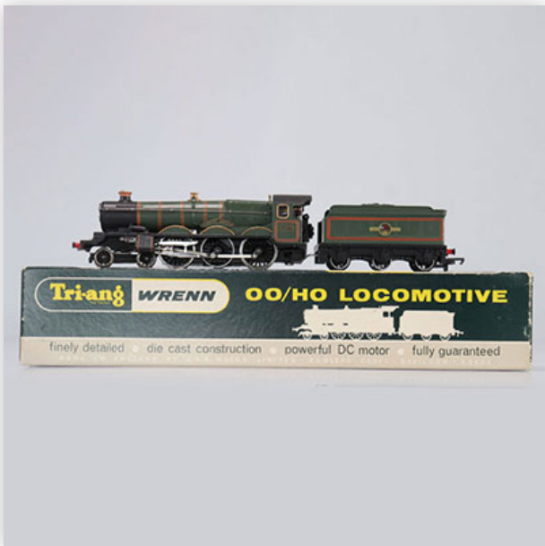
107 Wrenn locomotive / Reference: W2221 / 4075 / Type: Cardiff Castle

Référence: GFAB6232 — Poids: 830 g — Region: England — Sizes: Avec boîte= H=45mm L=355mm — Condition: At first glance - very good condition - no restoration - no repair