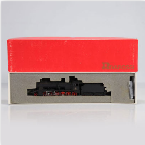
5 Rivarossi locomotive / Reference: 1302 / Type: 2_12

Référence: GFAB6139 — Poids: 600 g — Sizes: L=230mm — Condition: At first glance - very good condition - no restoration - no repair