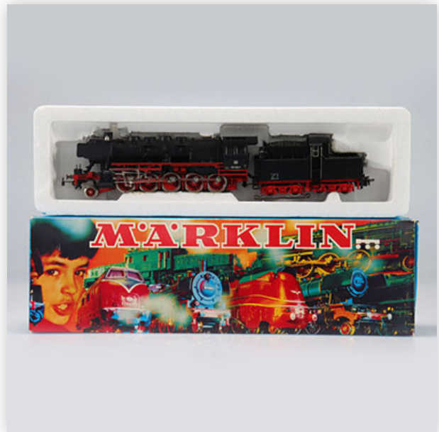
236 Marklin locomotive / Reference: 3084 / Type: 2.10.0

Référence: GFAB6370 — Poids: 630 g — Region: Allemagne — Sizes: Avec boîte= H=60mm L=330mm — Condition: At first glance - very good condition - no restoration - no repair