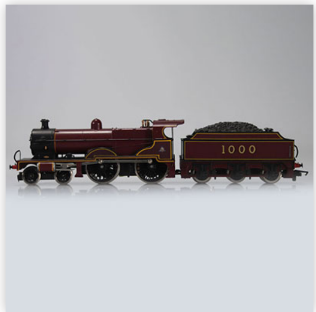
168 Hornby locomotive / Reference: 1000 / Type: Steam 4-4

Référence: GFAB6295 — Poids: 390 g — Region: England — Sizes: H=45mm L=365mm — Condition: At first glance - very good condition - no restoration - no repair