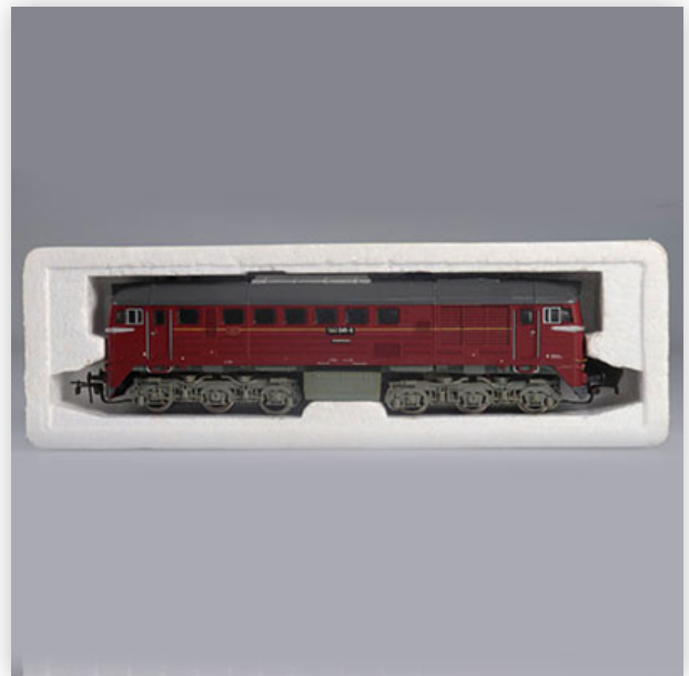
344 Piko locomotive / Reference: 190 21 / Type: BR120 Diesellokomotive

Référence: GFAB6479 — Poids: 420 g — Region: Allemagne — Sizes: Avec boite= H=50mm L=250mm — Condition: Good condition