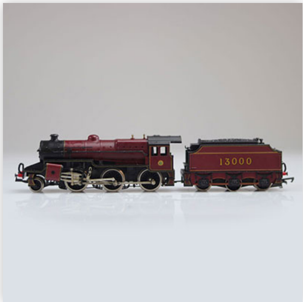
279 Lima locomotive / Reference: - / Type: steam 2-6-0 13000

Référence: GFAB6413 — Poids: 330 g — Sizes: L=250mm — Condition: At first glance - very good condition - no restoration - no repair