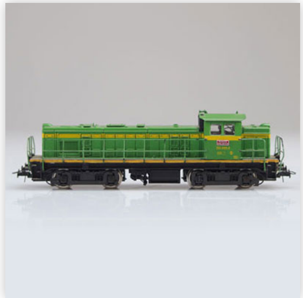
308 Roco locomotive / Reference: - / type: motor 307 004 2

Référence: GFAB6443 — Poids: 300 g — Sizes: L=180mm — Condition: At first glance - very good condition - no restoration - no repair