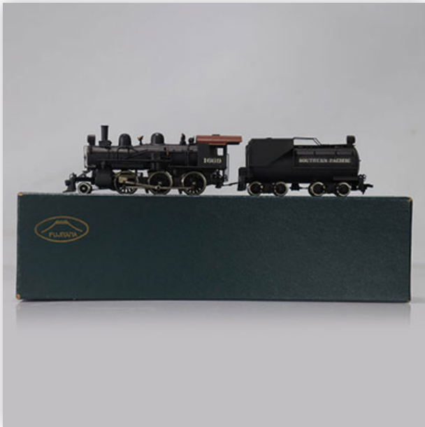
81 Fujiyama locomotive / Reference: 1669 / Type: 2_6_0 #1669

Référence: GFAB6206 — Poids: 530 g — Region: Amérique — Sizes: Avec boîte= H=55mm L=305mm — Condition: At first glance - very good condition - no restoration - no repair