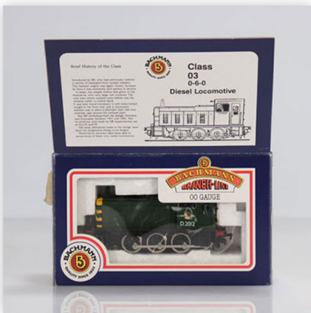
191 Bachmann locomotive / Reference: 31351 / D202 / Type: Class 03 0-6-0...

Référence: GFAB6319 — Poids: 250 g — Sizes: L=110mm — Condition: At first glance - very good condition - no restoration - no repair