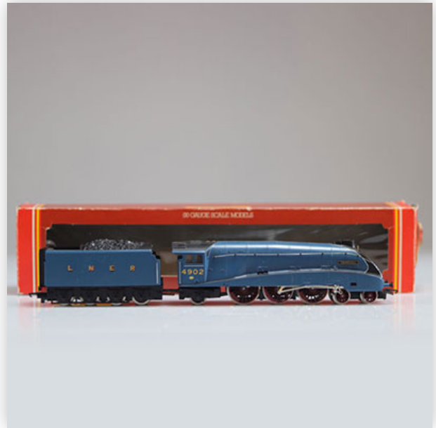
146 Hornby locomotive / Reference: R372 / Type: Class A4 "Seagull" 4902

Référence: GFAB6272 — Poids: 500 g — Sizes: L=300mm — Condition: At first glance - very good condition - no restoration - no repair