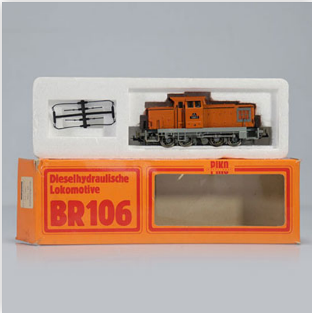
337 Piko locomotive / Reference: 190/95 / Type: Dieselhydraulische Lokomotive...

Référence: GFAB6472 — Poids: 340 g — Sizes: Locomotive L=130mm — Condition: At first glance - very good condition - no restoration - no repair