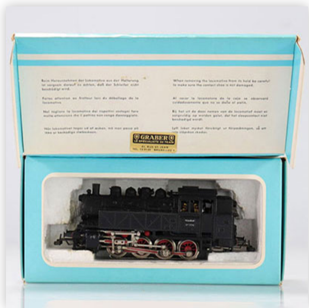
229 Marklin locomotive / Reference: 3031 / Type: series 81

Référence: GFAB6363 — Poids: 470 g — Region: Allemagne — Sizes: Avec boîte= H=50mm L=180mm — Condition: At first glance - very good condition - no restoration - no repair