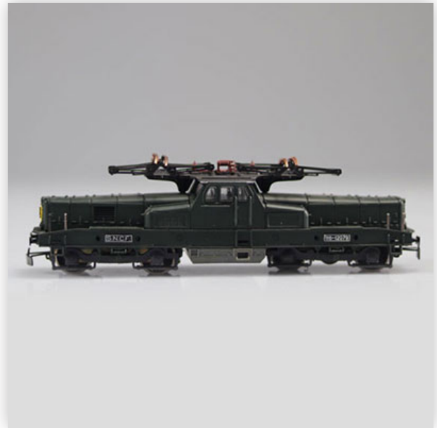
22 Jouef locomotive / Reference: - / Type: ELECTROMOTY B-12079

Référence: GFAB6585 — Poids: 200 g — Sizes: L=175mm — Condition: At first glance - very good condition - no restoration - no repair