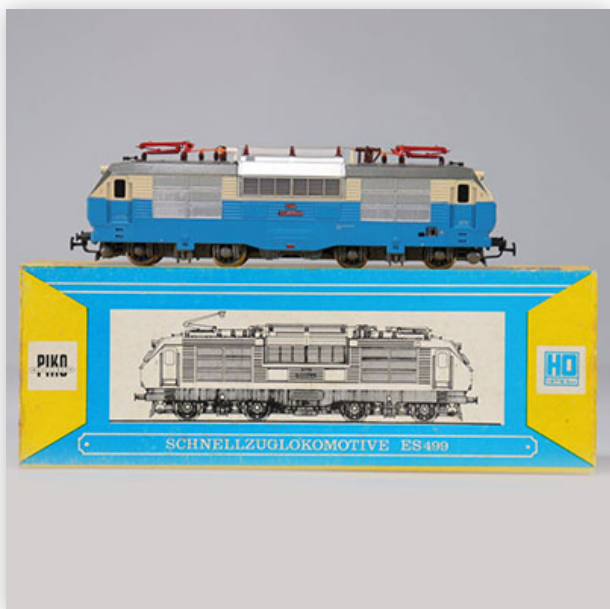
331 Piko locomotive / Reference: 0105-6220 / Type: ES499 Loco Electric

Référence: GFAB6466 — Poids: 500 g — Region: Allemagne — Sizes: H=55mm L=210mm — Condition: At first glance - very good condition - no restoration - no repair