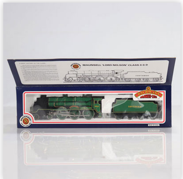
196 Bachmann locomotive / Reference: 31401/864 / Type: Maunsell Lord Nelson...

Référence: GFAB6324 — Poids: 530 g — Sizes: L=290mm — Condition: At first glance - very good condition - no restoration - no repair