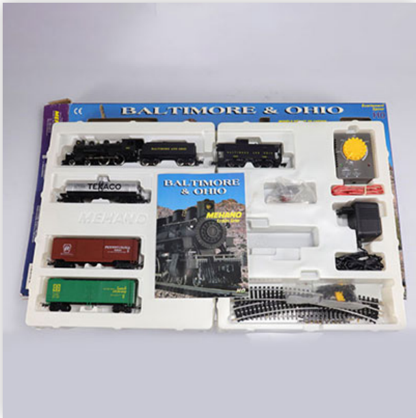
25 Mehano locomotive / Reference: Steam 4-4 #822 / Type: Steam 4-4 #822

Référence: GFAB6663 — Poids: 1.00 kg — Sizes: Divers — Condition: At first glance - very good condition - no restoration - no repair