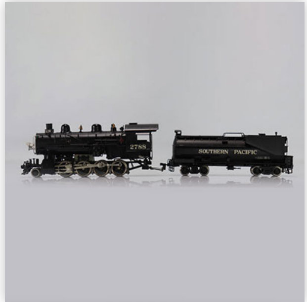
254 Balboa-Katsumi locomotive / Reference: 2788 / Type: Class C9 2-8-0 #2788

Référence: GFAB6388 — Poids: 745 g — Region: Amérique — Sizes: Avec boîte= H=65mm L=220mm — Condition: At first glance - very good condition - no restoration - no repair