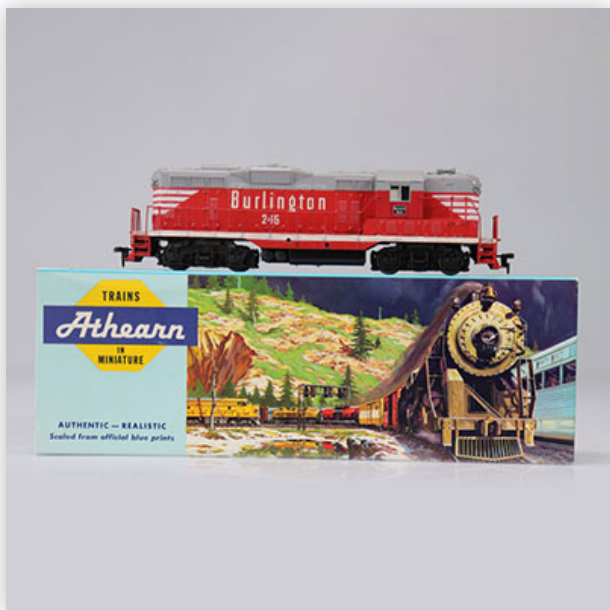
485 Athearn locomotive / Reference: 3155 / Type: GP9 PWR

Référence: GFAB6634 — Poids: 380 g — Region: Amérique — Sizes: H=50mm L=200mm — Condition: At first glance - very good condition - no restoration - no repair