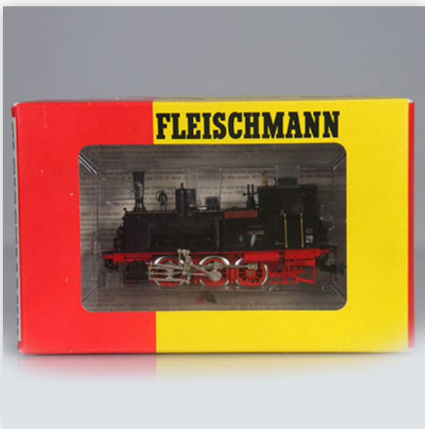
87 Fleischmann locomotive / Reference: 4010 / Type: T3

Référence: GFAB6212 — Poids: 235 g — Region: Allemagne — Sizes: Avec boite= H=50mm L=160mm — Condition: At first glance - very good condition - no restoration - no repair