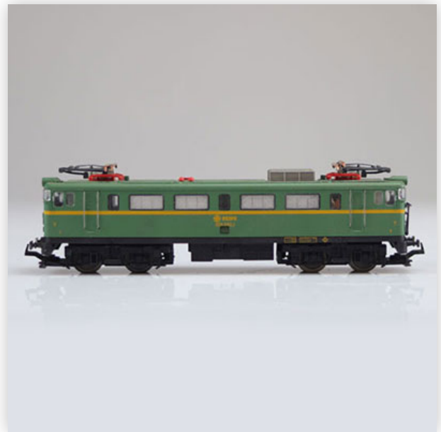
460 Iberian locomotive / Reference: - / Type: motor 269,050.1

Référence: GFAB6609 — Poids: 345 g — Sizes: L=200mm — Condition: At first glance - very good condition - no restoration - no repair