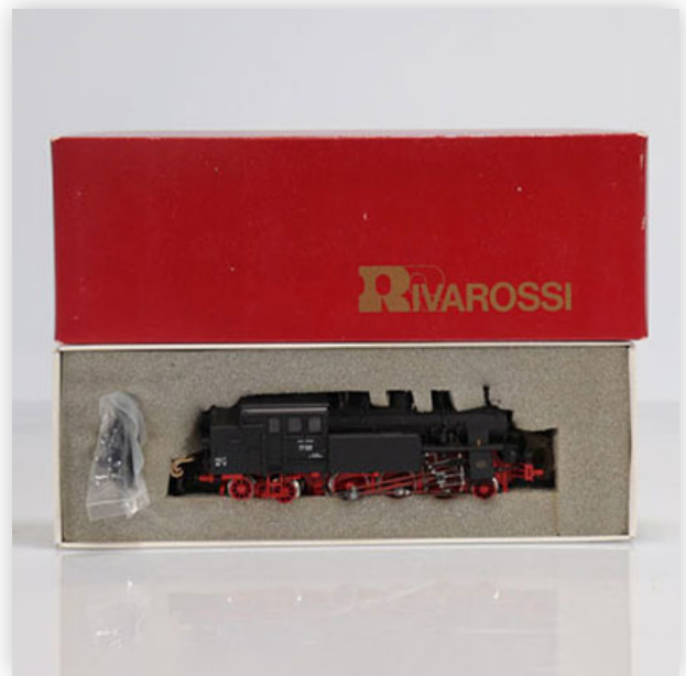
34 Rivarossi locomotive / Reference: 1360 / Type: BR 77122

Référence: GFAB6158 — Poids: 500 g — Sizes: L=155mm — Condition: At first glance - very good condition - no restoration - no repair