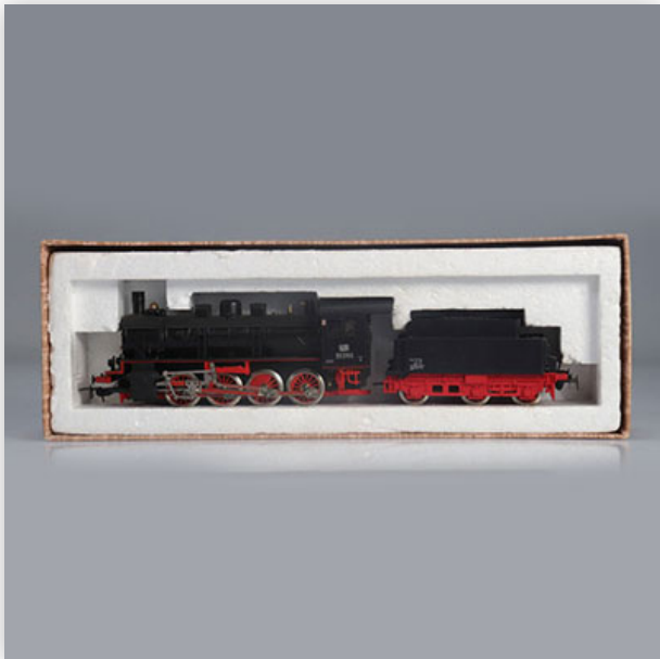
339 Piko locomotive / Reference: 5 637 / Type: BR55 0-8-0 (553763)

Référence: GFAB6474 — Poids: 425 g — Region: Allemagne — Sizes: Avec boîte= H=50mm L=260mm — Condition: At first glance - very good condition - no restoration - no repair