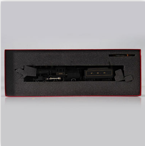
409 Mantua locomotive / Reference: 378_241 / Type: Pennsylvania Atlantic #698

Référence: GFAB6546 — Poids: 825 g — Region: Amérique — Sizes: Avec boîte= H=70mm L=390mm — Condition: At first glance - very good condition - no restoration - no repair