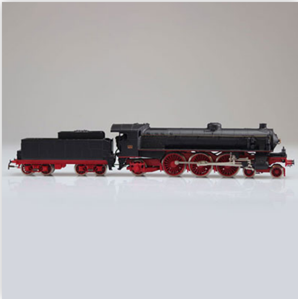
77 Rivarossi locomotive / Reference: - / Type: steam 4-6-2 #691023

Référence: GFAB6202 — Poids: 360 g — Sizes: L=300mm — Condition: At first glance - very good condition - no restoration - no repair