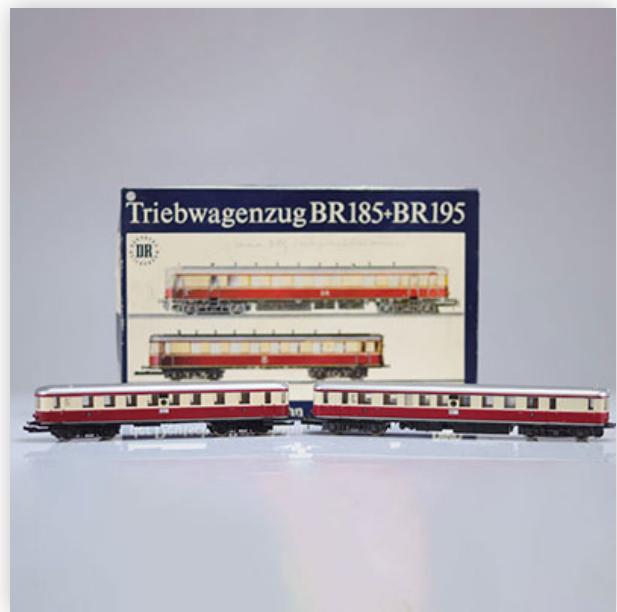
362 Piko locomotive / Reference: 5/0732/011 / Type: Triebwagenzug BR185+BR195...

Référence: GFAB6498 — Poids: 600 g — Sizes: L=460mm — Condition: At first glance - very good condition - no restoration - no repair