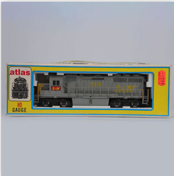
505 Atlas locomotive / Reference: 7035 / Type: GP40 Diesel 7035 (3021)

Référence: GFAB6654 — Poids: 450 g — Region: Amérique — Sizes: Avec boîte= H=45mm L=255mm — Condition: At first glance - very good condition - no restoration - no repair