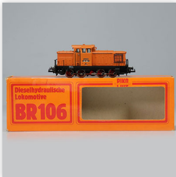
332 Piko locomotive / Reference: 190 2515 / Type: BR106 Dieselhydraulische...

Référence: GFAB6467 — Poids: 310 g — Region: Allemagne — Sizes: H=50mm L=125mm — Condition: At first glance - very good condition - no restoration - no repair