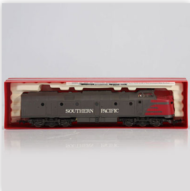
53 Rivarossi locomotive / Reference: 1804 / Type: Diesel km

Référence: GFAB6177 — Poids: 540 g — Sizes: Locomotive L=245mm — Condition: At first glance - very good condition - no restoration - no repair