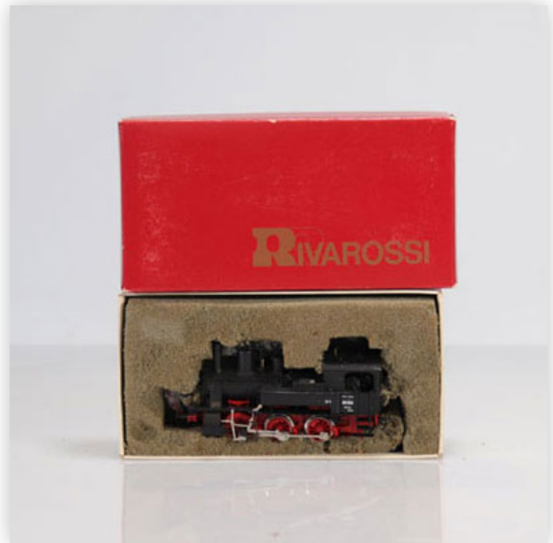
8 Rivarossi locomotive / Reference: 1357-1 / Type: 89656

Référence: GFAB6142 — Poids: 250 g — Sizes: L=120mm — Condition: At first glance - very good condition - no restoration - no repair