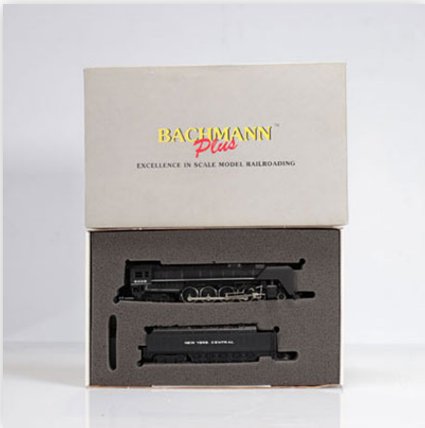
203 Bachmann locomotive / Reference: 11305 (B+) / Type: Niagara 4-8-4 New...

Référence: GFAB6332 — Poids: 950 g — Sizes: H=390mm — Condition: At first glance - very good condition - no restoration - no repair