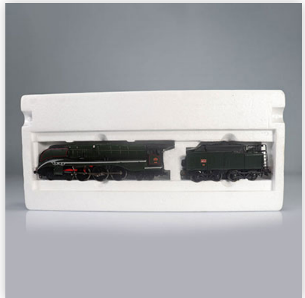
416 Jouef locomotive / Reference: 8249 / Type: 232U

Référence: GFAB6555 — Poids: 665 g — Region: France — Sizes: Avec boîte= H=50mm L=360mm — Condition: At first glance - very good condition - no restoration - no repair