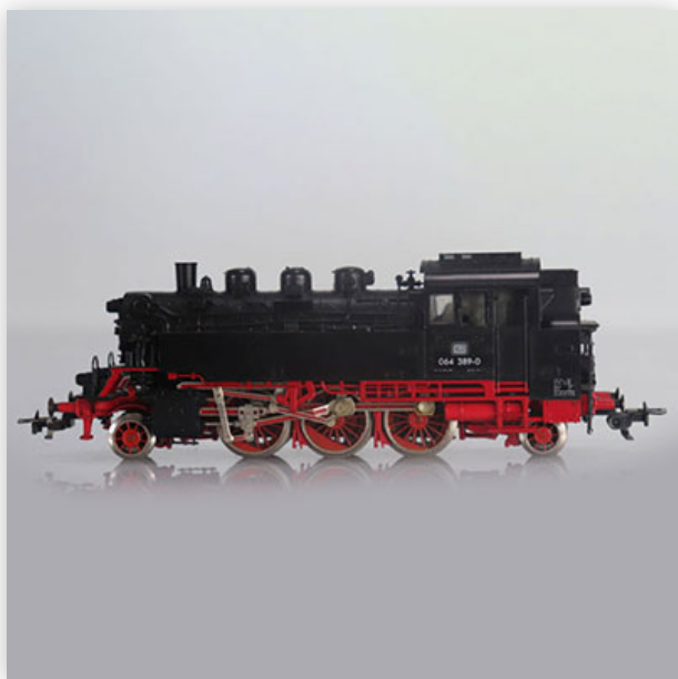
91 Fleischmann locomotive / Reference: 4064 / Type: 2-6-2 064 389-0

Référence: GFAB6216 — Poids: 375 g — Region: Allemagne — Sizes: Avec boîte= H=55mm L=165mm — Condition: At first glance - good condition - no restoration - no repair