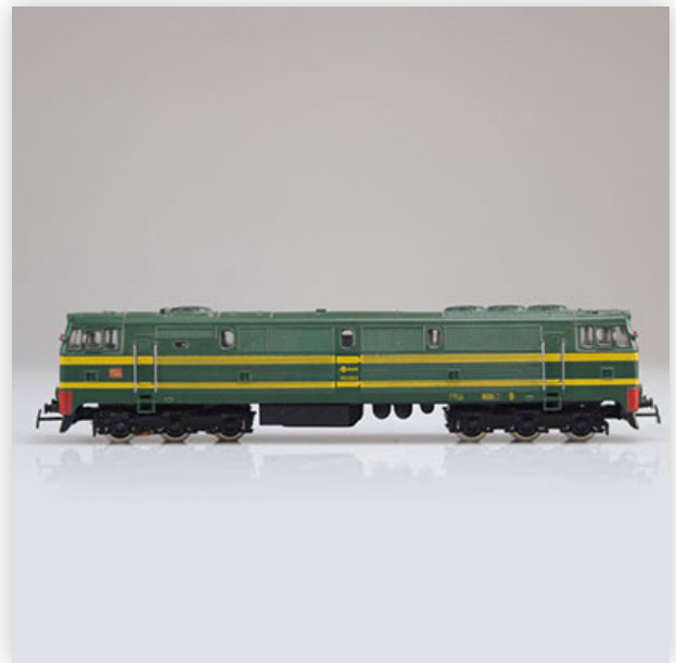
464 Ibertren locomotive / Reference: Electroren / Type: Motor 333.083.44

Référence: GFAB6613 — Poids: 500 g — Sizes: L=240mm — Condition: At first glance - very good condition - no restoration - no repair