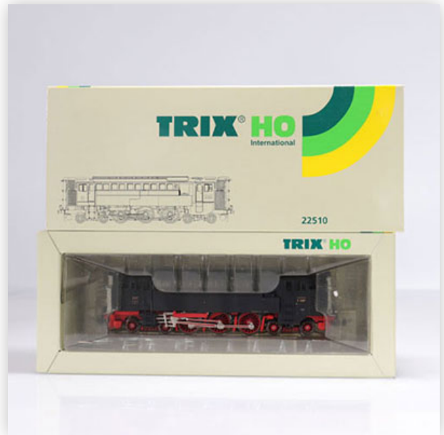
260 Trix locomotive / Reference: 22510 / Type: DRG Dieselmotortrieblokomotive V 3201

Référence: GFAB6394 — Poids: 620 g — Sizes: L=170mm — Condition: At first glance - very good condition - no restoration - no repair