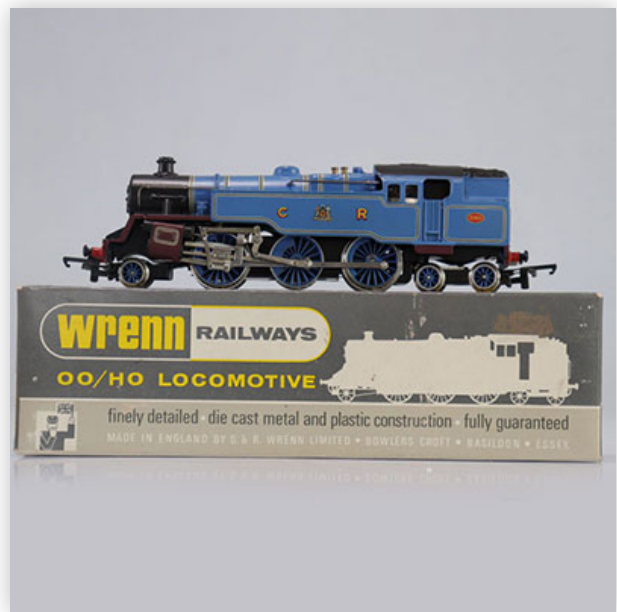
114 Wrenn locomotive / Reference: W2246 / 2085 / Type: 2-6-4 Tank

Référence: GFAB6239 — Poids: 600 g — Region: England — Sizes: Avec boîte= H=45mm L=230mm — Condition: At first glance - very good condition - no restoration - no repair