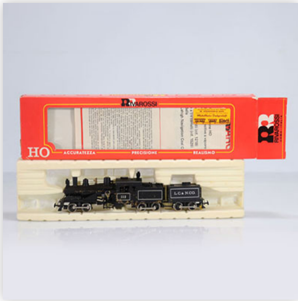
45 Rivarossi locomotive / Reference: 1529 / Type: Heisler Articulated 112

Référence: GFAB6169 — Poids: 400 g — Sizes: L=220mm — Condition: Middle (foam)