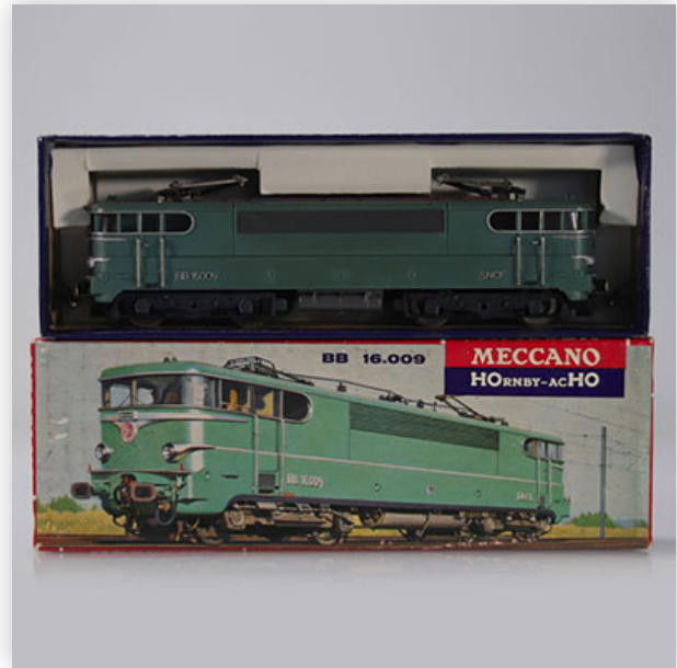
390 Meccano locomotive / Reference: 6380 / Type: BB16009

Référence: GFAB6526 — Poids: 475 g — Region: France — Sizes: Avec boîte= H=45mm L=215mm — Condition: At first glance - very good condition - no restoration - no repair