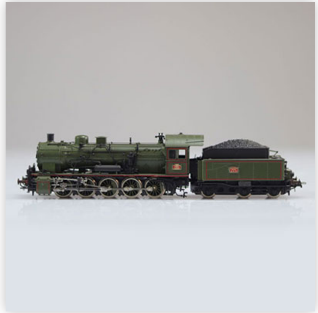
306 Roco locomotive / Reference: - / Type: steam 0-10-0 #050B70 ALES

Référence: GFAB6441 — Poids: 500 g — Sizes: L=220mm — Condition: At first glance - very good condition - no restoration - no repair