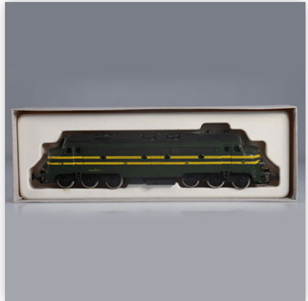
340 Piko locomotive / Reference: 5,6001 / Type: M61 Dieselelectric (204001)

Référence: GFAB6475 — Poids: 550 g — Region: Belgique — Sizes: Avec boîte= H=50mm L=260mm — Condition: At first glance - very good condition - no restoration - no repair