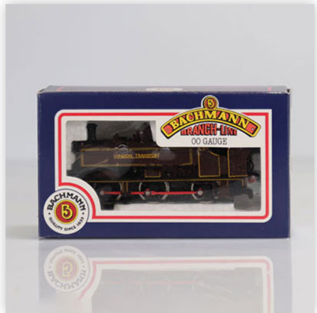
190 Bachmann locomotive / Reference: 30201 / Type: London Transport 0-6-0

Référence: GFAB6318 — Poids: 330 g — Sizes: L=120mm — Condition: At first glance - very good condition - no restoration - no repair