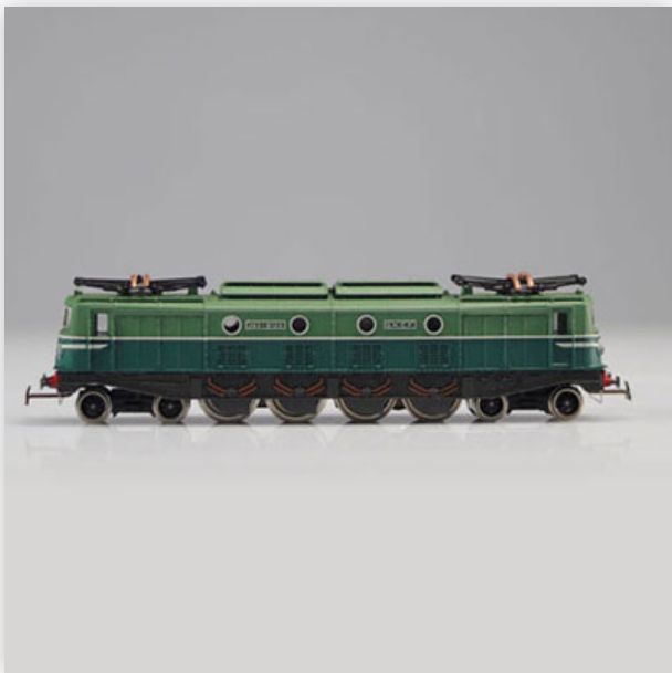
23 Jouef locomotive / Reference: - / Type: 2D2-9120 electromotor

Référence: GFAB6587 — Poids: 350 g — Sizes: L=200mm — Condition: At first glance - very good condition - no restoration - no repair