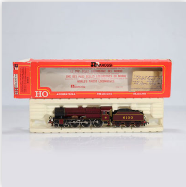
1 Rivarossi locomotive / Reference: 1348 / Type: 4_6_0

Référence: GFAB6135 — Poids: 460 g — Sizes: L=245mm — Condition: At first glance - very good condition - no restoration - no repair