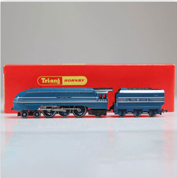
127 Hornby locomotive / Reference: R864 / Type: 4.6.2 Coronation "Queen Mary"...

Référence: GFAB6253 — Poids: 600 g — Sizes: L=290mm — Condition: At first glance - very good condition - no restoration - no repair