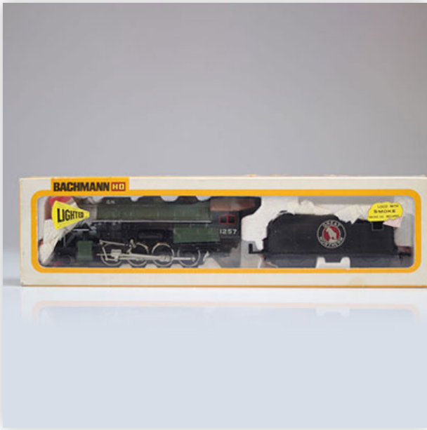
201 Bachmann locomotive / Reference: 654 / Type: 2.8.0. Consolidation Class...

Référence: GFAB6330 — Poids: 470 g — Sizes: L=260mm — Condition: At first glance - very good condition - no restoration - no repair