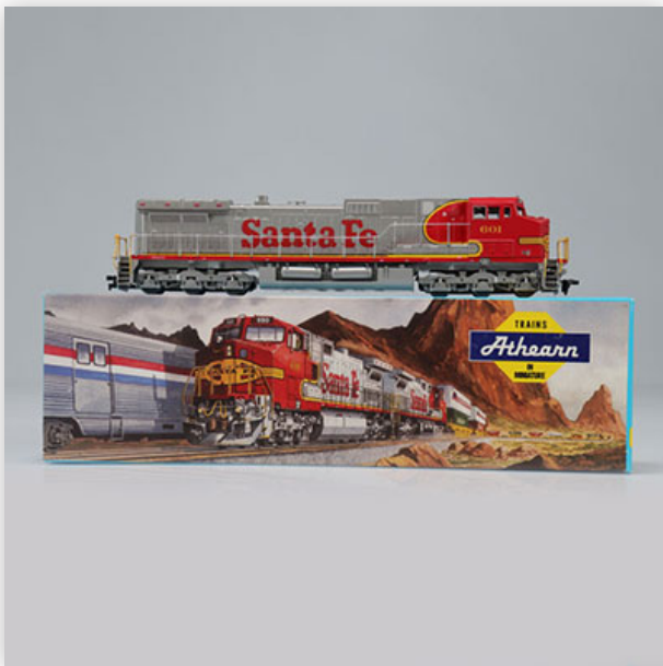
479 Athearn locomotive / Reference: 4902 / Type: C44-9W Power (601)

Référence: GFAB6628 — Poids: 530 g — Region: Amérique — Sizes: H=55mm L=250mm — Condition: At first glance - very good condition - no restoration - no repair