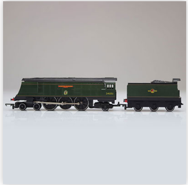
170 Hornby / Reference locomotive:? / Type: steam 4-6-2 Winston Churchill...

Référence: GFAB6297 — Poids: 380 g — Sizes: L=270mm — Condition: At first glance - very good condition - no restoration - no repair