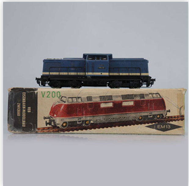
226 VEB Eisenbahn locomotive / Reference: 190 18 B / Type: V100 001

Référence: GFAB6360 — Poids: 330 g — Region: Allemagne — Sizes: Avec boîte= H=50mm L=230mm — Condition: At first glance - very good condition - no restoration - no repair