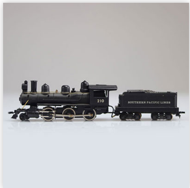
412 Mantua locomotive / Reference: - / Type: 2-6-0 #210

Référence: GFAB6550 — Poids: 370 g — Sizes: L=220mm — Condition: At first glance - very good condition - no restoration - no repair