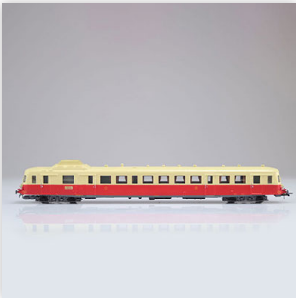
307 Roco locomotive / Reference: - / Type: Selfrail XABD2853 Bordeaux-Limoges

Référence: GFAB6442 — Poids: 288 g — Sizes: L=330mm — Condition: At first glance - very good condition - no restoration - no repair