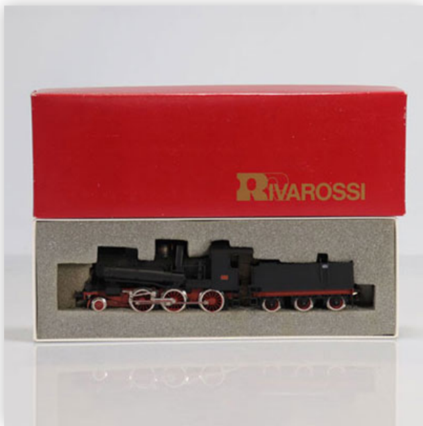
33 Rivarossi locomotive / Reference: 1169 / Type: GR 623 021

Référence: GFAB6157 — Poids: 400 g — Sizes: L=210mm — Condition: At first glance - very good condition - no restoration - no repair