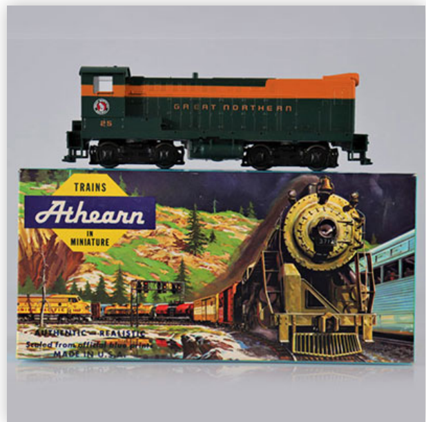
494 Athearn locomotive / Reference: 3704 / Type: Baldwin Switcher S-12 PWR...

Référence: GFAB6643 — Poids: 270 g — Region: Amérique — Sizes: H=45mm L=150mm — Condition: At first glance - very good condition - no restoration - no repair