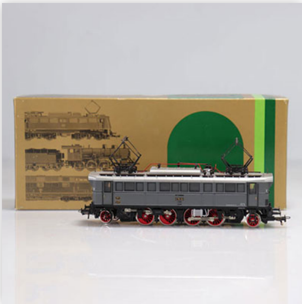
259 Trix locomotive / Reference: 2432 / Type: Elektrotrein E7502

Référence: GFAB6393 — Poids: 550 g — Sizes: L=180mm — Condition: At first glance - very good condition - no restoration - no repair