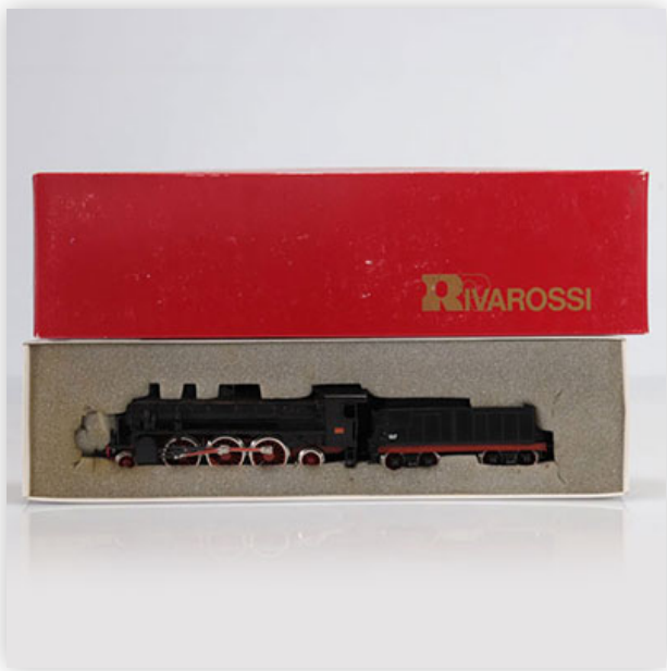
49 Rivarossi locomotive / Reference: 1160 / Type: GR; 685 410

Référence: GFAB6173 — Poids: 500 g — Sizes: L=250mm — Condition: At first glance - very good condition - no restoration - no repair