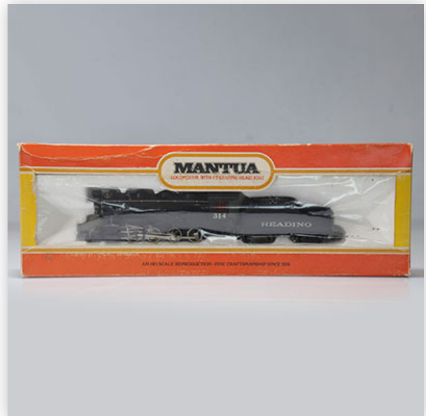
408 Mantua locomotive / Reference: 314 04 / Type: USRA Alco 0-8-0 #314

Référence: GFAB6545 — Poids: 565 g — Sizes: Avec boîte= H=40mm L=380mm — Condition: At first glance - very good condition - no restoration - no repair