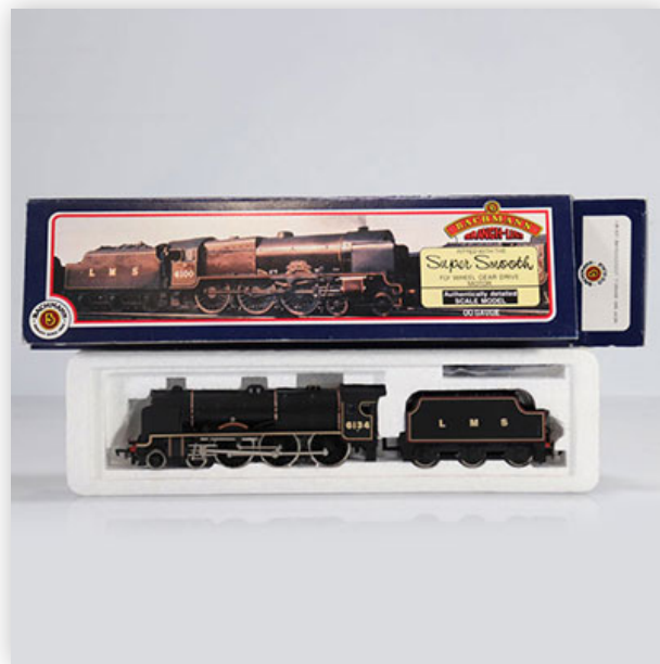
206 Bachmann locomotive / Reference: 31276 / Type: 4-6-0 Royal Scot "6134...

Référence: GFAB6335 — Poids: 520 g — Sizes: L=285mm — Condition: At first glance - good condition - no restoration - no repair