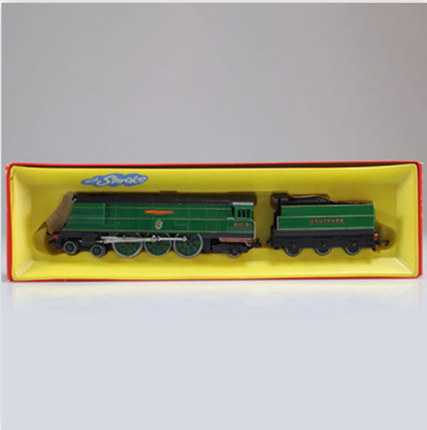
125 Hornby locomotive / Reference: R8695 / Type: Battle of Britain Locomotive...

Référence: GFAB6251 — Poids: 515 g — Sizes: L=280mm — Condition: At first glance - very good condition - no restoration - no repair