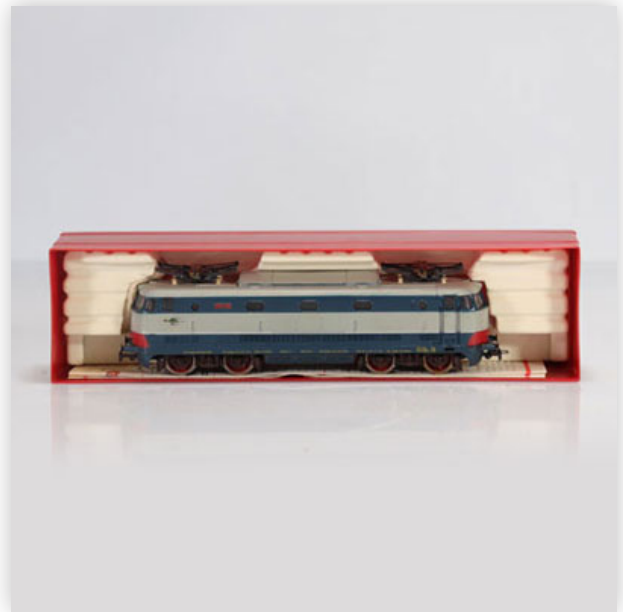
6 Rivarossi locomotive / Reference: 1454 / Type: E444 027

Référence: GFAB6140 — Poids: 500 g — Sizes: L=200mm — Condition: At first glance - very good condition - no restoration - no repair