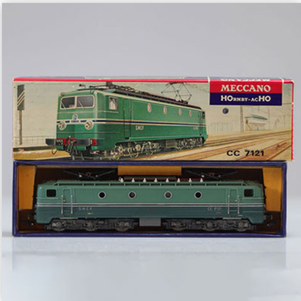
387 Meccano locomotive / Reference: CC 7121-71 (Hornby) / Type: CC 7121

Référence: GFAB6523 — Poids: 567 g — Sizes: L=225mm — Condition: At first glance - very good condition - no restoration - no repair