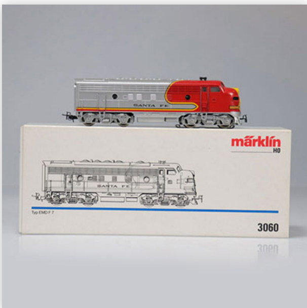
247 Marklin locomotive / Reference: 3060 & 4060 / Type: Electric Diesel Typemd...

Référence: GFAB6381 — Poids: 635 g — Region: France — Sizes: H=50mm L=175mm — Condition: At first glance - very good condition - no restoration - no repair