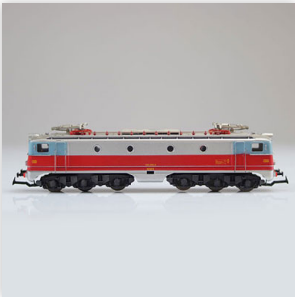
459 Iberian locomotive / Reference: - / Type: motor 276.066.8 #7666

Référence: GFAB6608 — Poids: 350 g — Sizes: L=220mm — Condition: At first glance - very good condition - no restoration - no repair