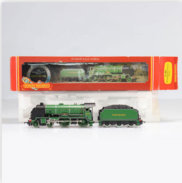
157 Hornby locomotive / Reference: R380 / Type: School Class V Loco "Stowe"

Référence: GFAB6283 — Poids: 430 g — Sizes: L=235mm — Condition: At first glance - very good condition - no restoration - no repair