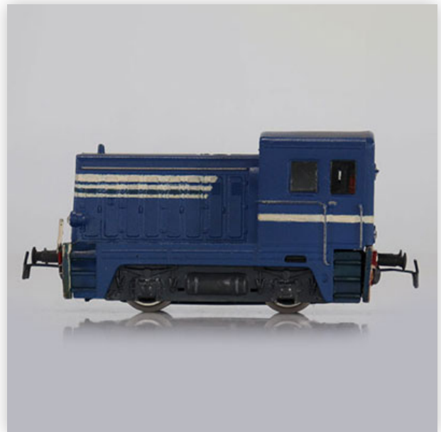
224 VEB Eisenbahn locomotive / Reference: BN150 / Type: ELECTRIC BN150

Référence: GFAB6358 — Poids: 200 g — Region: Allemagne — Sizes: Avec boite= H=50mm L=165mm — Condition: At first glance - good condition - no restoration - no repair