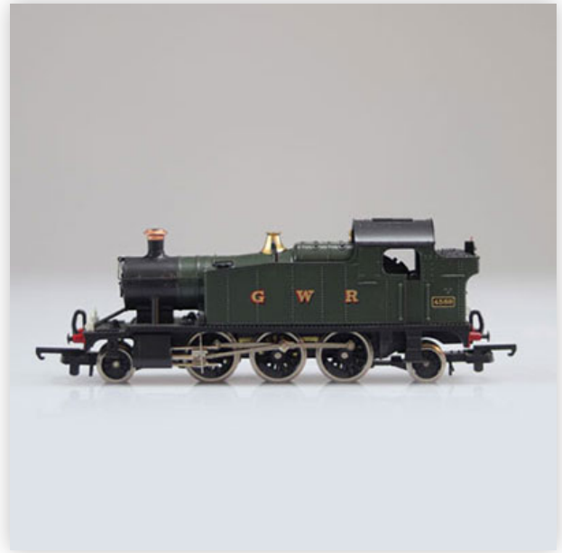
282 Lima locomotive / Reference: - / Type: locotender 0-6-0 #4589

Référence: GFAB6416 — Poids: 243 g — Sizes: L=170mm — Condition: At first glance - very good condition - no restoration - no repair