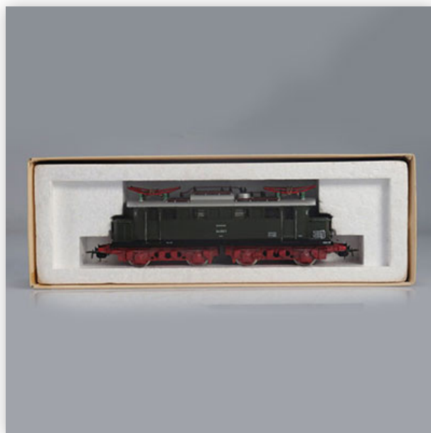
360 Piko locomotive / Reference: 5 6201 / Type: Elektrische Personenzug Lokomotive...

Référence: GFAB6495 — Poids: 405 g — Region: Allemagne — Sizes: Avec boîte= H=50mm L=260mm — Condition: At first glance - very good condition - no restoration - no repair