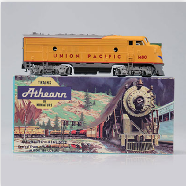
491 Athearn locomotive / Reference: 3113 / Type: F7A PWR #1480

Référence: GFAB6640 — Poids: 370 g — Region: Amérique — Sizes: H=50mm L=170mm — Condition: At first glance - very good condition - no restoration - no repair