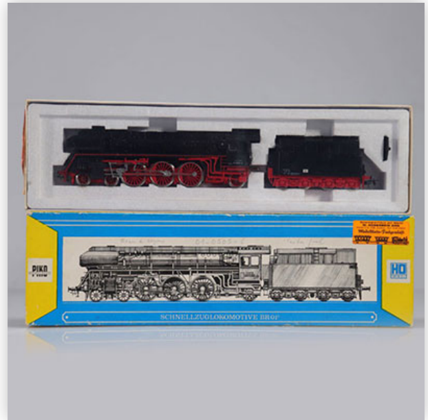
354 Piko locomotive / Reference: 5 6320 / Type: Schnellzuglokomotive BR01...

Référence: GFAB6489 — Poids: 797 g — Sizes: Locomotive L=300mm — Condition: At first glance - very good condition - no restoration - no repair