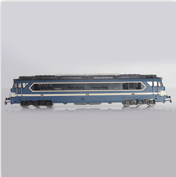
443 Jouef locomotive / Reference: - / Type: locomotive 70002

Référence: GFAB6588 — Poids: 280 g — Region: France — Sizes: H=50mm L=250mm — Condition: At first glance - very good condition - no restoration - no repair