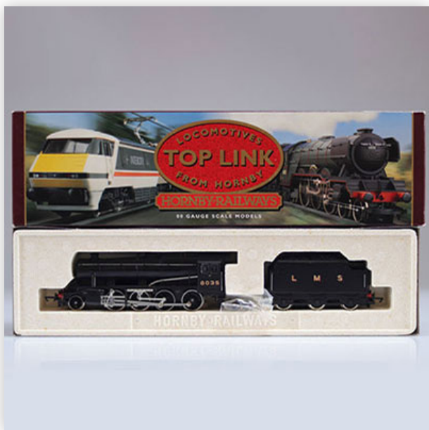
123 Hornby locomotive / Reference: R297 / Type: 2.8.0 Locomotive Class 8F...

Référence: GFAB6249 — Poids: 530 g — Sizes: L=260mm — Condition: At first glance - very good condition - no restoration - no repair