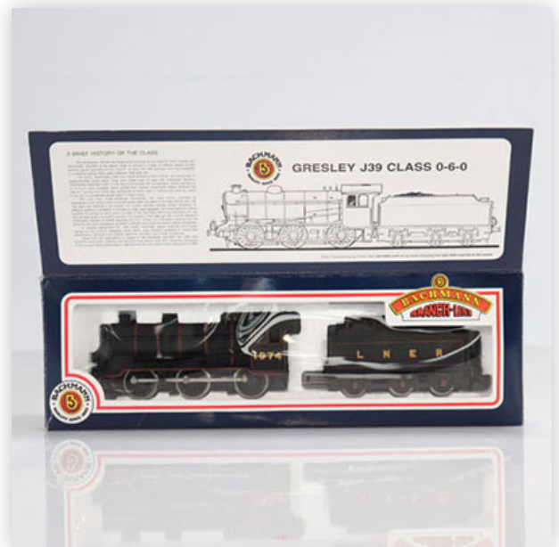
188 Bachmann locomotive / Reference: 31,850/74 / Type: GRESLEY J39 Class 0-6-0

Référence: GFAB6316 — Poids: 400 g — Sizes: L=230mm — Condition: At first glance - very good condition - no restoration - no repair