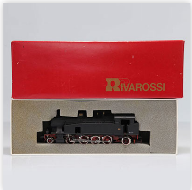
52 Rivarossi locomotive / Reference: 1163 / Type: GR 940 033

Référence: GFAB6176 — Poids: 350 g — Sizes: L=160mm — Condition: At first glance - very good condition - no restoration - no repair