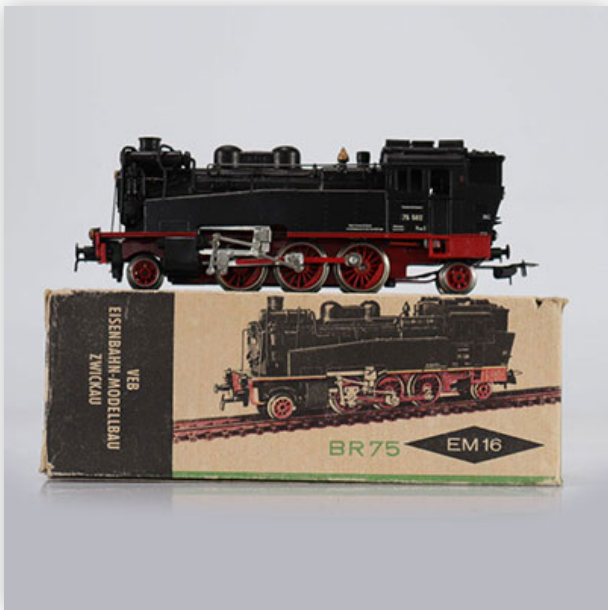
225 VEB Eisenbahn locomotive / Reference: BR75 / Type: BR75 Locotender 2-6-2...

Référence: GFAB6359 — Poids: 310 g — Region: Allemagne — Sizes: Avec boîte= H=50mm L=165mm — Condition: At first glance - very good condition - no restoration - no repair