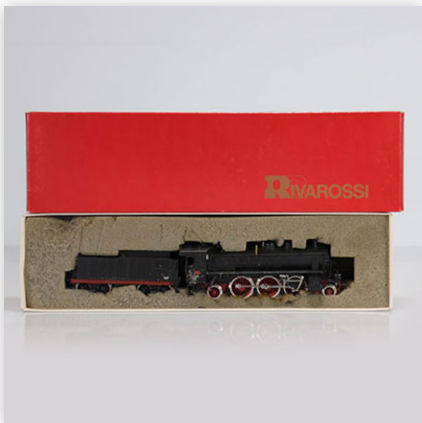
31 Rivarossi locomotive / Reference: 1154 / Type: GR 685 410

Référence: GFAB6155 — Poids: 500 g — Sizes: L=255mm — Condition: At first glance - very good condition - no restoration - no repair