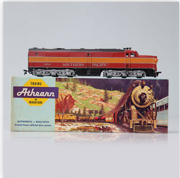
470 Athearn locomotive / Reference: 3326 / Type: Alco Pai Diesel

Référence: GFAB6619 — Poids: 530 g — Region: Amérique — Sizes: H=50mm L=230mm — Condition: At first glance - very good condition - no restoration - no repair