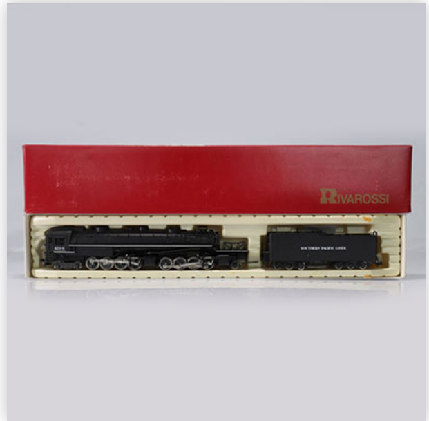
72 Rivarossi locomotive / Reference: 1547 / Type: locomotive 4-8-8-2 (CAB...

Référence: GFAB6196 — Poids: 590 g — Region: Amérique — Sizes: Avec boîte= H=45mm L=520mm — Condition: At first glance - very good condition - no restoration - no repair