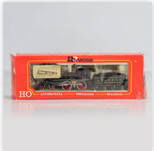
40 Rivarossi locomotive / Reference: 1206 / Type: 4.4.0 / 91

Référence: GFAB6164 — Poids: 200 g — Sizes: L=195mm — Condition: At first glance - very good condition - no restoration - no repair