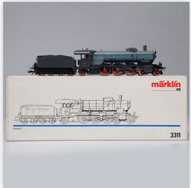
240 Marklin locomotive / Reference: 3311 / Type: 4.6.2 C2007

Référence: GFAB6374 — Poids: 830 g — Region: France — Sizes: H=50mm L=240mm — Condition: At first glance - very good condition - no restoration - no repair