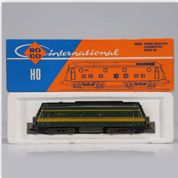
301 Roco locomotive / Reference: 4152 / Type: Diesel-electrical series 59...

Référence: GFAB6435 — Poids: 455 g — Sizes: Locomotive L=195mm — Condition: At first glance - very good condition - no restoration - no repair