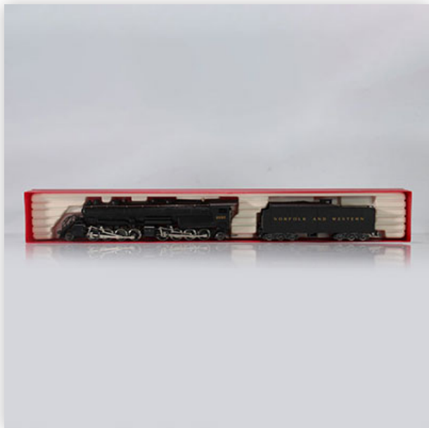
67 Rivarossi locomotive / Reference: 1238 / Type: locomotive 2-8-8-2 cl.Y6B...

Référence: GFAB6191 — Poids: 845 g — Region: Amérique — Sizes: Avec boîte= H=55mm L=520mm — Condition: At first glance - very good condition - no restoration - no repair