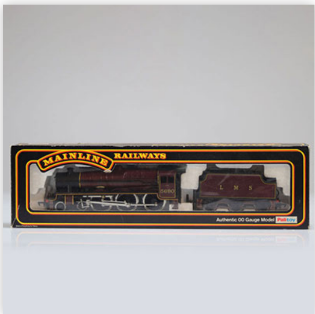
263 Mainline locomotive / Reference: 37061 / Type: 4-6-0 Jubilee Class 5xp

Référence: GFAB6397 — Poids: 467 g — Sizes: L=285mm — Condition: At first glance - very good condition - no restoration - no repair