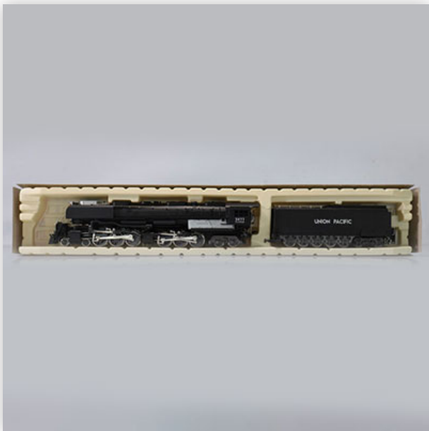
73 Rivarossi locomotive / Reference: 1200 / Type: Steam Locomotive 4-6-6-4...

Référence: GFAB6197 — Poids: 760 g — Region: Amérique — Sizes: Avec boite= H=45mm L=520mm — Condition: At first glance - very good condition - no restoration - no repair