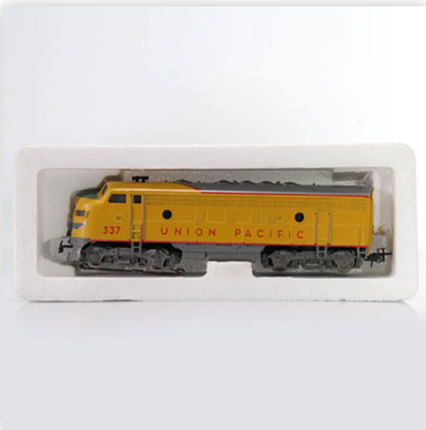
251 Marklin locomotive / Reference: 3061 / Type: Diesel 3061 #337

Référence: GFAB6385 — Poids: 535 g — Region: Amérique — Sizes: Avec boîte= 60mm L=235mm — Condition: At first glance - very good condition - no restoration - no repair