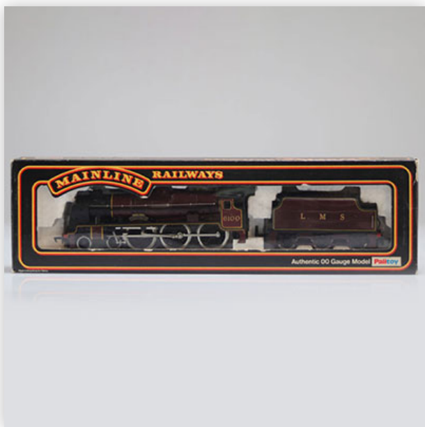
267 Mainline locomotive / Reference: 37060 /6100 / Type: 4-6-0 Rebuilt Class...

Référence: GFAB6401 — Poids: 472 g — Sizes: L=280mm — Condition: At first glance - very good condition - no restoration - no repair