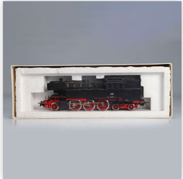
338 Piko locomotive / Reference: 5 6301 / Type: Br66 Tenderlokomotive (66002)

Référence: GFAB6473 — Poids: 435 g — Region: Allemagne — Sizes: Avec boîte= H=50mm L=260mm — Condition: At first glance - very good condition - no restoration - no repair