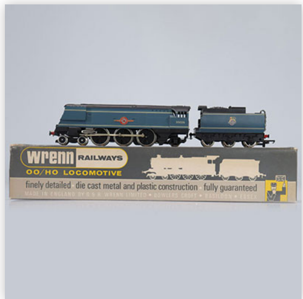
100 Locomotive Wrenn / Reference: W2267 / 35026 / Type: 4.6.2 Lamport & Holt

Référence: GFAB6225 — Poids: 750 g — Region: England — Sizes: Avec boîte= H=45mm L=355mm — Condition: At first glance - very good condition - no restoration - no repair