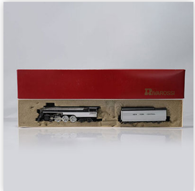
68 Rivarossi locomotive / Reference: 1552 / Type: locomotive 4-6-4 Hudson...

Référence: GFAB6192 — Poids: 540 g — Region: Amérique — Sizes: Avec boîte= H=40mm L=515mm — Condition: At first glance - very good condition - no restoration - no repair