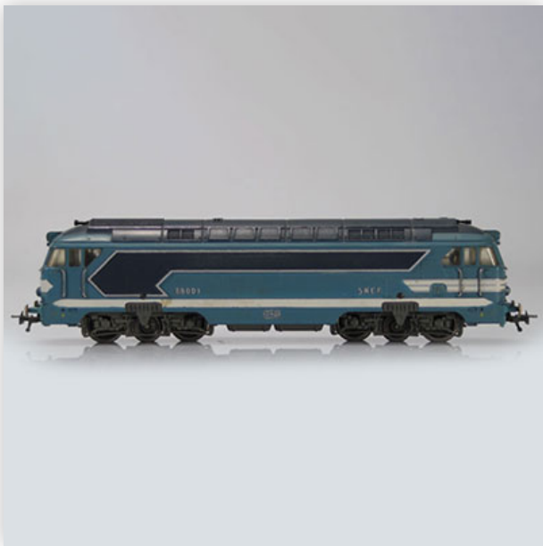
97 Locomotive Fleischmann / Reference: 68001 / Type: Loco Diesel 68001

Référence: GFAB6222 — Poids: 580 g — Region: France — Sizes: H=55mm L=235mm — Condition: At first glance - good condition - no restoration - no repair