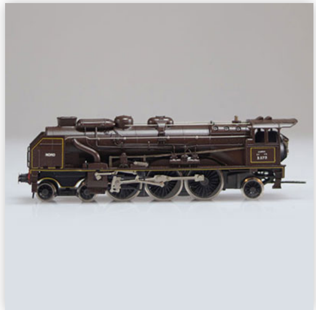
316 Altaya locomotive / Reference: - / Type: Atlantic 221 La Chapelle 3.1173

Référence: GFAB6451 — Poids: 288 g — Sizes: L=180mm — Condition: At first glance - very good condition - no restoration - no repair