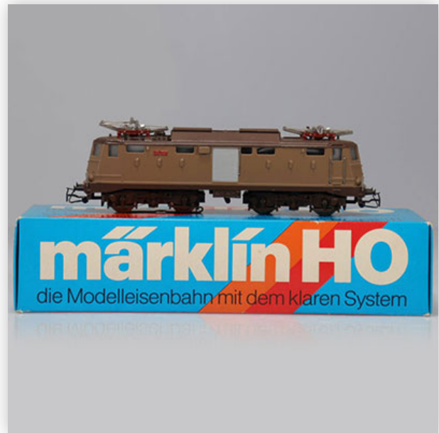
242 Marklin locomotive / Reference: 3035 / Type: BREDA 4240 1105

Référence: GFAB6376 — Poids: 475 g — Sizes: H=50mm L=175mm — Condition: At first glance - very good condition - no restoration - no repair