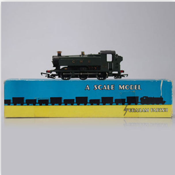
255 Graham Farish Locomotive / Reference: BEIW 0.6.0 / Type: 0.6.0. 9410

Référence: GFAB6389 — Poids: 460 g — Region: England — Sizes: Avec boîte= H=65mm L=280mm — Condition: At first glance - very good condition - no restoration - no repair