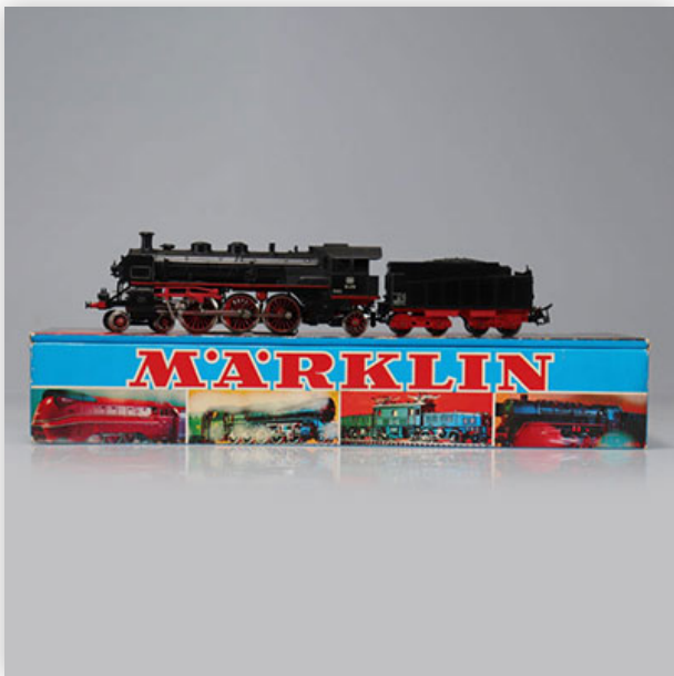
233 Marklin locomotive / Reference: 3091 / Type: 4.6.2 18478

Référence: GFAB6367 — Poids: 585 g — Region: France — Sizes: H=55mm L=250mm — Condition: At first glance - very good condition - no restoration - no repair