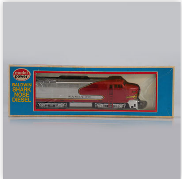
502 Locomotive Model Power / Reference: 730 / Type: Baldwin Shark Nose Diesel

Référence: GFAB6651 — Poids: 475 g — Region: Amérique — Sizes: Avec boîte= H=45mm L=270mm — Condition: At first glance - very good condition - no restoration - no repair