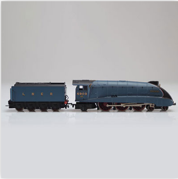
217 Bachmann locomotive / Reference: - / Type: steam 4-6-6 #4903 Peregrine

Référence: GFAB6349 — Poids: 482 g — Sizes: L=290mm — Condition: At first glance - very good condition - no restoration - no repair