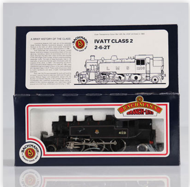
180 Bachmann locomotive / Reference: 31 450/41221 / Type: Ivatt 2_6_2 Tank

Référence: GFAB6308 — Poids: 420 g — Sizes: L=150mm — Condition: At first glance - very good condition - no restoration - no repair