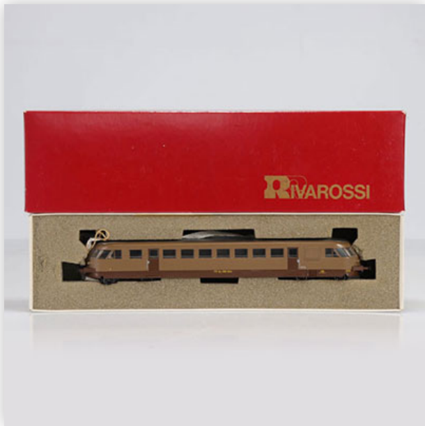
29 Rivarossi locomotive / Reference: 1788 / Type: Breda self-propelled

Référence: GFAB6153 — Poids: 300 g — Sizes: L=260mm — Condition: At first glance - very good condition - no restoration - no repair