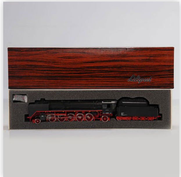
380 Liliput locomotive / Reference: 4500 / Type: 45002 / 2.10.2

Référence: GFAB6516 — Poids: 780 g — Sizes: L=310mm — Condition: At first glance - very good condition - no restoration - no repair