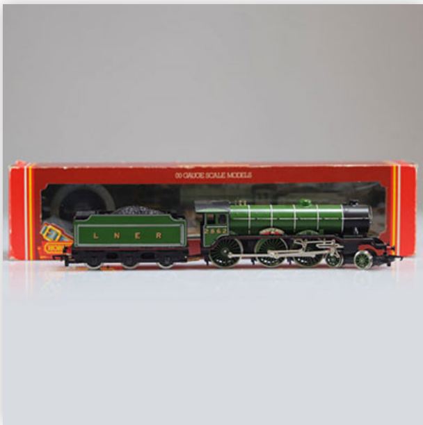
137 Hornby locomotive / Reference: R053 / Type: Class B17 "Manchester United"...

Référence: GFAB6263 — Poids: 465 g — Sizes: L=270mm — Condition: At first glance - very good condition - no restoration - no repair