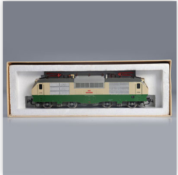
346 Piko locomotive / Reference: 6220 / Type: Schnellzuglokomotive ES499 (E499...

Référence: GFAB6481 — Poids: 490 g — Sizes: Avec boite= H=50mm L=260mm — Condition: At first glance - very good condition - no restoration - no repair