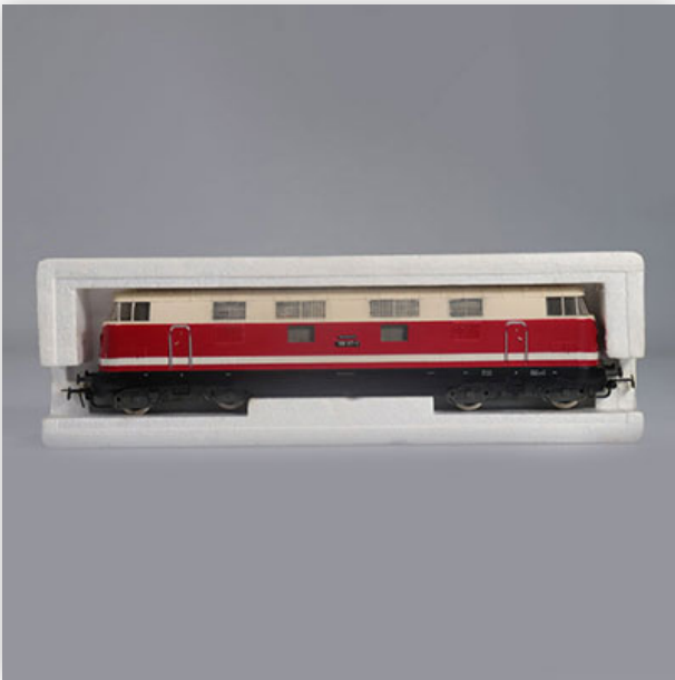
345 Piko locomotive / Reference: 190 19 / Type: BR118 Dieselhydraulische (118...

Référence: GFAB6480 — Poids: 460 g — Region: Allemagne — Sizes: Avec boite= H=50mm L=250mm — Condition: At first glance - very good condition - no restoration - no repair