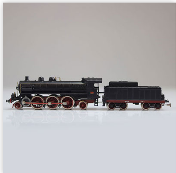
76 Rivarossi locomotive / Reference: - / Type: steam 2-6-2 #685470

Référence: GFAB6201 — Poids: 400 g — Sizes: L=280mm — Condition: At first glance - very good condition - no restoration - no repair