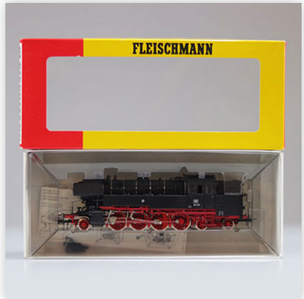
86 Fleischmann locomotive / Reference: 4065 / Type: 65.0 /2.8.4

Référence: GFAB6211 — Poids: 340 g — Sizes: L=180mm — Condition: At first glance - very good condition - no restoration - no repair