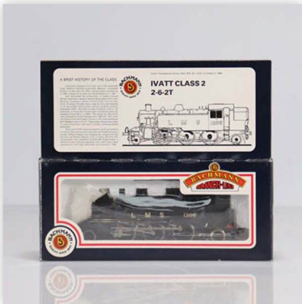
185 Bachmann locomotive / Reference: 31 453/1206 / Type: Ivatt 2_6_2t

Référence: GFAB6313 — Poids: 430 g — Sizes: L=155mm — Condition: At first glance - very good condition - no restoration - no repair