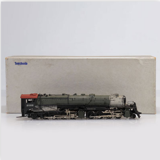
395 Tenshodo locomotive / Reference: 160 / Type: 2-8-8-2 Class R-2 #2055

Référence: GFAB6532 — Poids: 1.32 kg — Sizes: L=280mm — Condition: At first glance - very good condition - no restoration - no repair