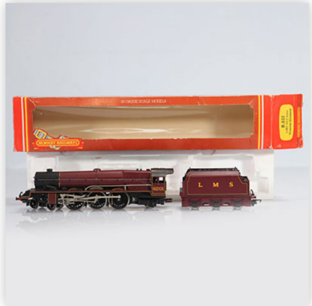
162 Hornby locomotive / Reference: R832 / Type: 4.6.2 Princess Elizabeth 6201

Référence: GFAB6288 — Poids: 160 g — Sizes: L=300mm — Condition: At first glance - very good condition - no restoration - no repair