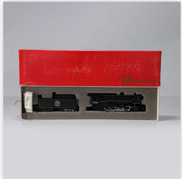
66 Rivarossi locomotive / Reference: 1271 / Type: locomotive 0-8-0 (8 Wheels...

Référence: GFAB6190 — Poids: 485 g — Region: Amérique — Sizes: Avec boîte= H=50mm L=380mm — Condition: At first glance - very good condition - no restoration - no repair