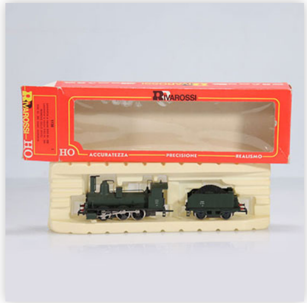
46 Rivarossi locomotive / Reference: 1130 / Type: 0.3.0 GR 200

Référence: GFAB6170 — Poids: 225 g — Sizes: L=180mm — Condition: At first glance - very good condition - no restoration - no repair