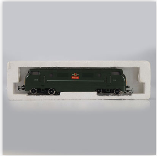
238 Marklin locomotive / Reference: D830 / Type: D830 Warship Class Majestic

Référence: GFAB6372 — Poids: 400 g — Region: England — Sizes: Avec boîte= H=50mm L=280mm — Condition: At first glance - very good condition - no restoration - no repair