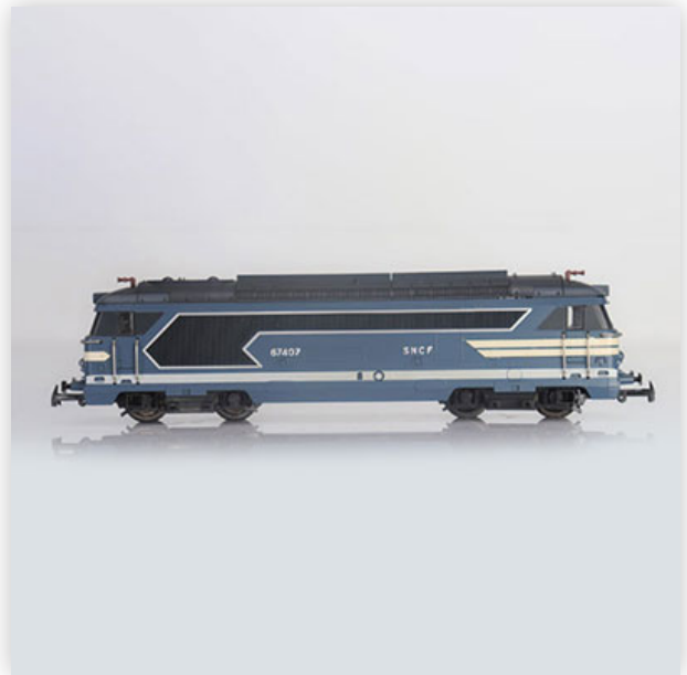
444 Jouef locomotive / Reference: - / type: locomotive 67407

Référence: GFAB6589 — Poids: 245 g — Region: France — Sizes: H=50mm L=200mm — Condition: At first glance - very good condition - no restoration - no repair