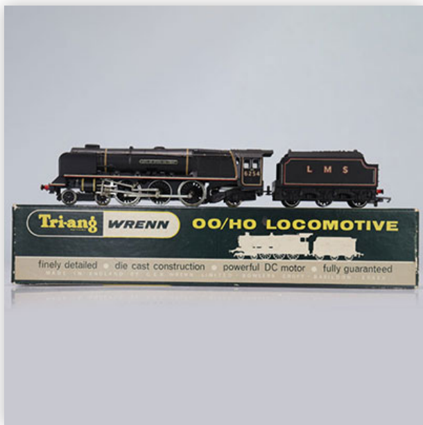
117 Locomotive Wrenn / Reference: W2227 / 6254 / Type: 4.6.2 City of Stoke-on-Trent

Référence: GFAB6242 — Poids: 815 g — Region: England — Sizes: Avec boîte= H=45mm L=355mm — Condition: At first glance - very good condition - no restoration - no repair