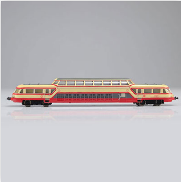
21 Jouef locomotive / Reference: - / Type: Geneve-Nice double-decker rail...

Référence: GFAB6584 — Poids: 200 g — Sizes: L=300mm — Condition: At first glance - very good condition - no restoration - no repair