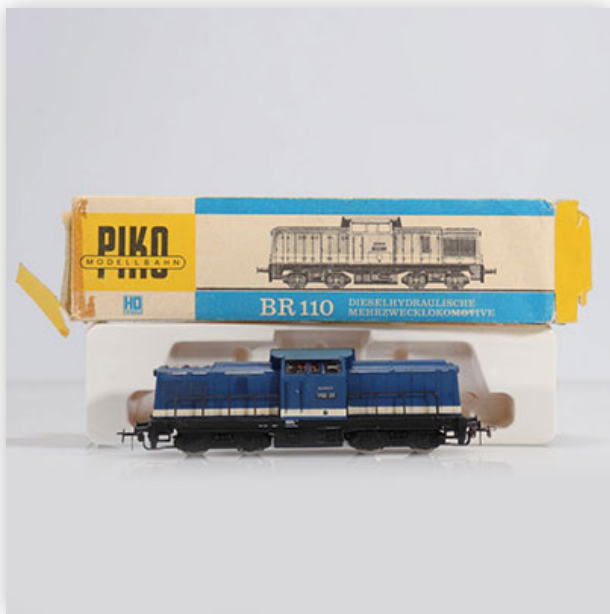
321 Piko locomotive / Reference: 190/17 / Type: Diesellokomotive V100

Référence: GFAB6456 — Poids: 375 g — Sizes: Locomotive L=165mm — Condition: At first glance ? good condition - no restoration - no repair