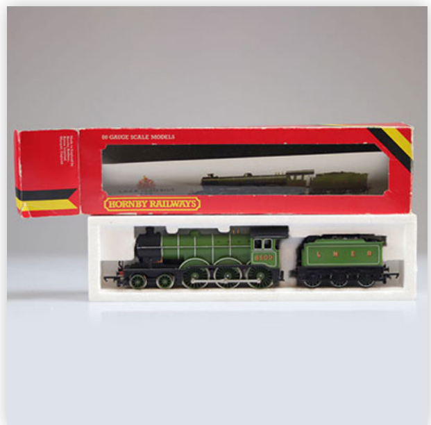
136 Hornby locomotive / Reference: R866 / Type: 4.6.0 Class B12 / 3 8572

Référence: GFAB6262 — Poids: 310 g — Sizes: L=250mm — Condition: At first glance - very good condition - no restoration - no repair