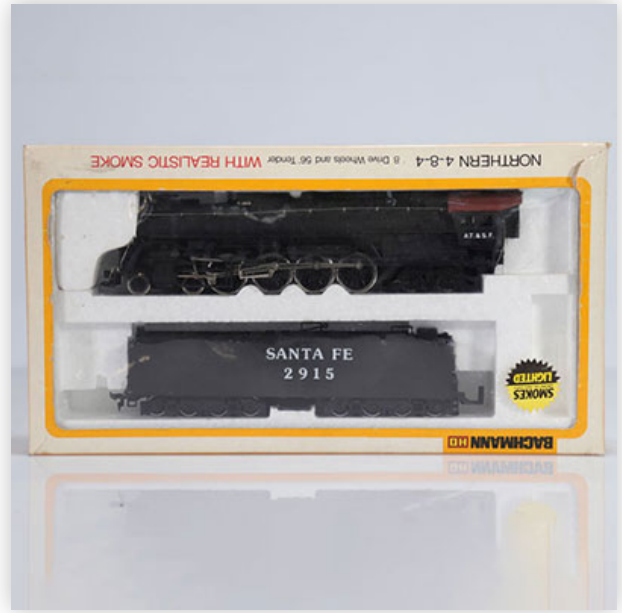
202 Bachmann locomotive / Reference: 664 Burlington / Type: 4.8.4 Burlington...

Référence: GFAB6331 — Poids: 720 g — Sizes: L=430mm — Condition: At first glance - very good condition - no restoration - no repair