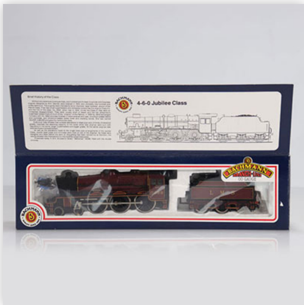
205 Bachmann locomotive / Reference: 31155 / Type: 4-6-0 Jubilee Class "5699...

Référence: GFAB6334 — Poids: 460 g — Sizes: L=270mm — Condition: At first glance - very good condition - no restoration - no repair