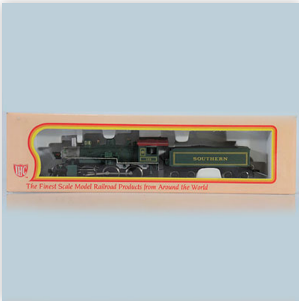
405 IHC locomotive / Reference: M513 / Type: 2-6-0 Mogul

Référence: GFAB6542 — Poids: 420 g — Region: Amérique — Sizes: Avec boîte= H=40mm L=330mm — Condition: At first glance - very good condition - no restoration - no repair