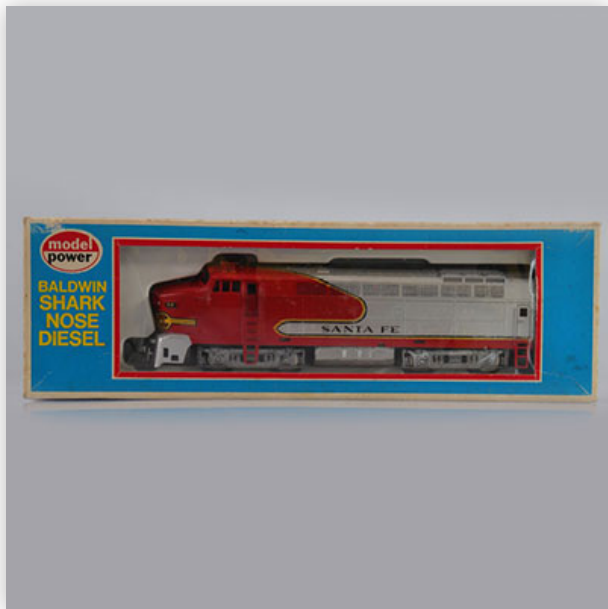
503 Locomotive Model Power / Reference: 720 / Type: Baldwin Shark Nose Diesel

Référence: GFAB6652 — Poids: 470 g — Region: Amérique — Sizes: Avec boîte= H=45mm L=275mm — Condition: At first glance - very good condition - no restoration - no repair