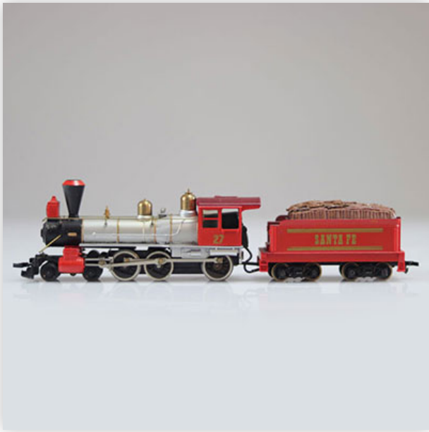
413 Mantua locomotive / Reference: - / Type: 4-6-0 #27

Référence: GFAB6551 — Poids: 380 g — Sizes: L=180mm — Condition: At first glance - very good condition - no restoration - no repair