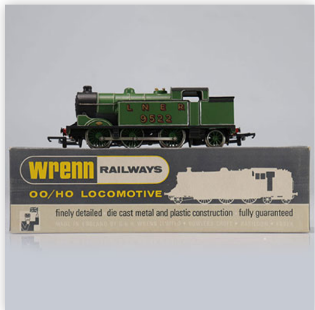
112 Locomotive Wrenn / Reference: W2217 / Type: 0.6.2 Tank 9522

Référence: GFAB6237 — Poids: 385 g — Region: England — Sizes: Avec boîte= H=50mm L=235mm — Condition: At first glance - very good condition - no restoration - no repair