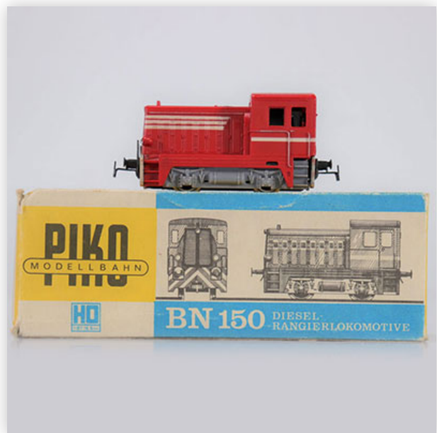
324 Piko locomotive / Reference: 190/15 / Type: Dieselmotortenderlokomotive

Référence: GFAB6459 — Poids: 190 g — Region: Allemagne — Sizes: Avec boîte= H=50mm L=165mm — Condition: At first glance - very good condition - no restoration - no repair