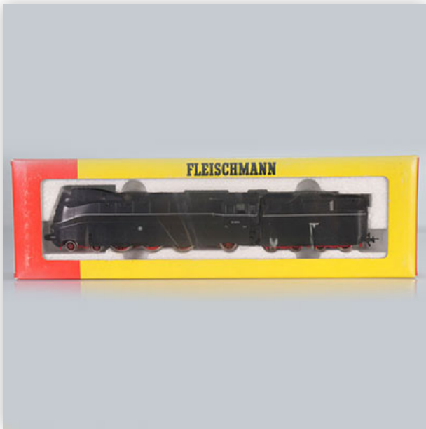
93 Fleischmann locomotive / Reference: 4172 / Type: 03 1074

Référence: GFAB6218 — Poids: 725 g — Region: Allemagne — Sizes: Avec boîte= H=50mm L=340mm — Condition: At first glance - very good condition - no restoration - no repair