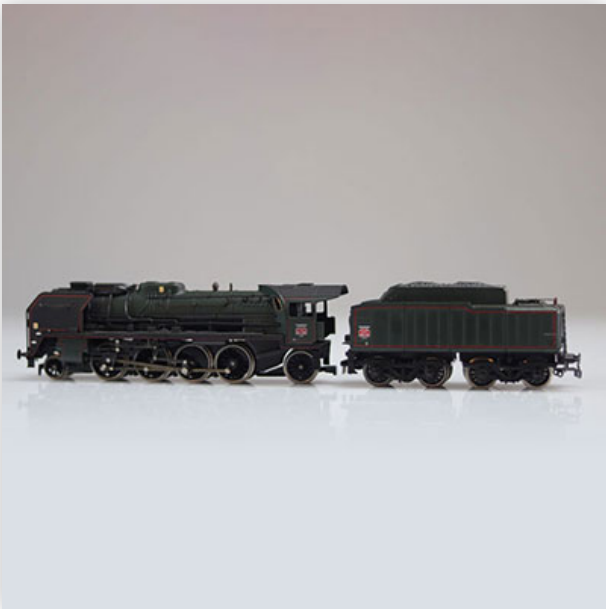
435 Jouef locomotive / Reference: same box / type: steam 2-8-2 #141-P-102...

Référence: GFAB6574 — Poids: 427 g — Sizes: L=280mm — Condition: At first glance - very good condition - no restoration - no repair