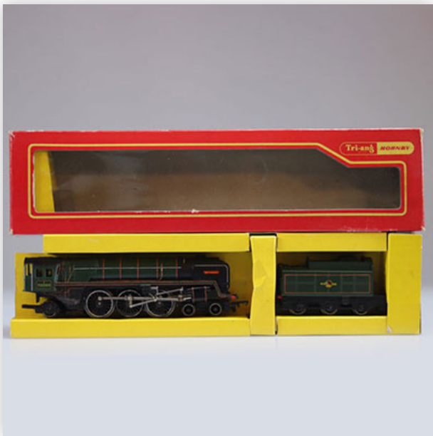
141 Hornby locomotive / Reference: R259 / Type: 4.6.2. Britannia 70000

Référence: GFAB6267 — Poids: 520 g — Sizes: L=280mm — Condition: At first glance - very good condition - no restoration - no repair