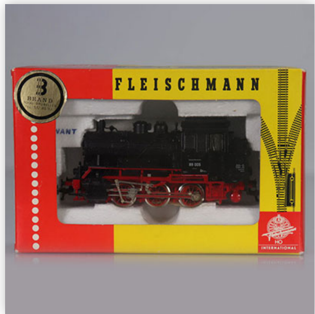
90 Fleischmann locomotive / Reference: 4020 / Type: 0.6.0 / 89005

Référence: GFAB6215 — Poids: 340 g — Region: Allemagne — Sizes: Avec boîte= H=50mm L=160mm — Condition: At first glance - very good condition - no restoration - no repair