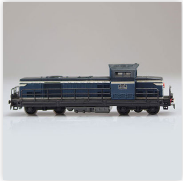
446 Jouef locomotive / Reference: - / Type: motor bb66150

Référence: GFAB6592 — Poids: 200 g — Sizes: L=180mm — Condition: At first glance - very good condition - no restoration - no repair