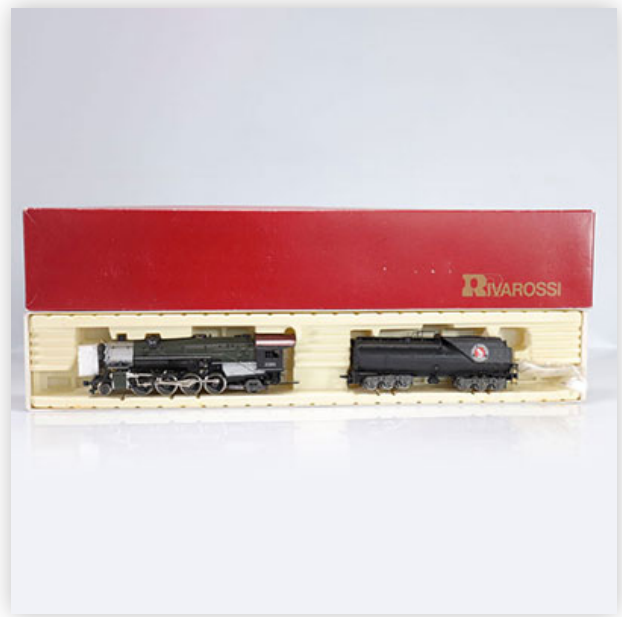
50 Rivarossi locomotive / Reference: 1538 / Type: 2-8-2 Mikado 3385

Référence: GFAB6174 — Poids: 500 g — Sizes: L=320mm — Condition: At first glance - very good condition - no restoration - no repair