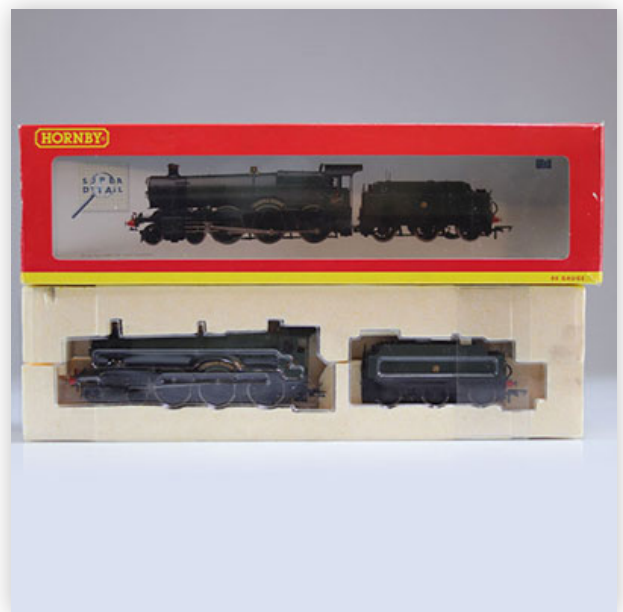
160 Hornby locomotive / Reference: R2547 / Type: 4.6.0 Grange Class Locomotive...

Référence: GFAB6286 — Poids: 477 g — Sizes: L=260mm — Condition: At first glance - very good condition - no restoration - no repair