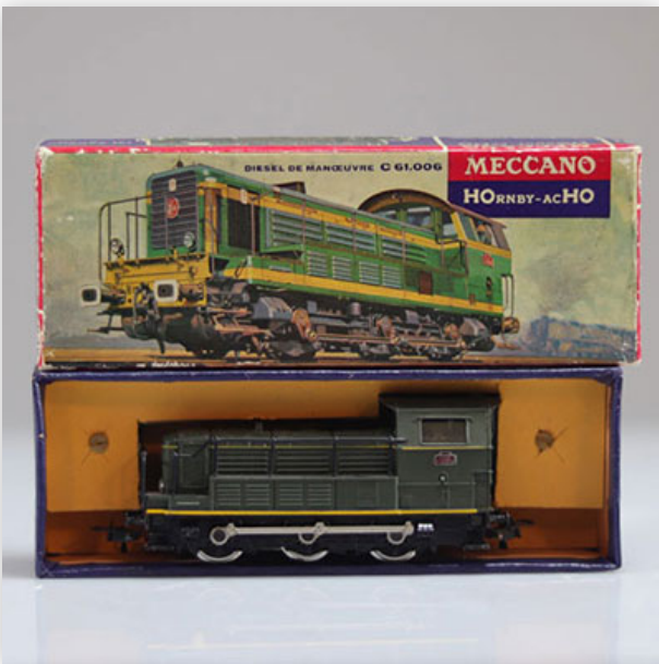
391 Meccano locomotive / Reference: 635 / Type: Diesel maneuver C 61.006

Référence: GFAB6527 — Poids: 335 g — Sizes: L=130mm — Condition: At first glance ? good condition - no restoration - no repair