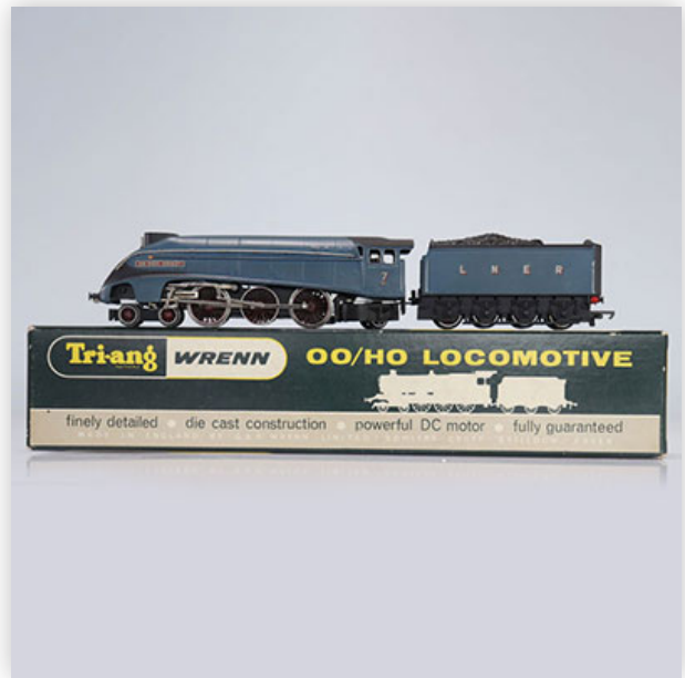
106 Wrenn locomotive / Reference: W2212 / 7 / Type: SIR NIGEL GRESLEY

Référence: GFAB6231 — Poids: 635 g — Region: England — Sizes: Avec boîte= H=45mm L=355mm — Condition: At first glance - very good condition - no restoration - no repair