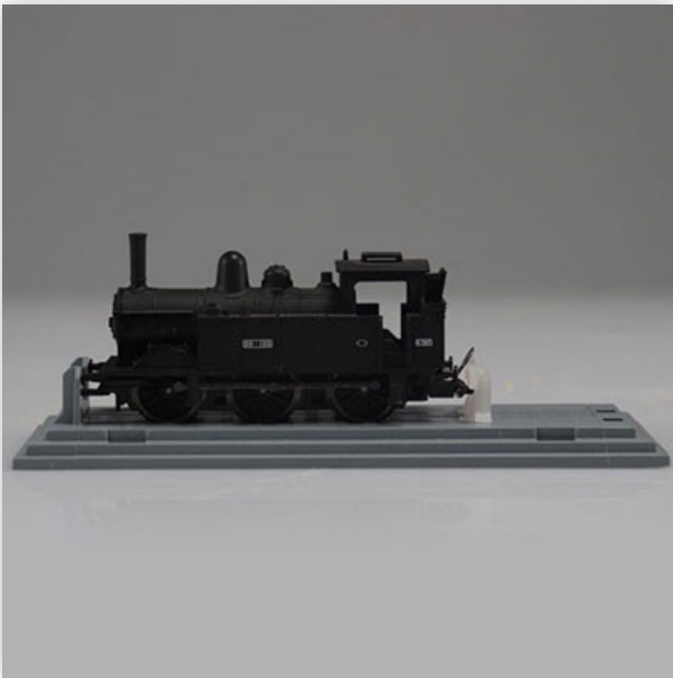
17 Jouef locomotive / Reference: 829500 / Type: 30

Référence: GFAB6553 — Poids: 170 g — Sizes: L=95mm — Condition: At first glance - very good condition - no restoration - no repair