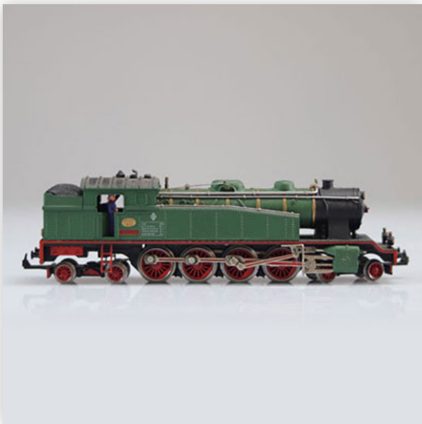
455 Ibertren locomotive / Reference: - / Type: locotender 4-8-4 242-0231 #157

Référence: GFAB6604 — Poids: 325 g — Sizes: L=190mm — Condition: At first glance - very good condition - no restoration - no repair