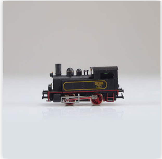
458 Iberian locomotive / Reference: - / Type: steam 2-2 020-0262-COUILLET...

Référence: GFAB6607 — Poids: 212 g — Sizes: L=90mm — Condition: At first glance - very good condition - no restoration - no repair