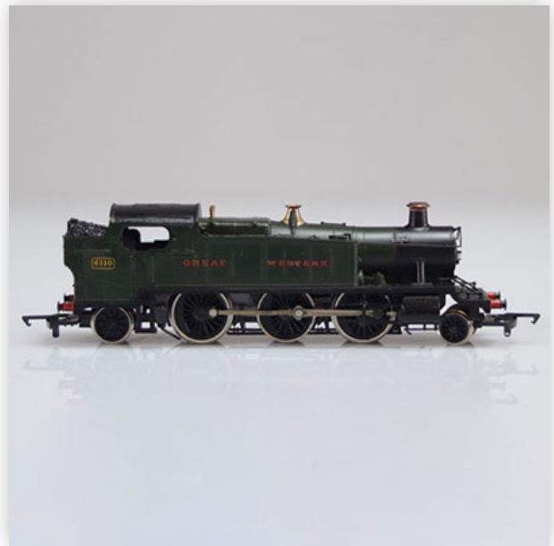
178 Airfix / Reference locomotive: ? / Type: locotender 2-6-2 #6110

Référence: GFAB6306 — Poids: 358 g — Sizes: L=290mm — Condition: At first glance - very good condition - no restoration - no repair