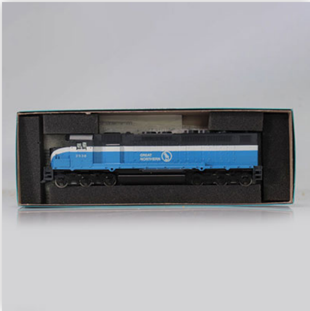
497 Athearn locomotive / Reference: 4108 / Type: SDP40 PWR #2538

Référence: GFAB6646 — Poids: 550 g — Region: Amérique — Sizes: Avec boite= H=40mm L=270mm — Condition: At first glance - very good condition - no restoration - no repair