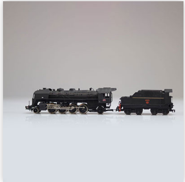
436 Jouef locomotive / Reference: - / Type: steam 2-8-2 #141-R-12

Référence: GFAB6575 — Poids: 423 g — Sizes: L=280mm — Condition: At first glance - very good condition - no restoration - no repair