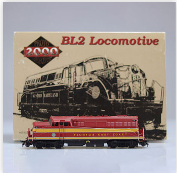
500 Proto series 2001 locomotive / Reference: 8355 / Type: BL2

Référence: GFAB6649 — Poids: 975 g — Sizes: L=205 — Condition: At first glance - very good condition - no restoration - no repair