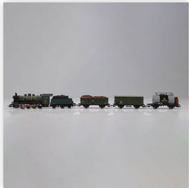
366 Piko locomotive / Reference: 81340 / Type: locomotive 0-8-0 # 81340 FHS

Référence: GFAB6502 — Poids: 1.00 kg — Region: Allemagne — Sizes: Divers — Condition: At first glance - very good condition - no restoration - no repair