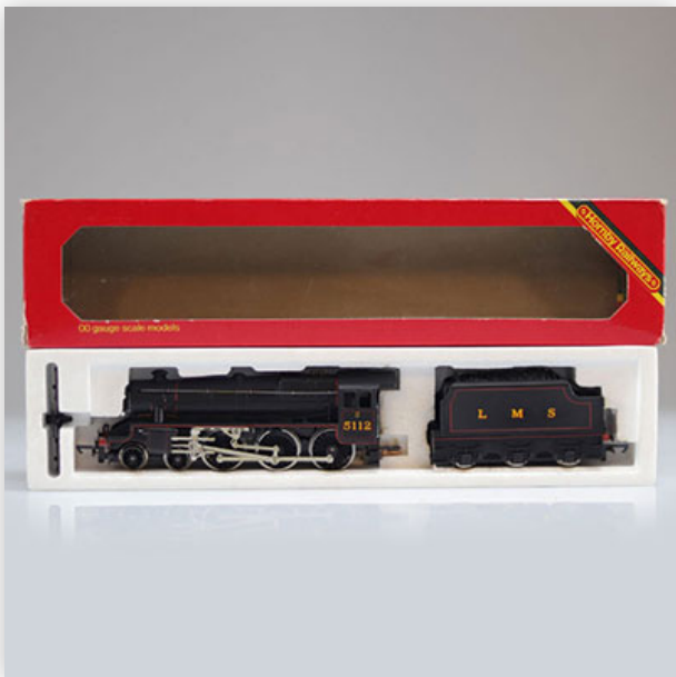
139 Hornby locomotive / Reference: R840 / Type: 4.6.0 Black Five Loco

Référence: GFAB6265 — Poids: 550 g — Sizes: L=260mm — Condition: At first glance - very good condition - no restoration - no repair