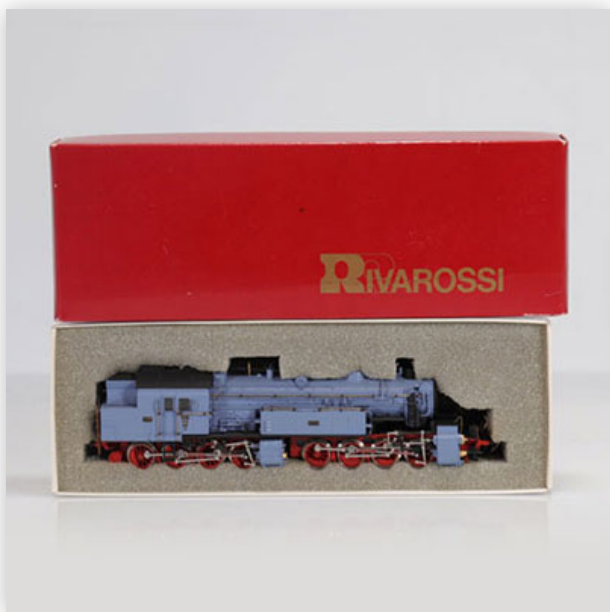
35 Rivarossi locomotive / Reference: 1376 / Type: GT 2 x 4/4 "5778"

Référence: GFAB6159 — Poids: 420 g — Sizes: L=210mm — Condition: At first glance - very good condition - no restoration - no repair