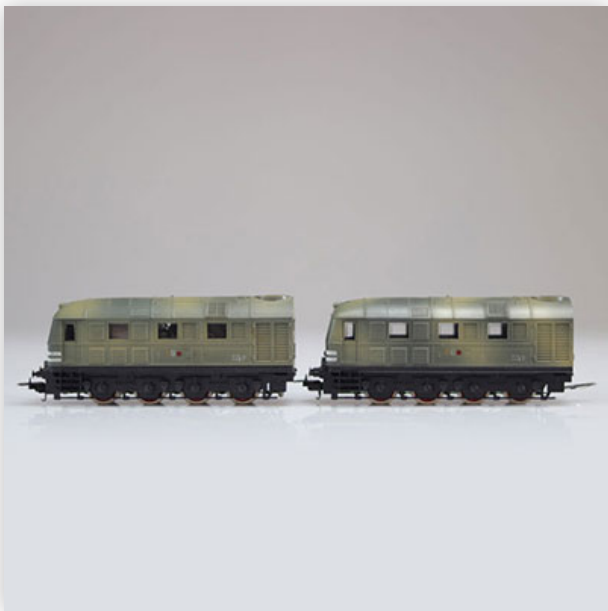
287 Lima locomotive / Reference: - / Type: KriegsgefaNe self -propelled

Référence: GFAB6421 — Poids: 300 g — Sizes: L=260mm — Condition: At first glance - very good condition - no restoration - no repair