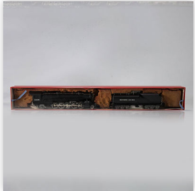
70 Rivarossi locomotive / Reference: 1255 / Type: locomotive 2-10-1 Class...

Référence: GFAB6194 — Poids: 755 g — Region: Amérique — Sizes: Avec boîte= H=50mm L=520mm — Condition: At first glance - very good condition - no restoration - no repair