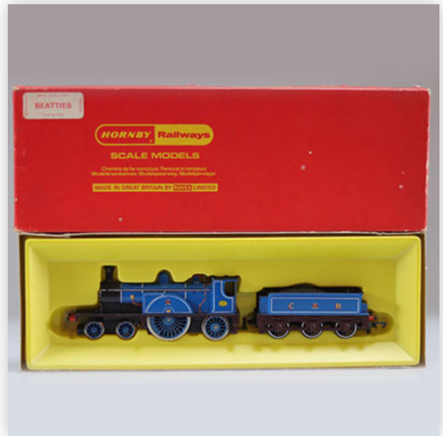
150 Hornby locomotive / Reference: R553 / Type: 4.2.2. Locomotive 123

Référence: GFAB6276 — Poids: 366 g — Sizes: L=240mm — Condition: At first glance - very good condition - no restoration - no repair