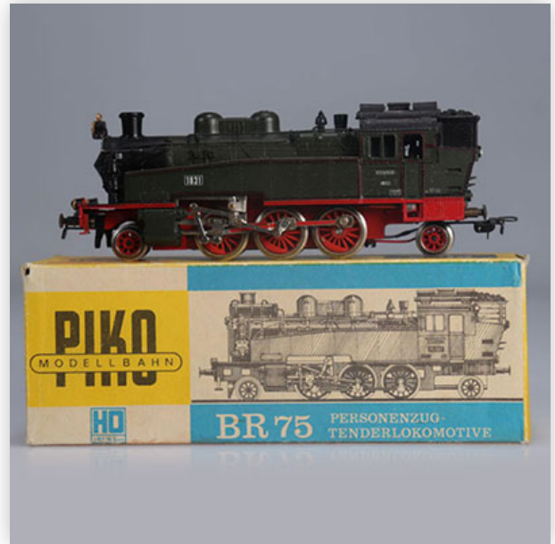
350 Piko locomotive / Reference: 190 16 1 / Type: BR75 Tenderlokomotive 1831

Référence: GFAB6485 — Poids: 345 g — Region: Allemagne — Sizes: Avec boîte= H=50mm L=165mm — Condition: At first glance - very good condition - no restoration - no repair