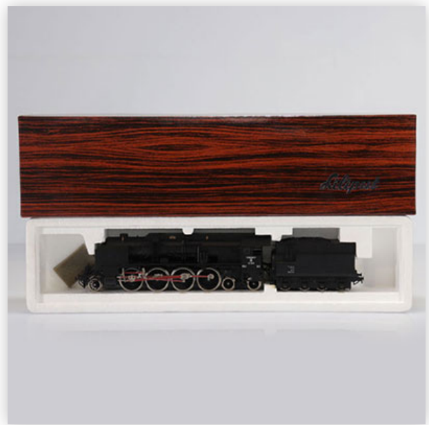
376 Liliput locomotive / Reference: 10602 / Type: 12010 / 2.8.4

Référence: GFAB6512 — Poids: 260 g — Sizes: L=275mm — Condition: At first glance - very good condition - no restoration - no repair