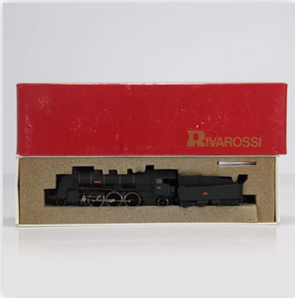
41 Rivarossi locomotive / Reference: 1379 / Type: 4.6.2. / 231 993

Référence: GFAB6165 — Poids: 550 g — Sizes: L=250mm — Condition: At first glance - very good condition - no restoration - no repair