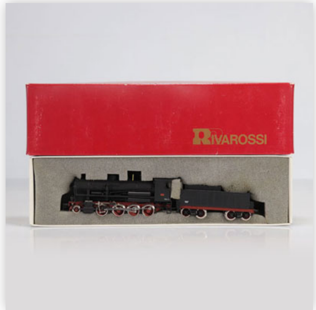
2 Rivarossi locomotive / Reference: 1164 / Type: 2_8

Référence: GFAB6136 — Poids: 480 g — Sizes: L=250mm — Condition: At first glance - very good condition - no restoration - no repair