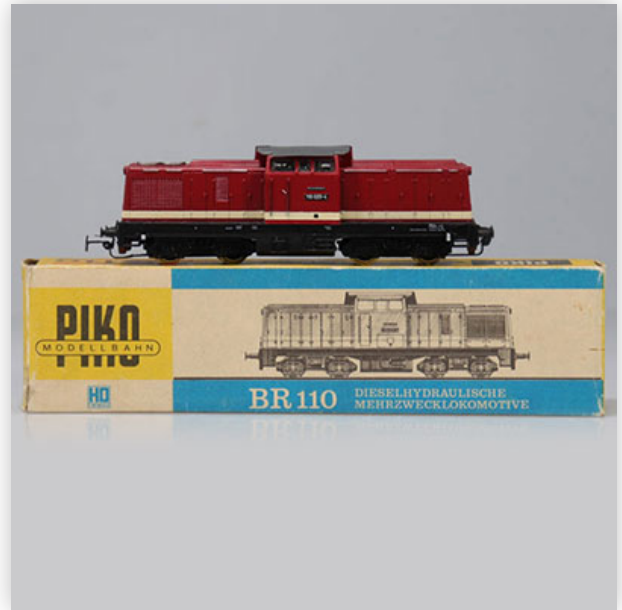
326 Piko locomotive / Reference: 130/17 / Type: BR110 Dieselhydraulische 110...

Référence: GFAB6461 — Poids: 325 g — Region: Allemagne — Sizes: H=45mm L=160mm — Condition: At first glance - very good condition - no restoration - no repair