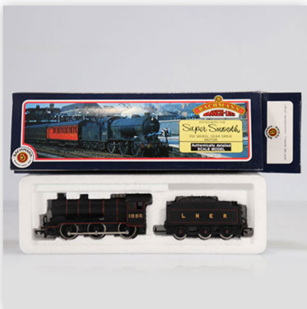
207 Bachmann locomotive / Reference: 31850 / Type: J39 1974 Lined Black

Référence: GFAB6336 — Poids: 400 g — Sizes: L=260mm — Condition: At first glance - very good condition - no restoration - no repair