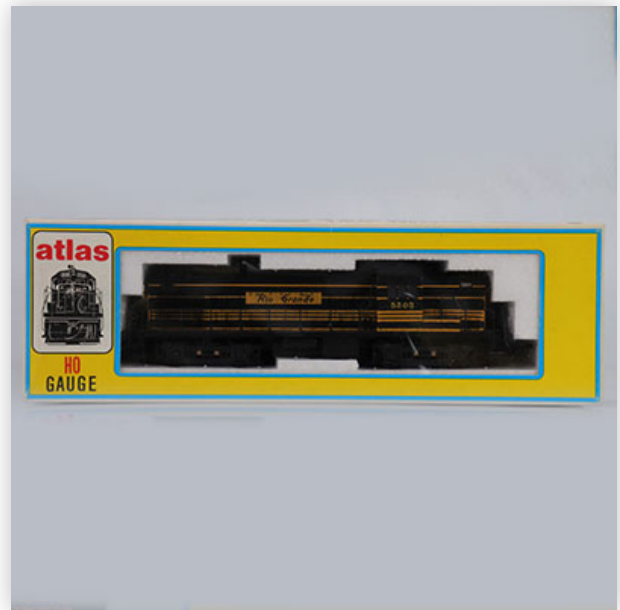
506 Atlas locomotive / Reference: 8151 / Type: RS3 Diesel (5203)

Référence: GFAB6655 — Poids: 425 g — Region: Amérique — Sizes: Avec boîte= H=45mm L=275mm — Condition: At first glance - very good condition - no restoration - no repair