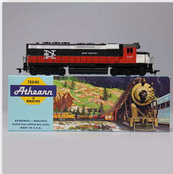
486 Athearn locomotive / Reference: 4103 / Type: SDP40 PWR

Référence: GFAB6635 — Poids: 535 g — Region: Amérique — Sizes: H=50mm L=230mm — Condition: At first glance - very good condition - no restoration - no repair