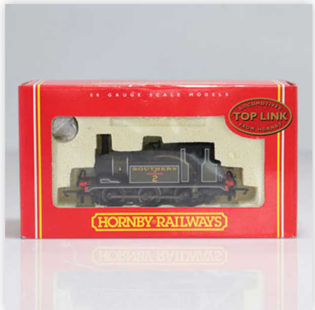
134 Hornby locomotive / Reference: R2063 / Type: SR TERRIER LOCO 0.6.0 / 2

Référence: GFAB6260 — Poids: 180 g — Sizes: L=110mm — Condition: At first glance - very good condition - no restoration - no repair