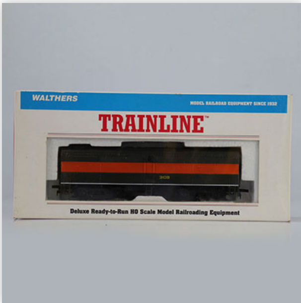
273 Walter locomotive / Reference: 931 262 / Type: Alco FB1 310 B

Référence: GFAB6407 — Poids: 520 g — Region: Amérique — Sizes: Avec boîte= H=45mm L=255mm — Condition: At first glance - very good condition - no restoration - no repair