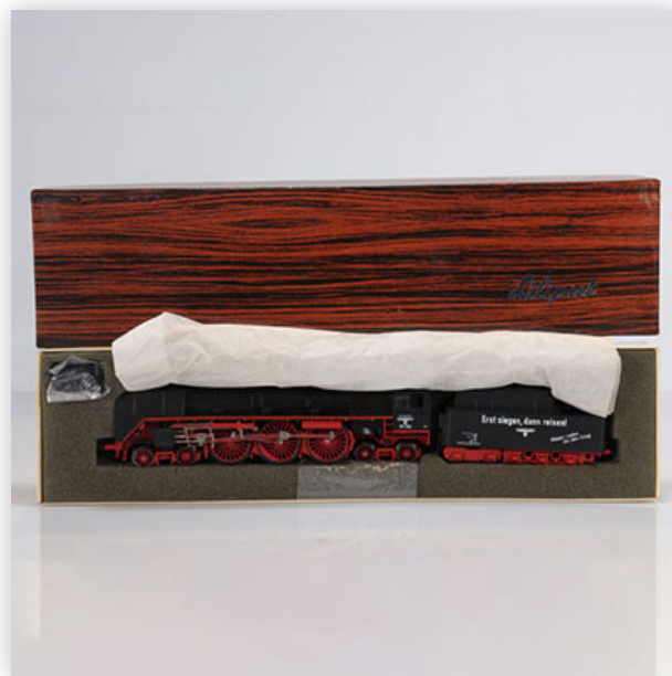
384 Liliput locomotive / Reference: 10504 / Type: steam 4-6-4 #05003 (Nazi...

Référence: GFAB6520 — Poids: 825 g — Sizes: L=310mm — Condition: At first glance - very good condition - no restoration - no repair