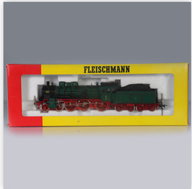
94 Fleischmann locomotive / Reference: 4800 / Type: 4-6-0 2412

Référence: GFAB6219 — Poids: 480 g — Region: Allemagne — Sizes: Avec boîte= H=50mm L=295mm — Condition: At first glance - very good condition - no restoration - no repair