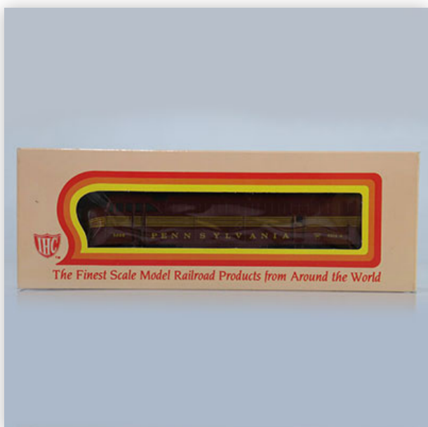
403 IHC locomotive / Reference: M586 / Type: FB Diesel A DUMMY 9506-A

Référence: GFAB6540 — Poids: 205 g — Region: Amérique — Sizes: Avec boîte= H=45mm L=250mm — Condition: At first glance - very good condition - no restoration - no repair