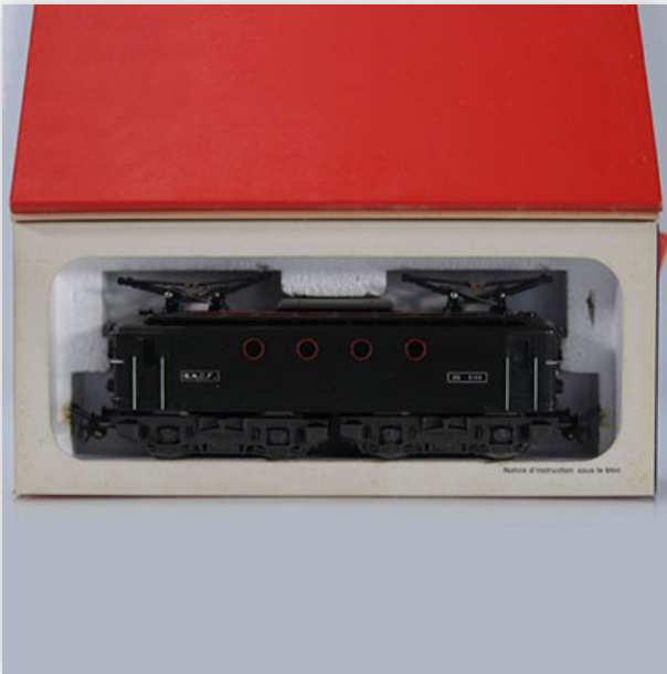
389 Meccano locomotive / Reference: 6386 (Hornby) / Type: BB8144

Référence: GFAB6525 — Poids: 325 g — Region: France — Sizes: Avec boîte= H=55mm L=200mm — Condition: At first glance - very good condition - no restoration - no repair