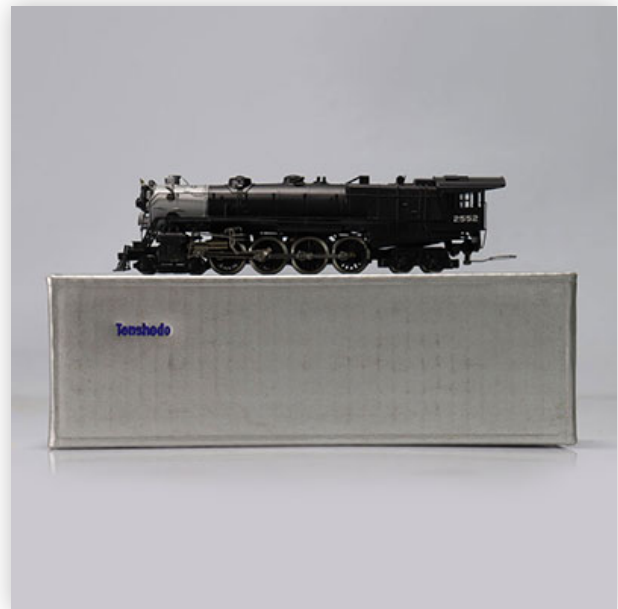
392 Tenshodo locomotive / Reference: 137 / Type: GN 4-8-4

Référence: GFAB6529 — Poids: 1.07 kg — Region: Amérique — Sizes: Avec boîte= 50mm L=290mm — Condition: At first glance - very good condition - no restoration - no repair