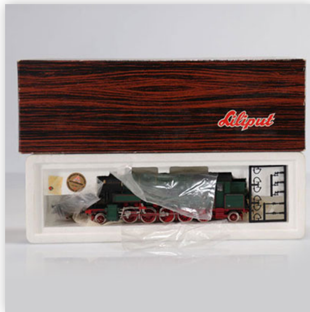
382 Liliput locomotive / Reference: 9500 / Type: Steam 02.10.02 95020

Référence: GFAB6518 — Poids: 605 g — Sizes: L=175mm — Condition: Brand new