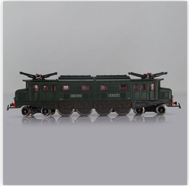
442 Jouef locomotive / Reference: - / Type: 2D2-5516 electromotor

Référence: GFAB6586 — Poids: 340 g — Region: France — Sizes: H=50mm L=200mm — Condition: At first glance - very good condition - no restoration - no repair