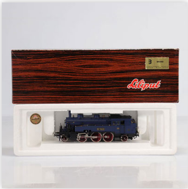
373 Liliput locomotive / Reference: 7500 / Type: 2.6.2 / VI922

Référence: GFAB6509 — Poids: 480 g — Sizes: L=150mm — Condition: At first glance - very good condition - no restoration - no repair