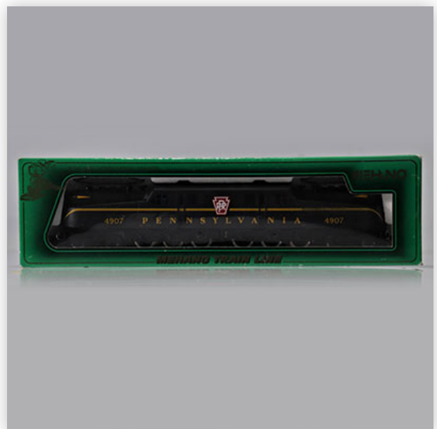
512 Mehano Locomotive / Reference: M9655 First PRR Green One Stripe #4907...

Référence: GFAB6661 — Poids: 730 g — Region: Amérique — Sizes: Avec boîte= H=40mm L=330mm — Condition: At first glance - very good condition - no restoration - no repair