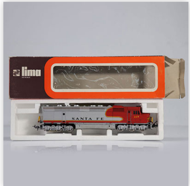
276 Lima locomotive / Reference: 8071L / Type: FP45 #107

Référence: GFAB6410 — Poids: 521 g — Sizes: Locomotive L=260mm — Condition: At first glance - very good condition - no restoration - no repair