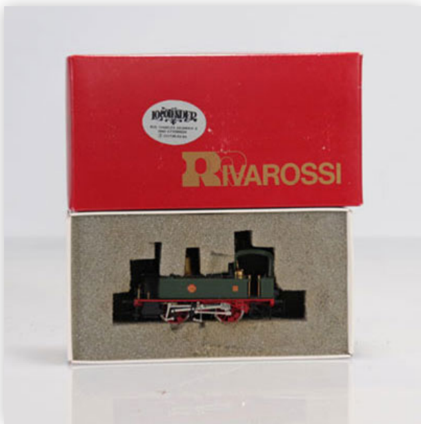
39 Rivarossi locomotive / Reference: 1165 / Type: 206

Référence: GFAB6163 — Poids: 200 g — Sizes: L=105mm — Condition: At first glance - very good condition - no restoration - no repair