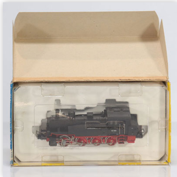
262 Locomotive Trix / Reference: 2412 / Type: Locotender 0-8-0 # 92692

Référence: GFAB6396 — Poids: 362 g — Sizes: L=135mm — Condition: At first glance - very good condition - no restoration - no repair