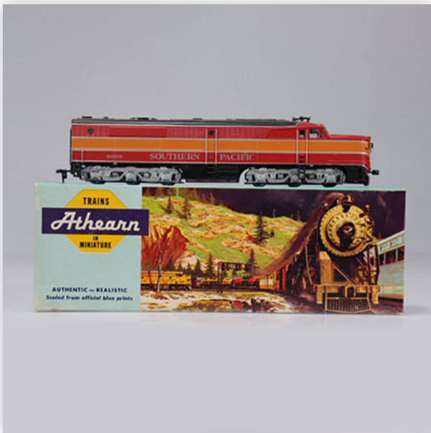
477 Athearn locomotive / Reference: 3306 / Type: PA-1 PW Diesel (6009)

Référence: GFAB6626 — Poids: 540 g — Region: Amérique — Sizes: H=50mm L=230mm — Condition: At first glance - very good condition - no restoration - no repair