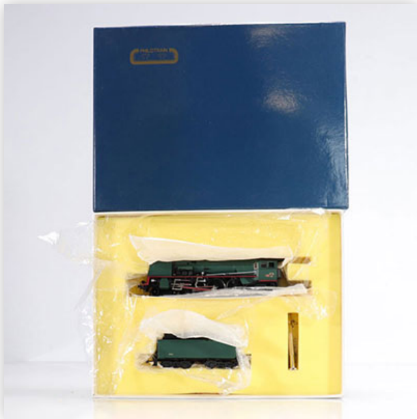
465 Philotrain locomotive / Reference: A1-177 / Type: Type 1

Référence: GFAB6614 — Poids: 1.23 kg — Sizes: L=290mm — Condition: At first glance - very good condition - no restoration - no repair