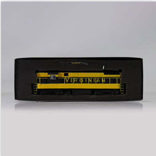
215 Bachmann locomotive / Reference: 81211 / Type: Fairbanks Morse H16-44...

Référence: GFAB6347 — Poids: 480 g — Region: Amérique — Sizes: Avec boîte= H=50mm L=255mm — Condition: At first glance - very good condition - no restoration - no repair