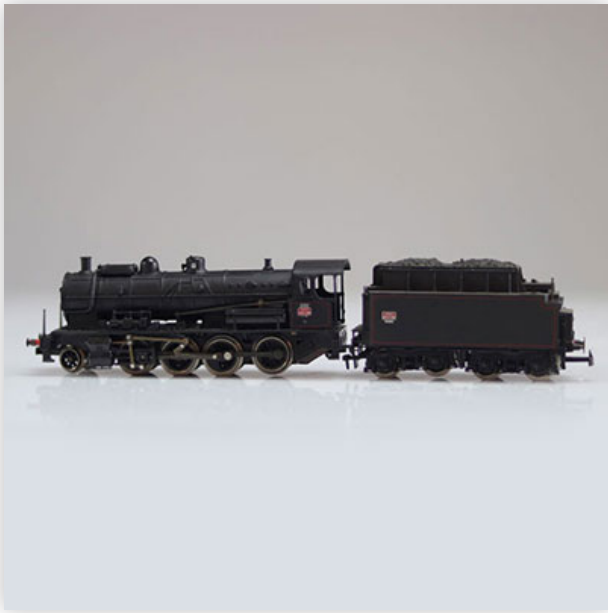
441 Jouef locomotive / Reference: - / Type: steam 2-8-0 #140.c.180 Verdun

Référence: GFAB6581 — Poids: 240 g — Sizes: L=230mm — Condition: At first glance - very good condition - no restoration - no repair