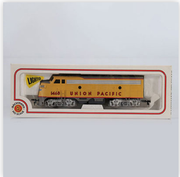
210 Bachmann locomotive / Reference: 41 615 01 / Type: EMD F9 Diesel (1468)

Référence: GFAB6342 — Poids: 380 g — Region: Amérique — Sizes: Avec boîte= H=45mm L=255mm — Condition: At first glance - very good condition - no restoration - no repair