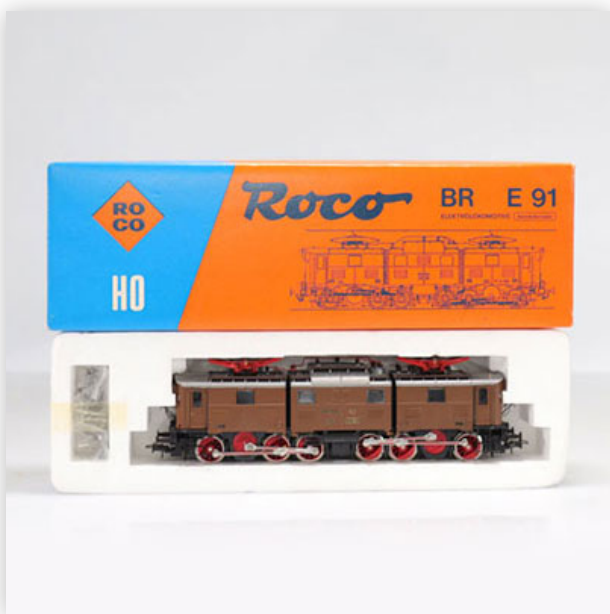
291 Roco locomotive / Reference: 04139B / Type: Locomotive Type 191/22503

Référence: GFAB6425 — Poids: 490 g — Sizes: L=190mm — Condition: At first glance - very good condition - no restoration - no repair