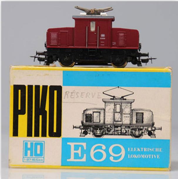
325 Piko locomotive / Reference: 6210/5 / Type: E6905 Elektrische Lokomotive

Référence: GFAB6460 — Poids: 260 g — Region: Allemagne — Sizes: H=55mm L=105mm — Condition: At first glance - very good condition - no restoration - no repair