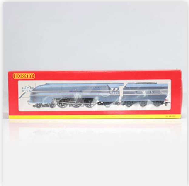
118 Hornby locomotive / Reference: R2206 / Type: 6220 Coronation Class 4.6.2.

Référence: GFAB6244 — Poids: 590 g — Sizes: L=300mm — Condition: At first glance - very good condition - no restoration - no repair