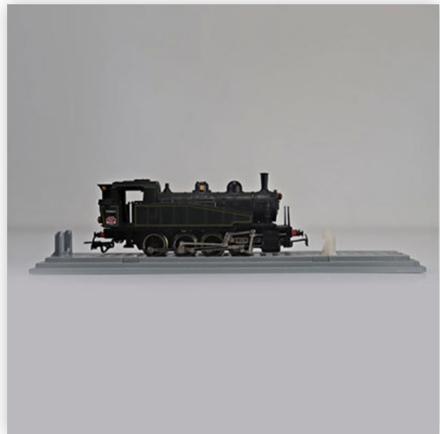
432 Jouef locomotive / Reference: 829400 / Type: steam 141 TA (040-1A-28 Batignolles)

Référence: GFAB6571 — Poids: 290 g — Region: France — Sizes: Avec boîte= H=65mm L=225mm — Condition: At first glance - very good condition - no restoration - no repair