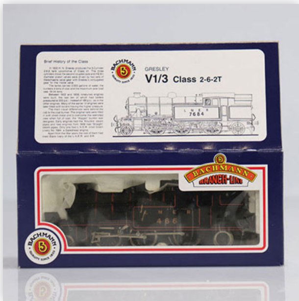
189 Bachmann locomotive / Reference: 31603 /466 / Type: GRESLEY V1 / 3 Class...

Référence: GFAB6317 — Poids: 375 g — Sizes: L=165mm — Condition: At first glance - very good condition - no restoration - no repair