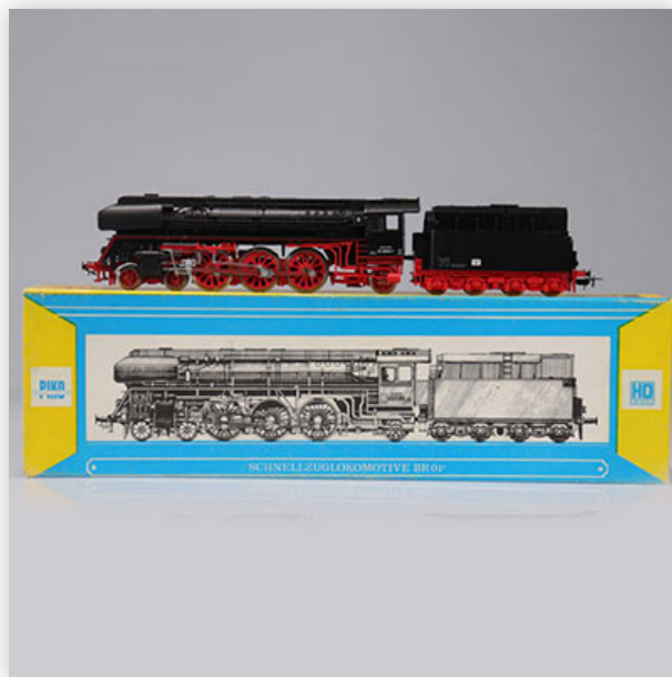
330 Piko locomotive / Reference: 05 6327 / Type: BR01 010503-1

Référence: GFAB6465 — Poids: 680 g — Region: Allemagne — Sizes: H=50mm L=300mm — Condition: At first glance - very good condition - no restoration - no repair