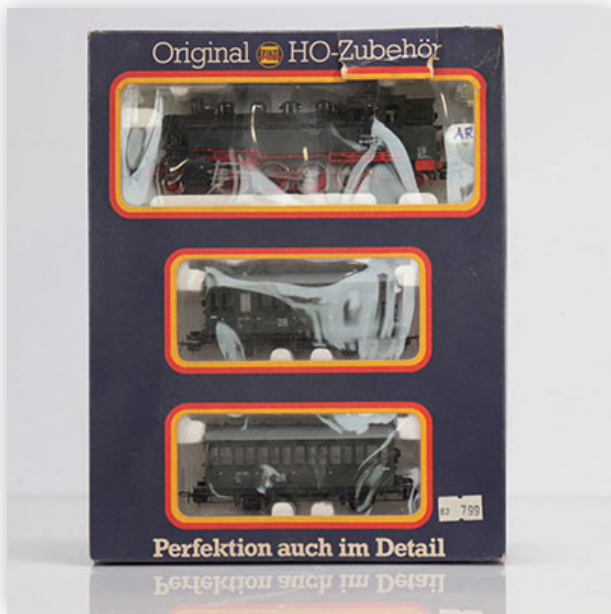
365 Piko locomotive / Reference: 5/0723-000 / Type: locotender 2-8-2 # 86...

Référence: GFAB6501 — Poids: 550 g — Sizes: L=380mm — Condition: At first glance - very good condition - no restoration - no repair