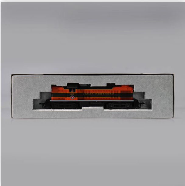
313 Kato locomotive / Reference: 37-2302 / Type: Diesel RS-2 #217

Référence: GFAB6448 — Poids: 530 g — Region: Amérique — Sizes: Avec boîte= H=60mm L=320mm — Condition: At first glance - very good condition - no restoration - no repair