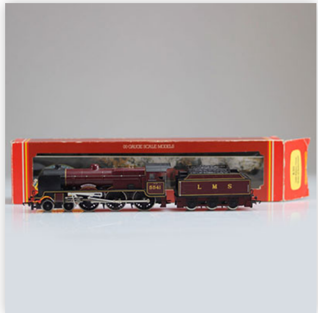
140 Hornby locomotive / Reference: R311 / Type: 4.6.0. Patriot Class "Duke"...

Référence: GFAB6266 — Poids: 490 g — Sizes: L=260mm — Condition: At first glance - very good condition - no restoration - no repair