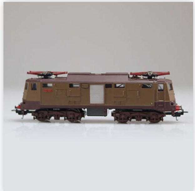
284 Lima locomotive / Reference: - / Type: electric motor E424143

Référence: GFAB6418 — Poids: 270 g — Sizes: L=190mm — Condition: At first glance - very good condition - no restoration - no repair