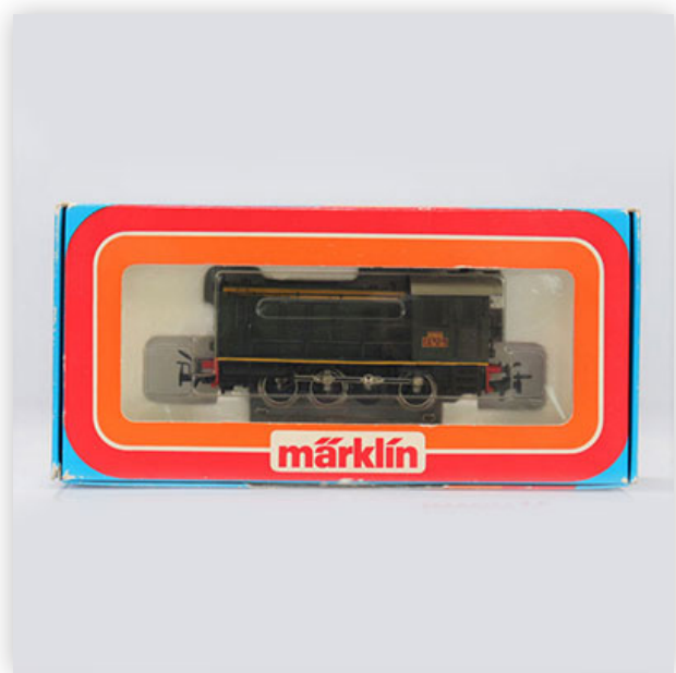
231 Marklin locomotive / Reference: 3145 / Type: Y50 101 Amiens

Référence: GFAB6365 — Poids: 250 g — Region: Allemagne — Sizes: Avec boîte= H=50mm L=195mm — Condition: At first glance - very good condition - no restoration - no repair