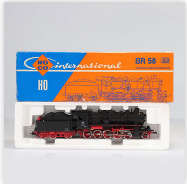
294 Roco locomotive / Reference: 4112 / Type: BR58 2-10-0 581556

Référence: GFAB6428 — Poids: 460 g — Sizes: L=210mm — Condition: At first glance - very good condition - no restoration - no repair