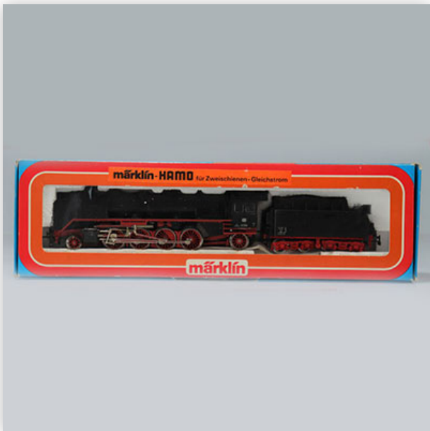
235 Marklin locomotive / Reference: 8382 / Type: 2.8.2 41334

Référence: GFAB6369 — Poids: 610 g — Region: Allemagne — Sizes: Avec boîte= H=55mm L=330mm — Condition: At first glance - very good condition - no restoration - no repair