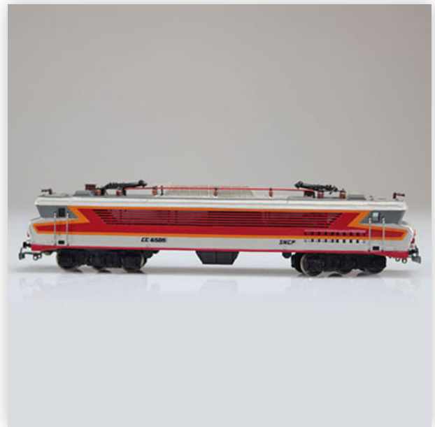
448 Jouef locomotive / Reference: - / type: locomotive CC 6505

Référence: GFAB6594 — Poids: 315 g — Sizes: L=230mm — Condition: At first glance - very good condition - no restoration - no repair