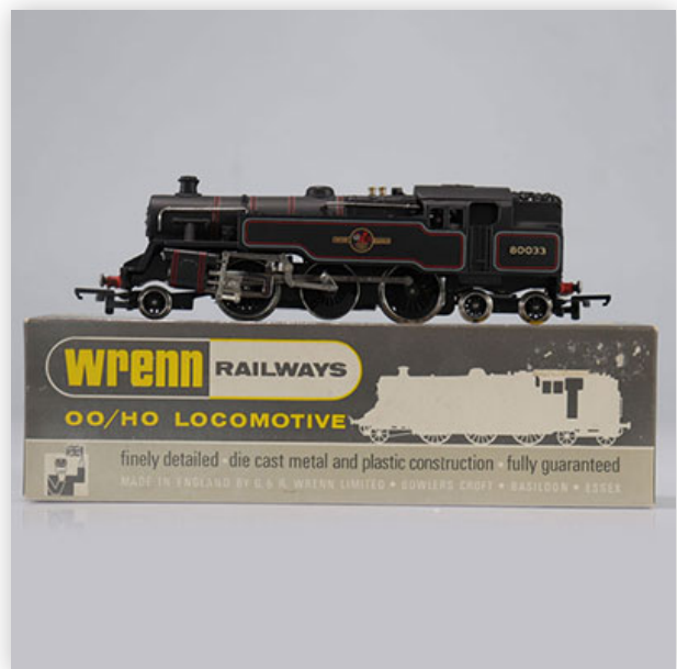
116 Wrenn locomotive / Reference: W2218 / 80033 / Type: 2.6.4. Tank

Référence: GFAB6241 — Poids: 590 g — Region: England — Sizes: Avec boîte= H=45mm L=230mm — Condition: At first glance - very good condition - no restoration - no repair