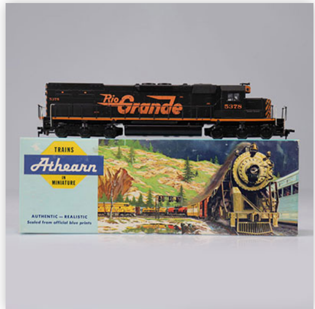
472 Athearn locomotive / Reference: 4503 / Type: SD40T 2 PWR (5378)

Référence: GFAB6621 — Poids: 545 g — Region: Amérique — Sizes: H=55mm L=250mm — Condition: At first glance - very good condition - no restoration - no repair