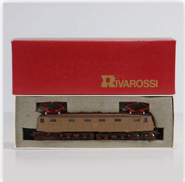
36 Rivarossi locomotive / Reference: 1478 / Type: E 428 137

Référence: GFAB6160 — Poids: 630 g — Sizes: L=220mm — Condition: At first glance - very good condition - no restoration - no repair