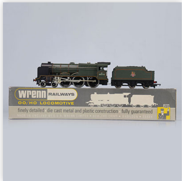
110 Wrenn locomotive / Reference: W2262 / 46110 / Type: 4.6.0 Royal Scot

Référence: GFAB6235 — Poids: 810 g — Region: England — Sizes: Avec boîte= H=45mm L=355mm — Condition: At first glance - very good condition - no restoration - no repair