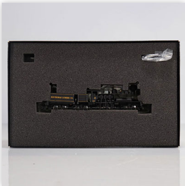
199 Bachmann locomotive / Reference: 81904 Spectrum / Type: 80 Ton Three Truck...

Référence: GFAB6328 — Poids: 650 g — Sizes: L=200mm — Condition: At first glance - very good condition - no restoration - no repair