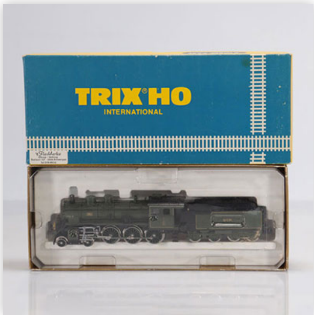
261 Trix locomotive / Reference: 2408 / Type: locomotive 4-6-0 # 3894

Référence: GFAB6395 — Poids: 588 g — Sizes: L=225mm — Condition: At first glance - very good condition - no restoration - no repair