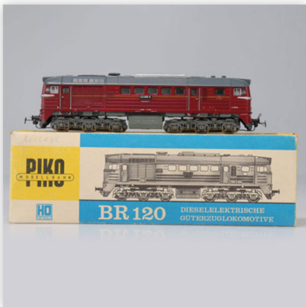
323 Piko locomotive / Reference: 190/21 / Type: BR120 Diesellokomotive

Référence: GFAB6458 — Poids: 430 g — Region: Allemagne — Sizes: H=55mm L=185mm — Condition: At first glance - very good condition - no restoration - no repair