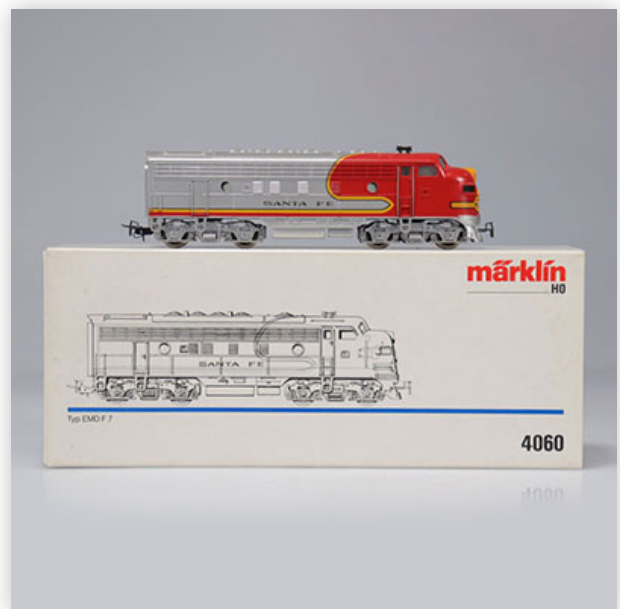
248 Marklin locomotive / Reference: 3060 & 4060 / Type: Electric Diesel Typemd...

Référence: GFAB6382 — Poids: 520 g — Region: France — Sizes: H=50mm L=170mm — Condition: At first glance - very good condition - no restoration - no repair