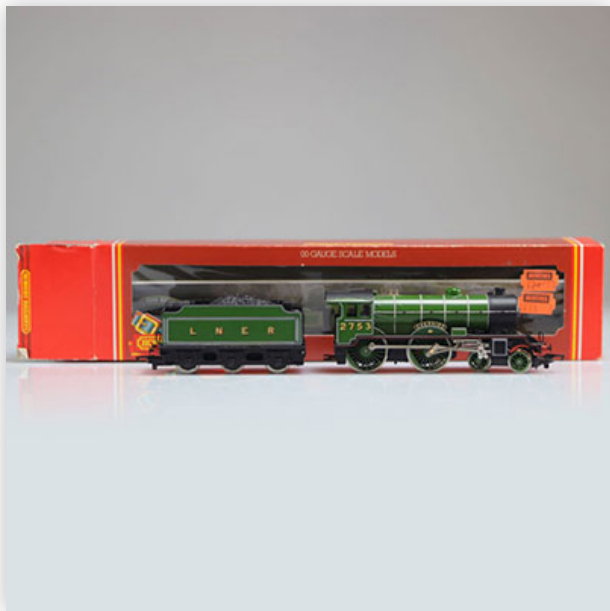
151 Hornby locomotive / Reference: R378 / Type: Class D49 / 1 Locomotive "Cheshire"...

Référence: GFAB6277 — Poids: 440 g — Sizes: L=400mm — Condition: At first glance - very good condition - no restoration - no repair