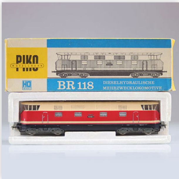
361 Piko locomotive / Reference: 199/20? / Type: Dieselhydraulische Lokomotive...

Référence: GFAB6496 — Poids: 235 g — Sizes: L=220mm — Condition: At first glance - very good condition - no restoration - no repair