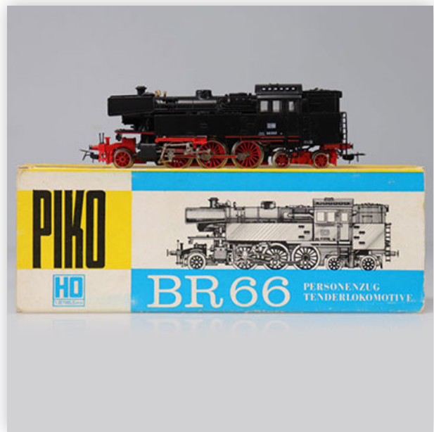
322 Piko locomotive / Reference: 5 6301 / Type: BR66

Référence: GFAB6457 — Poids: 420 g — Region: Allemagne — Sizes: H=60mm L=175mm — Condition: At first glance -average condition - no restoration - no repair