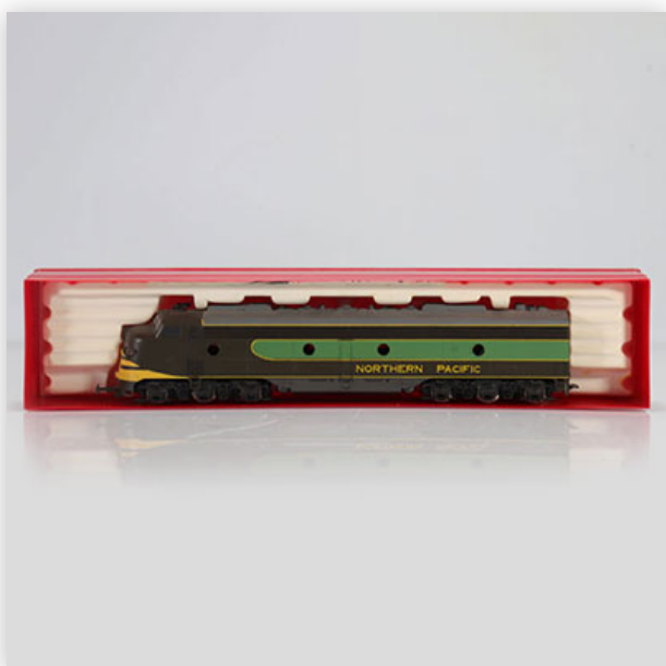
55 Rivarossi locomotive / Reference: 1825 / Type: EMD-E8 electric diesel

Référence: GFAB6179 — Poids: 330 g — Sizes: Locomotive L=255mm — Condition: At first glance - very good condition - no restoration - no repair