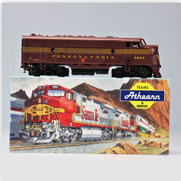
495 Athearn locomotive / Reference: 3205 / Type: F7A Super Power Sp Passenger...

Référence: GFAB6644 — Poids: 540 g — Region: Amérique — Sizes: H=45mm L=175mm — Condition: At first glance - very good condition - no restoration - no repair