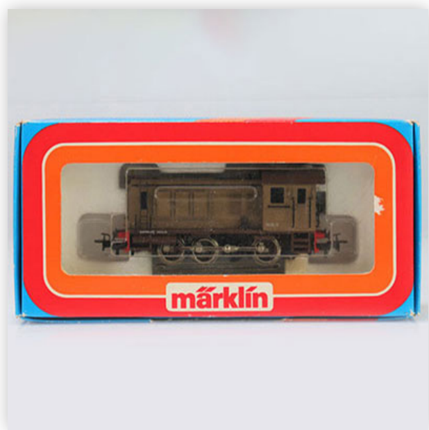
230 Marklin locomotive / Reference: 3146 / Type: Diesel 236002

Référence: GFAB6364 — Poids: 250 g — Region: Allemagne — Sizes: Avec boîte= H=55mm L=195mm — Condition: At first glance - very good condition - no restoration - no repair