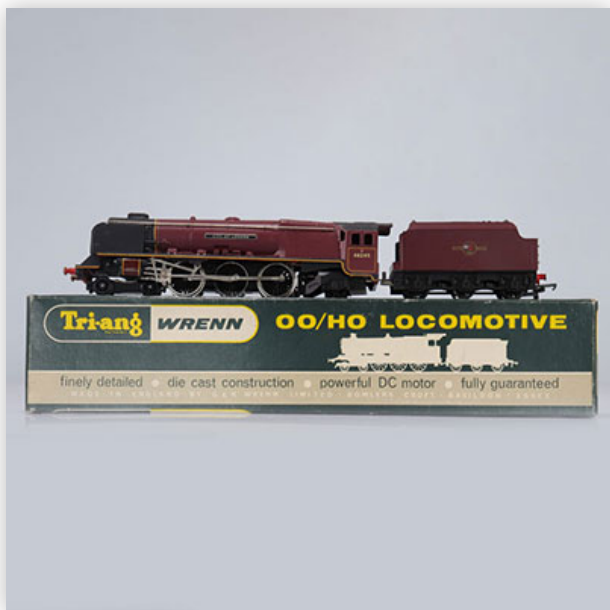
101 Locomotive Wrenn / Reference: W2226 / 46245 / Type: City of London 4.6.2

Référence: GFAB6226 — Poids: 810 g — Region: England — Sizes: Avec boîte= H=45mm L=355mm — Condition: At first glance - very good condition - no restoration - no repair