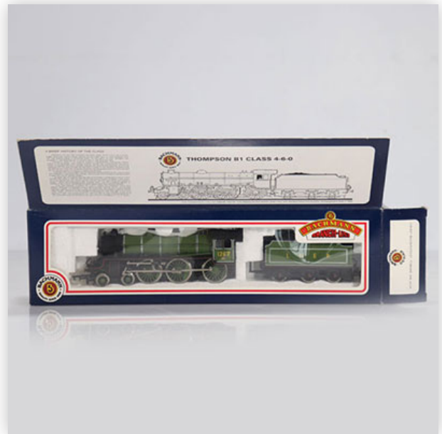
204 Bachmann locomotive / Reference: 31700 / Type: Thompson B1 Class 4-6-0...

Référence: GFAB6333 — Poids: 400 g — Sizes: L=270mm — Condition: At first glance - very good condition - no restoration - no repair