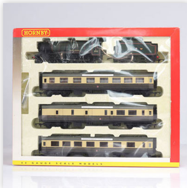
122 Hornby locomotive / Reference: R2025 / Type: 4.6.0 1004 County of Somerset

Référence: GFAB6248 — Poids: 1.20 kg — Sizes: L=1000mm — Condition: At first glance - very good condition - no restoration - no repair