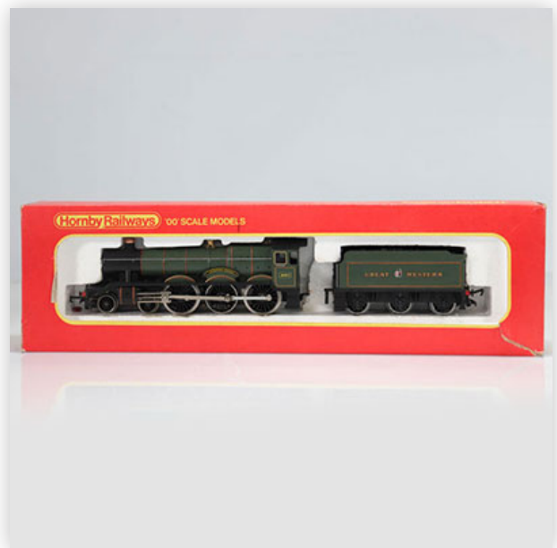
144 Hornby locomotive / Reference: R759 / Type: 4.6.0. Hall Class Locomotive...

Référence: GFAB6270 — Poids: 470 g — Sizes: L=260mm — Condition: At first glance - very good condition - no restoration - no repair