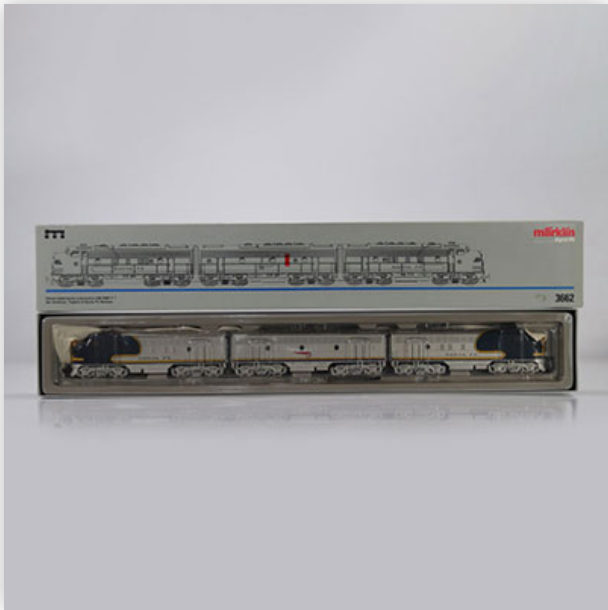
253 Marklin locomotive / Reference: 3662 / Type: Dieselelektrische GM EMD...

Référence: GFAB6387 — Poids: 1.65 kg — Region: Amérique — Sizes: Avec boîte= H=55 mm L=600mm — Condition: At first glance - very good condition - no restoration - no repair