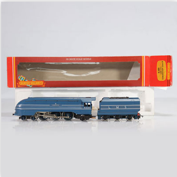
163 Hornby locomotive / Reference: R685 / Type: 4.6.2 Coronation Class 7p...

Référence: GFAB6289 — Poids: 500 g — Sizes: L=300mm — Condition: At first glance - very good condition - no restoration - no repair