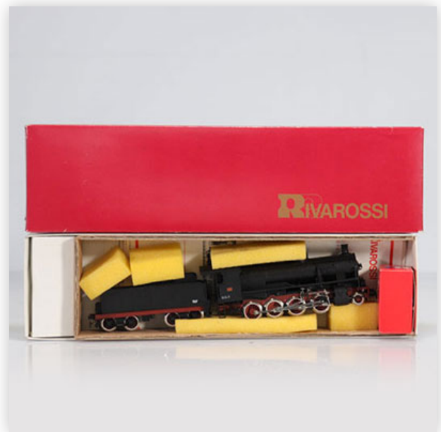
32 Rivarossi locomotive / Reference: M1161 / Type: GR 740 387

Référence: GFAB6156 — Poids: 470 g — Sizes: L=240mm — Condition: At first glance - very good condition - no restoration - no repair