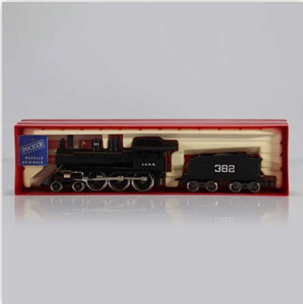
57 Rivarossi locomotive / Reference: 808 / 2L / PO Poach / Type: Steam locomotive...

Référence: GFAB6181 — Poids: 380 g — Sizes: Locomotive L=235mm — Condition: At first glance - very good condition - no restoration - no repair