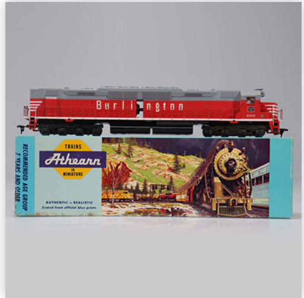
482 Athearn locomotive / Reference: 4282 / Type: DD40 2 MOTORS

Référence: GFAB6631 — Poids: 0 g — Region: Amérique — Sizes: H=55mm L=310mm — Condition: At first glance - very good condition - no restoration - no repair