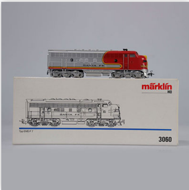
249 Marklin locomotive / Reference: 3060 & 4060 / Type: Electric Diesel Typemd...

Référence: GFAB6383 — Poids: 635 g — Region: Allemagne — Sizes: Avec la boîte= H=65mm L=270mm — Condition: At first glance - very good condition - no restoration - no repair