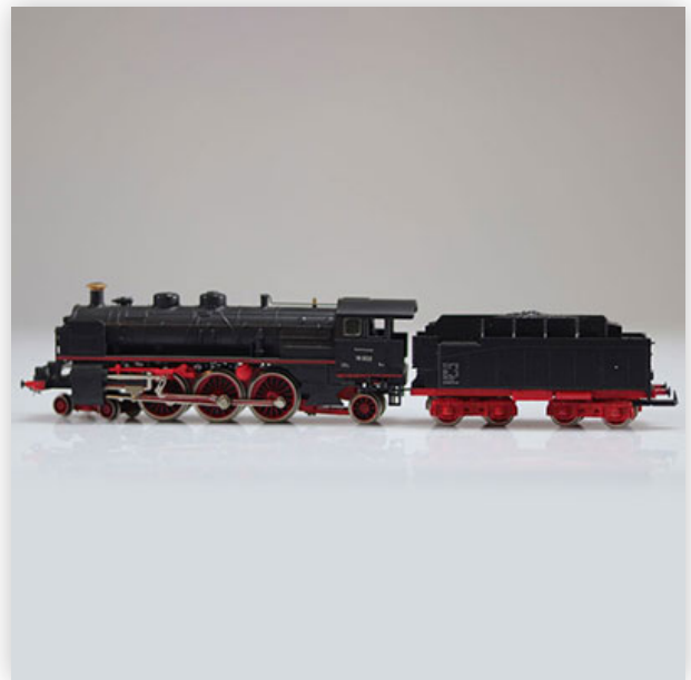
288 Lima locomotive / Reference: - / Type: steam 4-6-2 18505

Référence: GFAB6422 — Poids: 330 g — Sizes: L=270mm — Condition: At first glance - very good condition - no restoration - no repair