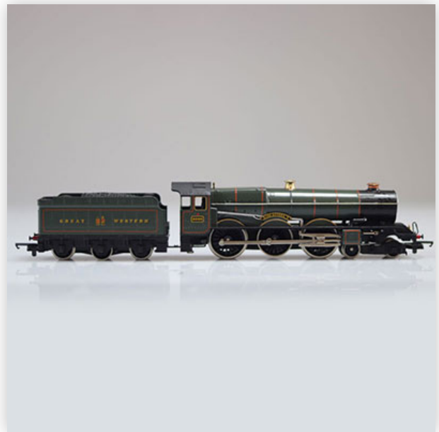
280 Lima locomotive / Reference: - / Type: Steam 4-6-0 King George V #6000

Référence: GFAB6414 — Poids: 306 g — Sizes: L=270mm — Condition: At first glance - very good condition - no restoration - no repair