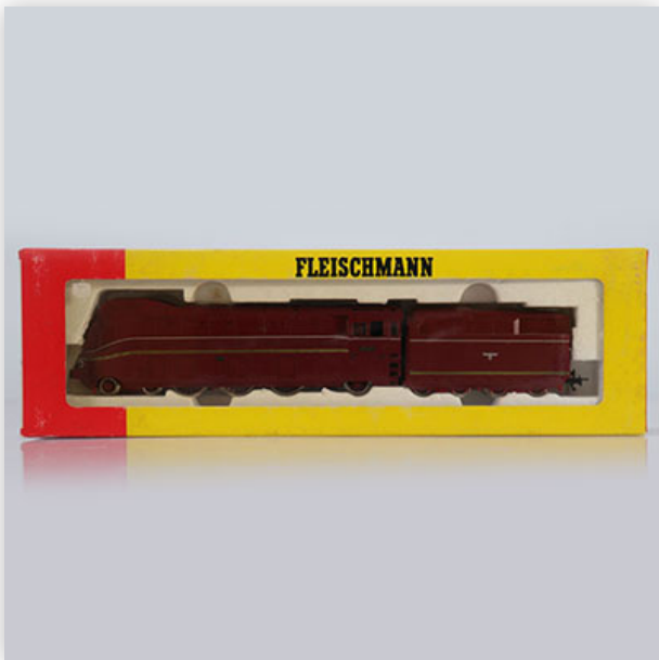
95 Fleischmann locomotive / Reference: 4173 / Type: 03 1001

Référence: GFAB6220 — Poids: 730 g — Region: Allemagne — Sizes: Avec boîte= H=50mm L=340mm — Condition: At first glance - very good condition - no restoration - no repair