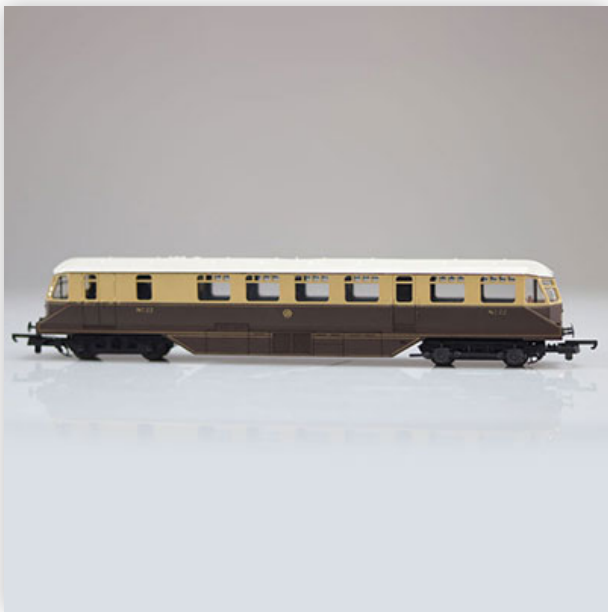
285 Lima locomotive / Reference: - / Type: Selfrail n° 22

Référence: GFAB6419 — Poids: 360 g — Sizes: L=280mm — Condition: At first glance - very good condition - no restoration - no repair