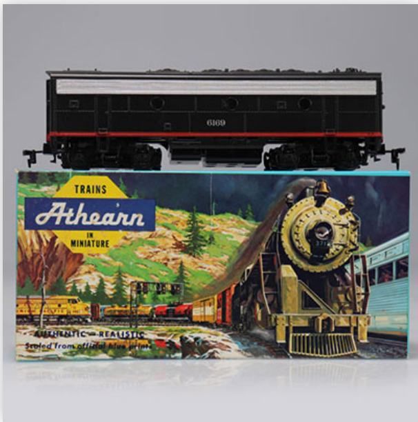
469 Athearn locomotive / Reference: 3242 / Type: F7B Super PWR Black Widow...

Référence: GFAB6618 — Poids: 540 g — Region: Amérique — Sizes: H=50mm L=170mm — Condition: At first glance ? good condition - no restoration - no repair