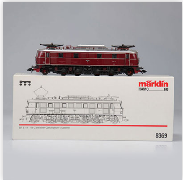
246 Marklin locomotive / Reference: 8369 / Type: E19 Electromotive

Référence: GFAB6380 — Poids: 785 g — Region: France — Sizes: H=50mm L=195mm — Condition: At first glance - very good condition - no restoration - no repair