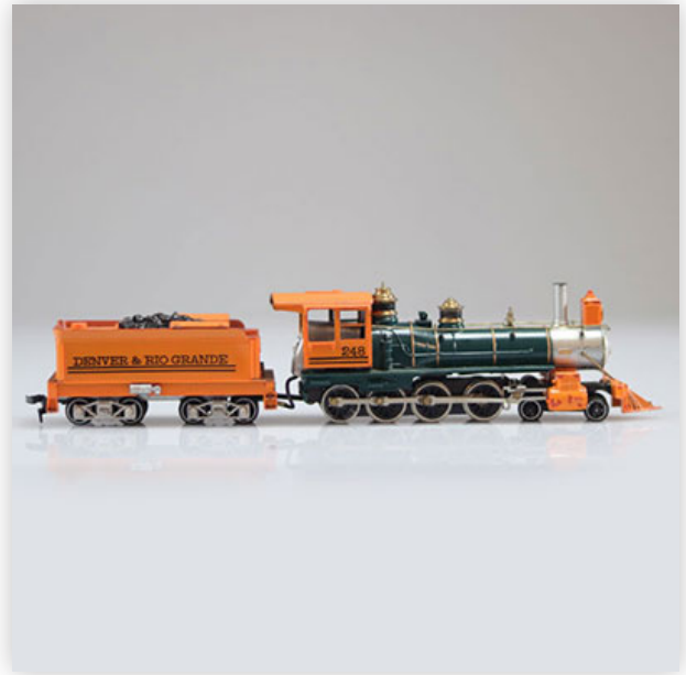
414 Mantua locomotive / Reference: Tyco / Type: 4-8-0 #248

Référence: GFAB6552 — Poids: 390 g — Sizes: L=250mm — Condition: At first glance - very good condition - no restoration - no repair