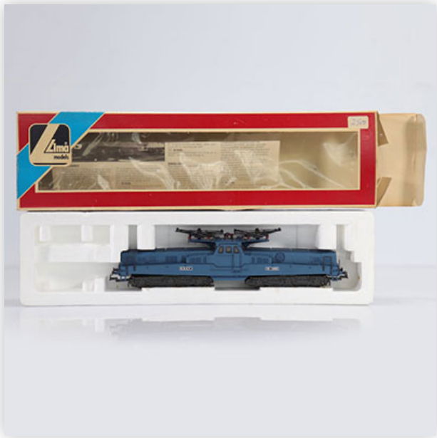
277 Lima locomotive / Reference: 8169L / Type: CC14100 #CC-14166

Référence: GFAB6411 — Poids: 315 g — Sizes: L=220mm — Condition: At first glance - very good condition - no restoration - no repair