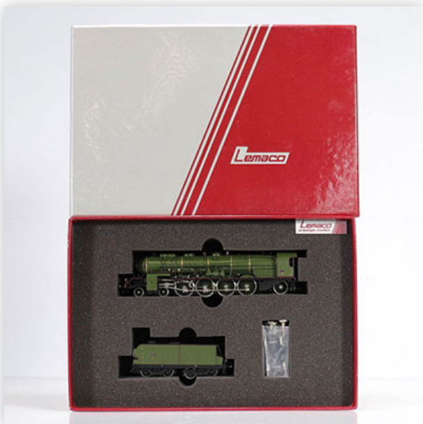
467 Lemaco locomotive / Reference: HO-077 / B / Type: 241 A 36

Référence: GFAB6616 — Poids: 1.10 kg — Sizes: L=300mm — Condition: At first glance - very good condition - no restoration - no repair