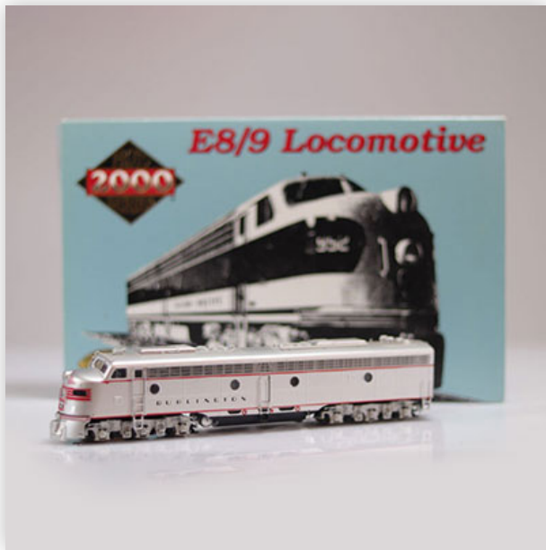
501 Proto series 2002 locomotive / Reference: 8045 / Type: E8 / 9

Référence: GFAB6650 — Poids: 930 g — Sizes: L=630mm — Condition: At first glance - very good condition - no restoration - no repair