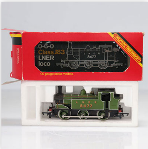
131 Hornby locomotive / Reference: R252 / Type: 0.6.0 J.83 Class Loco 8477

Référence: GFAB6257 — Poids: 250 g — Sizes: L=120mm — Condition: At first glance - very good condition - no restoration - no repair