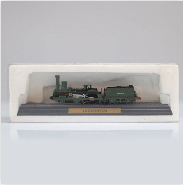
449 Locomotive Model / Reference: 2 115 217 / Type: North Crampton N ° 10

Référence: GFAB6595 — Poids: 141 g — Sizes: L=140mm — Condition: At first glance - very good condition - no restoration - no repair