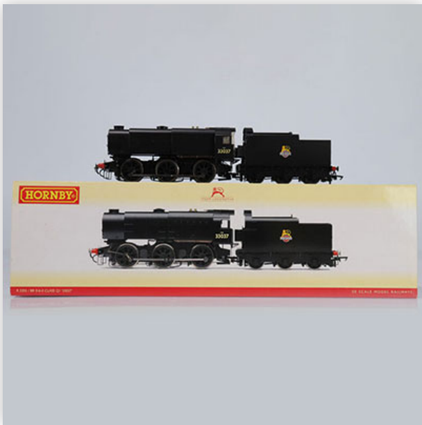
161 Hornby locomotive / Reference: R2355 / Type: 0.6.0. Class Qi 33037

Référence: GFAB6287 — Poids: 520 g — Region: England — Sizes: Avec boîte= H= 65mm L=360mm — Condition: At first glance - very good condition - no restoration - no repair