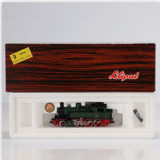
367 Liliput locomotive / Reference: 9100 / Type: T9 2.6.0

Référence: GFAB6503 — Poids: 375 g — Sizes: L=130mm — Condition: At first glance - very good condition - no restoration - no repair