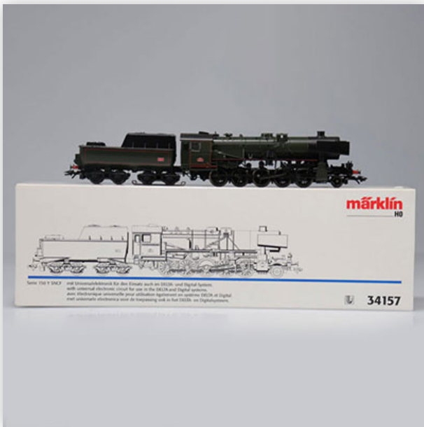
245 Marklin locomotive / Reference: 34157 / Type: series 150 y. 17

Référence: GFAB6379 — Poids: 760 g — Region: France — Sizes: H=50mm L=270mm — Condition: At first glance - very good condition - no restoration - no repair