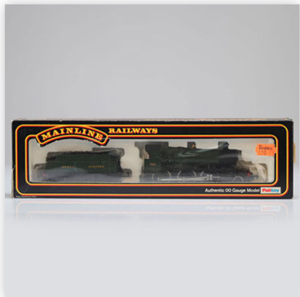
268 Mainline locomotive / Reference: 37090 /5322 / Type: 4300 Class 2-6-0

Référence: GFAB6402 — Poids: 378 g — Sizes: L=250mm — Condition: At first glance - very good condition - no restoration - no repair