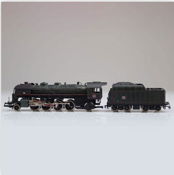
439 Jouef locomotive / Reference: - / Type: steam 2-8-2 #141r1264 Argentan

Référence: GFAB6578 — Poids: 500 g — Sizes: L=280mm — Condition: At first glance - very good condition - no restoration - no repair