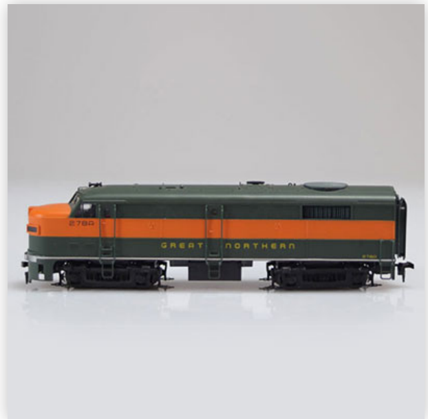
272 Mainline locomotive / Reference: - / Type: loco diesel 278a

Référence: GFAB6406 — Poids: 375 g — Sizes: L=190mm — Condition: At first glance - very good condition - no restoration - no repair