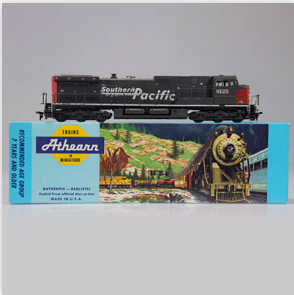
483 Athearn locomotive / Reference: 4906 / Type: C44-9 W Power #8125

Référence: GFAB6632 — Poids: 540 g — Region: Amérique — Sizes: H=55mm L=260mm — Condition: At first glance - very good condition - no restoration - no repair