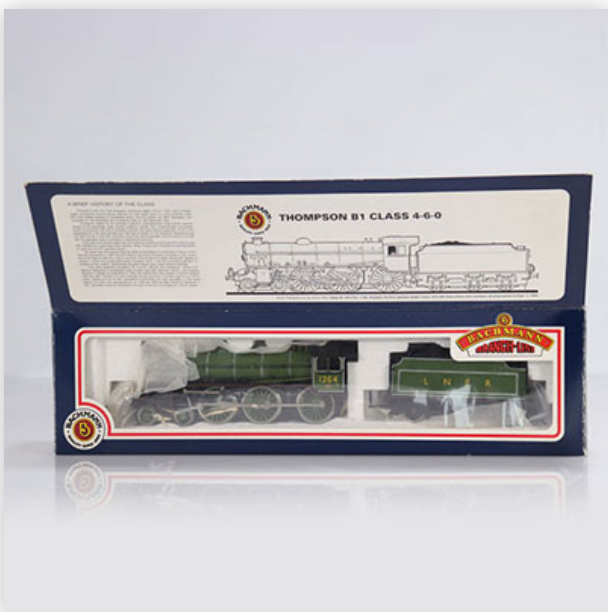
179 Bachmann locomotive / Reference: 31,700 / Type: B1 1264

Référence: GFAB6307 — Poids: 430 g — Sizes: L=250mm — Condition: At first glance - very good condition - no restoration - no repair