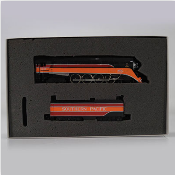
213 Bachmann locomotive / Reference: 31301 / Type: 4-6-8 GS4 Daylight #4449

Référence: GFAB6345 — Poids: 0 g — Region: Amérique — Sizes: Avec boîte= H=60mm L=340mm — Condition: At first glance - very good condition - no restoration - no repair