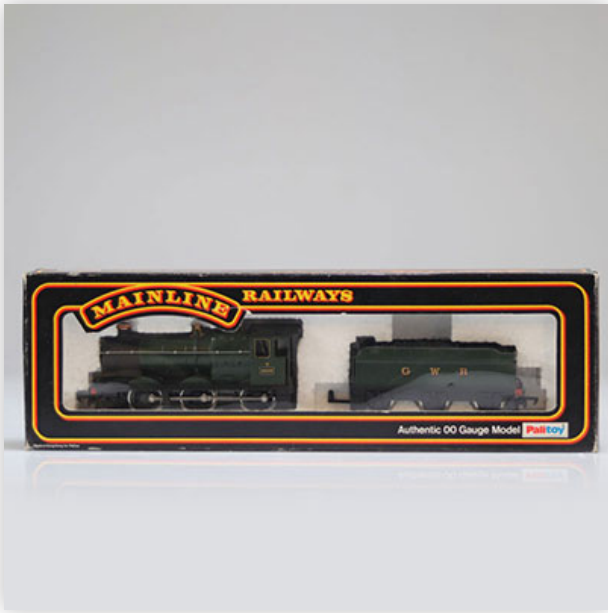
269 Mainline locomotive / Reference: 37058 /3205 / Type: 0-6-0 2251 Class...

Référence: GFAB6403 — Poids: 325 g — Sizes: L=235mm — Condition: At first glance - very good condition - no restoration - no repair