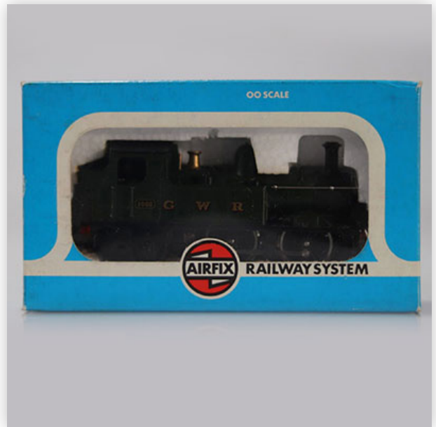
176 Airfix locomotive / Reference: 54152-7 / Type: 1400 Class Tank 1466

Référence: GFAB6303 — Poids: 230 g — Region: Amérique — Sizes: Avec boîte= H=45mm L=155mm — Condition: At first glance - very good condition - no restoration - no repair