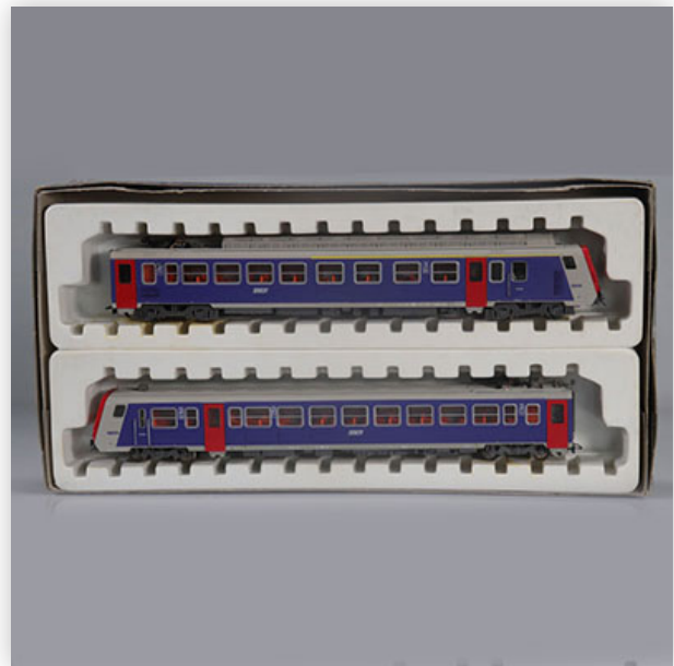
430 Jouef locomotive / Reference: 8622 00 / Type: Automotor 22 9509 and 19509

Référence: GFAB6569 — Poids: 510 g — Region: France — Sizes: Avec boîte= H=50mm L=355mm — Condition: At first glance - very good condition - no restoration - no repair