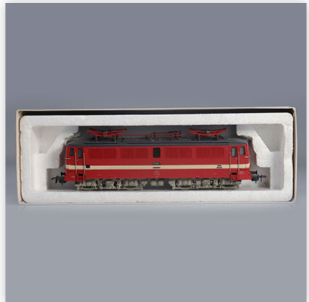
356 Piko locomotive / Reference: 5 6205 / Type: Schellzuglokomotive BR21

Référence: GFAB6491 — Poids: 500 g — Region: Allemagne — Sizes: Avec boîte= H=50mm L=260mm — Condition: At first glance - good condition ? engine repaired