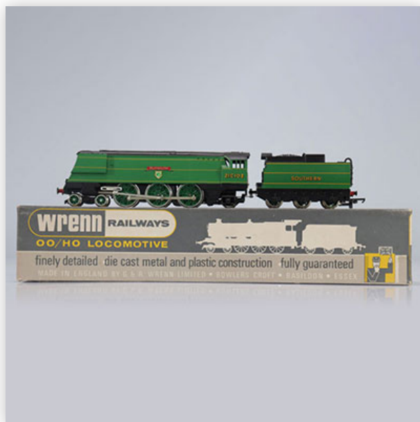
104 Locomotive Wrenn / Reference: W2266 / 21C103 / Type: Plymouth 4.6.2 SR

Référence: GFAB6229 — Poids: 750 g — Region: England — Sizes: Avec boîte= H=50mm L=355mm — Condition: At first glance - very good condition - no restoration - no repair