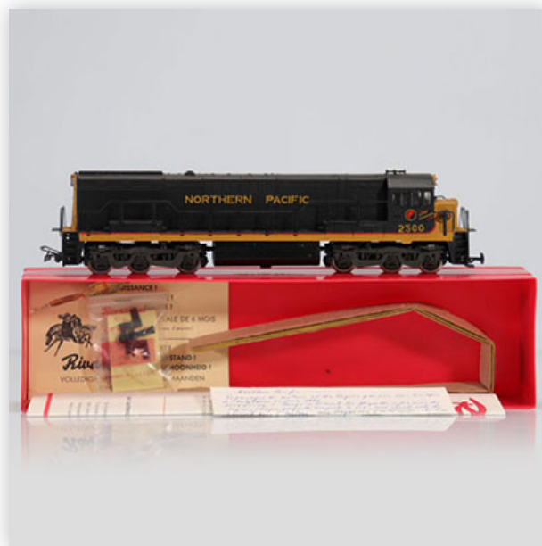
54 Rivarossi locomotive / Reference: 1814 / Type: Diesel G.E.U25C (2500)

Référence: GFAB6178 — Poids: 440 g — Sizes: Locomotive L=220mm — Condition: At first glance - very good condition - no restoration - no repair