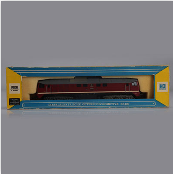
353 Piko locomotive / Reference: 5 6010 / Type: BR30 Dieselelektrische (130...

Référence: GFAB6488 — Poids: 540 g — Region: Allemagne — Sizes: Avec boîte= H=55mm L=340mm — Condition: At first glance - very good condition - no restoration - no repair