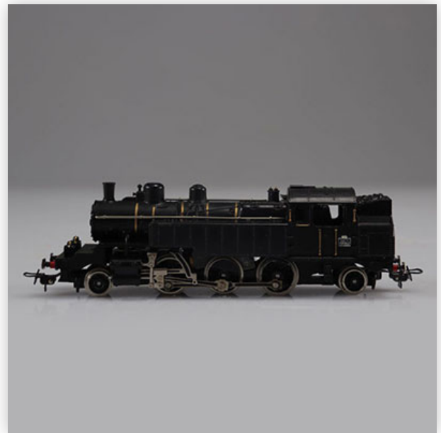
16 Meccano locomotive / Reference: 6200 / Type: Loco Steam 131 / Freight...

Référence: GFAB6528 — Poids: 200 g — Sizes: L=165mm — Condition: At first glance - very good condition - no restoration - no repair