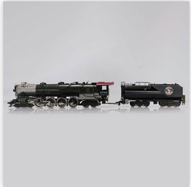
394 Tenshodo locomotive / Reference: 164 / Type: 4-8-4 Class S2 with tender

Référence: GFAB6531 — Poids: 1.48 kg — Region: Amérique — Sizes: Avec boîte= H=80mm L=330mm — Condition: At first glance - very good condition - no restoration - no repair