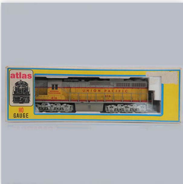
507 Atlas locomotive / Reference: 7002 / Type: SD24 Diesel (416 Defendable...)

Référence: GFAB6656 — Poids: 490 g — Region: Amérique — Sizes: Avec boîte= H=45mm L=275mm — Condition: At first glance - very good condition - no restoration - no repair