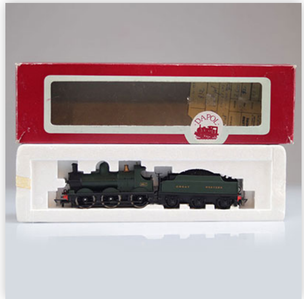
398 Dapol locomotive / Reference: D18A / Type: "Dean Goods" 2517

Référence: GFAB6535 — Poids: 300 g — Sizes: L=205mm — Condition: At first glance - very good condition - no restoration - no repair