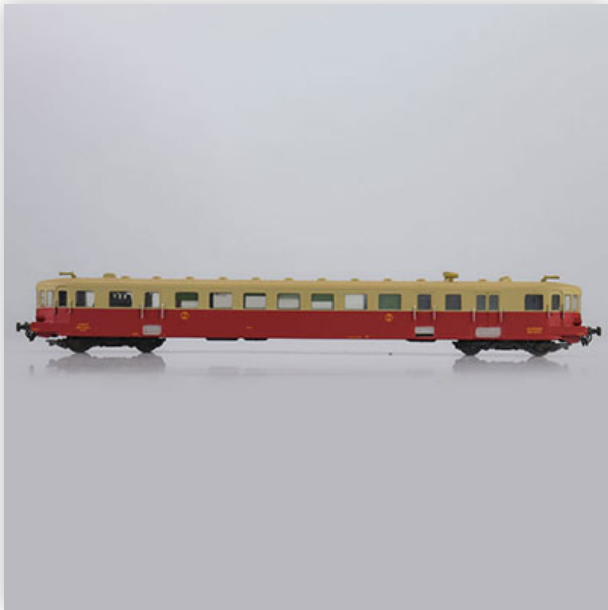
221 AS locomotive / Reference: 2300 / Type: Dietrich Autorail

Référence: GFAB6354 — Poids: 400 g — Region: France — Sizes: Avec la boite= H= 50mm L=340mm — Condition: At first glance - good condition - no restoration - no repair