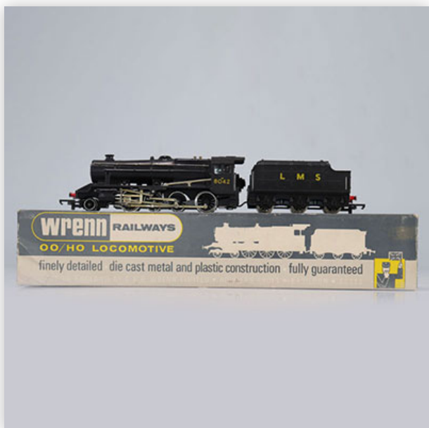
103 Locomotive Wrenn / Reference: W2225 / 8042 / Type: 2.8.0 Freight

Référence: GFAB6228 — Poids: 770 g — Region: England — Sizes: Avec boîte= H=50mm L=355mm — Condition: At first glance - good condition - no restoration - no repair