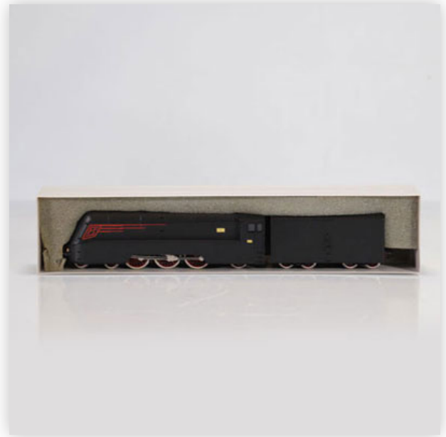
10 Rivarossi locomotive / Reference: 1153 / Type: A 691 026

Référence: GFAB6144 — Poids: 700 g — Sizes: L=285mm — Condition: At first glance - very good condition - no restoration - no repair