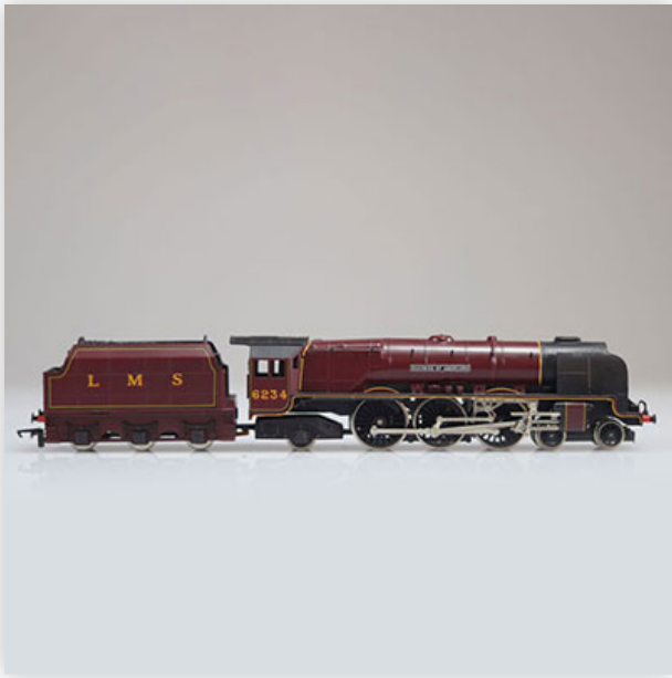
173 Hornby / Reference locomotive:? / Type: Duchess of Abercorn #6234 steam

Référence: GFAB6300 — Poids: 440 g — Sizes: L=290mm — Condition: At first glance - very good condition - no restoration - no repair