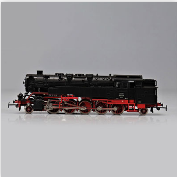
243 Marklin locomotive / Reference: 3308 / Type: 2.10.2: 85006

Référence: GFAB6377 — Poids: 490 g — Region: France — Sizes: H=50mm L=185mm — Condition: At first glance - very good condition - no restoration - no repair