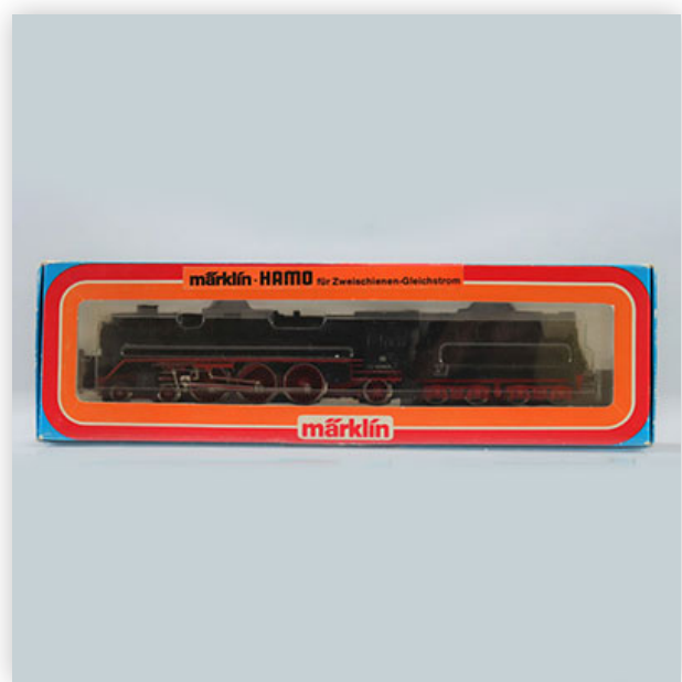
232 Marklin locomotive / Reference: 8310 / Type: 4.6.2 003160-9

Référence: GFAB6366 — Poids: 635 g — Region: Allemagne — Sizes: Avec boîte= H=55mm L=330mm — Condition: At first glance - very good condition - no restoration - no repair