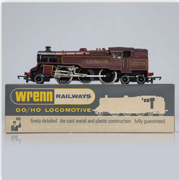
113 Locomotive Wrenn / Reference: W2219 / 2679 / Type: 2.6.4 Tank

Référence: GFAB6238 — Poids: 590 g — Region: England — Sizes: Avec boîte= H=45mm L=235mm — Condition: At first glance - very good condition - no restoration - no repair