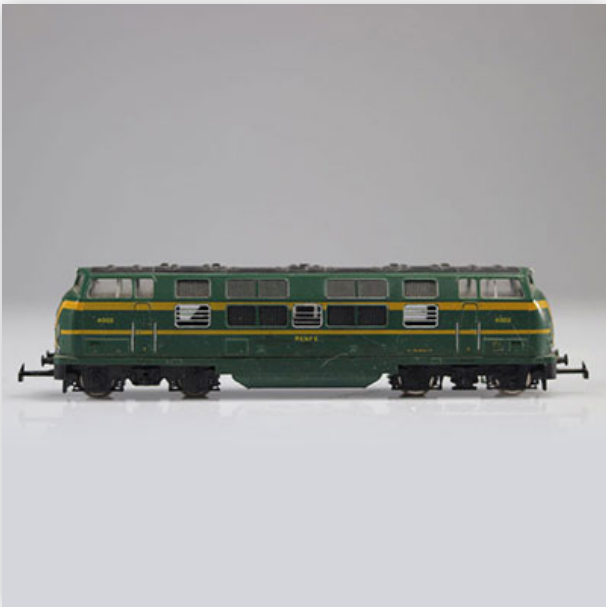
19 Jouef locomotive / Reference: same box / type: loco diesel 4003

Référence: GFAB6582 — Poids: 250 g — Sizes: L=220mm — Condition: At first glance - very good condition - no restoration - no repair