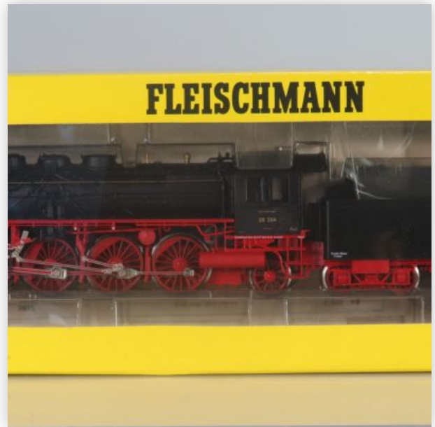
82 Fleischmann locomotive / Reference: 4139 / Type: 4139 2-8-2

Référence: GFAB6207 — Poids: 790 g — Region: Allemagne — Sizes: Avec boîte= H=50mm L=340mm — Condition: At first glance - very good condition - no restoration - no repair