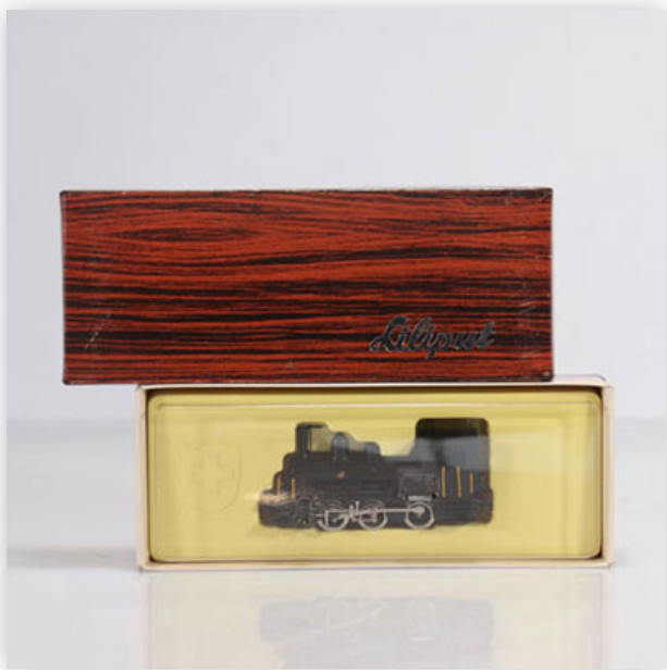
375 Liliput locomotive / Reference: 3350 / Type: 8495

Référence: GFAB6511 — Poids: 240 g — Sizes: L=100mm — Condition: At first glance - very good condition - no restoration - no repair