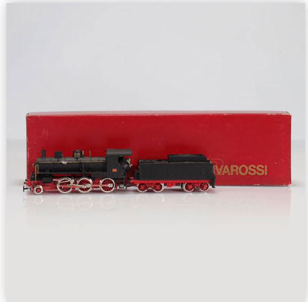
30 Rivarossi locomotive / Reference: 1150 / Type: GR 625 058

Référence: GFAB6154 — Poids: 370 g — Sizes: L=235mm — Condition: At first glance - very good condition - no restoration - no repair