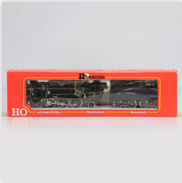
43 Rivarossi locomotive / Reference: 1337 / Type: 4.6.2. / La Chapelle 231.e13...

Référence: GFAB6167 — Poids: 375 g — Sizes: L=300mm — Condition: At first glance - very good condition - no restoration - no repair