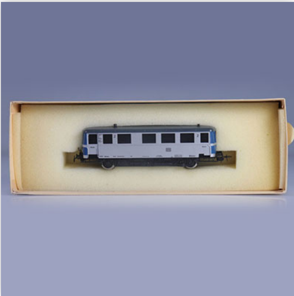
341 Piko locomotive / Reference: 5 6104 / Type: VT70 Electric autorail (70971)

Référence: GFAB6476 — Poids: 315 g — Region: Allemagne — Sizes: Avec boite= H=50mm L=260mm — Condition: At first glance - very good condition - no restoration - no repair