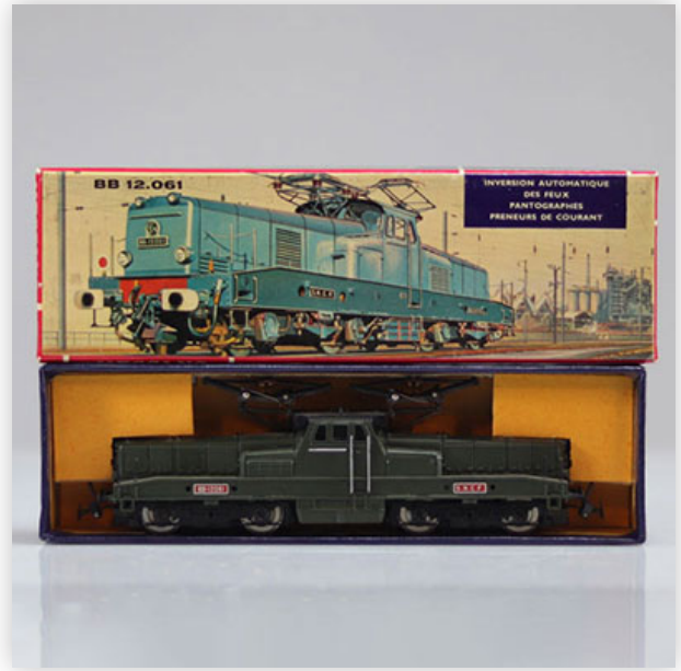
386 Meccano locomotive / Reference: 6392 (Hornby) / Type: BB 12.061

Référence: GFAB6522 — Poids: 405 g — Sizes: L=190mm — Condition: At first glance - very good condition - no restoration - no repair