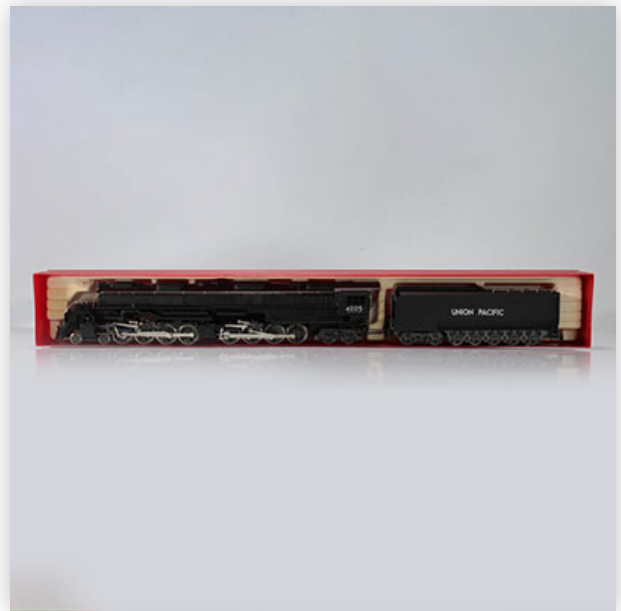
64 Rivarossi locomotive / Reference: 1254 / Type: locomotive 4-8-8-4 Big...

Référence: GFAB6188 — Poids: 1.03 kg — Region: Amérique — Sizes: Avec boîte= H=50mm L=525mm — Condition: At first glance - very good condition - no restoration - no repair