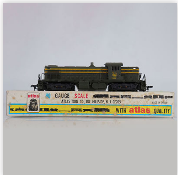
508 Atlas locomotive / Reference: 8122 / Type: RS-1 Diesel (1203)

Référence: GFAB6657 — Poids: 440 g — Region: Amérique — Sizes: Avec boîte= H=45mm L=275mm — Condition: At first glance - very good condition - no restoration - no repair