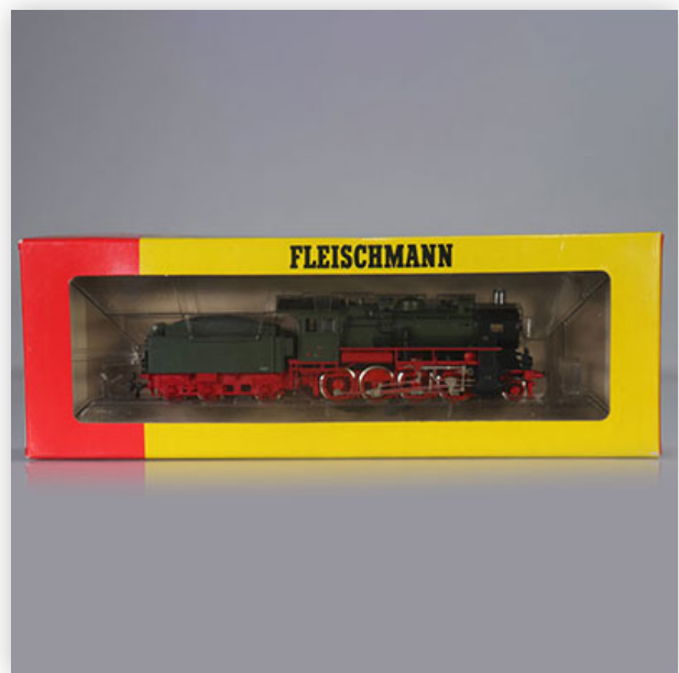
92 Fleischmann locomotive / Reference: 4813 / Type: BR56 2-8-0 5353

Référence: GFAB6217 — Poids: 555 g — Region: Allemagne — Sizes: Avec boîte= H=50mm L=295mm — Condition: At first glance - very good condition - no restoration - no repair