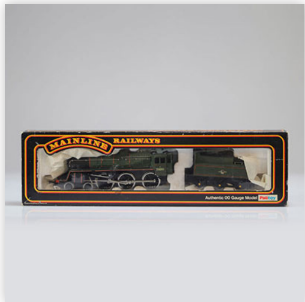
266 Mainline locomotive / Reference: 37053 /75001 / Type: 4-6-0 Standard Class...

Référence: GFAB6400 — Poids: 453 g — Sizes: L=260mm — Condition: At first glance - very good condition - no restoration - no repair