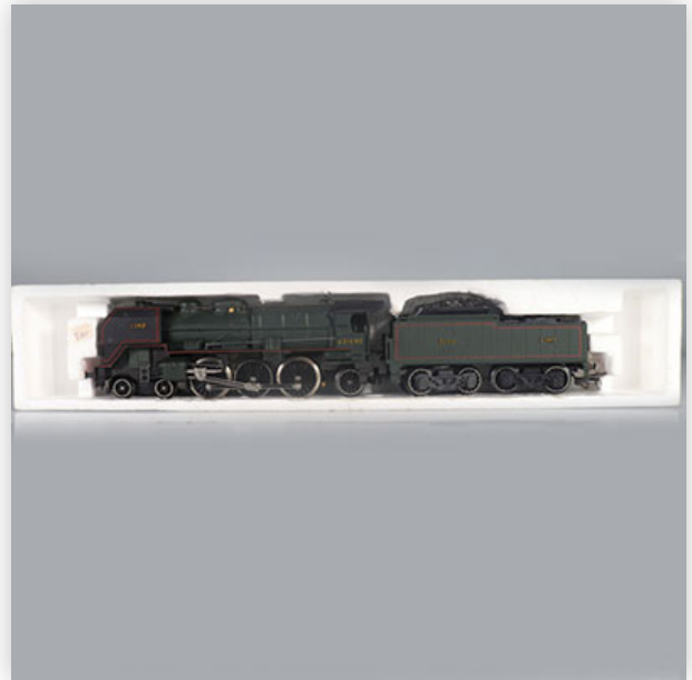
418 Jouef locomotive / Reference: 8251 / Type: Pacific 231c 60

Référence: GFAB6557 — Poids: 345 g — Region: France — Sizes: Avec boîte= H=50mm L=360mm — Condition: At first glance - very good condition - no restoration - no repair