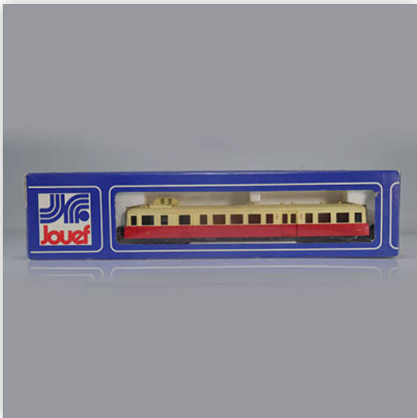
429 Jouef locomotive / Reference: 8601 / Type: Picasso Autorail 4051 X8D Nevers

Référence: GFAB6568 — Poids: 220 g — Region: France — Sizes: Avec boîte= H=50mm L=360mm — Condition: At first glance - very good condition - no restoration - no repair