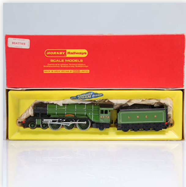
124 Hornby locomotive / Reference: R855N / Type: 4.6.2 Flying Scotsman 4472

Référence: GFAB6250 — Poids: 480 g — Sizes: L=290mm — Condition: At first glance - very good condition - no restoration - no repair