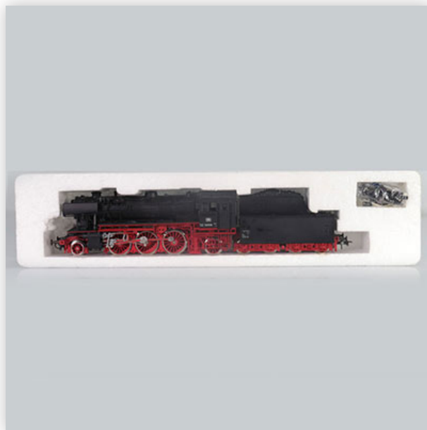
302 Roco locomotive / Reference: 04120A / Type: Dampflokomotive BR23

Référence: GFAB6437 — Poids: 580 g — Sizes: Avec boite= H=50mm L=335mm — Condition: brand new