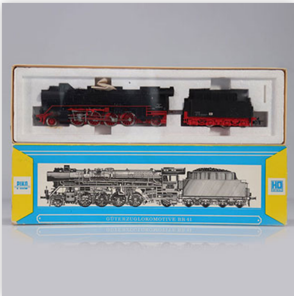
355 Piko locomotive / Reference: 5 6326 / Type: Güterzuglokomotive BR41 (03...

Référence: GFAB6490 — Poids: 669 g — Sizes: Locomotive L=290mm — Condition: At first glance - very good condition - no restoration - no repair