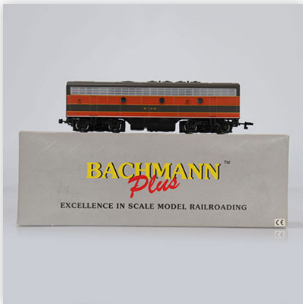
209 Bachmann locomotive / Reference: 31210 / Type: EMD F7B GN #314B

Référence: GFAB6341 — Poids: 540 g — Region: Amérique — Sizes: Avec boîte= H=50mm L=255mm — Condition: At first glance - very good condition - no restoration - no repair