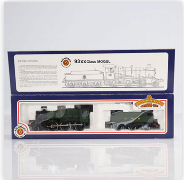
186 Bachmann locomotive / Reference: 31 801/9319 / Type: 93 xx class Mogul

Référence: GFAB6314 — Poids: 400 g — Sizes: L=230mm — Condition: At first glance - good condition - no restoration - no repair (derailments)