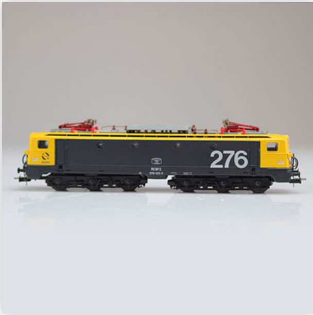
453 Locomotive Model / Reference: - / Type: electric locomotive 276

Référence: GFAB6601 — Poids: 330 g — Sizes: L=225mm — Condition: At first glance - very good condition - no restoration - no repair