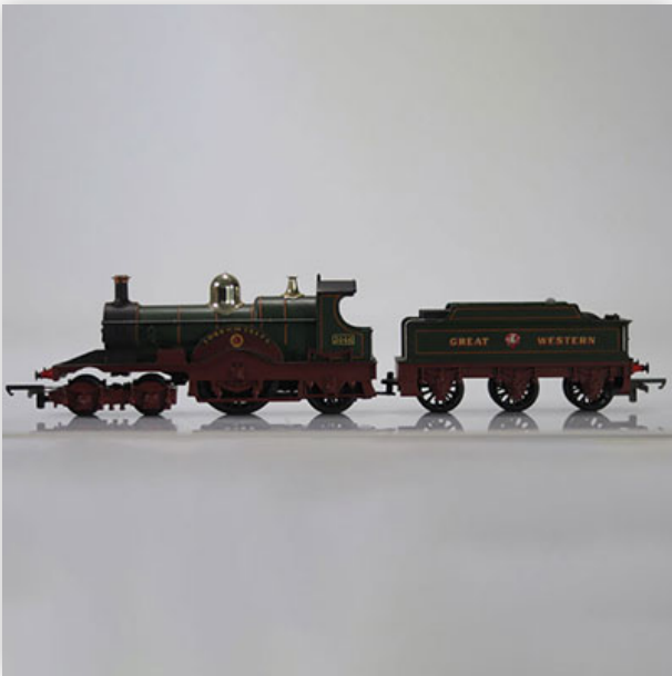
145 Hornby locomotive / Reference: R354 / Type: 4.2.2. Lord of the Isles 3046

Référence: GFAB6271 — Poids: 300 g — Region: England — Sizes: Avec boîte= H=50mm L=150mm — Condition: At first glance - very good condition - no restoration - no repair