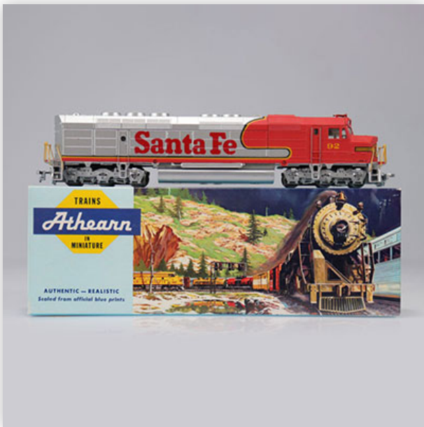
473 Athearn locomotive / Reference: 3621 / Type: FP45 PWR (92)

Référence: GFAB6622 — Poids: 610 g — Region: Amérique — Sizes: H=50mm L=260mm — Condition: At first glance - very good condition - no restoration - no repair