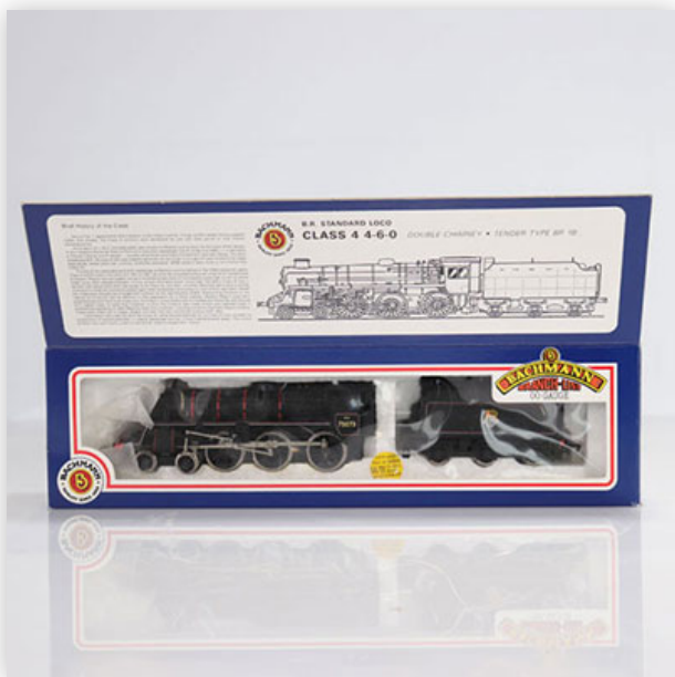
195 Bachmann locomotive / Reference: 31102 / Type: BR Standard Class 4 4-6-0

Référence: GFAB6323 — Poids: 520 g — Sizes: L=250mm — Condition: At first glance - very good condition - no restoration - no repair