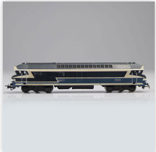
24 Jouef locomotive / Reference: - / type: locomotive 72001

Référence: GFAB6590 — Poids: 350 g — Sizes: L=220mm — Condition: At first glance - very good condition - no restoration - no repair