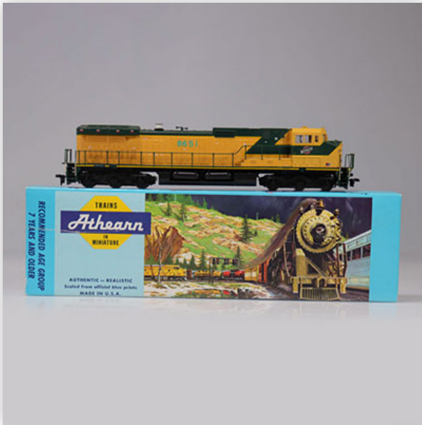
481 Athearn locomotive / Reference: 4914 / Type: C44-9W N0-8651

Référence: GFAB6630 — Poids: 545 g — Region: Amérique — Sizes: H=50mm L=250mm — Condition: At first glance - very good condition - no restoration - no repair