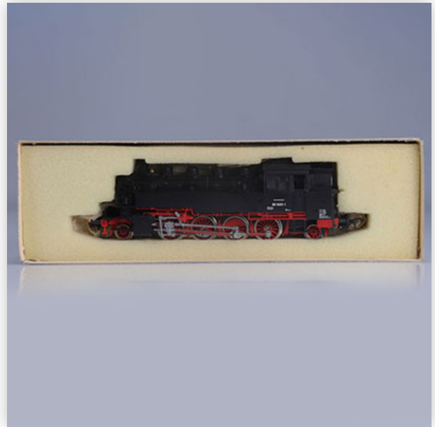
342 Piko locomotive / Reference: 190 27 / Type: BR86 2-8-2 Locotender (86...

Référence: GFAB6477 — Poids: 345 g — Region: Allemagne — Sizes: Avec boite= H=50mm L=250mm — Condition: At first glance - very good condition - no restoration - no repair