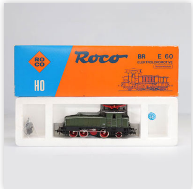
296 Roco locomotive / Reference: 04129B / Type: Elektrolokomotive Bre60 02

Référence: GFAB6430 — Poids: 300 g — Sizes: L=120mm — Condition: At first glance - very good condition - no restoration - no repair