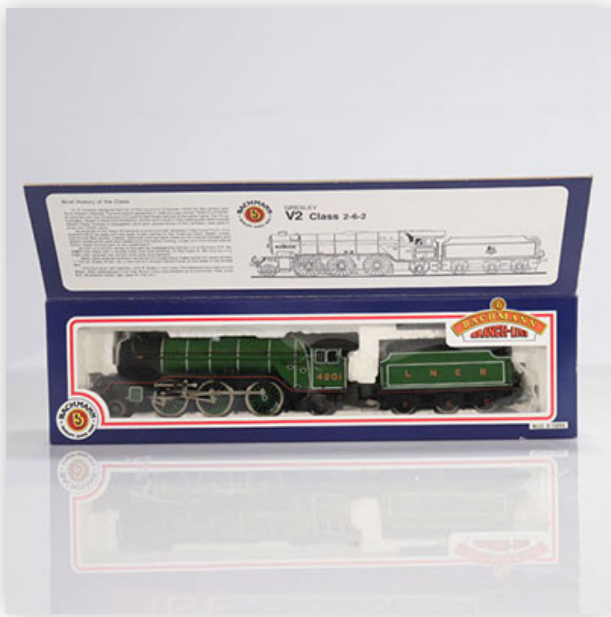
197 Bachmann locomotive / Reference: 31555 /4801 / Type: GRESLEY V2 Class...

Référence: GFAB6325 — Poids: 520 g — Sizes: L=280mm — Condition: At first glance - very good condition - no restoration - no repair