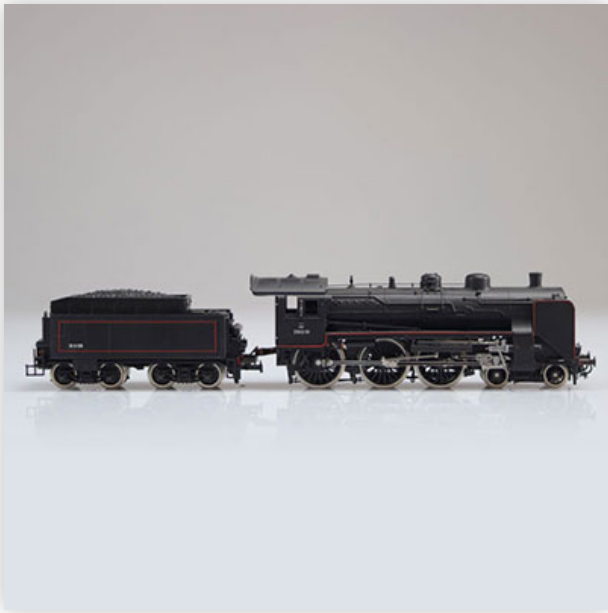
305 Roco locomotive / Reference: - / Type: steam 4-6-0 #230.g.114

Référence: GFAB6440 — Poids: 435 g — Sizes: L=250mm — Condition: At first glance - very good condition - no restoration - no repair