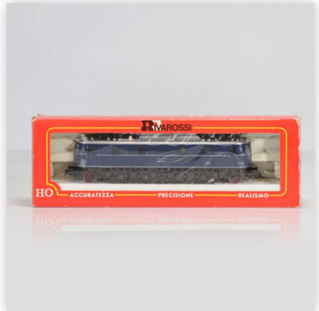
12 Rivarossi locomotive / Reference: 1666 / Type: 119 012-3

Référence: GFAB6146 — Poids: 420 g — Sizes: L=200mm — Condition: At first glance - very good condition - no restoration - no repair