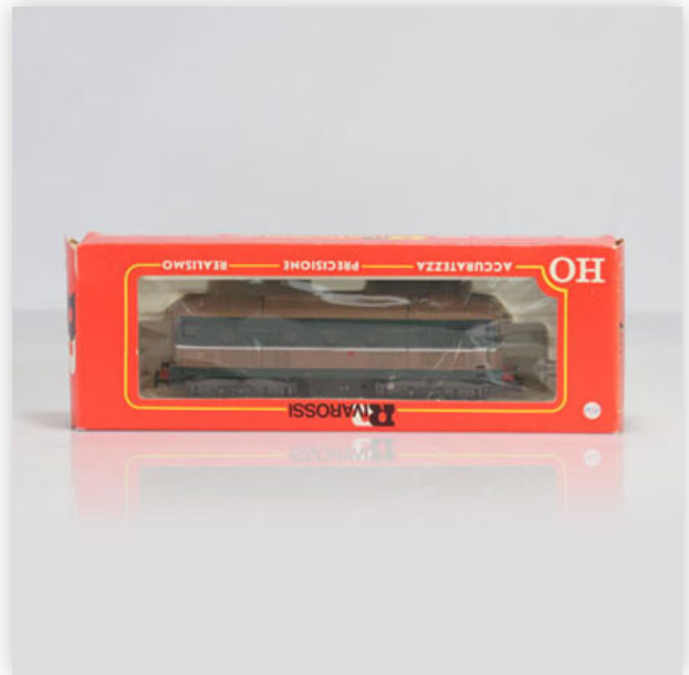
4 Rivarossi locomotive / Reference: 1777 / Type: electrical diesel

Référence: GFAB6138 — Poids: 400 g — Sizes: L=175mm — Condition: At first glance - very good condition - no restoration - no repair