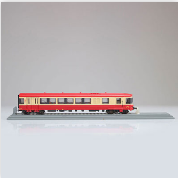
431 Jouef locomotive / Reference: 8626 / Type: Double XBD700 Double

Référence: GFAB6570 — Poids: 411 g — Sizes: L=240mm — Condition: At first glance - very good condition - no restoration - no repair