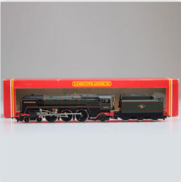
147 Hornby locomotive / Reference: R329 / Type: 4.6.2 "William Shakespeare"...

Référence: GFAB6273 — Poids: 380 g — Sizes: L=290mm — Condition: At first glance - very good condition - no restoration - no repair