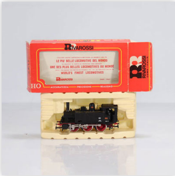
9 Rivarossi locomotive / Reference: 1147 / Type: GR 851186

Référence: GFAB6143 — Poids: 240 g — Sizes: L=115mm — Condition: At first glance - very good condition - no restoration - no repair