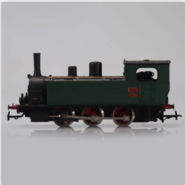
451 Locomotive Model / Reference: - FNM 27002 / Type: Steam 0-6-0 FNM 270...

Référence: GFAB6599 — Poids: 185 g — Sizes: H=45mm L=170mm — Condition: At first glance - very good condition - no restoration - no repair