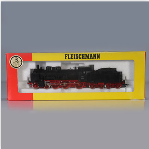
83 Fleischmann locomotive / Reference: 4160 / Type: 04 06

Référence: GFAB6208 — Poids: 475 g — Region: Allemagne — Sizes: Avec boîte= H=50mm L=295mm — Condition: At first glance - very good condition - no restoration - no repair