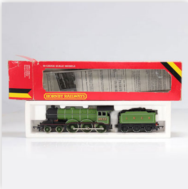
129 Hornby locomotive / Reference: R866 / Type: 4.6.0 Class B12 / 3 8572

Référence: GFAB6255 — Poids: 300 g — Sizes: L=230mm — Condition: At first glance - very good condition - no restoration - no repair