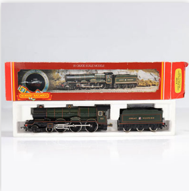
143 Hornby locomotive / Reference: R349 / Type: King Class Loco "King Henry..."

Référence: GFAB6269 — Poids: 535 g — Sizes: L=250mm — Condition: At first glance - very good condition - no restoration - no repair