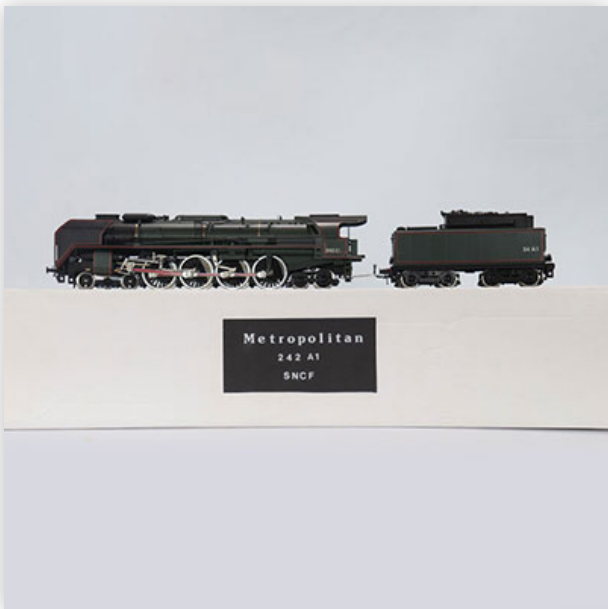
315 Metropolitan locomotive / Reference: 242 A1 / Type: Steam locomotive 4-8-4...

Référence: GFAB6450 — Poids: 775 g — Region: France — Sizes: Avec boîte= H=50mm L=400mm — Condition: At first glance - very good condition - no restoration - no repair