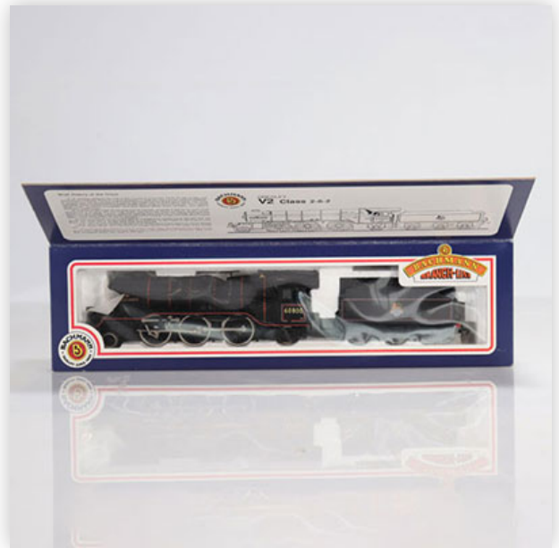
194 Bachmann locomotive / Reference: 31551 / Type: GRESLEY V2 Class 2-6-2

Référence: GFAB6322 — Poids: 520 g — Sizes: L=270mm — Condition: At first glance - very good condition - no restoration - no repair