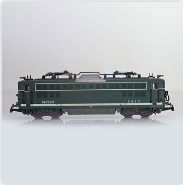
445 Jouef locomotive / Reference: - / type: BB 25531 locomotive

Référence: GFAB6591 — Poids: 215 g — Region: France — Sizes: H=45mm L=180 — Condition: At first glance - very good condition - no restoration - no repair