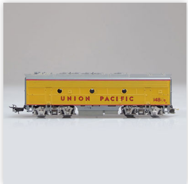
468 Athearn / Reference locomotive: ? / Type: Motor 1480 B

Référence: GFAB6617 — Poids: 210 g — Sizes: L=190mm — Condition: At first glance ? good condition - no restoration - no repair