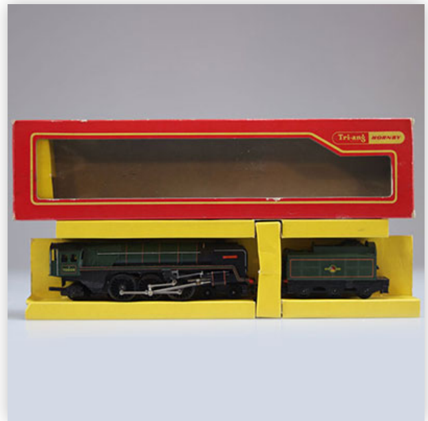
152 Hornby locomotive / Reference: R259S / Type: 4.6.2. Britannia 70000

Référence: GFAB6278 — Poids: 552 g — Sizes: L=300mm — Condition: At first glance - very good condition - no restoration - no repair