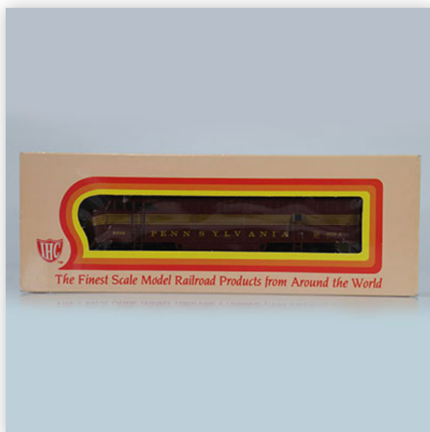
404 IHC locomotive / Reference: M386 / Type: M386 FM Diesel

Référence: GFAB6541 — Poids: 385 g — Region: Amérique — Sizes: Avec boîte= H=40mm L=255mm — Condition: At first glance - very good condition - no restoration - no repair