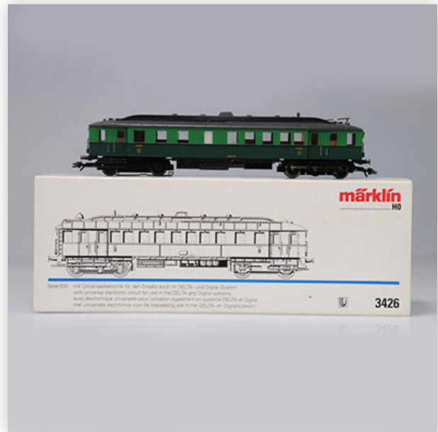
244 Marklin locomotive / Reference: 3426 / Type: Automotor 600.02

Référence: GFAB6378 — Poids: 650 g — Region: France — Sizes: H=55mm L=270mm — Condition: At first glance - very good condition - no restoration - no repair