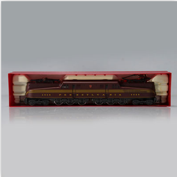
69 Rivarossi locomotive / Reference: 1664 / Type: Electric locomotive GG1

Référence: GFAB6193 — Poids: 700 g — Region: Amérique — Sizes: Avec boîte= H=50mm L=340mm — Condition: At first glance - very good condition - no restoration - no repair