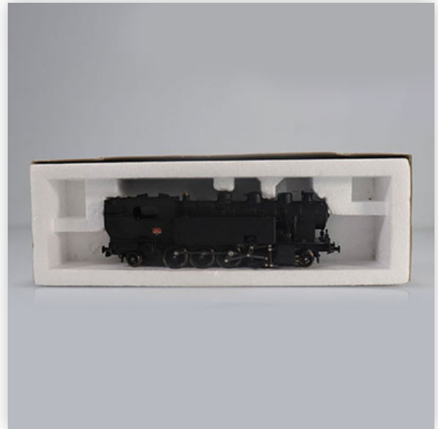
426 Jouef locomotive / Reference: 8294 / Type: 2.8.2 141 TA 418 Locotender

Référence: GFAB6565 — Poids: 325 g — Region: France — Sizes: Avec boîte= H=50mm L=250mm — Condition: At first glance - very good condition - no restoration - no repair