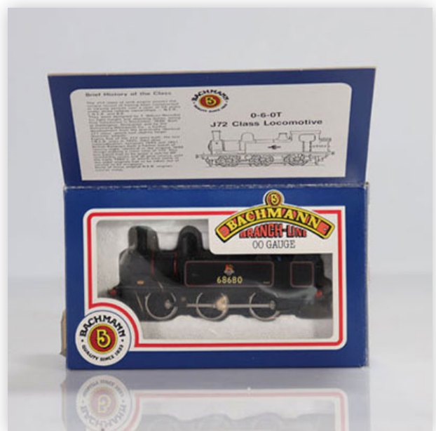
192 Bachmann locomotive / Reference: 31052 / Type: J72 Class 0-6-0T

Référence: GFAB6320 — Poids: 270 g — Sizes: L=120mm — Condition: At first glance - very good condition - no restoration - no repair