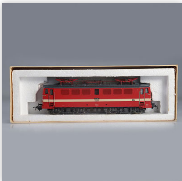
359 Piko locomotive / Reference: 5 6212 / Type: Güterzuglokomotive BR242 (242...

Référence: GFAB6494 — Poids: 535 g — Region: Allemagne — Sizes: Avec boîte= H=50mm L=260mm — Condition: At first glance - very good condition - no restoration - no repair