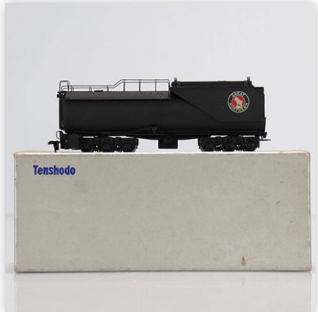
396 Tenshodo locomotive / Reference: T-160 / Type: Tender for GN 2-8-8-2

Référence: GFAB6533 — Poids: 380 g — Sizes: L=160mm — Condition: At first glance - very good condition - no restoration - no repair