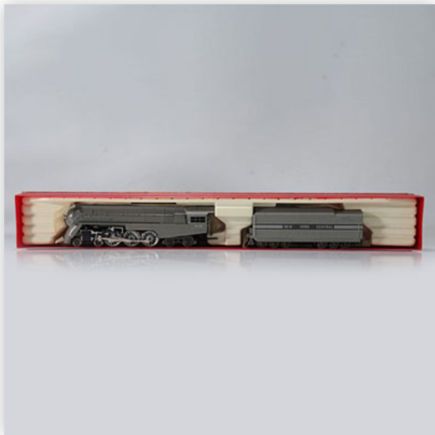
63 Rivarossi locomotive / Reference: 1273 / Type: locomotive 4-6-4 Class...

Référence: GFAB6187 — Poids: 770 g — Region: Amérique — Sizes: Avec boîte= H=60mm L=525mm — Condition: At first glance - very good condition - no restoration - no repair