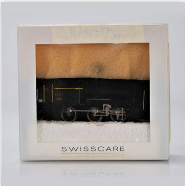
219 Fulgurex locomotive / Reference: 2008 / Type: type E 3/3 #8487

Référence: GFAB6351 — Poids: 180 g — Sizes: H=45mm L=110mm — Condition: At first glance - very good condition - no restoration - no repair