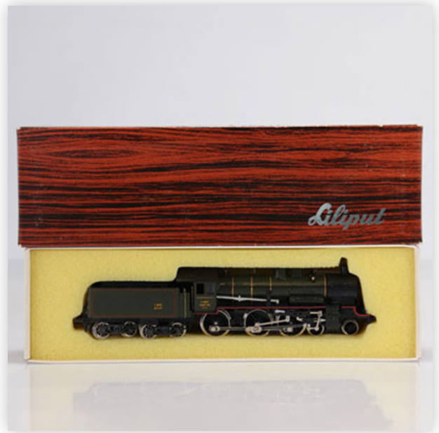
370 Liliput locomotive / Reference: 10470 / Type: 230 F 4.6.0

Référence: GFAB6506 — Poids: 430 g — Sizes: L=215mm — Condition: At first glance - very good condition - no restoration - no repair