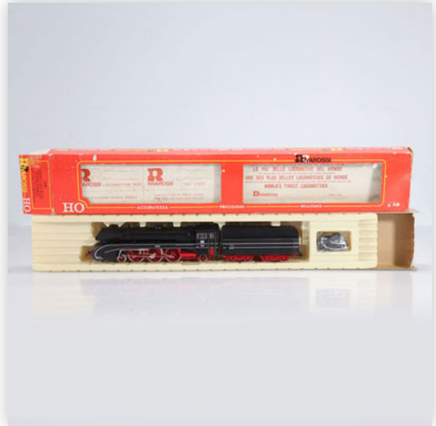
26 Rivarossi locomotive / Reference: 1339 / Type: BR 10 001

Référence: GFAB6150 — Poids: 700 g — Sizes: L=310mm — Condition: At first glance - very good condition - no restoration - no repair