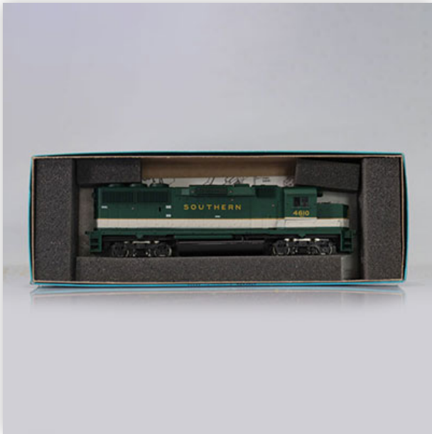
489 Athearn locomotive / Reference: 4766 / Type: GP9 PWR NS #4610

Référence: GFAB6638 — Poids: 485 g — Region: Amérique — Sizes: Avec la boîte= H=40mm L=270mm — Condition: At first glance - very good condition - no restoration - no repair