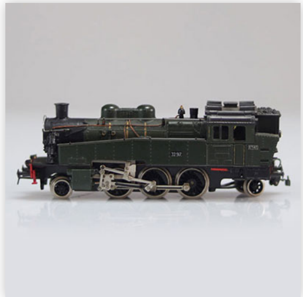
452 Locomotive Model / Reference: - / Type: locotender 0-6-0 FNM 32.917

Référence: GFAB6600 — Poids: 282 g — Sizes: L=145mm — Condition: At first glance - very good condition - no restoration - no repair