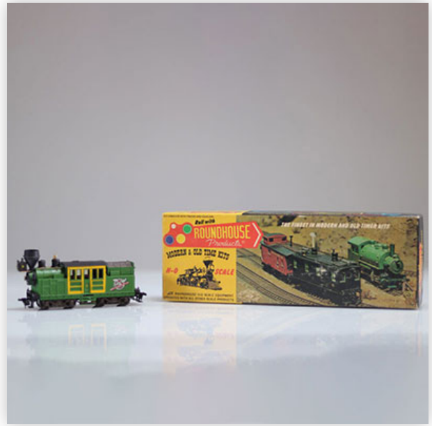
310 Roundhouse locomotive / Reference: 2789 / Type: Climax 4.4 Moose Jaws

Référence: GFAB6445 — Poids: 373 g — Sizes: L=130mm — Condition: At first glance - very good condition - no restoration - no repair