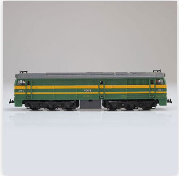
462 Ibertren locomotive / Reference: - / Type: motor 321.061.4 #2161

Référence: GFAB6611 — Poids: 387 g — Sizes: L=230mm — Condition: At first glance - very good condition - no restoration - no repair