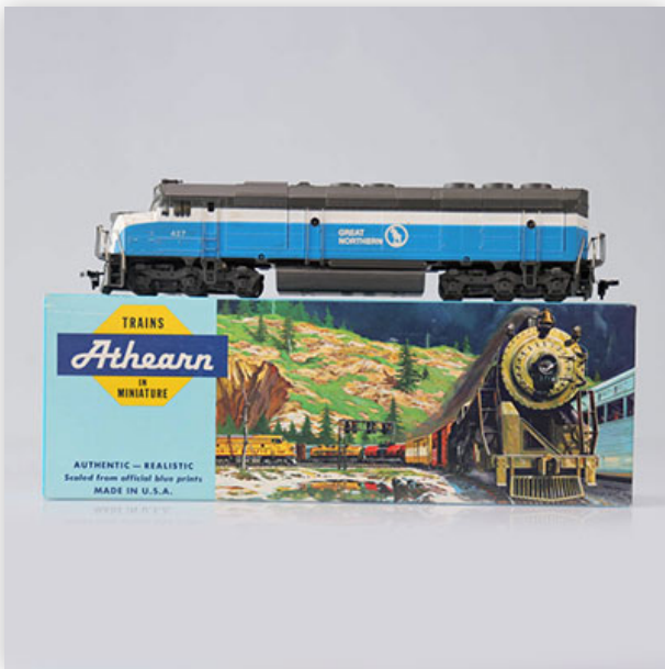
471 Athearn locomotive / Reference: 3602 / Type: F45 PWR (427)

Référence: GFAB6620 — Poids: 555 g — Region: Amérique — Sizes: H=50mm L=250mm — Condition: At first glance - very good condition - no restoration - no repair