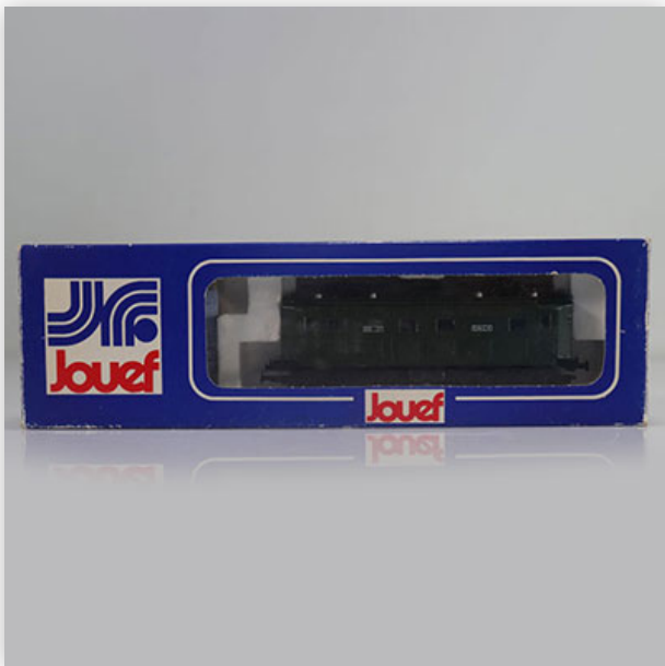
427 Jouef locomotive / Reference: 8348 / Type: BB 27 Electric Autorail

Référence: GFAB6566 — Poids: 390 g — Region: France — Sizes: Avec boîte= H=50mm L=280mm — Condition: At first glance - very good condition - no restoration - no repair