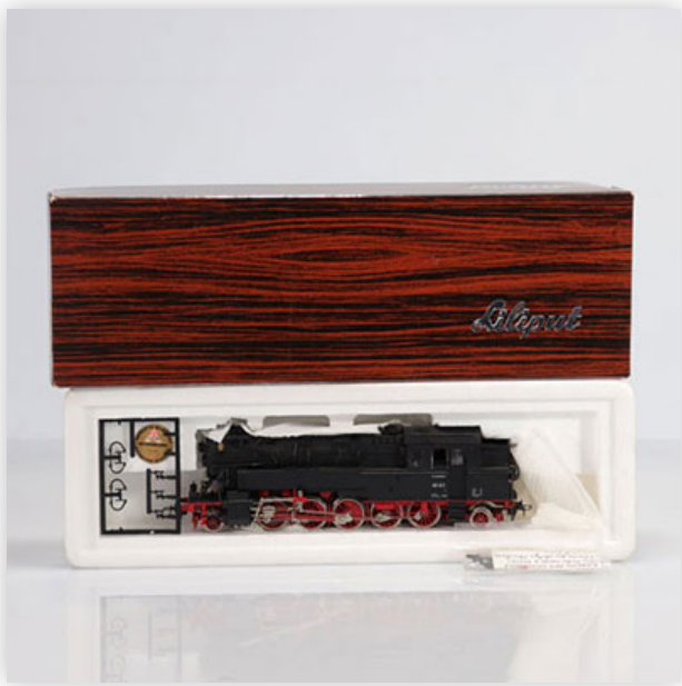
369 Liliput locomotive / Reference: 9503 / Type: Type 95 N ° 95.013

Référence: GFAB6505 — Poids: 620 g — Sizes: L=180mm — Condition: At first glance - very good condition - no restoration - no repair