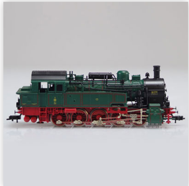
96 Fleischmann locomotive / Reference: / Type: steam 0-10-0 #8177

Référence: GFAB6221 — Poids: 352 g — Sizes: L=160mm — Condition: At first glance - very good condition - no restoration - no repair