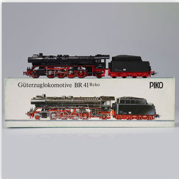
329 Piko locomotive / Reference: 05 6326 / Type: BR41 411147-2

Référence: GFAB6464 — Poids: 725 g — Region: Allemagne — Sizes: H=55mm L=280mm — Condition: At first glance - very good condition - no restoration - no repair