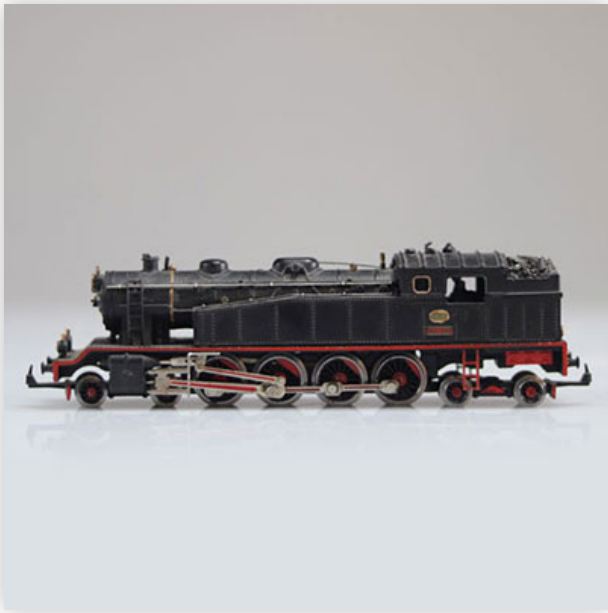
457 Iberian locomotive / Reference: - / Type: locotender 4-8-4 242-0231 #157

Référence: GFAB6606 — Poids: 335 g — Sizes: L=180mm — Condition: At first glance - very good condition - no restoration - no repair