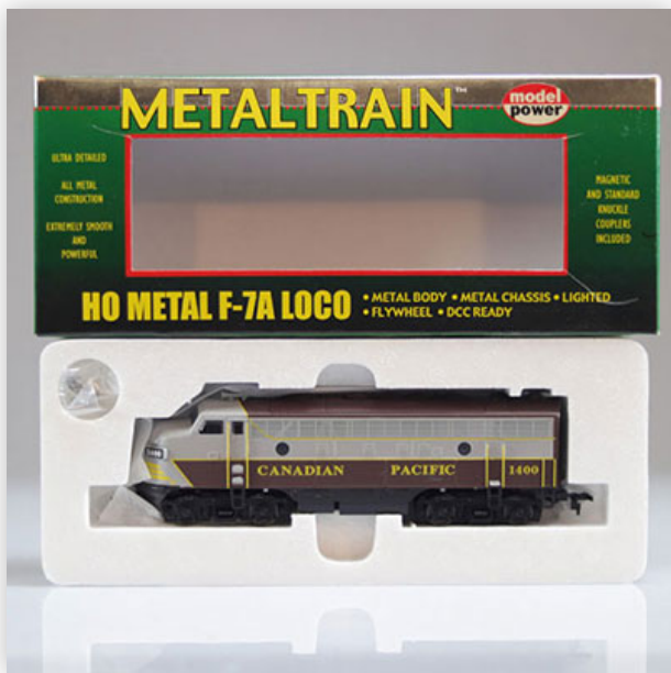
289 Metal train locomotive / Reference: 2165 CP / Type: F7-A 1400

Référence: GFAB6423 — Poids: 665 g — Sizes: L=180mm — Condition: At first glance - very good condition - no restoration - no repair