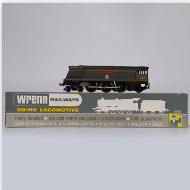
111 Wrenn locomotive / Reference: W2265 / 34051 / Type: 4.6.2. Winston Churchill

Référence: GFAB6236 — Poids: 670 g — Region: England — Sizes: Avec boîte= H=45mm L=355mm — Condition: At first glance - very good condition - no restoration - no repair