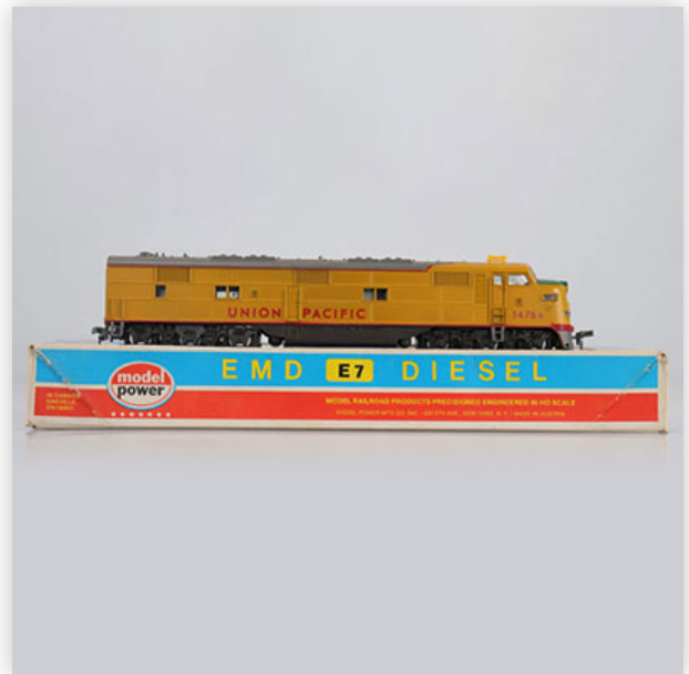
504 Locomotive Model Power / Reference: 914 / Type: EMD E7 Diesel (1476 A)

Référence: GFAB6653 — Poids: 630 g — Region: Amérique — Sizes: Avec boîte= H=40mm L=320mm — Condition: At first glance - very good condition - no restoration - no repair