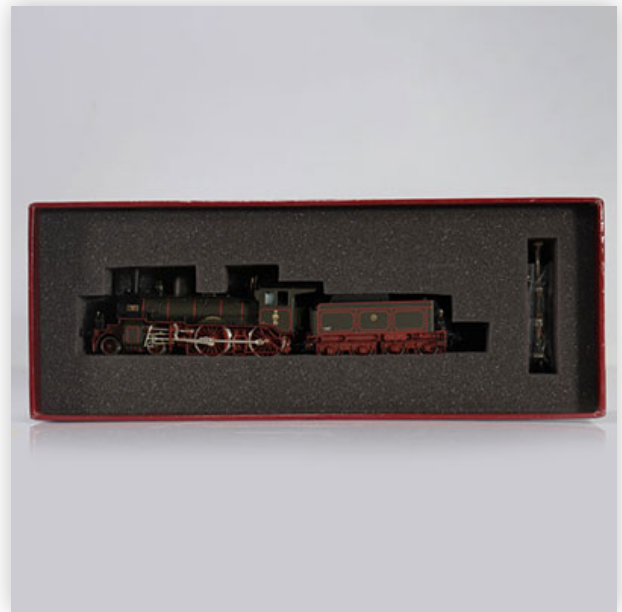
466 Lemaco locomotive / Reference: HO-034 /1 / Type: KPEV P4-2 (1903)

Référence: GFAB6615 — Poids: 710 g — Sizes: Avec boîte= H=70mm L=310mm — Condition: At first glance - very good condition - no restoration - no repair