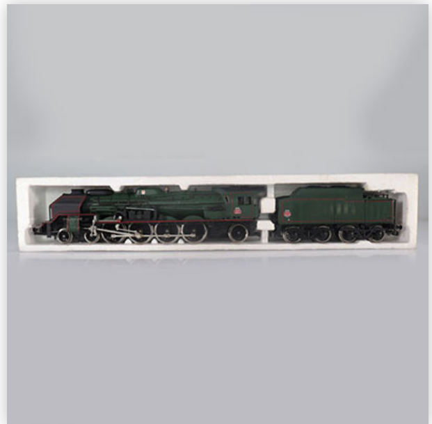
420 Jouef locomotive / Reference: 8260 / Type: 241 p 7 Nevers

Référence: GFAB6559 — Poids: 575 g — Region: France — Sizes: Avec boîte= H=50mm L=355mm — Condition: At first glance - very good condition - no restoration - no repair