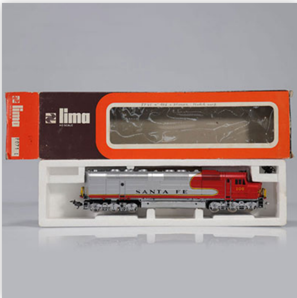
275 Lima locomotive / Reference: 8071L / Type: FP45 #106

Référence: GFAB6409 — Poids: 456 g — Sizes: Locomotive L=265mm — Condition: brand new