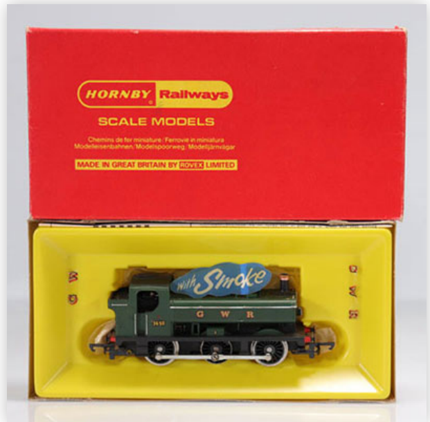
148 Hornby locomotive / Reference: R051 / Type: 0.6.0 pt Locomotive 3650

Référence: GFAB6274 — Poids: 360 g — Sizes: L=120mm — Condition: At first glance - very good condition - no restoration - no repair