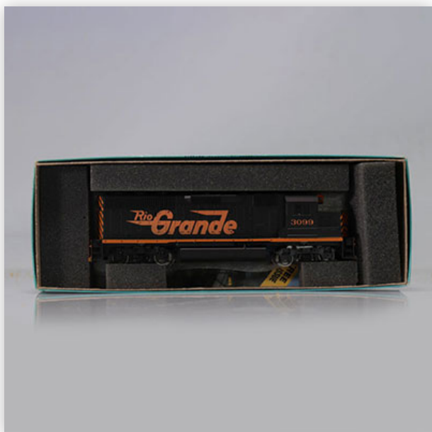
487 Athearn locomotive / Reference: 4705 / Type: GP 40-2 PWR

Référence: GFAB6636 — Poids: 490 g — Region: Amérique — Sizes: Avec boîte= H=40mm L=270mm — Condition: At first glance - very good condition - no restoration - no repair