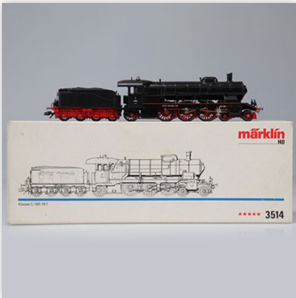
241 Marklin locomotive / Reference: 3514 / Type: 4.6.2. C2004

Référence: GFAB6375 — Poids: 500 g — Region: France — Sizes: H=50mm L=240mm — Condition: At first glance - very good condition - no restoration - no repair