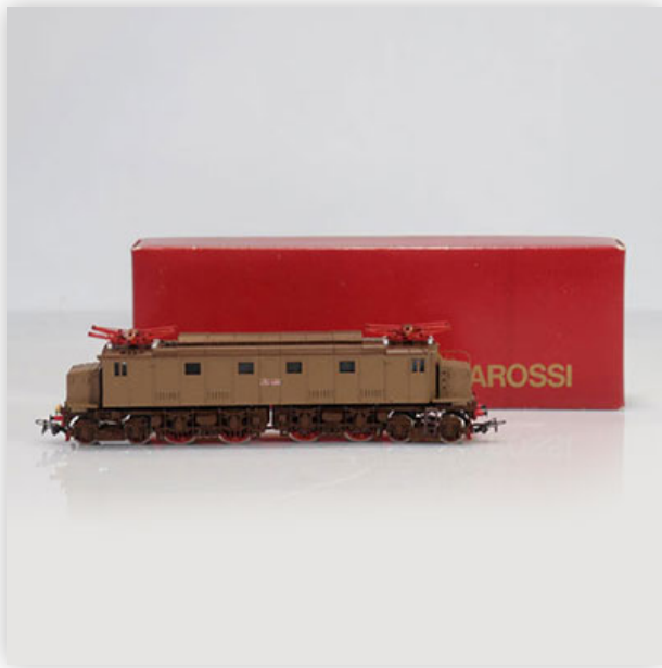
37 Rivarossi locomotive / Reference: M1460 / Type: E 428 066

Référence: GFAB6161 — Poids: 0 g — Condition: restored