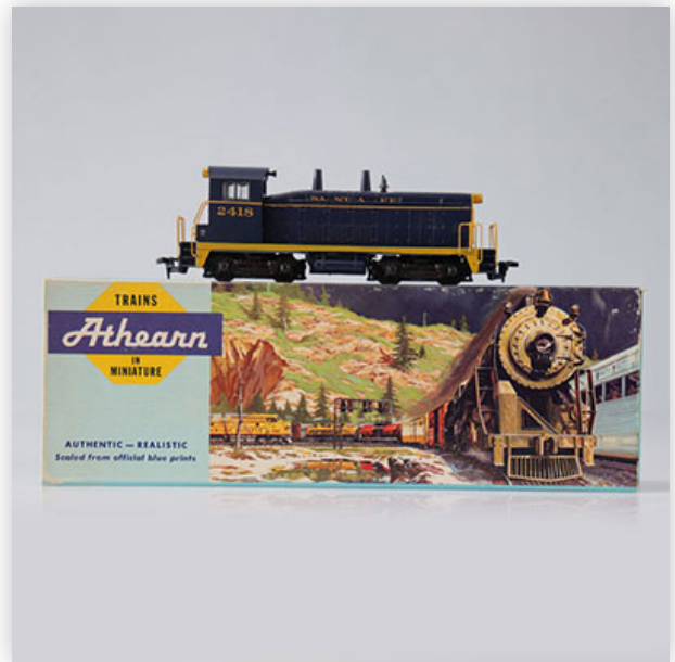
474 Athearn locomotive / Reference: 4005 / Type: SW1500 RTR COW

Référence: GFAB6623 — Poids: 350 g — Region: Amérique — Sizes: H=50mm L=160mm — Condition: At first glance - very good condition - no restoration - no repair