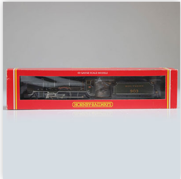
138 Hornby locomotive / Reference: R057 / Type: 4.4.0. Charterhouse 903

Référence: GFAB6264 — Poids: 443 g — Sizes: L=240mm — Condition: At first glance - very good condition - no restoration - no repair