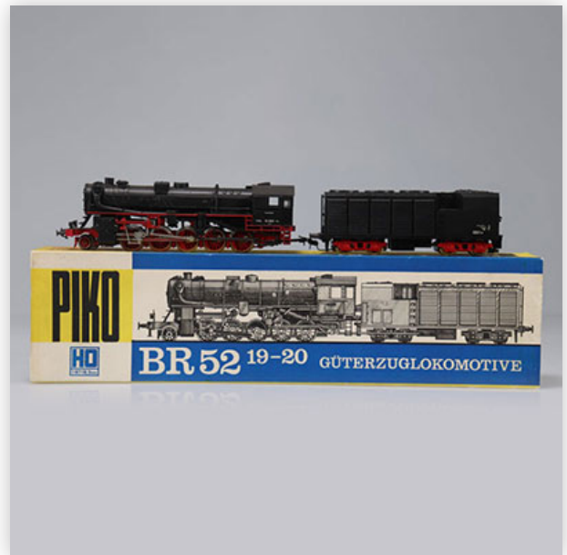
336 Piko locomotive / Reference: 190 / EM23 / Type: BR52 (19-29) 522006

Référence: GFAB6471 — Poids: 690 g — Region: Allemagne — Sizes: H=50mm L=310mm — Condition: At first glance - very good condition - no restoration - no repair