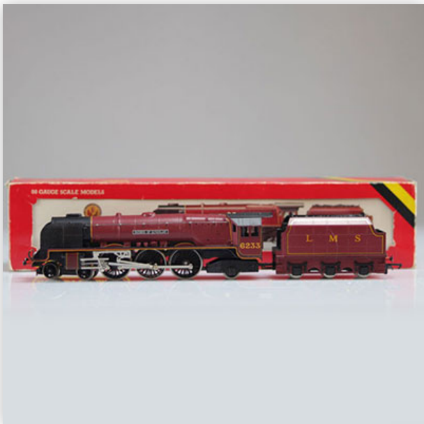
155 Hornby locomotive / Reference: R066 / Type: 4.6.2 Coronation Class 7p...

Référence: GFAB6281 — Poids: 600 g — Sizes: L=300mm — Condition: At first glance - very good condition - no restoration - no repair