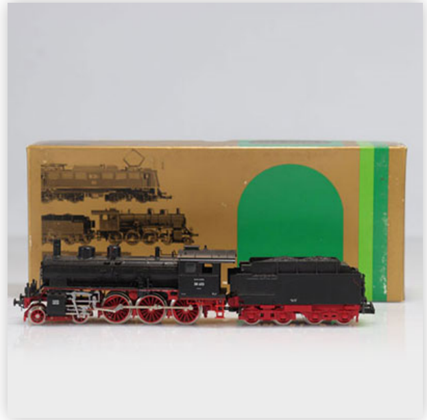
258 Trix locomotive / Reference: 2409 / Type: 4-6-0 / 38403

Référence: GFAB6392 — Poids: 580 g — Condition: At first glance - very good condition - no restoration - no repair