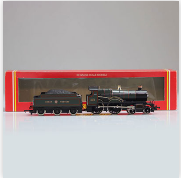
154 Hornby locomotive / Reference: R125 / Type: 4.4.0 "County of Cornwall"

Référence: GFAB6280 — Poids: 425 g — Sizes: L=240mm — Condition: At first glance - very good condition - no restoration - no repair