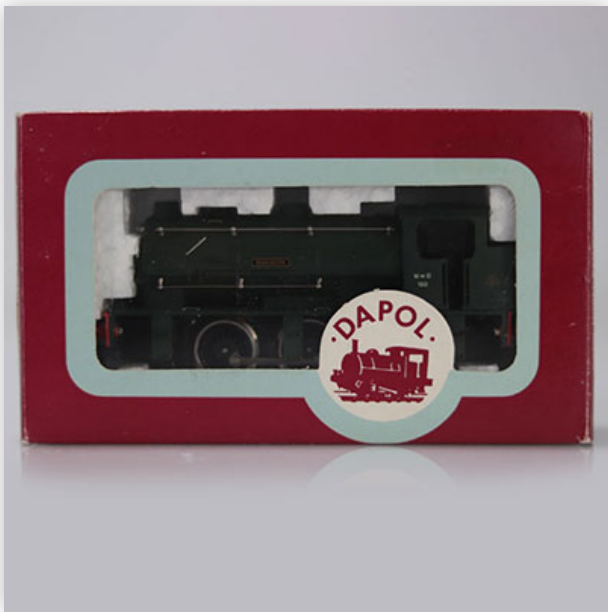
397 Dapol locomotive / Reference: J-94 DAP 007 / Type: 0.6.0 WARRINGTON

Référence: GFAB6534 — Poids: 245 g — Region: England — Sizes: Avec boîte= H=45mm L=155mm — Condition: At first glance - very good condition - no restoration - no repair