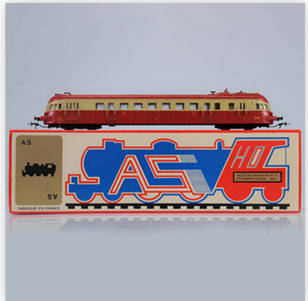
220 AS locomotive / Reference: ABJ4 / Type: RENAULT AUTORAL

Référence: GFAB6353 — Poids: 480 g — Region: France — Sizes: Avec la boîte= H=60mm L=350mm — Condition: At first glance - very good condition - no restoration - no repair