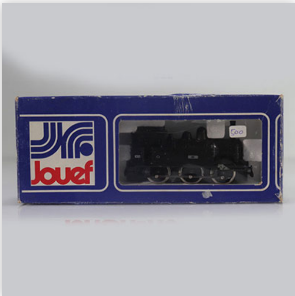
423 Jouef locomotive / Reference: 8295 / Type: 30-135 0.6.0

Référence: GFAB6562 — Poids: 120 g — Region: France — Sizes: Avec boîte= H=50mm L=205mm — Condition: At first glance - very good condition - no restoration - no repair