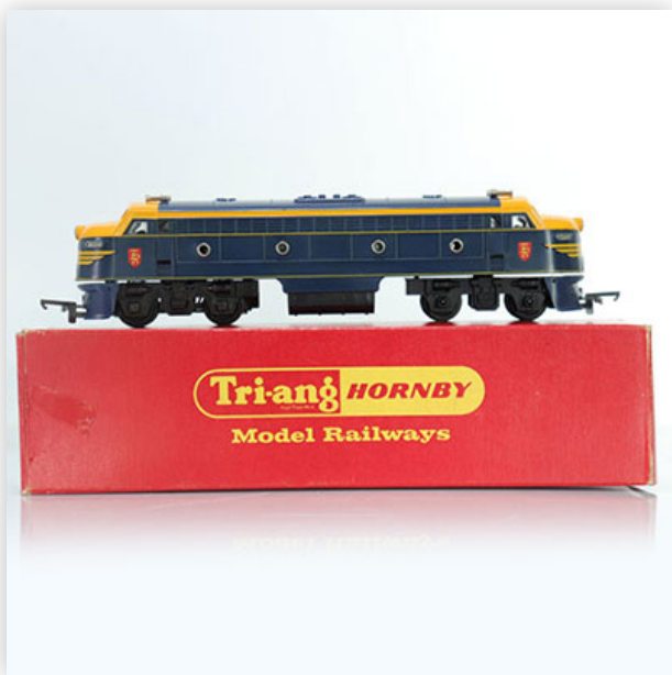
167 Hornby locomotive / Reference: R159 (Tri-Ang) / Type: Double Ended Diesel

Référence: GFAB6294 — Poids: 445 g — Sizes: Avec boîte= H=65mm L=260mm — Condition: At first glance - very good condition - no restoration - no repair