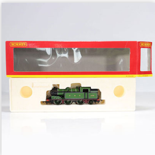
119 Hornby locomotive / Reference: R22114B / Type: 1730 0.6.2.T

Référence: GFAB6245 — Poids: 350 g — Sizes: L=150mm — Condition: At first glance - very good condition - no restoration - no repair