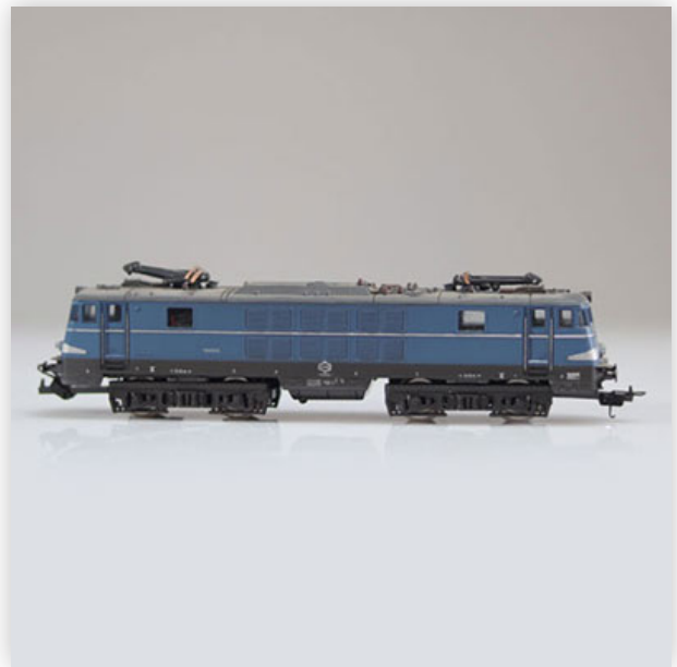
286 Lima locomotive / Reference: - / Type: electric motor 150012

Référence: GFAB6420 — Poids: 280 g — Sizes: L=210mm — Condition: At first glance - very good condition - no restoration - no repair