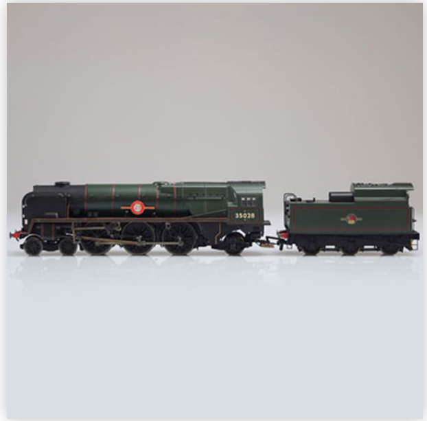
174 Hornby / Reference locomotive:? / Type: Steam CLAN MERCHANT Navy Class...

Référence: GFAB6301 — Poids: 450 g — Sizes: L=290mm — Condition: At first glance - very good condition - no restoration - no repair