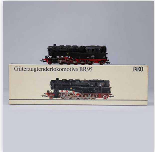
334 Piko locomotive / Reference: 01 056332 / Type: BR95 950028-1

Référence: GFAB6469 — Poids: 590 g — Region: Allemagne — Sizes: H=50mm L=170mm — Condition: At first glance - very good condition - no restoration - no repair