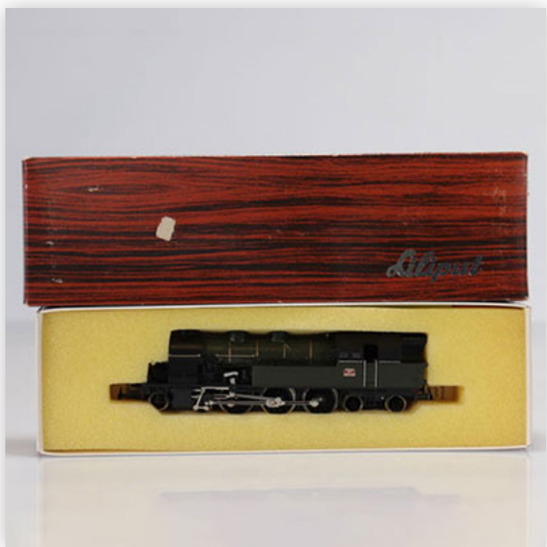
371 Liliput locomotive / Reference: 7872 / Type: 232 TC 43 4.6.4

Référence: GFAB6507 — Poids: 400 g — Sizes: L=170mm — Condition: At first glance - very good condition - no restoration - no repair