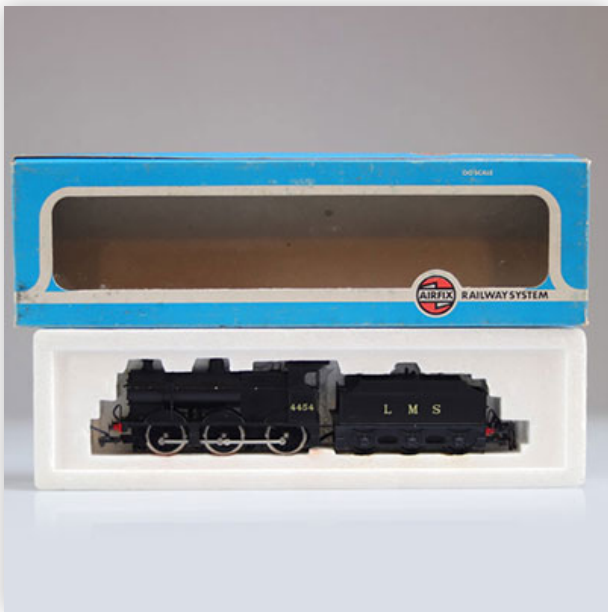
177 Airfix locomotive / Reference: 54122 / Type: 4F Fowler / 4454

Référence: GFAB6304 — Poids: 382 g — Sizes: L=225mm — Condition: At first glance - very good condition - no restoration - no repair