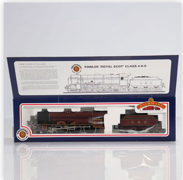
184 Bachmann locomotive / Reference: 31 277/6112 / Type: Fowler Royal Scot...

Référence: GFAB6312 — Poids: 530 g — Sizes: L=260mm — Condition: At first glance - very good condition - no restoration - no repair