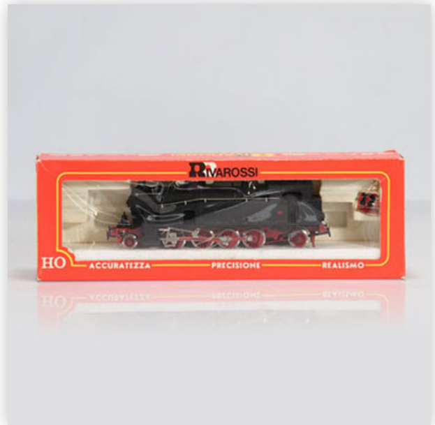
28 Rivarossi locomotive / Reference: 1114 / Type: GR 940 014

Référence: GFAB6152 — Poids: 325 g — Sizes: L=165mm — Condition: At first glance - very good condition - no restoration - no repair