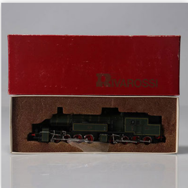
75 Rivarossi locomotive / Reference: 1375 / Type: GR 2x4 / 4 #5766

Référence: GFAB6199 — Poids: 420 g — Sizes: Avec boite= H=40mm L=255mm — Condition: At first glance - very good condition - no restoration - no repair