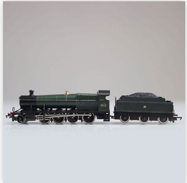
172 Hornby / Reference locomotive:? / Type: steam 2-8-0 #2844

Référence: GFAB6299 — Poids: 380 g — Sizes: L=270mm — Condition: At first glance - very good condition - no restoration - no repair