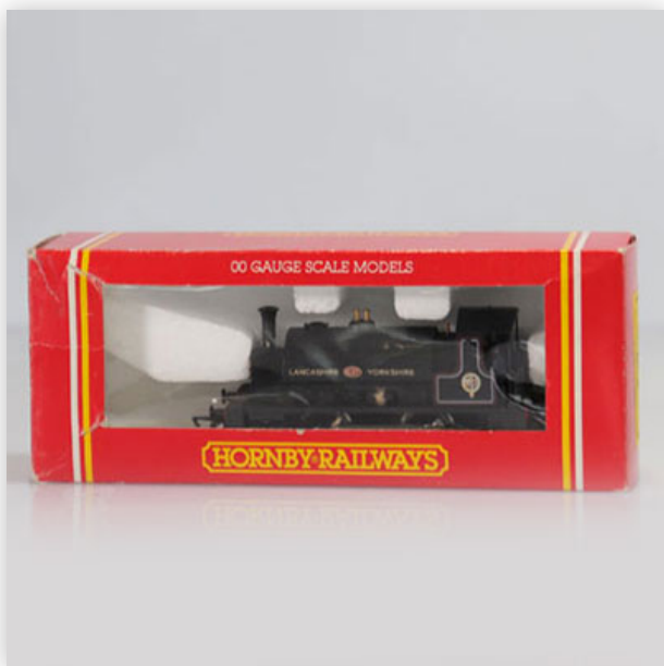
159 Hornby locomotive / Reference: R150 / Type: 0.4.0 627

Référence: GFAB6285 — Poids: 160 g — Sizes: L=100mm — Condition: At first glance - very good condition - no restoration - no repair