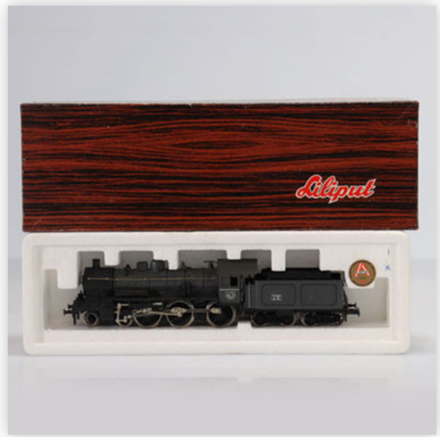
374 Liliput locomotive / Reference: 10420 / Type: 230.715 Agen

Référence: GFAB6510 — Poids: 427 g — Sizes: L=220mm — Condition: At first glance - very good condition - no restoration - no repair