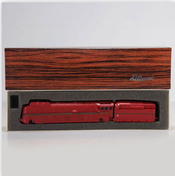
381 Liliput locomotive / Reference: 10501 / Type: 4-6-4 5001

Référence: GFAB6517 — Poids: 900 g — Sizes: L=315 — Condition: At first glance - very good condition - no restoration - no repair