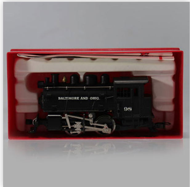
74 Rivarossi locomotive / Reference: 1221 / Type: locomotive 0-4-0 Class...

Référence: GFAB6198 — Poids: 250 g — Region: Amérique — Sizes: Avec boite= H=55mm L=140mm — Condition: At first glance - very good condition - no restoration - no repair