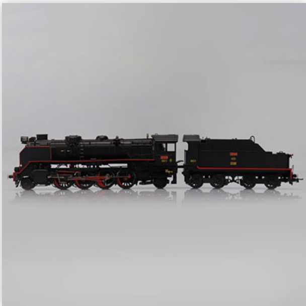
175 Mikado Electrolux locomotive / Reference: 4140 / Type: steam 141 #141-2413

Référence: GFAB6302 — Poids: 700 g — Sizes: Avec boîte= H=60mm L=375mm — Condition: At first glance - very good condition - no restoration - no repair