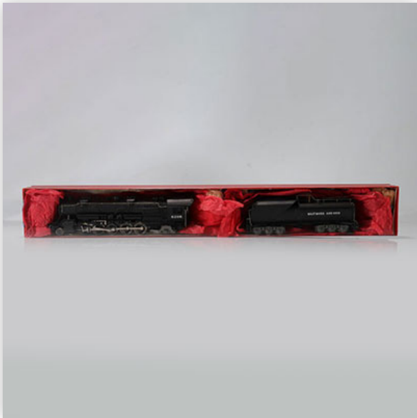
71 Rivarossi locomotive / Reference: 1255 / Type: locomotive 2-10-1 Class...

Référence: GFAB6195 — Poids: 730 g — Region: Amérique — Sizes: Avec boîte= 50mm L=520mm — Condition: At first glance - very good condition - no restoration - no repair