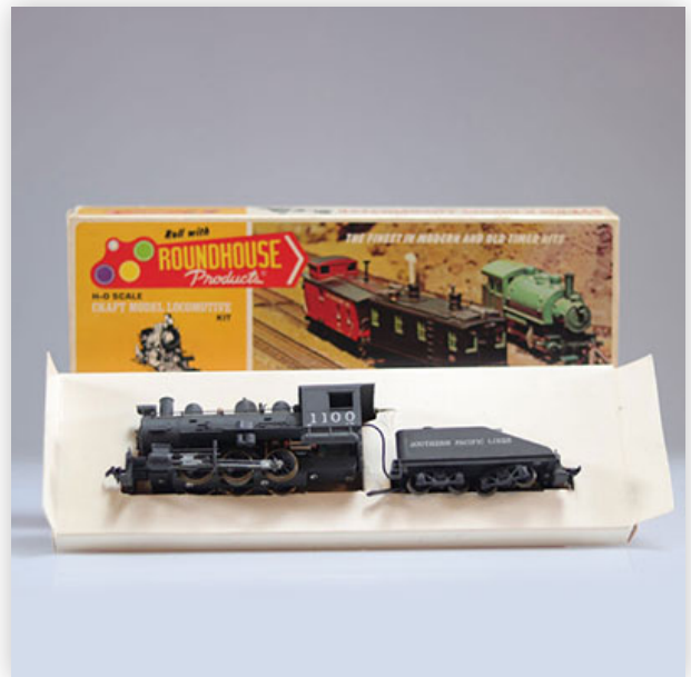
312 Roundhouse locomotive / Reference: 411 / Type: 0.6.0 / 1100

Référence: GFAB6447 — Poids: 420 g — Sizes: L=230mm — Condition: At first glance - very good condition - no restoration - no repair