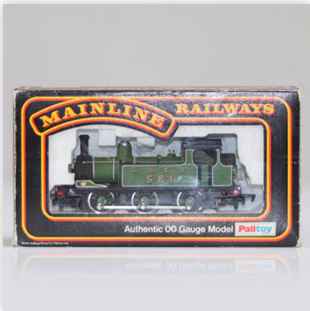
265 Mainline locomotive / Reference: 37054 /581 / Type: 0-6-0T J72 Class Tank

Référence: GFAB6399 — Poids: 280 g — Sizes: L=130mm — Condition: At first glance - very good condition - no restoration - no repair