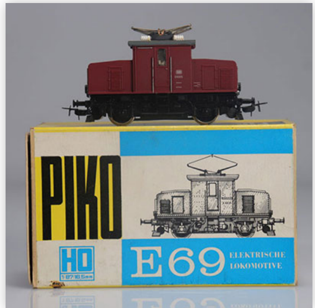
352 Piko locomotive / Reference: 5 6200 / Type: E 69 Elektrische Lokomotive...

Référence: GFAB6487 — Poids: 245 g — Region: Allemagne — Sizes: Avec boîte= H=55mm L=150mm — Condition: At first glance - very good condition - no restoration - no repair