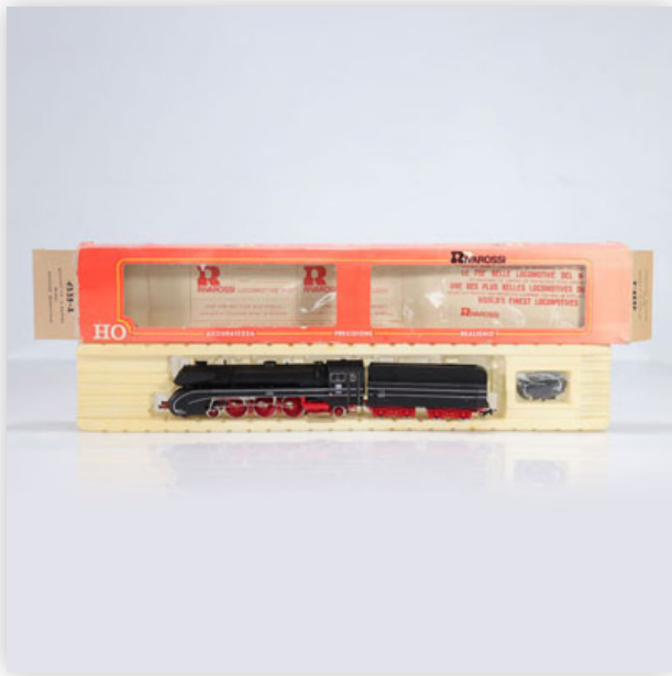
13 Rivarossi locomotive / Reference: 1339-2 / Type: 10002

Référence: GFAB6147 — Poids: 530 g — Sizes: L=320mm — Condition: At first glance - very good condition - no restoration - no repair