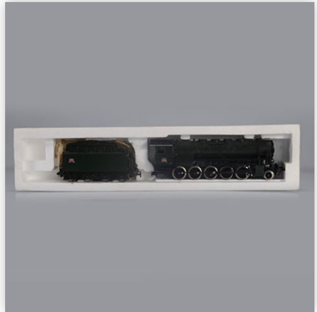
434 Jouef locomotive / Reference: 8741 / Type: steam 2-10-0 150x29 (Audun...

Référence: GFAB6573 — Poids: 500 g — Region: France — Sizes: Avec boîte= H=50mm L=355mm — Condition: At first glance - very good condition - no restoration - no repair