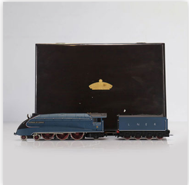
216 Bachmann locomotive / Reference: 257 / Type: Dominion of Canada #4489

Référence: GFAB6348 — Poids: 1.34 kg — Sizes: L=285mm — Condition: At first glance - very good condition - no restoration - no repair