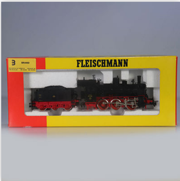
85 Fleischmann locomotive / Reference: 4124 / Type: G4

Référence: GFAB6210 — Poids: 355 g — Region: Allemagne — Sizes: Avec boite= H=50mm L=2250mm — Condition: At first glance - very good condition - no restoration - no repair