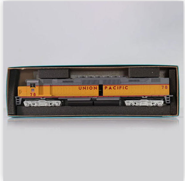
498 Athearn locomotive / Reference: 4290 / Type: DD40 2 MOTORS #78

Référence: GFAB6647 — Poids: 820 g — Region: Amérique — Sizes: Avec boite= H=40mm L=320mm — Condition: At first glance - very good condition - no restoration - no repair