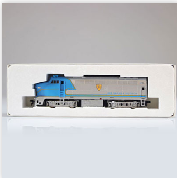
304 Roco locomotive / Reference: - / Type: Motor *9732

Référence: GFAB6439 — Poids: 500 g — Sizes: L=200mm — Condition: At first glance - very good condition - no restoration - no repair