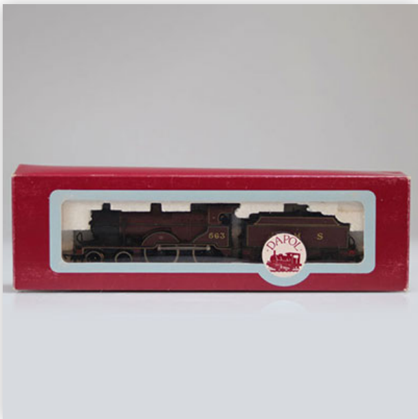
399 Dapol locomotive / Reference: 2p / Type: 4-42p "563"

Référence: GFAB6536 — Poids: 369 g — Sizes: L=220mm — Condition: At first glance - very good condition - no restoration - no repair