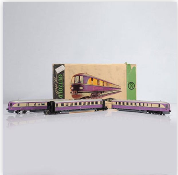
510 Gütsold Locomotive / Reference: 90 / EM 14/1 / Type: Schencktriebwagen...

Référence: GFAB6659 — Poids: 885 g — Sizes: Locomotive L=240mm — Condition: At first glance ? good condition - no restoration - no repair