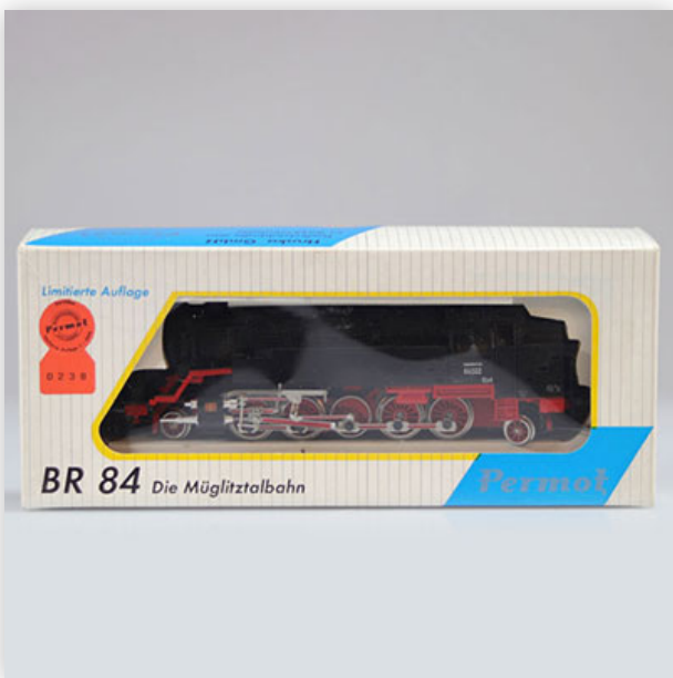
99 Locomotive Permot / Reference: BR84 / Type: 2.10.2 / 84002

Référence: GFAB6224 — Poids: 585 g — Sizes: L=185mm — Condition: At first glance - very good condition - no restoration - no repair