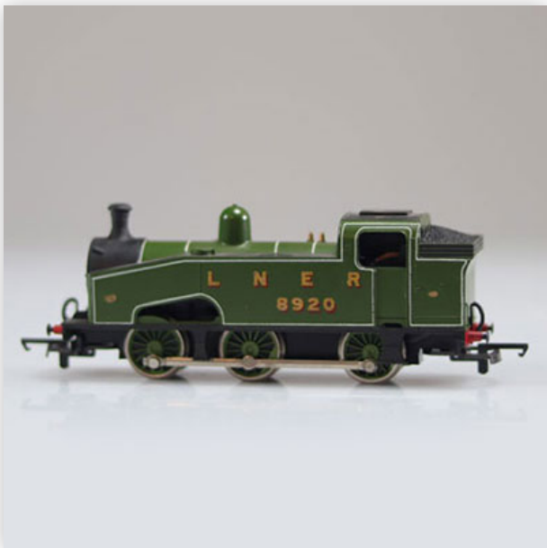
79 Rivarossi locomotive / Reference: - / Type: locotender 0-6-0 8920

Référence: GFAB6204 — Poids: 190 g — Sizes: L=160mm — Condition: At first glance - very good condition - no restoration - no repair