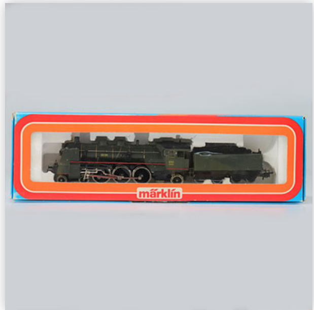
234 Marklin locomotive / Reference: 3083 / Type: 4.6.2 231-981 Saintes

Référence: GFAB6368 — Poids: 447 g — Region: Allemagne — Sizes: Avec boîte= H=50mm L=330mm — Condition: At first glance - very good condition - no restoration - no repair