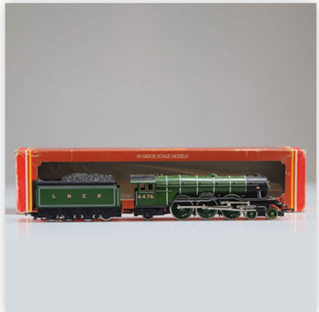
128 Hornby locomotive / Reference: R042 / Type: 4.6.2. "Royal launch" 4476

Référence: GFAB6254 — Poids: 500 g — Sizes: L=300mm — Condition: At first glance - very good condition - no restoration - no repair