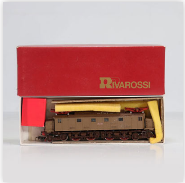
14 Rivarossi locomotive / Reference: M1460 / Type: E 428 066

Référence: GFAB6148 — Poids: 540 g — Sizes: L=240mm — Condition: At first glance - very good condition - no restoration - no repair