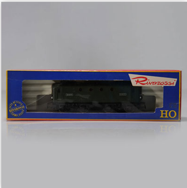
59 Rivarossi locomotive / Reference: 1671 / Type: BB-8178 electric locomotive

Référence: GFAB6183 — Poids: 300 g — Region: France — Sizes: Avec boîte= H=50mm L=255mm — Condition: At first glance - very good condition - no restoration - no repair