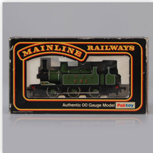
264 Mainline locomotive / Reference: 37054 /581 / Type: 0-6-0T J72 Class Tank

Référence: GFAB6398 — Poids: 275 g — Sizes: L=130mm — Condition: At first glance - very good condition - no restoration - no repair