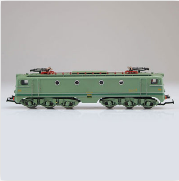
461 Ibertren locomotive / Reference: - / Type: motor 276.044.5 #7644

Référence: GFAB6610 — Poids: 350 g — Sizes: L=210mm — Condition: At first glance - very good condition - no restoration - no repair