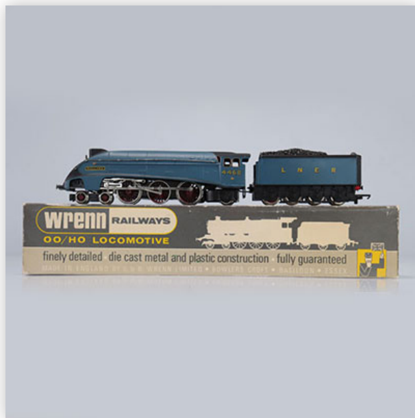
102 Wrenn locomotive / Reference: W2210 / 4468 / Type: Mallard 4.6.2.

Référence: GFAB6227 — Poids: 610 g — Region: England — Sizes: Avec boîte= H=45mm L=355mm — Condition: At first glance - very good condition - no restoration - no repair