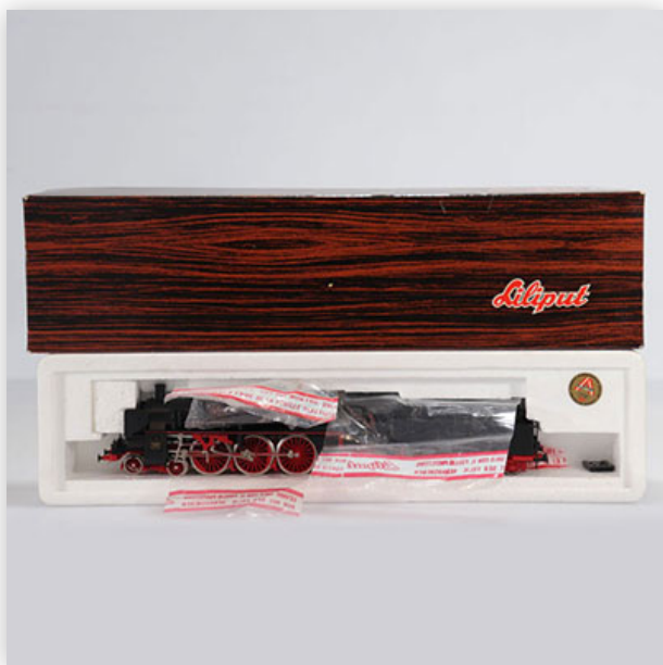
383 Liliput locomotive / Reference: 4002 / Type: Landerbahn Lokomotive 4.6.2....

Référence: GFAB6519 — Poids: 625 g — Sizes: L=265mm — Condition: Brand new