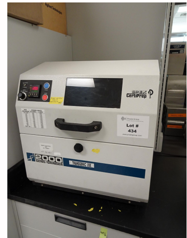
Dozens of Stereo and Fluorescence Microscopes · Virtis Bench Top Freeze Dryer · IBS MEDIAJET Petri Dish Filling System · Spex Geno-Grinder and much more