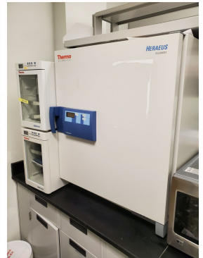
Tecan Freedom Evo Liquid Handling System · Percival Growth Chambers · Many ULT Freezers | Lab Fridges | Incubator Dry Bead Sterilizers · Sato Bar Code Printers · Fibre Lites · Centrifuges and more