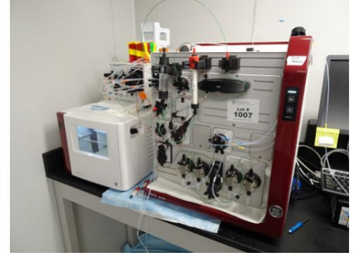
ViiA 7 Realtime PCR System · Bio Rad Thermocyclers · AKTA Chromatography Systems · Hundreds of Bench Top Assets · Scales & Balances · Glassware · Pipettes and much more