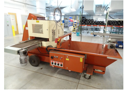
Javo Substrate Soil Mixer - Pot Placer and Soil Filler