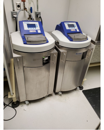
Phenospex PlantEye F500 Multispectral 3D Scanner · Lancer Freestanding Washers · Systec Mediaprep units Innova Stackable Shakers and Incubator · Refrigerated Centrifuges · and much more