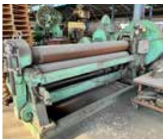
POPE, 1" X 10', 3 ROLLS