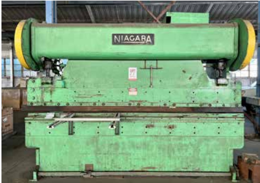
NIAGARA 12', MECHANICAL CHICAGO 6', MECHANICAL