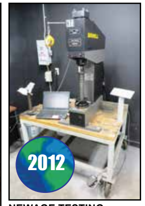
NEWAGE TESTING INSTRUMENTS BRINELL HARDNESS TESTER