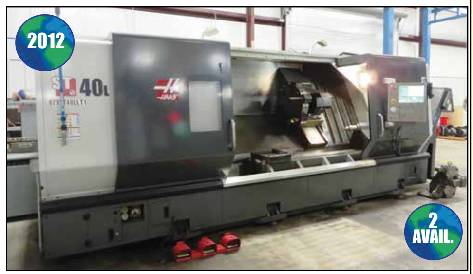
(2) HAAS ST-40L CNC TURNING CENTERS WITH MILLING & HYD. STEADY REST