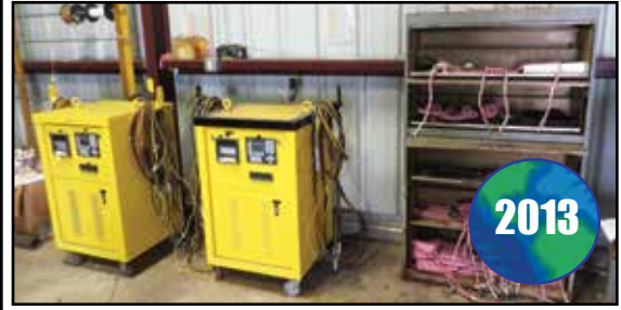
(2) PDS BARTECH PCE-30 HEAT TREATING CONSOLES