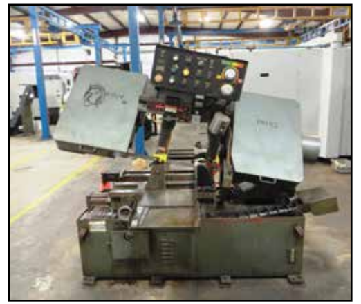
MARVEL SPARTAN FULLY AUTOMATIC HORIZONTAL BAND SAW