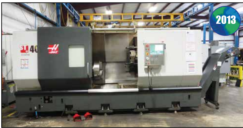
HAAS ST-40 CNC TURNING CENTER WITH HYDRAULIC STEADY REST