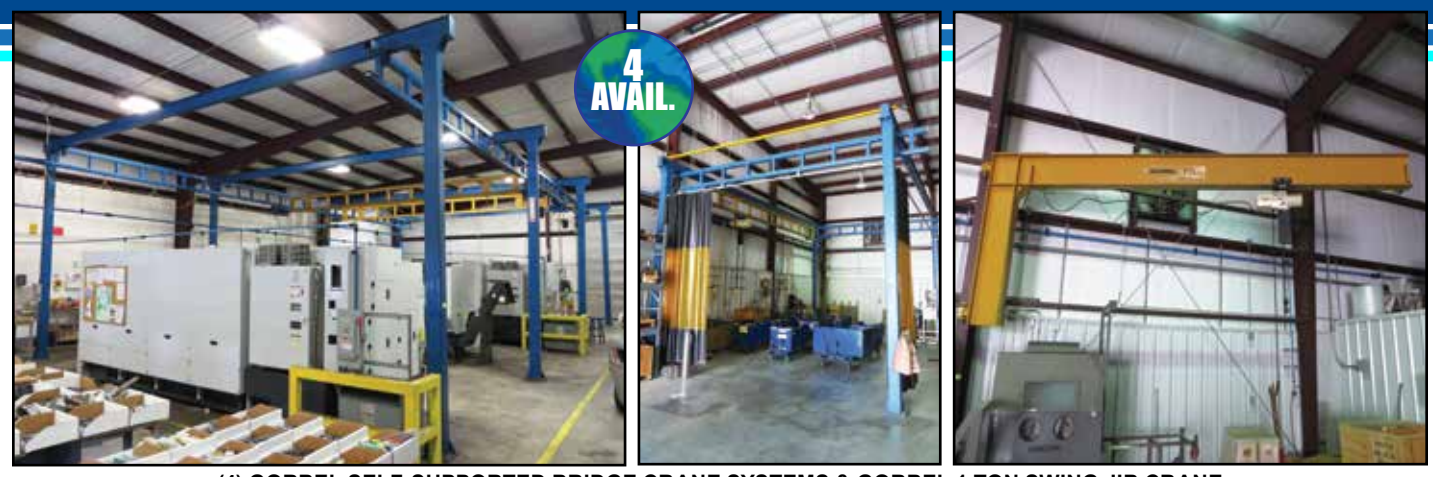
(4) GORBEL SELF-SUPPORTED BRIDGE CRANE SYSTEMS & GORBEL 1 TON SWING JIB CRANE