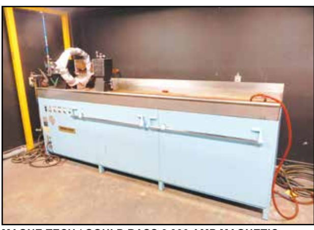
MAGNE-TECH / GOULD BASS 6,000 AMP MAGNETIC PARTICLE INSPECITON SYSTEM