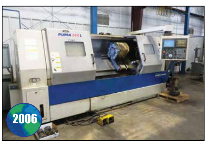
DOOSAN PUMA 300LC CNC TURNING CENTER