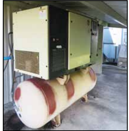
INGERSOLL RAND 20 HP TANK MOUNTED ROTARY SCREW AIR COMPRESSOR