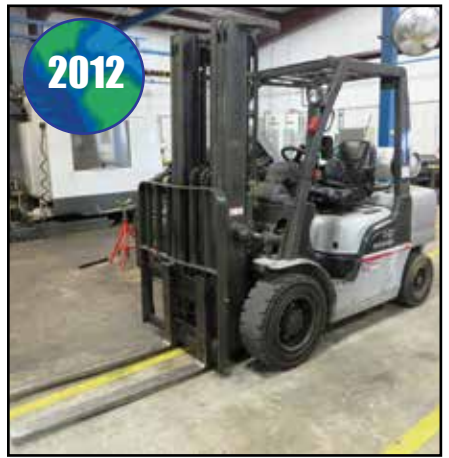
NISSAN 6,000LB PROPANE FORKLIFT