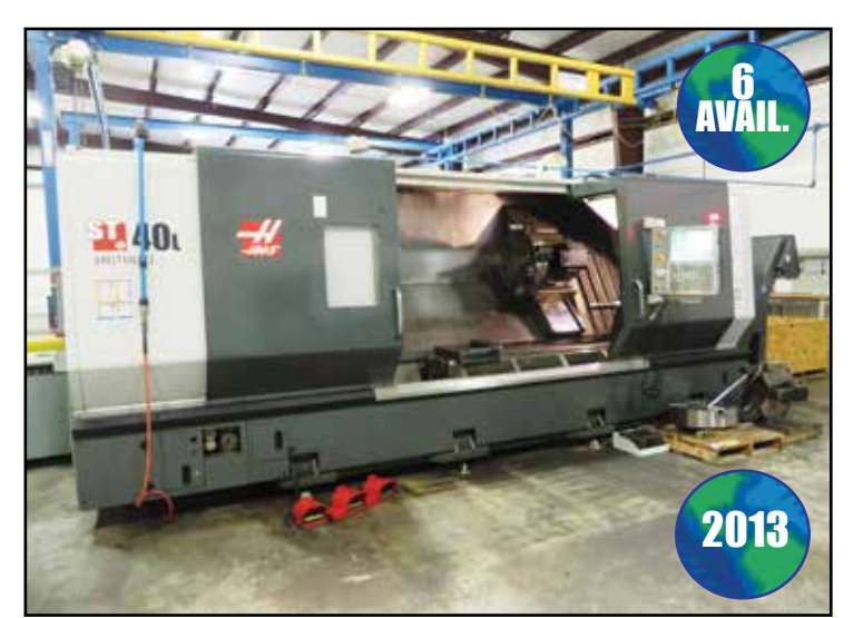
(6) HAAS ST/SL40 CNC TURNING CENTERS WITH HYDRAULIC STEADY REST