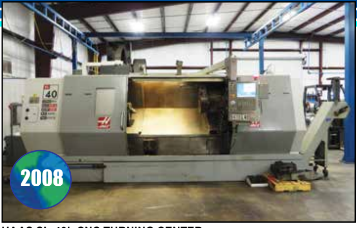
HAAS SL-40L CNC TURNING CENTER