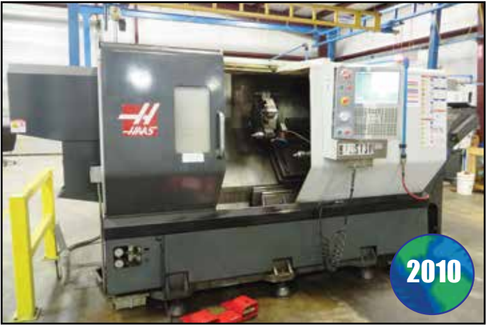
HAAS ST-30 CNC TURNING CENTER