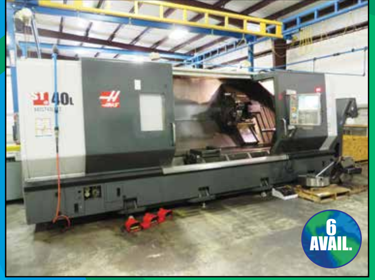
(6) HAAS ST/SL 40 CNC TURNING CENTERS WITH HYDRAULIC STEADY REST