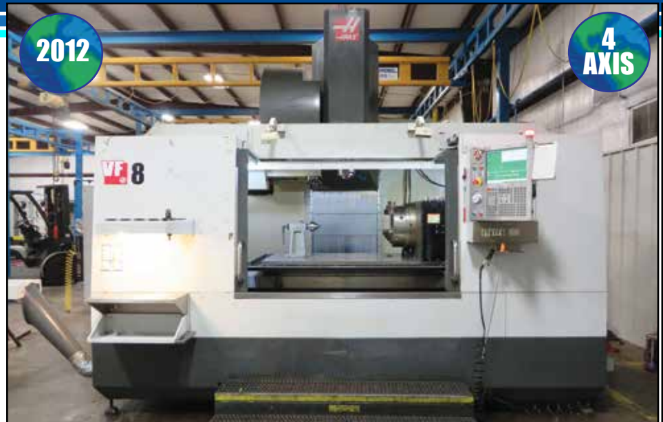
HAAS VF-8/50 4-AXIS CNC VERTICAL MACHINING CENTER