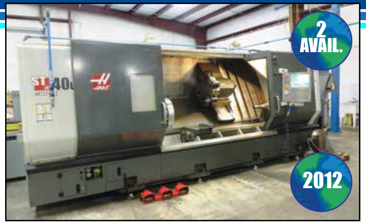
(2) HAAS ST-40L CNC TURNING CENTERSWITH HYDRAULIC STEADY REST