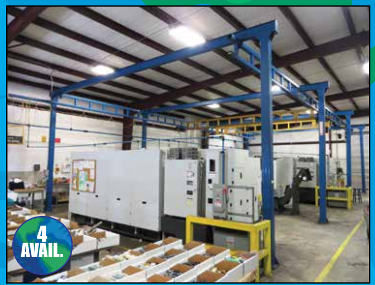
GORBEL SELF SUPPORTED BRIDGE CRANE SYSTEMS