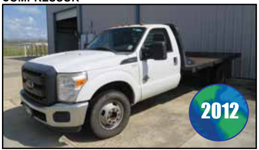
FORD F350 SUPERDUTY STAKE BODY TRUCK