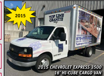
2015 CHEVROLET EXPRESS 3500 16' HI-CUBE CARGO VAN