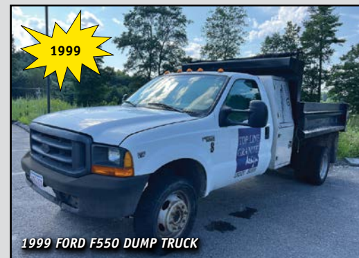
1999 FORD F550 DUMP TRUCK