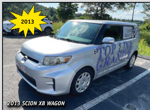
2013 SCION XB WAGON