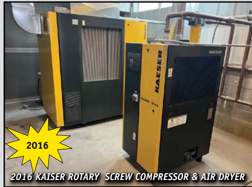
2016 KAESER ROTARY SCREW COMPRESSOR & AIR DRYER