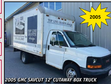
2005 GMC SAVCUT 12' CUTAWAY BOX TRUCK