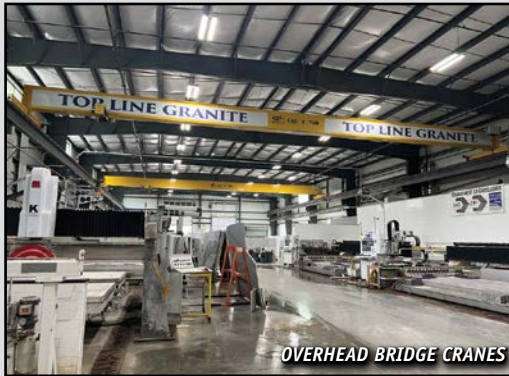
OVERHEAD BRIDGE CRANES