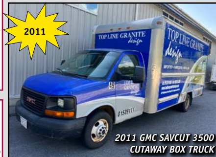
2011 GMC SAVCUT 3500 CUTAWAY BOX TRUCK