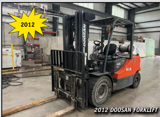
2012 DOOSAN FORKLIFT