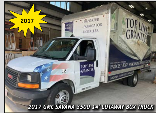
2017 GMC SAVANA 3500 14' CUTAWAY BOX TRUCK