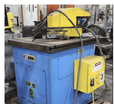
BOSCHERT HYDRAULIC SHEETMETAL NOTCHING MACHINE