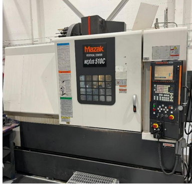
2004 MAZAK VCN-510C VMC