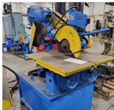
TABOR ABRASIVE CUT-OFF SAW