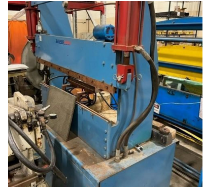
4' ZAKSPEED PRESS BRAKE