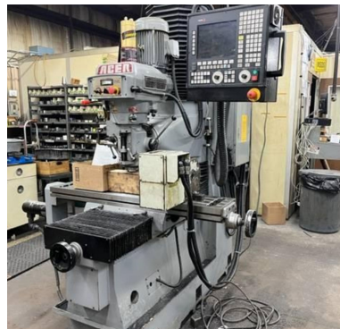
*NEW 2012* ACER BED TYPE CNC MILL W/4TH AXIS