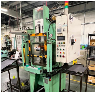
2015 5 TON KOEI PRESS