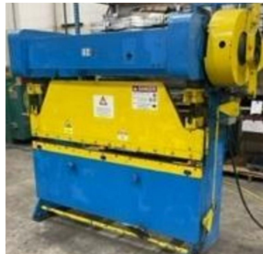
6' X 16 GA LENNOX PRESS BRAKE