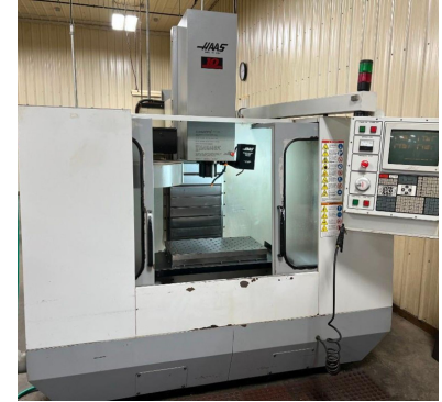
HAAS VF1 VMC