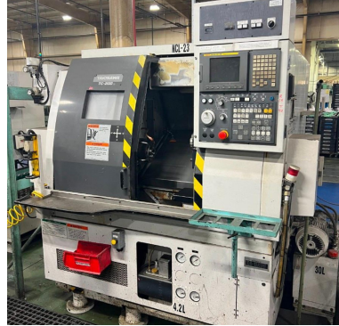
2003 TAKISAWA TC-200 *(2) AVAILABLE*