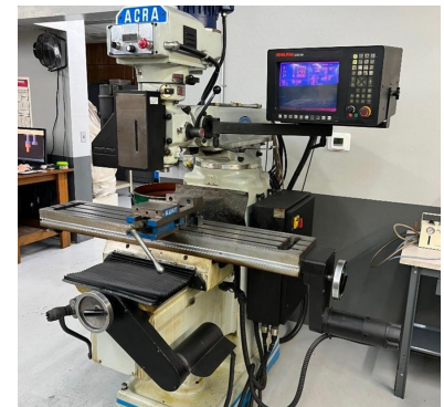
ACRA CNC MILL W/ ANILAM CONTROL