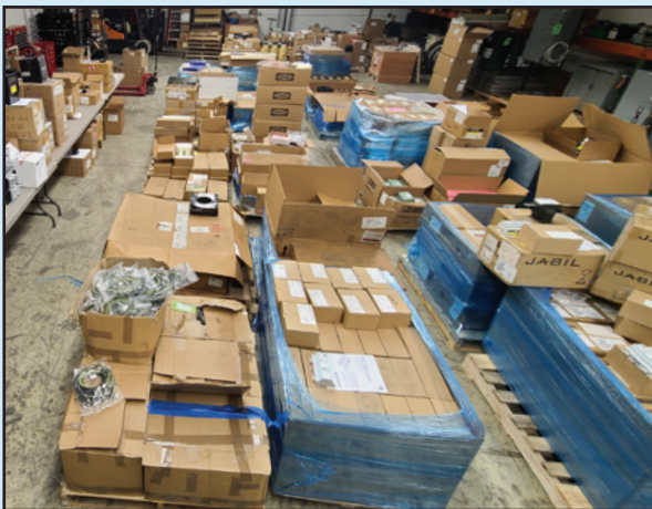
CONTROLS, CABLES AND HARDWARE

CHARLESTON Auctions & Liquidations 433 Council Drive, Fort Wayne, IN 46825