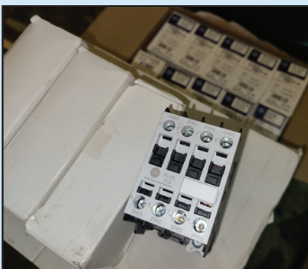
GE AUXILIARY RELAY