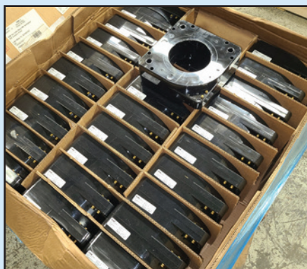
HUGE QTY OF ABB CURRENT TRANSFORMERS