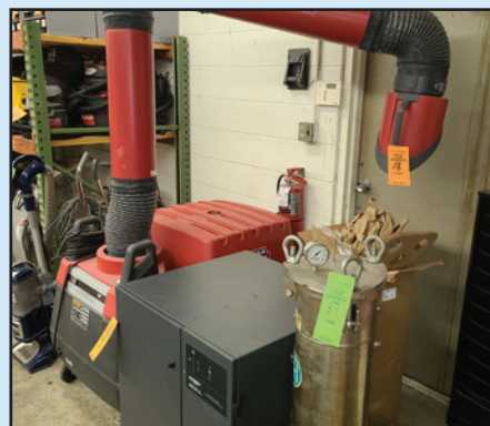
LINCOLN MOBILFLEX FUME EXTRACTOR