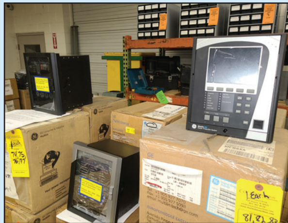
GE MULTILIN RELAYS