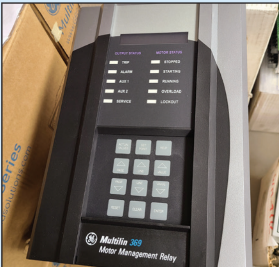
GE MULTILIN MOTOR RELAY