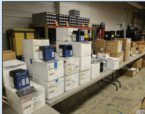
LRG QTY OF VARIOUS SEL RELAYS