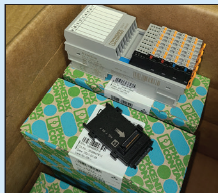
PHOENIX CONTACTS AXILINE F 32 DIGITAL INPUT