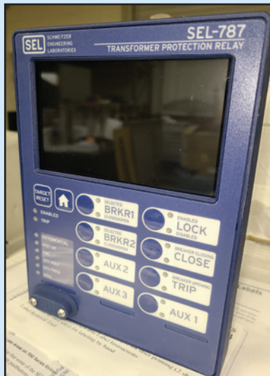
SEL TRANSFORMER PROTECTION RELAY