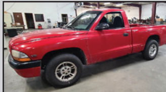
1997 DODGE DAKOTA