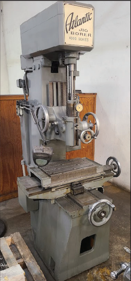
ATLANTIC JIG BORER