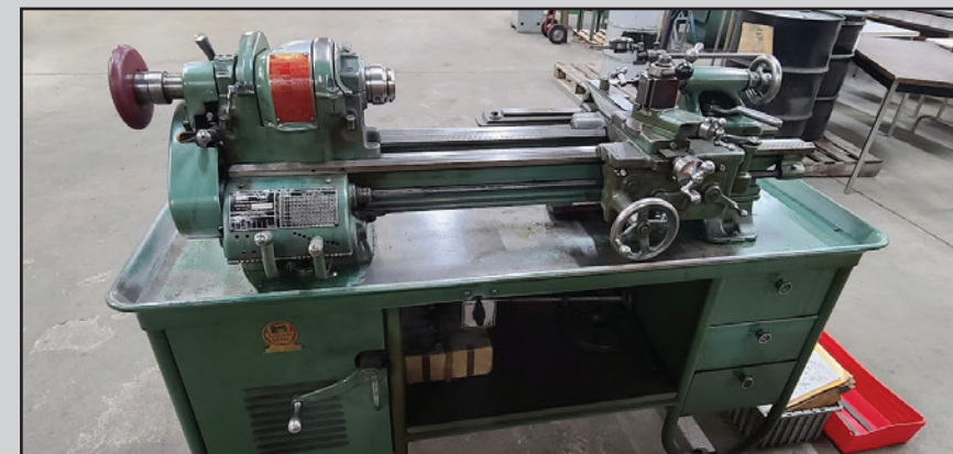
SOUTH BEND LATHE