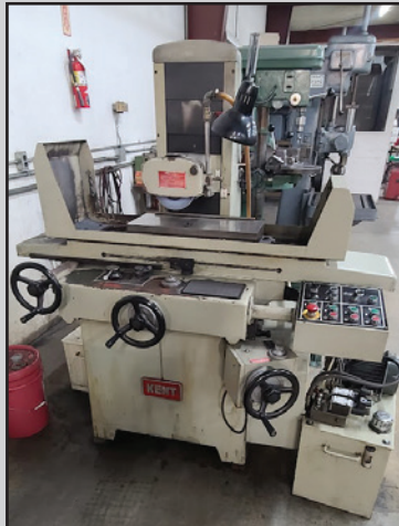
KENT SURFACE GRINDER