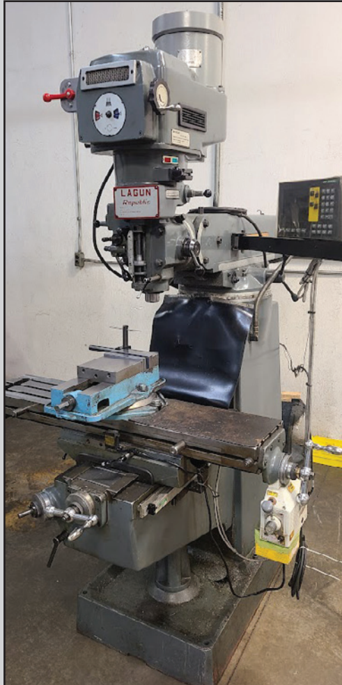
LAGUN MILLING MACHINE