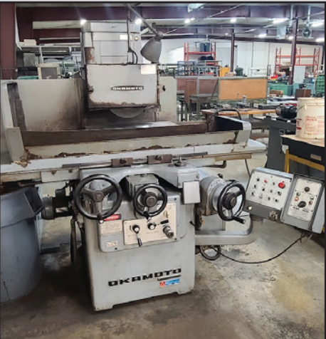
OKAMOTO SURFACE GRINDER