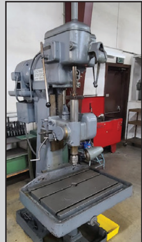
CINCINNATI BICKFORD SUPER SERVICE DRILL PRESS