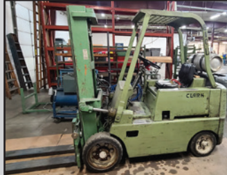
(1 OF 2) FORKLIFTS

View Complete Catalog at www.CharlestonAuctions.com