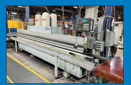
Brandt Model KD 86-F LT Edge Bander