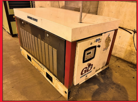
(2) 30 HP Gardner Denver Base Mounted Air Compressor