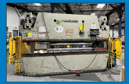
250 Ton x 12' Accurpress 725012 Press Brake