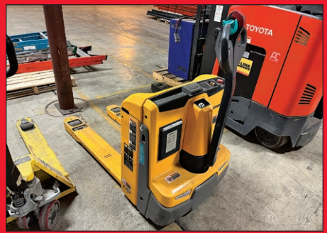
4,500 LB Jungheinrich EJE 120 US Electric Pallet Truck