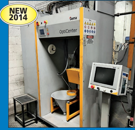
ITW Gema OptiCenter Magic Cylinder QCS03 Powder Loading Station