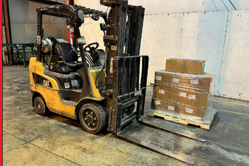
5,000 LB CAT 2C5000 LP Gas Lift Truck