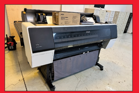
Epson Stylus Pro 9900 Plotter