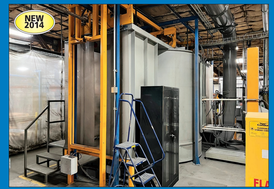
ITW Gema Eight-Gun Automatic Pass-Thru Powder Coat Booth; 31" x 80" Window (2014)