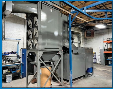
30 HP Torit Model DF03-12(8K) Six Cartridge Dust Collector