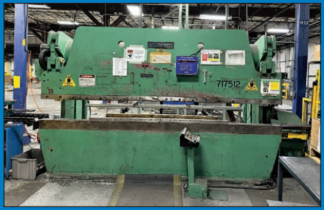
175 Ton x 12' Accurpress 717512 Press Brake