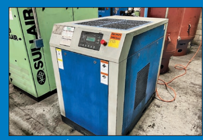
40 HP Kore Air Compressor