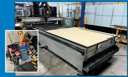
MultiCam 3000 CNC Router (2009)