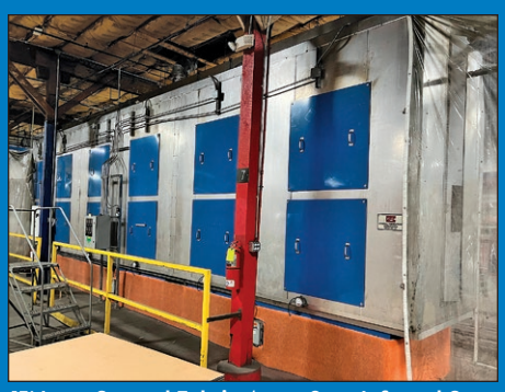
45' Long General Fabricatrons Corp Infrared Cas Oven, 17" x 80" Window