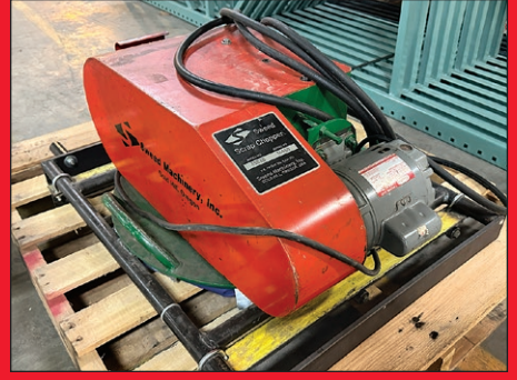
Sweed Model 450AB Scrapper Chopper