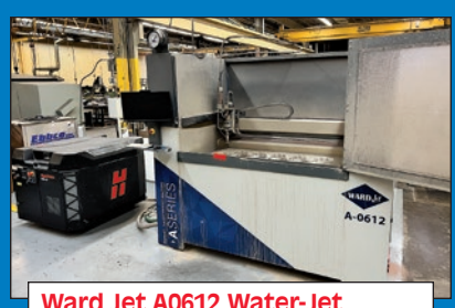
Ward Jet A0612 Water-Jet