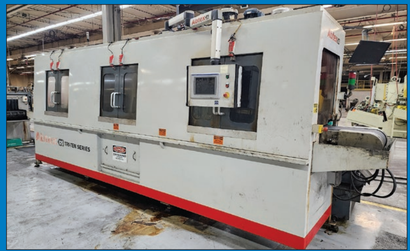
Abtex 2000-P-3-10 Multi-Head Brush Deburring Line

(2) Pangborn Model 6GN-1R36 42" Rubber Belt Barrel