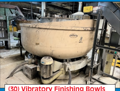
(30) Vibratory Finishing Bowls