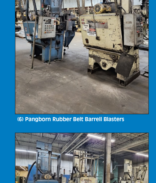
(6) Pangborn Rubber Belt Barrell Blasters

34" Holcroft Continuous Belt Natural Gas Draw Furnace; s/n 6828