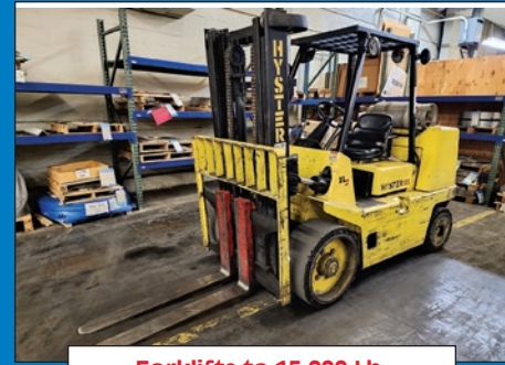
Forklifts to 15,000 Lb.