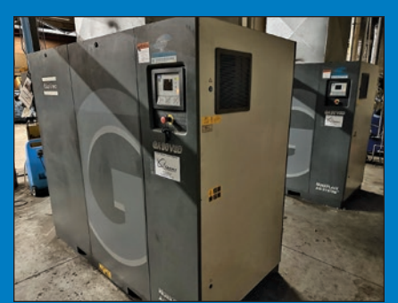
(3) 125-HP Atlas Copco GA90VSD Air Compressors

(100+) Lots Inspection Tools and Equipment; Height Gages, Mics, Calipers,