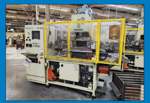
(10) Hydraulic Press Heat-Set Systems w/ Auto Feeds

(7) Die Quench Lines (3) UPDATED 2012 Each w/ Belt Oven, Hydraulic Press, Induction Heater, Robot and Related