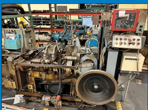
Baird Model 33 Multi-Slide Machine

Timed Online Bidding Ends 12/15 at 10:00 AM Over (300) Lots of Maintenance Machinery, MRO Inventory and Shop Equipment