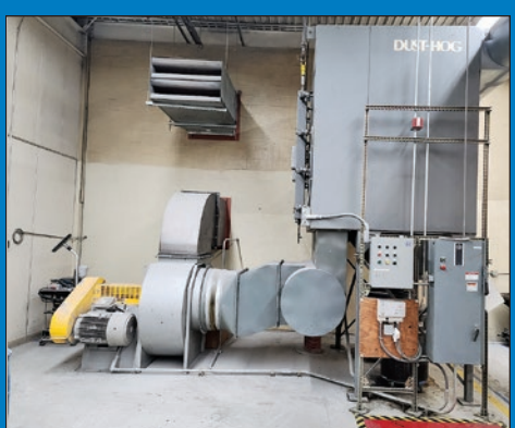
40-HP Dust Hog 16-Cartridge Dust Collector