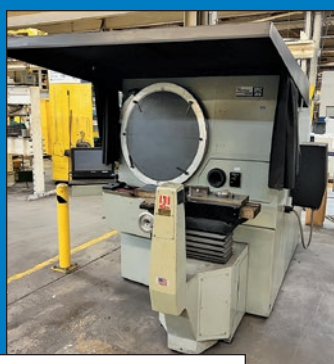
Inspection Equipment, (10) Load Testers, (15) Comparators, Inspection Tools