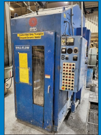
Sinto Roll-Flow EVF-08R Centrifugal Disc Finisher