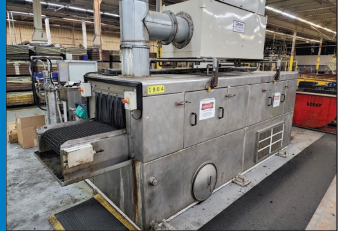
Crown 5024W/BO Stainless Continuous Belt Parts Washer