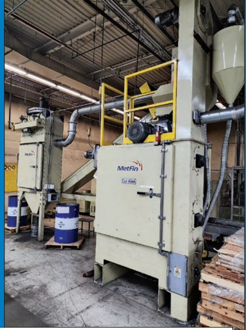
(3) Metfin Model 600 46" Rubber Belt Barrel Blast Machines w/ Dust Collectors, Shaker Tables and Load Conveyors