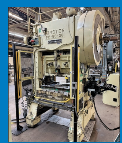
60 Ton Minster P2-60-36 SSDC Press