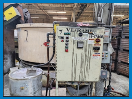
(2) 80 Cu. Ft. Rosler VL Rampe SB-100 Finishing Bowls