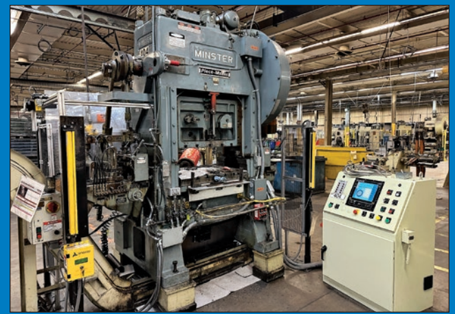
(3) 60 Ton Minster P2-60-36 SSDC Presses, Feed Lines

• 18" x 8,000 Lb. Dallas / CWP Servo Feed Line; Dallas Model DRF-418 Servo Feed, .125" x 18" Wide, CWP Model 18C Straightener, .021" - .187"