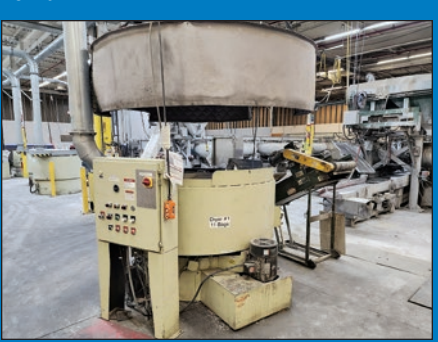
(4) Rosemont RD-12-10 Drying Bowls