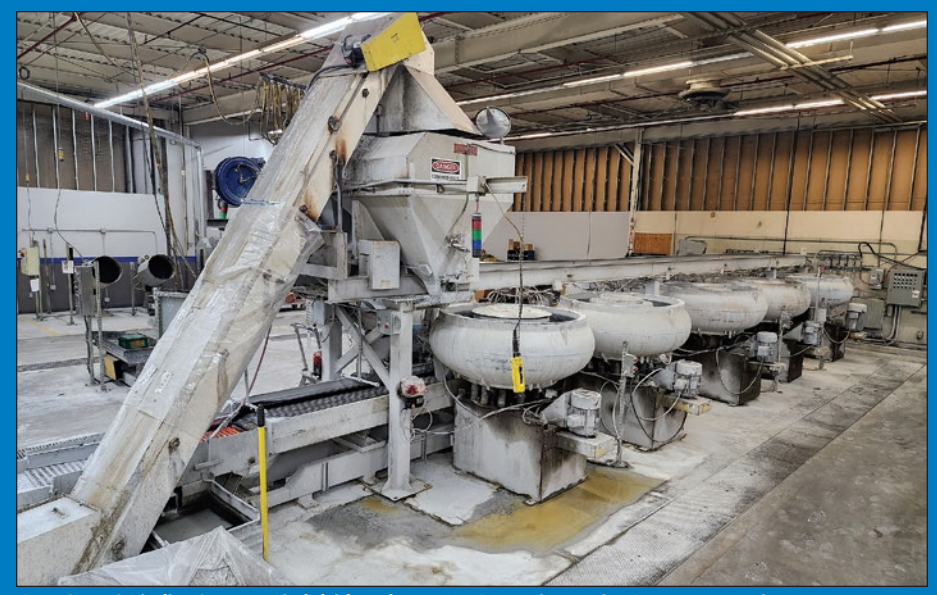
(2) Automated Vibratory Bowl Finishing Lines w/ (16) Bowls, Loader Conveyors and Hoppers