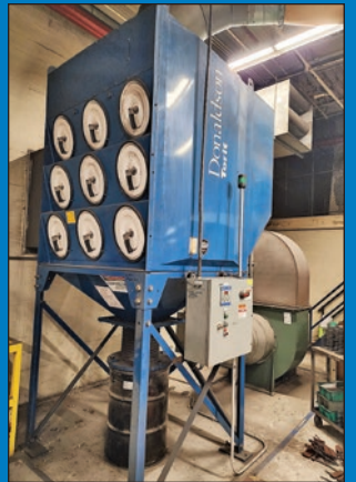
Torit DF03-18 Cartridge Dust Collector