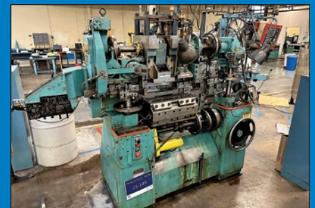
Torin V-82 Verti-Slide Machine