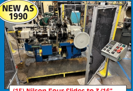
(15) Nilson Four-Slides to 3/16"