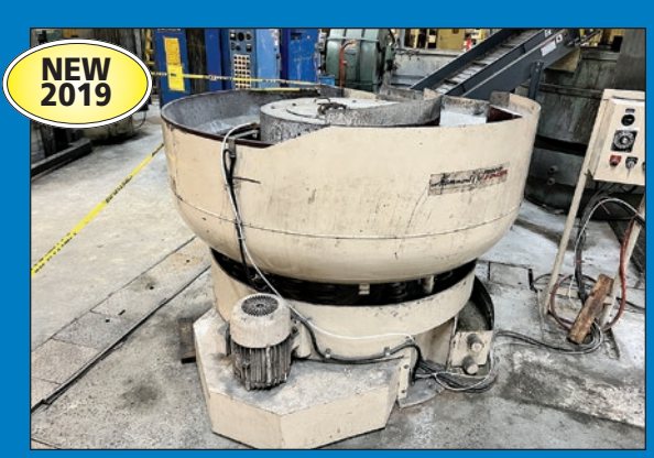
Roto-Finish Model ER-1822 Vibratory Finishing Bowl