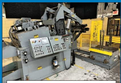
Late Model Servo Feed Lines