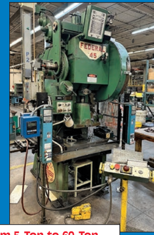
(20) OBI Presses to from 5-Ton to 60-Ton