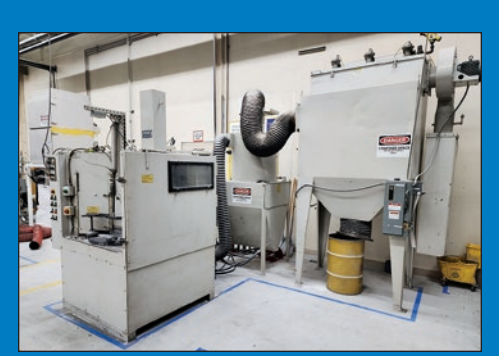
Guyson RXS900 Multi-Station Blast System w/ Dust Collector