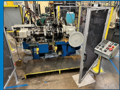
3/16" Nilson 3F Multi-Slide Machine