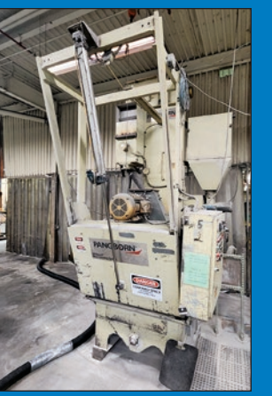
(6) Pangborn Rubber Belt Barrell Blasters