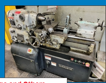
(10) Lathes by Leblond, Harrison, Clausing, Hardinge and Others