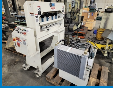
COE 24W Auto Shear Line (New - Never Put in Service)

(300+) Lots of Very Clean Shop and Support Equipment; (50) Self Dumping Hoppers, Fans, Rolling Step Sets, Pallet Trucks, Tools, Box Tapers, Scales, Racks, Cabinets, Steel and Wood Top Benches, Small Machinery, Power and Hand Tools