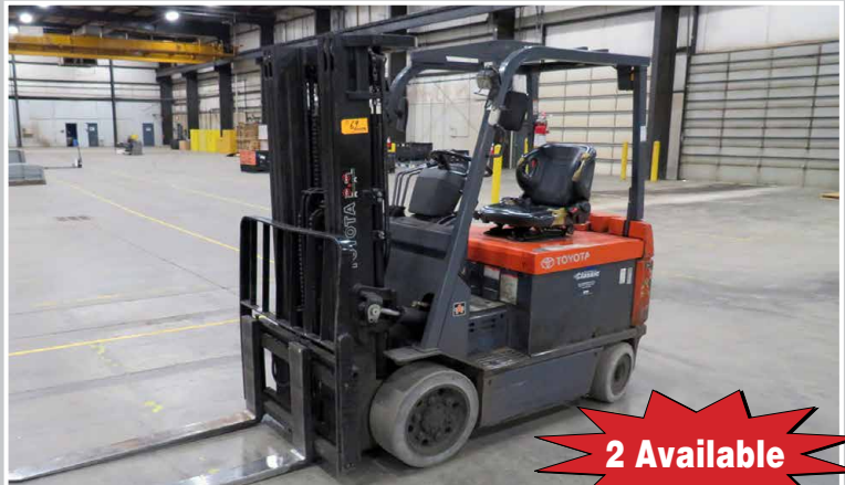
TOYOTA 5,750 Lb. Capacity Electric Forklift