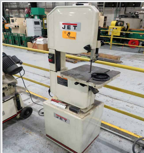
JET J-8201K – 14" Wood/Metal Vertical Band Saw