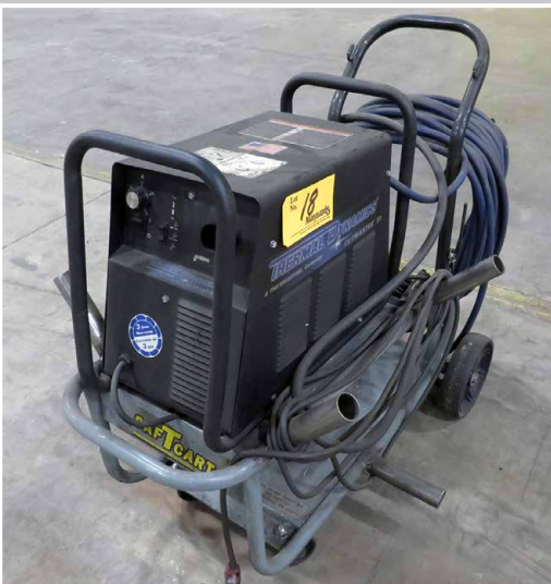
THERMAL DYNAMICS Cutmaster 51 Plasma Cutter