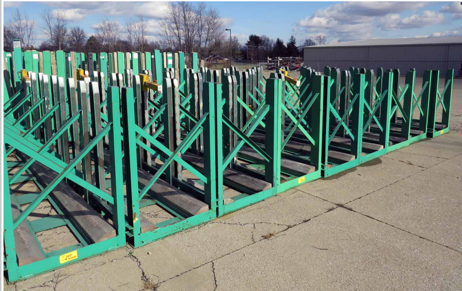
Tube Storage Racks