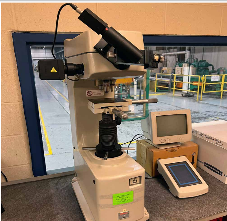
MITUTOYO / AKASHI HV-113 Digital Hardness Testing Machine