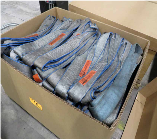
LIFT-ALL Tuff Edge Eye-Eye 4" W x 11' L Polyester Web Slings