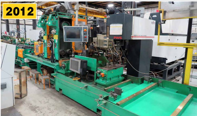
KUSAKABE Rafted Pipe Mill with Tooling