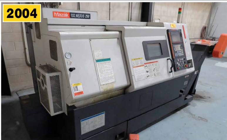
MAZAK Quick Turn Nexus 250 CNC Turning Center