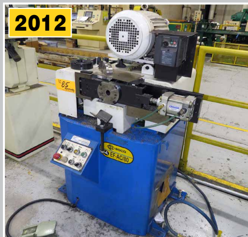
2012 SOCO EF-AC/80 Tube Chamfering Machine