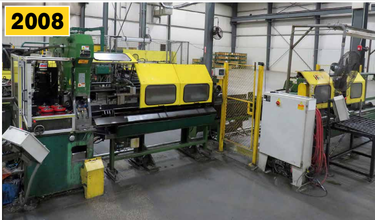
3" HAVEN 873 Recut Machine with End Finishing/Deburring