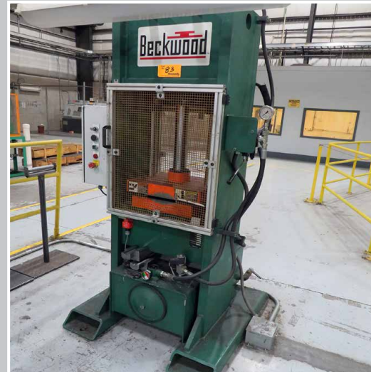
BECKWOOD Tube Expanding Press