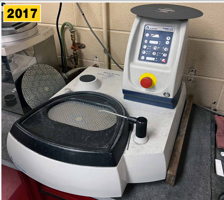
BUEHLER EcoMet 250 Grinder-Polisher