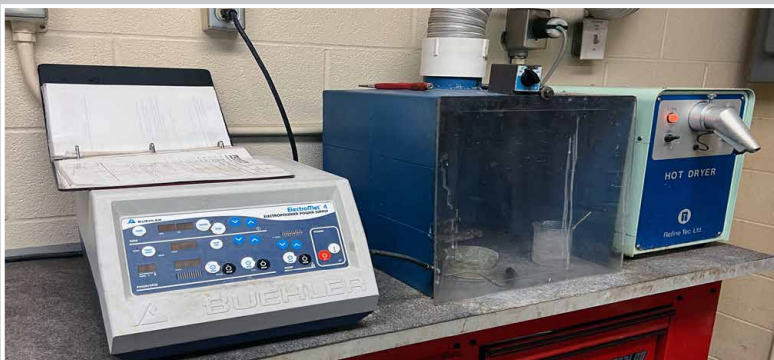
BUEHLER ElectroMet 4 Power Source & BUEHLER EM4