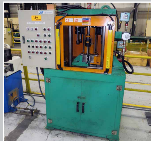
SK Hydraulic Tube Expanding Tester

FOR FURTHER INFORMATION CONTACT: Ken Planet at 248.238.7988 or email Kplanet@maynards.com