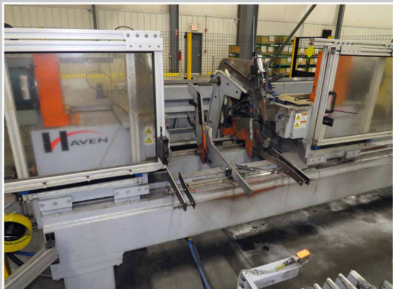
HAVEN Double End Chamfering Machine