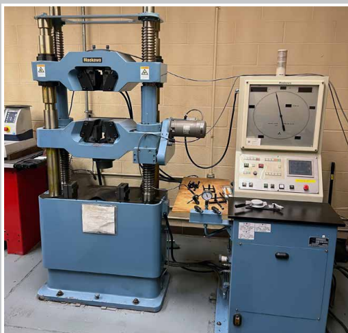
MAEKAWA MRA-50-F2 Tensile Testing Machine