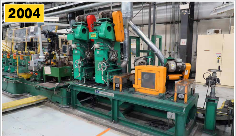
KUSAKABE Rafted Pipe Mill with Tooling