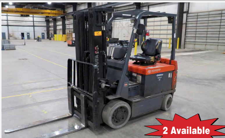
TOYOTA 5,750 Lb. Capacity Electric Forklift