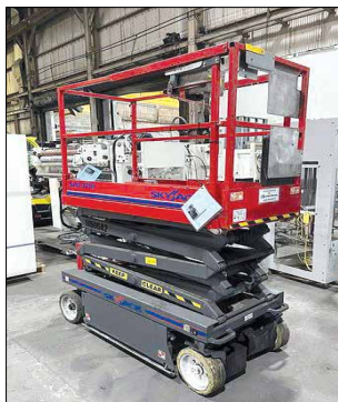
Skyjack Electric Scissor Lift