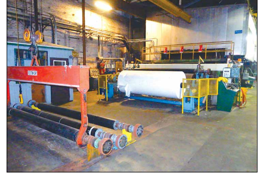
Manchester Horizontal Track Reel