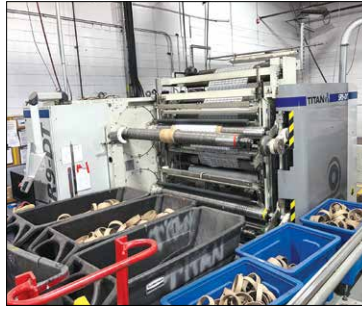
65" Titan Turret Slitter Rewinder