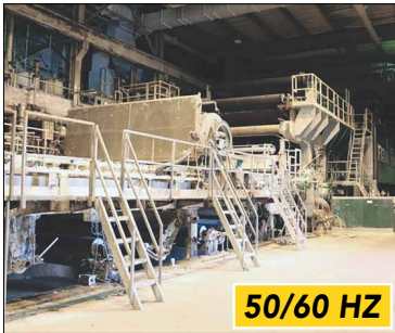
180" Face (160" Trim) Fourdrinier Machine