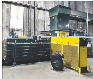
International Baler Corp. Auto Tie