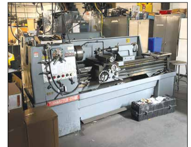
Machine Shop Equipment