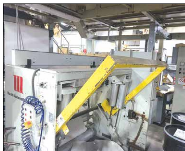
Martin Automatic Unwinds / Rewinds