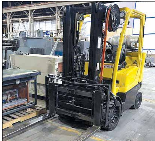
8,000 Lb. Cap. Hyster Forklift