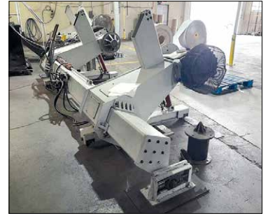
87" Powell Shaftless Floor Pick-Up Unwind

INSPECTION: Thursday, Friday & Monday, July 27th, 28th & 31st, 2023, By Appointment Only