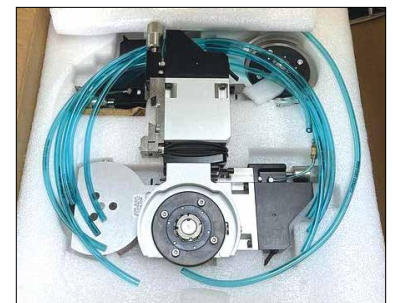
Maxcess Tidland Knives