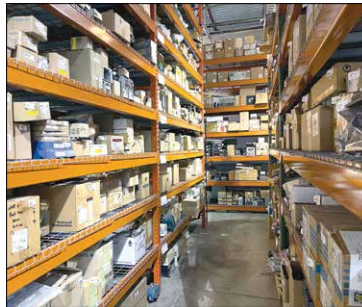
100's of New Spares