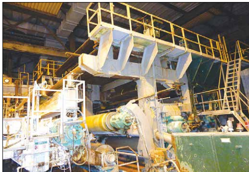
Press Section PM3