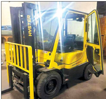
6,000 Lb. Cap. Hyster Forklift