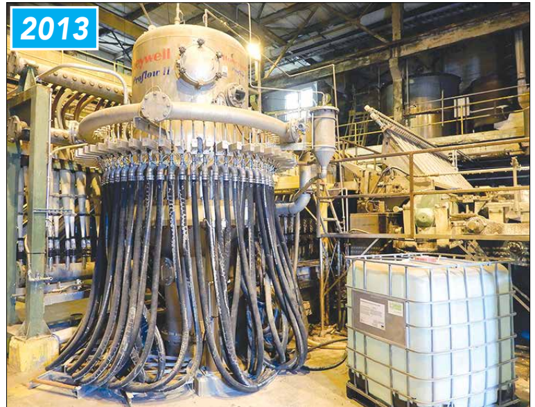
Honeywell Model ProFlow II Position Automatic Profile Dilution System