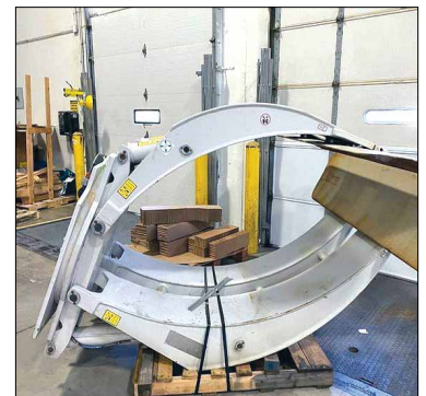
Cascade Paper Roll Clamps