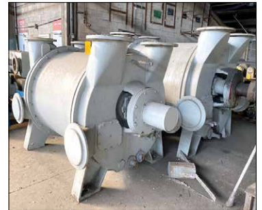
Nash & Siemens Pumps

INSPECTION: Thursday, Friday & Monday, July 27th, 28th & 31st, 2023, By Appointment Only