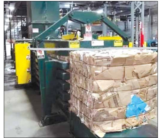
Auto Tie Balers