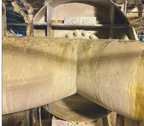
Voith Contaminex CMS20 Scavenger