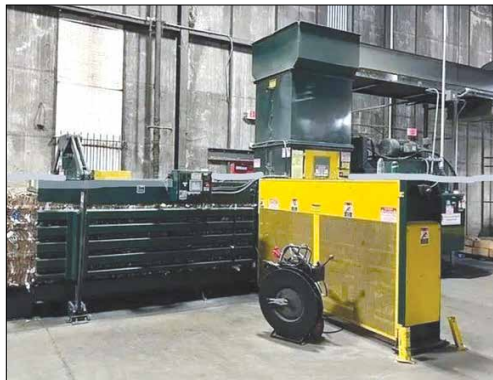
International Baler Corp. AT-4343-8-50 Auto Tie