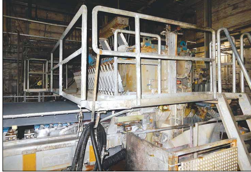
Mec-Fab 129" Air Pad HeadBox