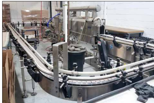
PDC Steam Tunnels