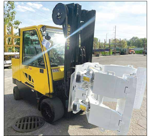
12,000 Lb. Cap. Enclosed Cab Forklift