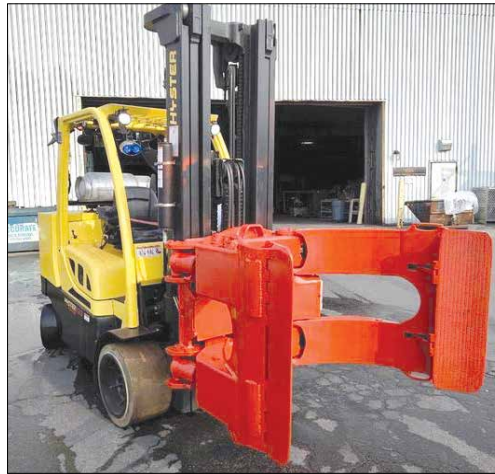
12,000 Lb. Cap. Hyster Clamp Truck