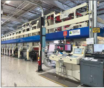
Rotomec 10 Color Rotogravure Press