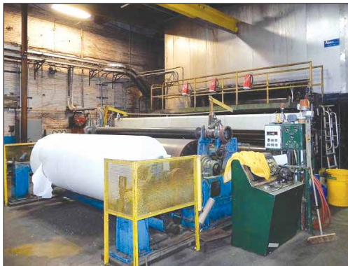
130" Face (118" Trim) Fourdrinier Machine (PM2)