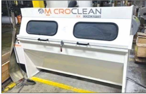
Printing Press Anilox Cleaner

Dusenbery Slitter Karlville Seamer and Much More!