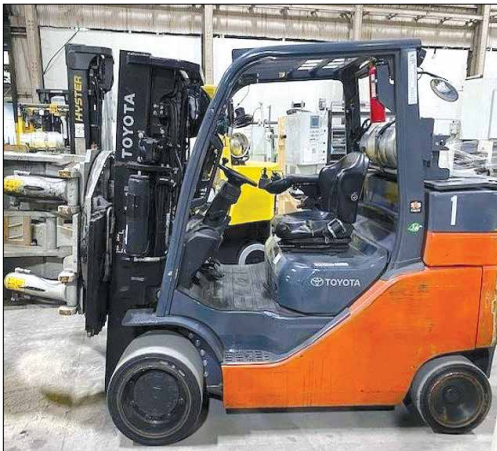
10,000 Lb. Cap. Toyota Clamp Truck