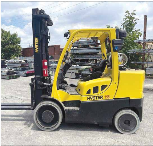
15,500 lb. Cap. Hyster Forklift

Forklifts, Roll Clamp Trucks, Sweepers, Trucks, Scissor Lifts and Much More!