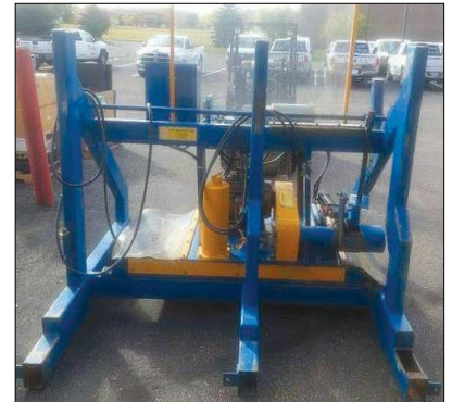
L-M Paper Roll Saw PS200-8DE