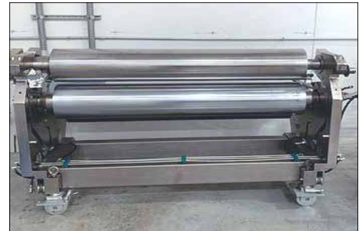
Five Roll Coater