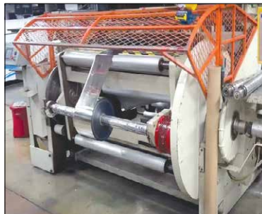
Turret Unwinds / Rewinds