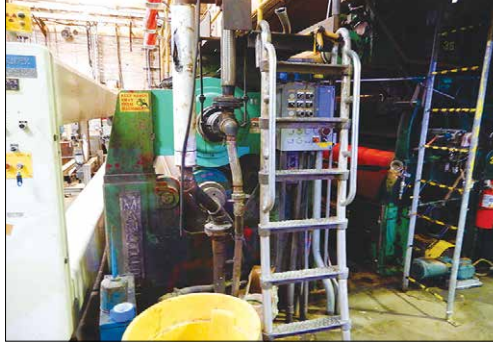
Manchester 2-Roll Calendar