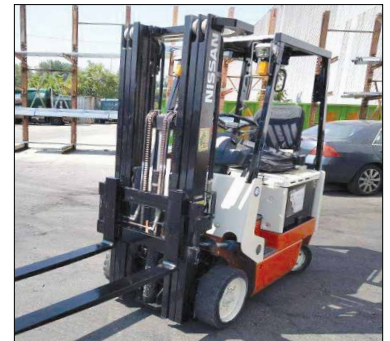
3,000 Lb. Cap. Nissan Electric Forklift