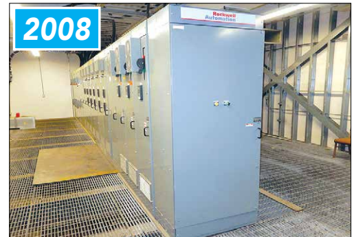
Rockwell Automotive Drives of PM3