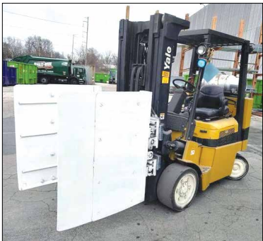
8,000 Lb. Cap. Yale Bale Truck