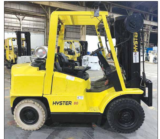
8,000 Lb. Cap. Pneumatic Forklift