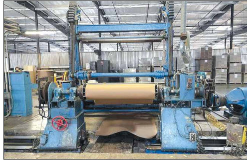
Two Drum Slitter Rewinders