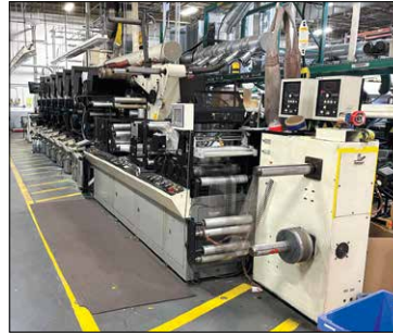
Comco Commander 7 Label Press