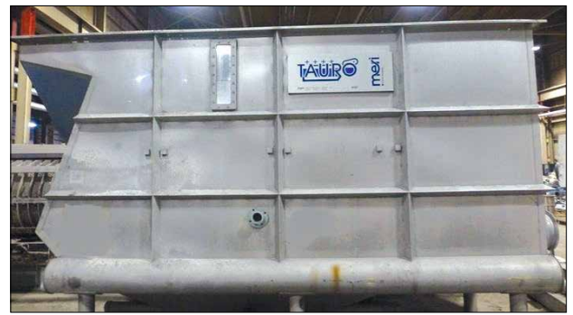
Voith Meri Tauro Clarifier

Various Pulper Drives Various Scavengers Various DD4000 Refiners Various Nash Vacuum Pumps Various Roll Splitters Various Lab Equipment Various Fisher Valves Various Roll Strappers & Much More!