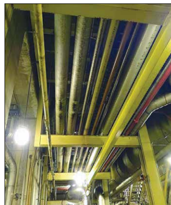
316 SS Tubing