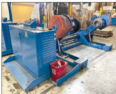
Jagenberg Shaftless Unwinds