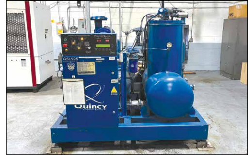
Quincy QSI-925 Air Compressor