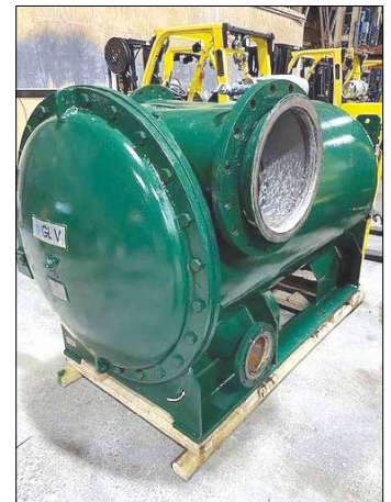
GL&V M-32 Pressure Screen