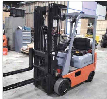
3,000 Lb. Cap. Toyota Forklifts