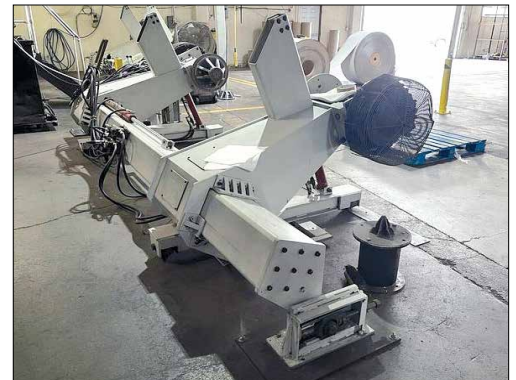
87" Powell Shaftless Floor Pick-Up Unwind