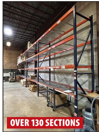
HEAVY DUTY ADJUSTABLE PALLET RACKING