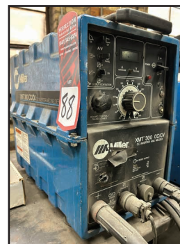
MILLER XMT 300 CC/CV DC INVERTER ARC WELDER