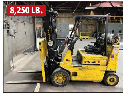
HYSTER S80XLBCS LP FORKLIFT

ALSO: SKYJACK Scissor Lift, Pallet Racking, Air Compressors, Air Dryers, Cabinets, Pallet Jacks, Rolling Carts, Work Benches, Rolling Tool Carts, Sanding Equipment, Rolling Gantry Crane, Walk-Behind Floor Scrubbers, Misc. Hand & Power Tools, and more