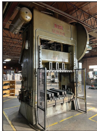
BLISS S2-300-72-48 STRAIGHT SIDE PRESS