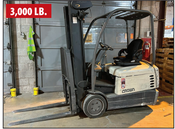
CROWN SC 4020-30 TT190 ELECTRIC FORKLIFT