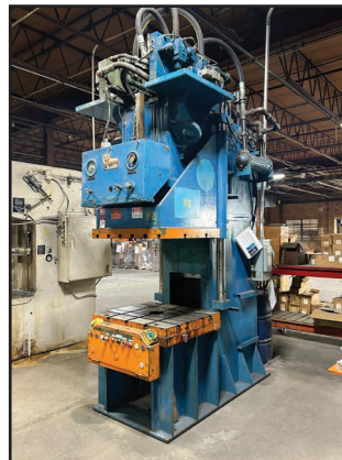
KR WILSON 38 TON C-FRAME PRESS