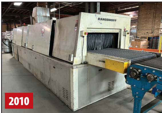
RANSOHOFF LEANVEYOR PASS THROUGH WASHER