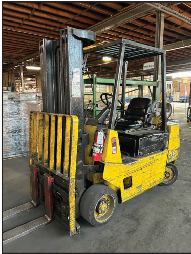
HYSTER S50XL LP FORKLIFT