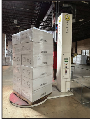
EAGLE 2000BE SEMI-AUTOMATIC STRETCH WRAPPER