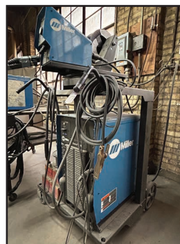
MILLER AXCESS 450 MIG WELDER