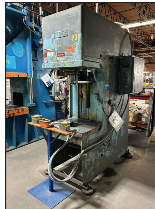
DENISON C-FRAME PRESS