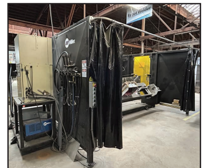
PANASONIC ROBOTIC WELDING CELL