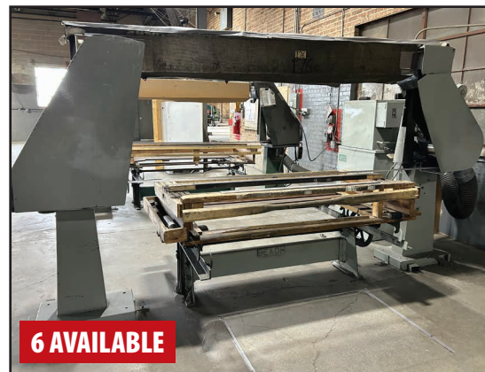
BEACH SEAM WELD POLISHER