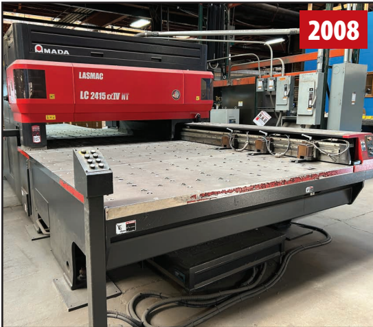
AMADA LASMAC LC2 415A4NT LASER

https://perfection.global/justmanufacturing