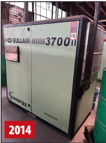
SULLAIR 3709 AC AIR COMPRESSOR