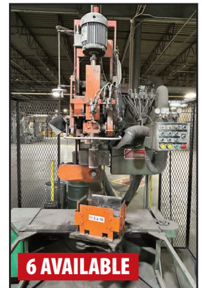
DREILING MACHINE SIDE POLISHER