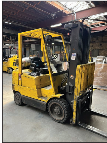
HYSTER S50XM LP FORKLIFT