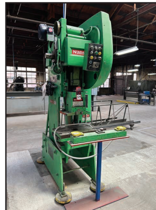
NIAGARA M-35 OBI PRESS