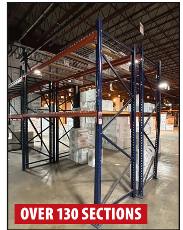
OVER 130 SECTIONS