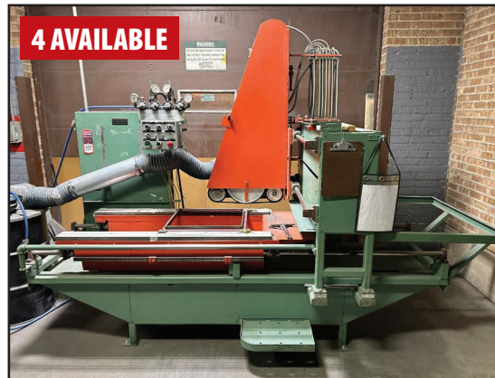
DREILING MACHINE DECK POLISHER

2010 RANSOHOFF PASS THROUGH WASHER , s/n 5145 (10) DREILING MACHINE SIDE & DECK POLISHERS (2) HI-LITE V28M3-PC-A2-T-30M POLISHERS , s/n 7-971-649-R-9-2089, 7-2380-920R-B46-4-690 (6) BEACH SEAM WELD POLISHERS , (4) Incl. Dust Collectors