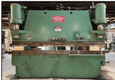
CHICAGO D&K 235-F-10 235 TON PRESS BRAKE

WYSONG 1072 SHEAR, s/n P119-167X, 6' x 10 Ga Capacity