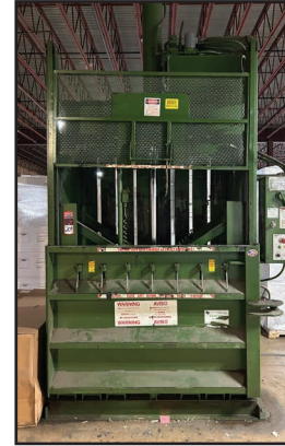
SELCO V5-HD VERTICAL BALER