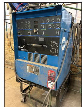
MILLER SYNCROWAVE 250 DX TIG & STICK WELDER