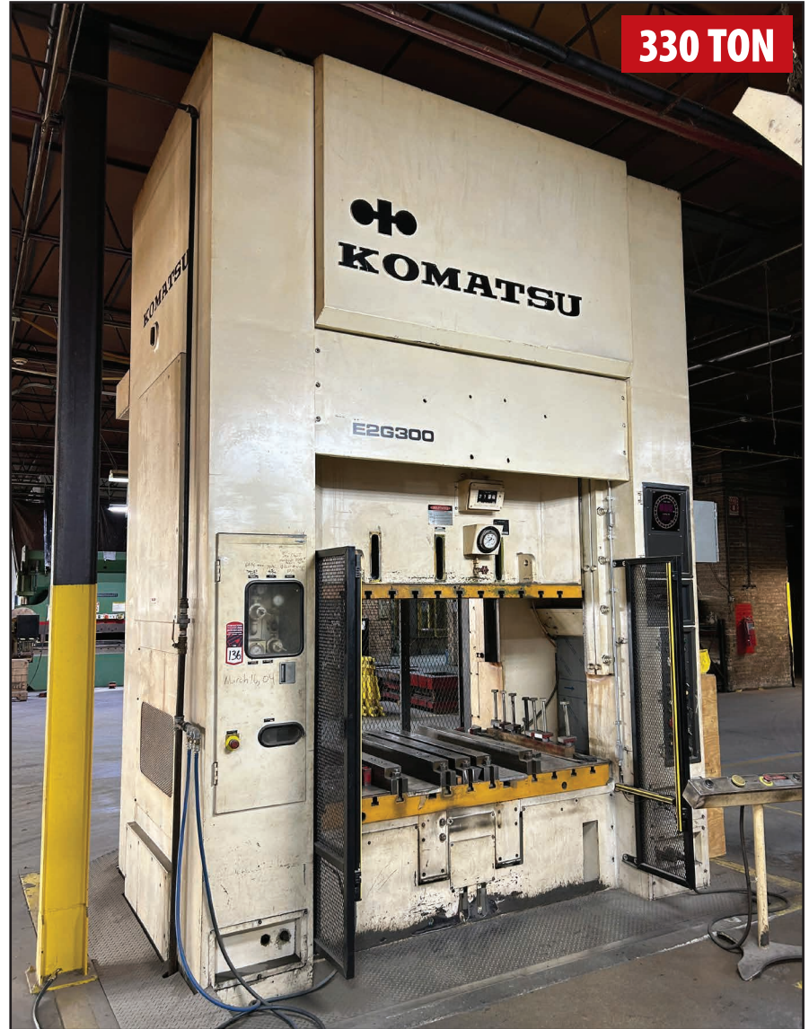
KOMATSU E2G300 STRAIGHT SIDE PRESS

FEATURING: KOMATSU E2G300 Straight Side Press, HPM 800 SL2 Hydraulic Press, HPM 800 SL Hydraulic Press, BLISS S2-300-72-48 Straight Side Press, OBI & Gap-Frame Presses, (2) CINCINNATI 175 CB x 10' Press Brakes, (3) WYSONG 1412 Shears, ROWE Cut-To-Length Line, 2008 AMADA Lasmac LC2 415A4NT Laser, 2014 PANASONIC Robotic Welding Cell, MILLER Maxstar TIG Welders, 2010 RANSOHOFF Pass Through Washer, Vertical & Horizontal Spindle Polishers, HYSTER Fork Lifts, Plant Support Equipment & More