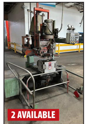
HI-LITE V28M3 POLISHING MACHINE