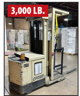
CROWN SP ELECTRIC ORDER PICKER FORKLIFT