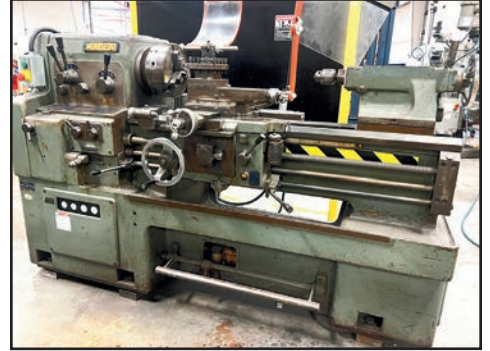
MORI SEIKI MS 850 ENGINE LATHE