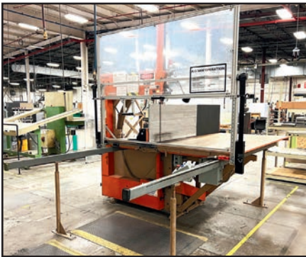
EDGE-SWEETS A-1 FOAM SAW

PRE-AUCTION OFFERS INVITED ON MAJOR ASSETS