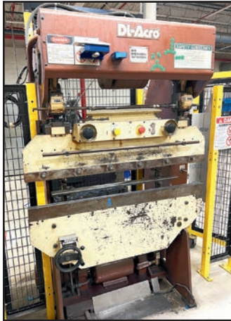
DI-ACRO 14-48-2 PRESS BRAKE