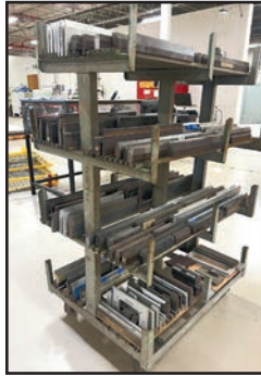
PRESS BRAKE TOOLING