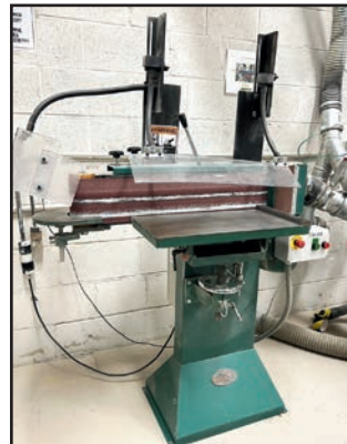
GRIZZLY G1140 6" X 80" EDGE SANDER