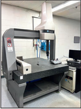
IMS IMPACT CMM