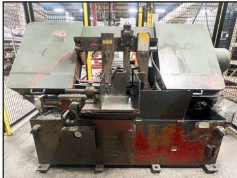
MARVEL SPARTAN HORIZONTAL BANDSAW