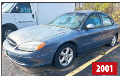
2001 FORD TAURUS SES SEDAN