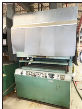
GIBSON II VACUUM FORMER