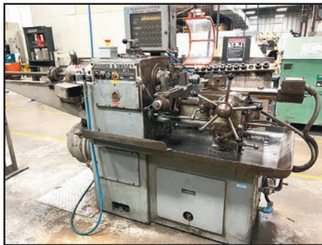
WARNER & SWASEY NO. 1 ELECTRO-CYCLE TURRET LATHE

ALSO: MILWAUKEE H HORIZONTAL MILL, s/n 454412; GRIZZLY G1140 6" X 80" EDGE SANDER; 2021 SHOP FOX W1831 OSCILLATING SPINDLE SANDER; MARATHON 12" COLD SAW; SCOTCHMAN/ BEWO 315.LT 12" COLD SAW, s/n 38034360; MARVEL SPARTAN HORIZONTAL BANDSAW; JET HVBS-7MW HORIZONTAL BANDSAW, s/n NA; DOALL ML VERTICAL BANDSAW, s/n 5116217; ENCO 450 VERTICAL BANDSAW, s/n 945064; DELTA 28-303 VERTICAL BANDSAW, s/n 94A99005; POWERMATIC PM3000 TABLE SAW, s/n 7113000082; HARIG SUPER 612 SURFACE GRINDER, s/n 10310; PRECISION TFY-618 SURFACE GRINDER, s/n 227; DRILL PRESSES, ARBOR PRESSES, SHOP PRESSES, BELT/DISC SANDERS; DOUBLE END GRINDERS, ETC.