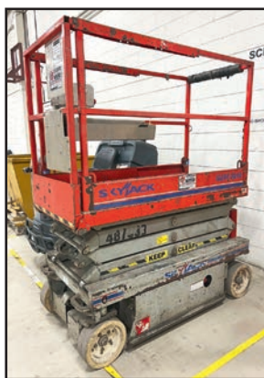
SKYJACK SJIII-3219 SCISSOR LIFT