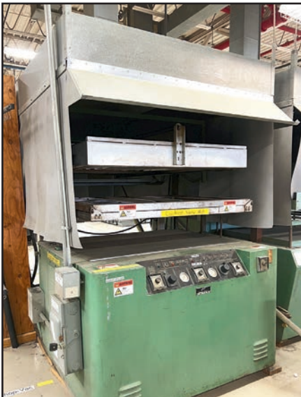
COMET METEOR VACUUM FORMER