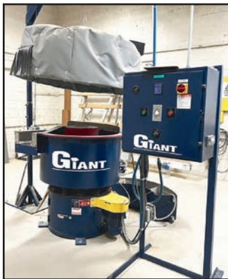
GIANT GB-3 VIBRATORY FINISHER