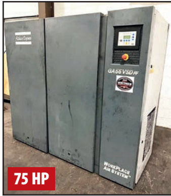
75 HP ATLAS COPCO GA55VSD 75 HP AIR COMPRESSOR