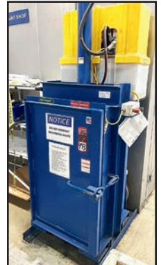
VESTIL HDC-900-IDC DRUM COMPACTOR

SALE DATE Thursday, December 7 at 10:00 AM CT