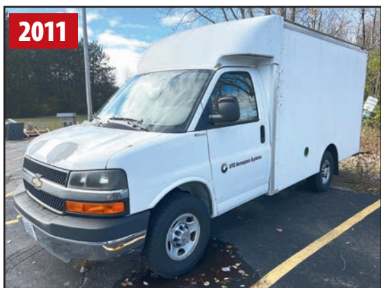
2011 CHEVY G33503 BOX TRUCK

SALE DATE Thursday, December 7 at 10:00 AM CT