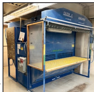
FILTER 1 DUAL SIDED DOWNDRAFT TABLE SYSTEM