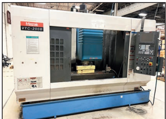
MAZAK VTC-200B VMC

PRE-AUCTION OFFERS INVITED ON MAJOR ASSETS