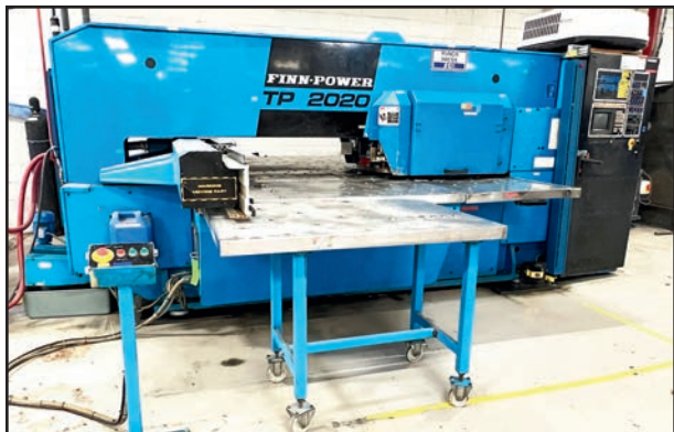
FINN-POWER TP2020 TURRET PUNCH