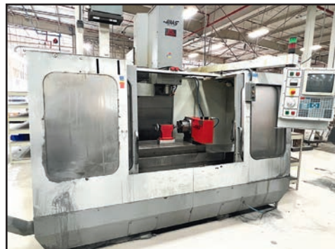
HAAS VF-3 VMC