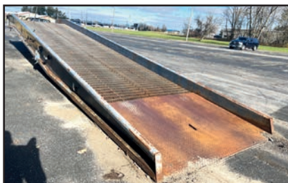
BLUFF 16SYS8436L PORTABLE DOCK RAMP