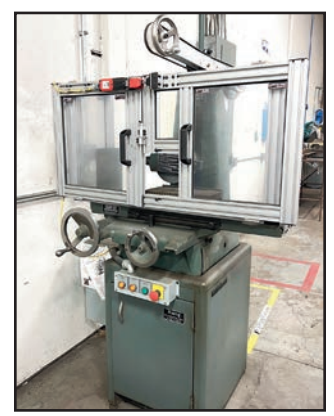
HARIG SUPER 612 SURFACE GRINDER