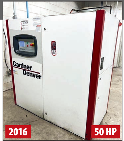
2016 50 HP GARDNER DENVER LRS30-45B 50 HP AIR COMPRESSOR