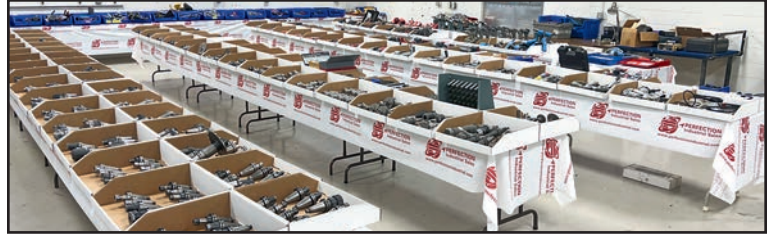
HUGE QTY. OF TOOLING