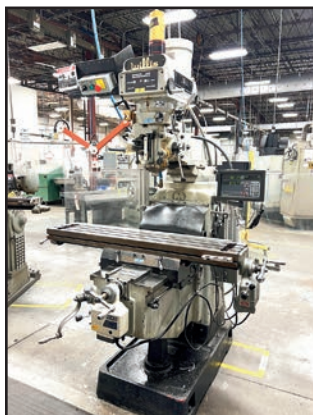
WILLIS 3 HP VERTICAL MILL