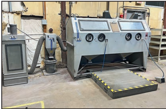
SKAT BLAST DUAL STATION SHOT BLAST STATION

ALSO: DONALDSON TORIT SDF-4 COLLECTION SYSTEM, s/n IG512821-001; (2) DONALDSON TORIT TRUNKLINE 2000 COLLECTION SYSTEMS, s/n IG424798-1 and IG575708-2; (2) AIRKING M-30 FUME COLLECTORS, s/n 2226 and 22; (2) INDUSTRIAL MAID AIR COLLECTION SYSTEMS; 2018 PROVENT UNI-WASH DDB50 DOWNDRAFT TABLE, s/n 108388B; FILTER 1 DUAL SIDED DOWNDRAFT TABLE SYSTEM, s/n NA; (2) DONALSON TORIT AT3000 DOWNDRAFT TABLE, s/n IG73647-001 and IG678647-001; (2) GRIEVE 343 OVENS, s/n NA, 350 Degrees F Max. Temp, 6.6 kW Heat Input, 48"D x 34"W x 39"H Chamber; PVI THERMODYNE Oven, 108"D x 52"W x 72"H