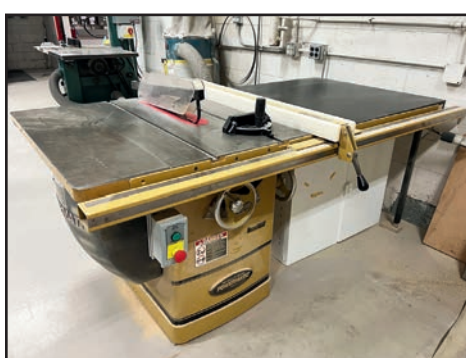
POWERMATIC PM3000 TABLE SAW

PRE-AUCTION OFFERS INVITED ON MAJOR ASSETS