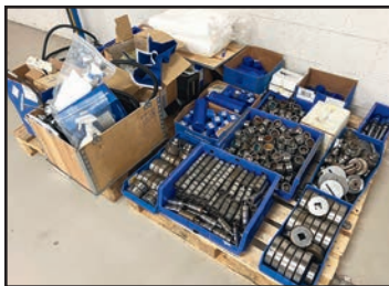
TURRET PUNCH TOOLING

2006 MURATEC MW400 DUAL SPINDLE TURNING CENTER W/ GANTRY LOADER , s/n 05KX272740001, Muratec-Fanuc CNC Control, Dual 15" 3-Jaw Chuck, Dual 8-Position Turrets, 3,500 RPM, 40 HP, (Located in Appleton, WI)