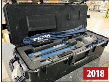
FARO 2100 PORTABLE CMM ARM