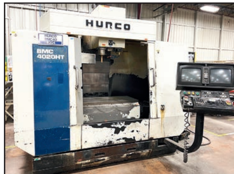
HURCO BMC 4020HT/M VMC