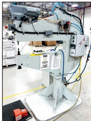
TOWNEND AEROSPACE TOOL TA-450EA-CR36-FHIPAS COMPRESSION RIVETER