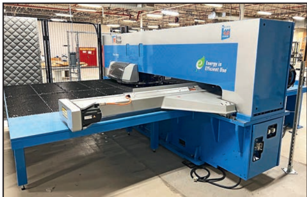
PRIMA POWER PS1225-REAR VIEW