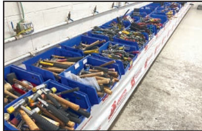
POWER AND HAND TOOLS