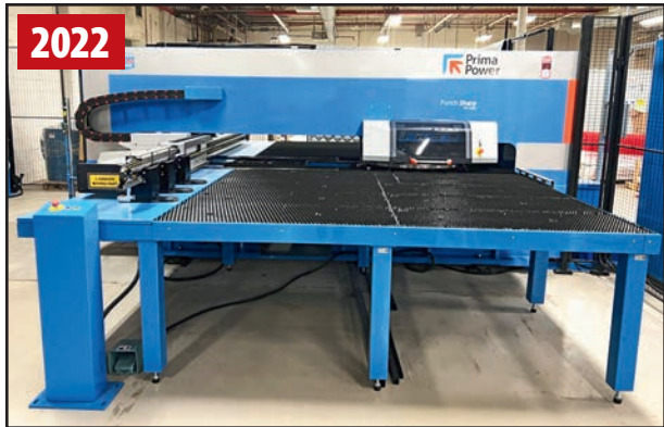
PRIMA POWER PUNCH SHARP PS1225 TURRET PUNCH