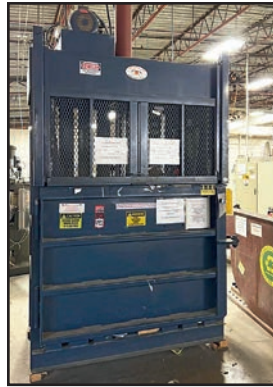
JV MANUFACTURING CRAM-A-LOT DBR-60-LU BALER