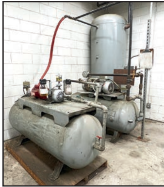
GAST 2565-V21 VACUUM PUMP SYSTEM