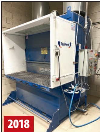
PROVENT UNI-WASH DDB50 DOWNDRAFT TABLE