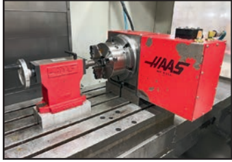
HAAS 4TH AXIS ROTARY TABLE