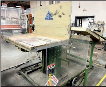
ALBRECHT BAUMER KG HFS II PROFILE SAW