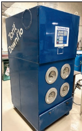
DONALDSON TORIT DUST COLLECTOR