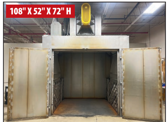
PVI THERMODYNE OVEN