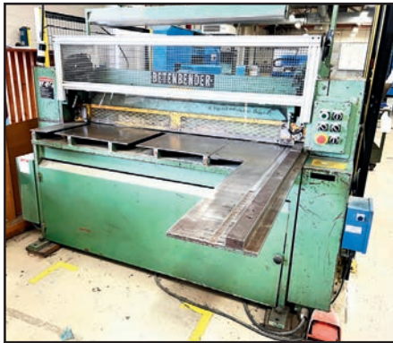
BETENBENDER 5' X 10GA HYDRAULIC SHEAR

DI-ACRO 14-48-2 PRESS BRAKE, s/n 6821283935, 48" OA, 36" Between Housings