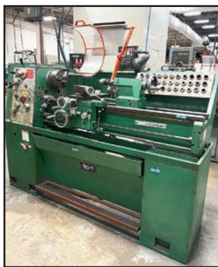
GRIZZLY G5960 GEAR HEAD LATHE