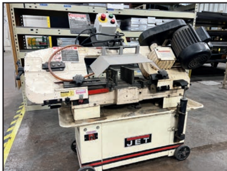
JET HVBS-7MW HORIZONTAL BANDSAW