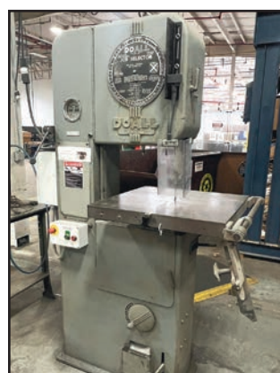
DOALL ML VERTICAL BANDSAW