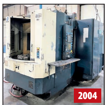
MAKINO A51 4-AXIS HMC