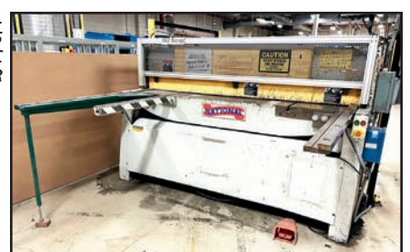
NATIONAL NH7225 HYDRAULIC SHEAR