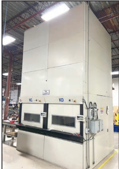
KARDEX VERTICAL STORAGE RETRIEVAL SYSTEM

BLUFF 16SYS8436L PORTABLE DOCK RAMP, s/n 206251, 16,000 Lb Capacity