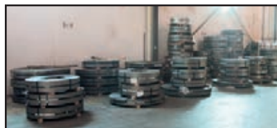
VIEW OF COIL STEEL