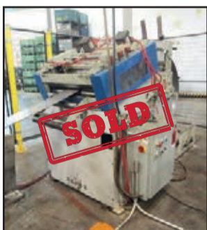
MECON CCS100 COIL CRADLE/STRAIGHTENER