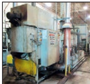
2002 ALMCO/PINTURA FINISHING 30-WRD-G PARTS WASHER/DRYER