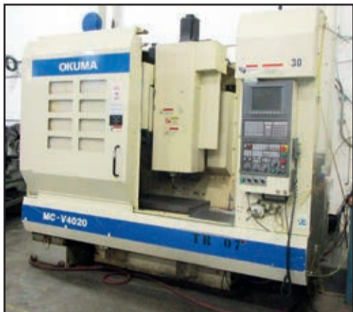
OKUMA MC-V4020 VMC