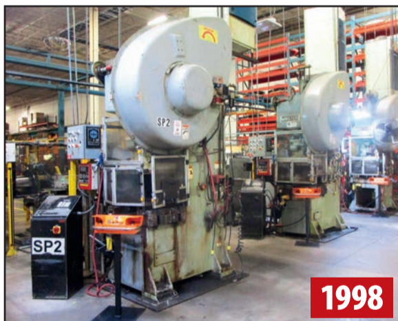
(3 OF 4) 1998 MINSTER #6SS 60-TON OBG PRESSES