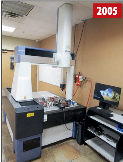
MITUTOYO CRYSTA APEX C7106 CMM