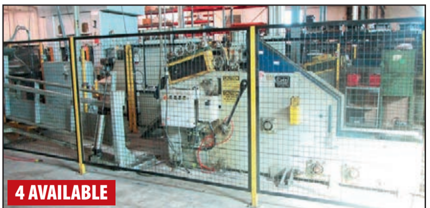
COLT CSHC-100-12 COIL CRADLE/STRAIGHTENER