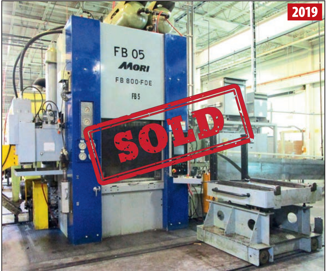
MORI FB-800-FDE BH 815-TON FINE BLANKER

COMPLETE CATALOG & INFORMATION AVAILABLE: https://perfection.global/util