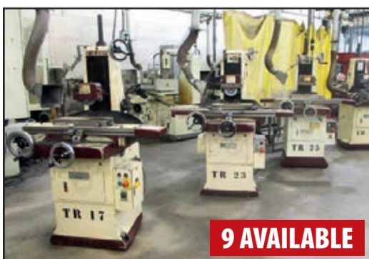
VIEW OF CHEVALIER FSG-618M GRINDERS

CHEVALIER FSG-3A1224 HYDRAULIC SURFACE GRINDER, s/n FP3174802, w/ 24" x 12" Electro-Mag. Chuck, Coolant Filter