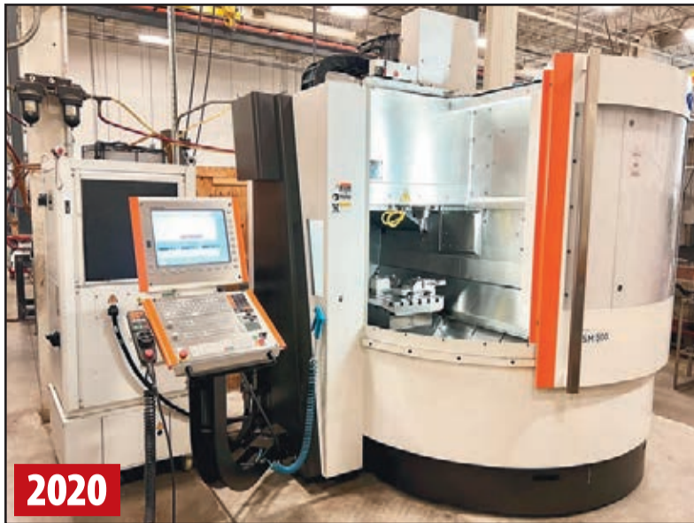
2020 MIKRON HSM 500 HI-SPEED GRAPHITE VMC