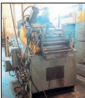
MECON CCS-0695 COIL CRADLE/STRAIGHTENER