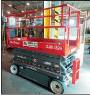
SKYJACK SJ III 4626 SCISSOR LIFT