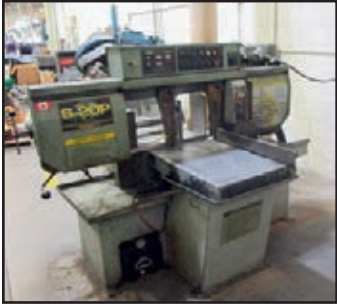
HYD-MECH S-20P HORIZONTAL BANDSAW