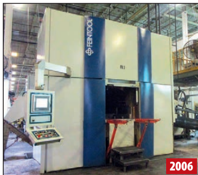
FEINTOOL HFA-8800 PLUS 880-TON FINE BLANKER