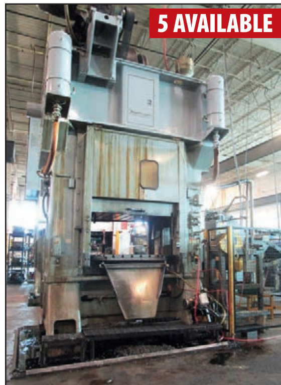
1993 BROWN BOGGS SS2-600-84-48 600-TON SSDC PRESS