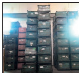
VIEW OF PART TUBS/BINS