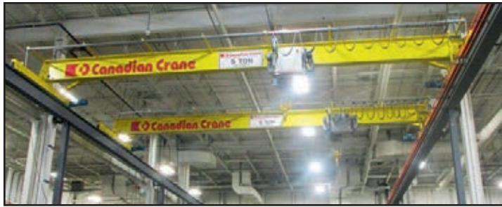
CANADIAN CRANE FREE STANDING OVERHEAD BRIDGE CRANE SYSTEM