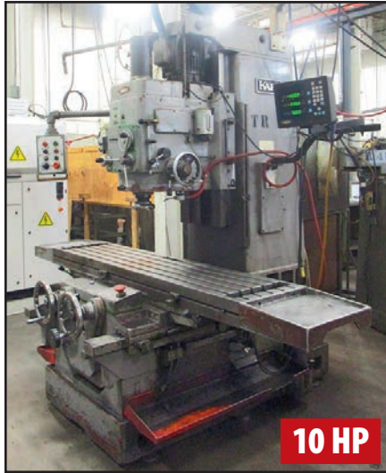
KAFO VERTICAL HD TOOLMAKERS MILL