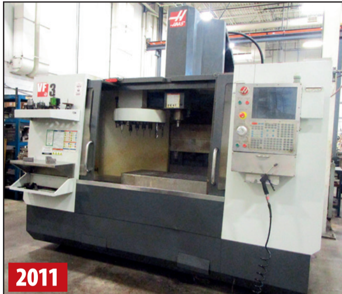
2011 HAAS VF-3 VMC