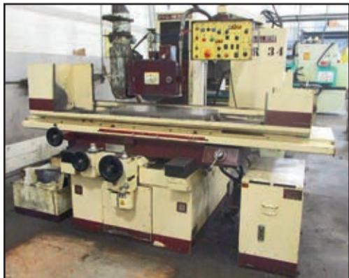
CHEVALIER FSG-1632AD HYDRAULIC SURFACE GRINDER