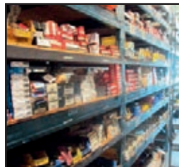
VIEW OF BEARINGS