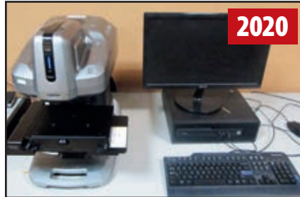
KEYENCE VR-3200 3D MEASURING MACROSCOPE