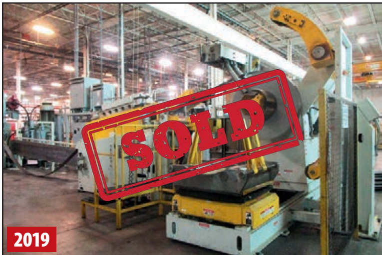
COE CPPS-507-24 COIL FEED LINE