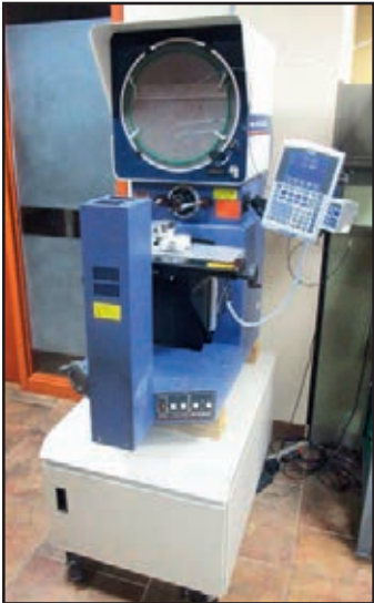
MITUTOYO PH-3500 OPTICAL COMPARATOR