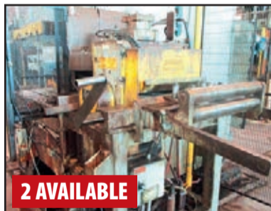
COLT CERF-40-12 SERVO FEEDERS