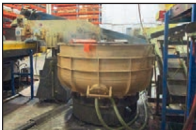
ROSLER R 1050 ROTARY VIBRATORY DEBURRERS AND BUTTERING SHUTE

COMPLETE CATALOG & INFORMATION AVAILABLE: https://perfection.global/util