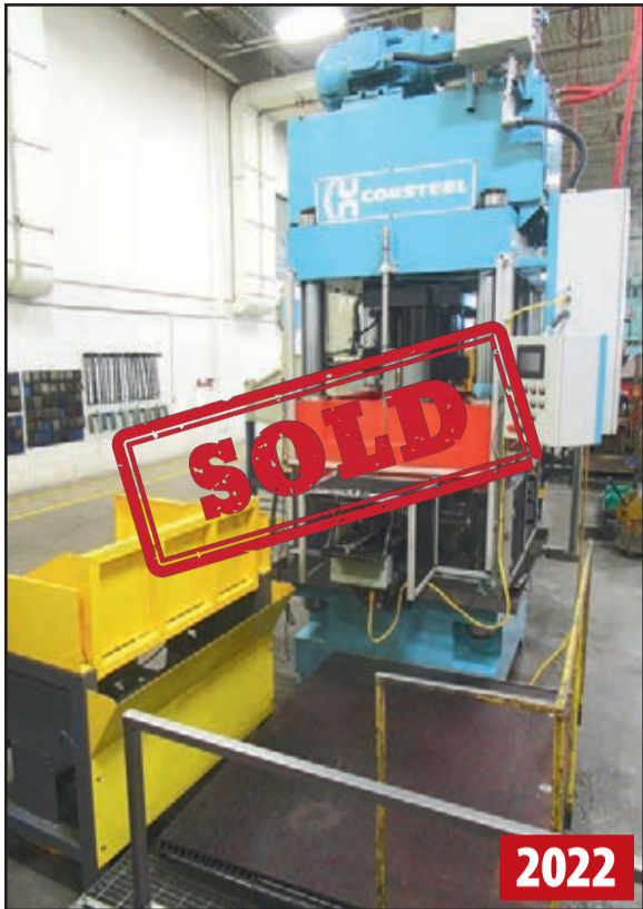
CORSTEEL 4P.3640.6 250-TON 4-POST HYDRAULIC PRESS