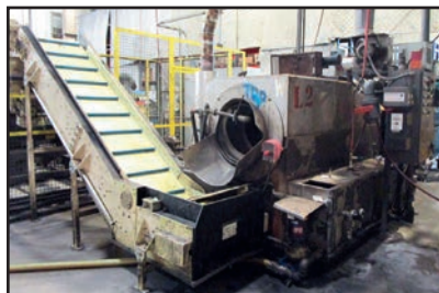
HURRICANE SYSTEMS 250 WASHER/DRY-OFF