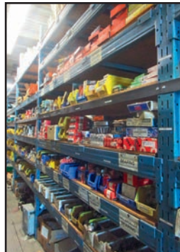
VIEW OF BEARINGS