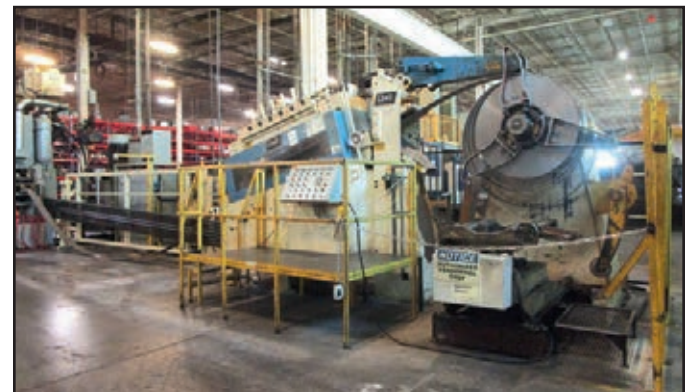
2006 COLT CPTH-18 COIL FEED LINE