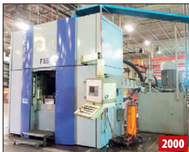
FEINTOOL HFA-6300 WF 642-TON FINE BLANKER