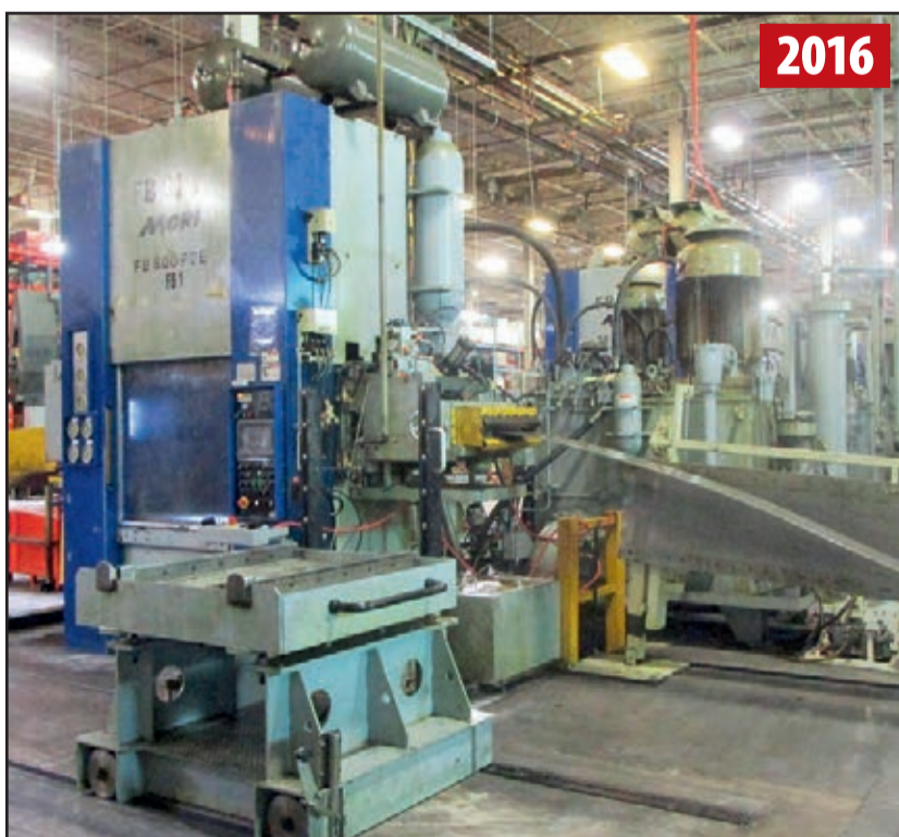
MORI FB-800-FDE BH 815-TON FINE BLANKER