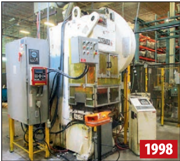
MINSTER #6SS 60-TON OBG PRESSES