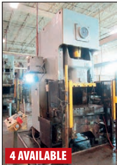
AIDA NC1-200(1) 220-TON OBG PRESSES