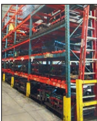
VIEW OF DIES