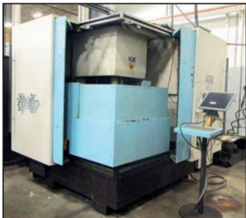
AGIE AGIECUT EVOLUTION 2 WIRE EDM