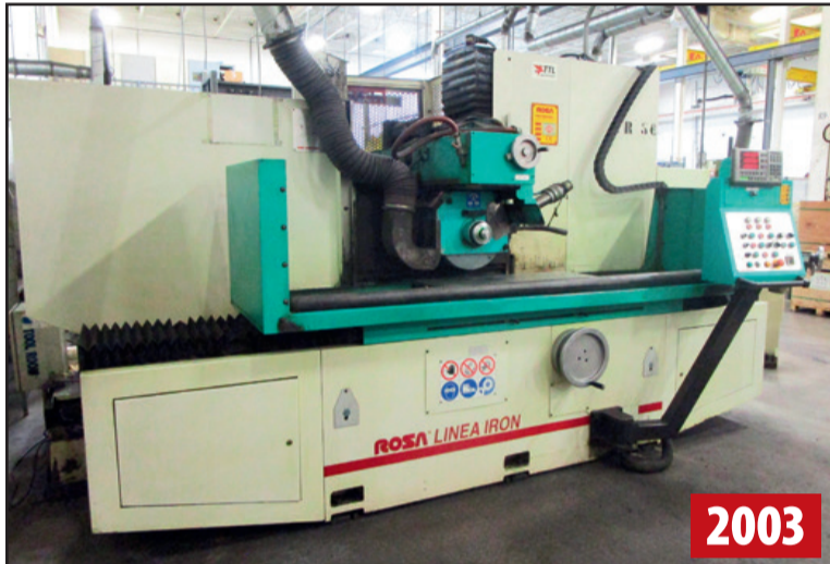
2003 ROSA LINEA IRON 10.6 HYDRAULIC SURFACE GRINDER