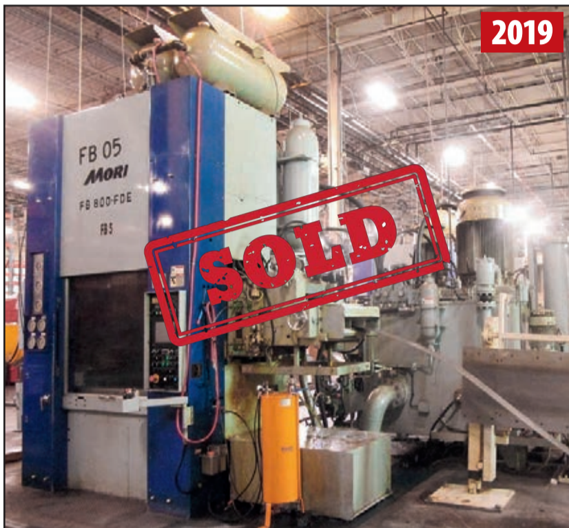
MORI FB-800-FDE BH 815-TON FINE BLANKER

1995 MORI FB-650-FD 650-TON FINE BLANKING PRESS , s/n 1295, w/ 12" Servo Feeder, 650-Ton Main, 320-Ton V-Ring, 60-Ton Strip, 30-Ton Knock Out, 11.02" Shut Height, 1.18" x 3.94" Stk., 41.34" x 39.37" Bed, Part Tumbler/Descrambler, Mag. Incline Discharge Conveyor, Touch Screen Control (FB7)