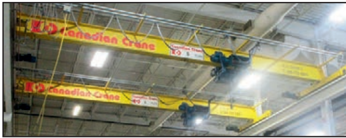
(2) CANADIAN CRANE 5-TON X 36' (EST) OVERHEAD BRIDGE CRANES