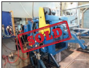
LITTELL 24" X .250" SERVO FEED