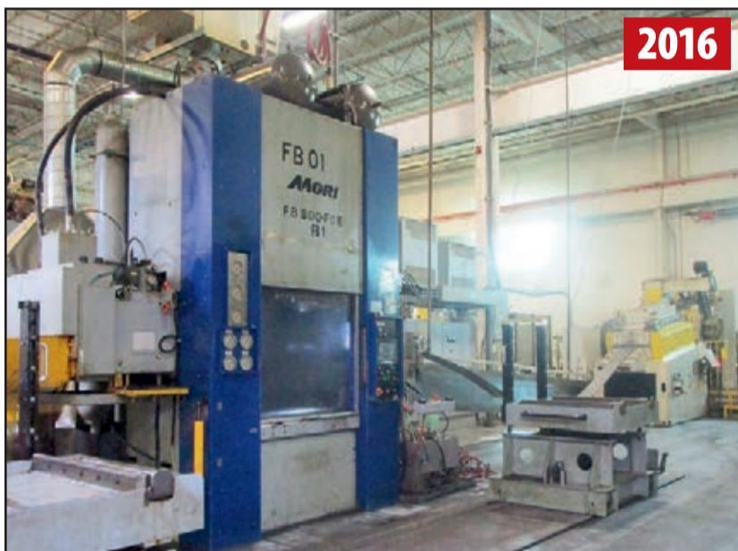
MORI 815-TON FINE BLANKER AND COE FEED LINE