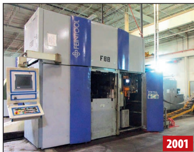
FEINTOOL HFA-7000 PLUS 713-TON FINE BLANKER AND COIL FEED LINE