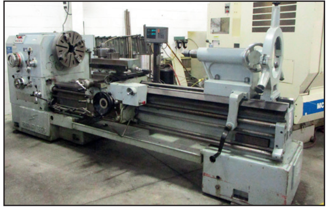
GIANA TG 360X2000 ENGINE LATHE