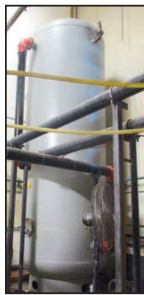
(1 OF 2) AIR RECEIVER TANKS