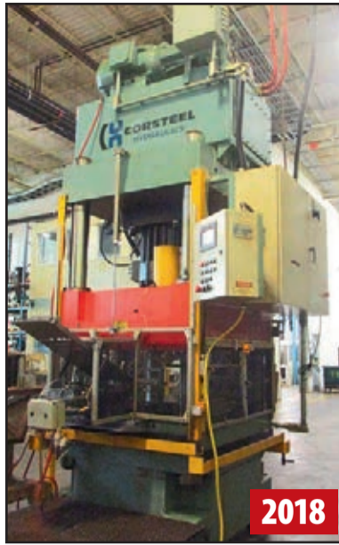
CORSTEEL 4P-3640-6 250-TON 4-POST HYDRAULIC PRESS