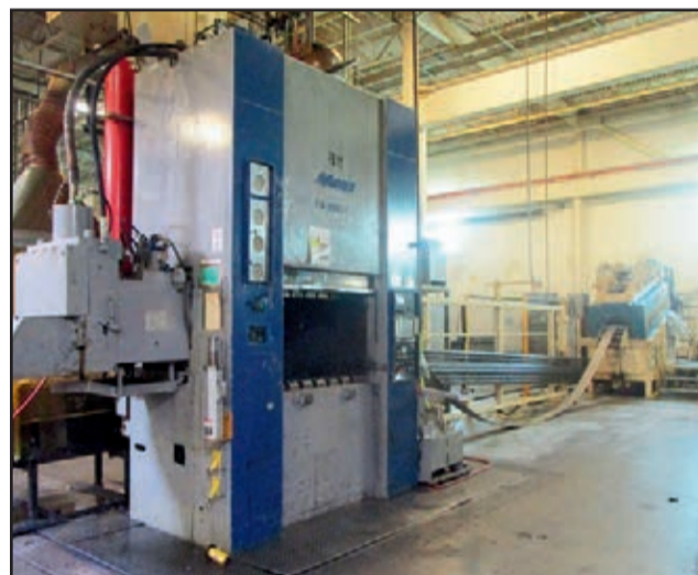
2000 MORI FB800-FD 815-TON FINE BLANKER AND 2006 COLT COIL FEED LINE