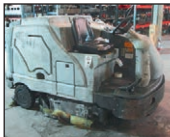
CONDOR ELECTRIC FLOOR SCRUBBER