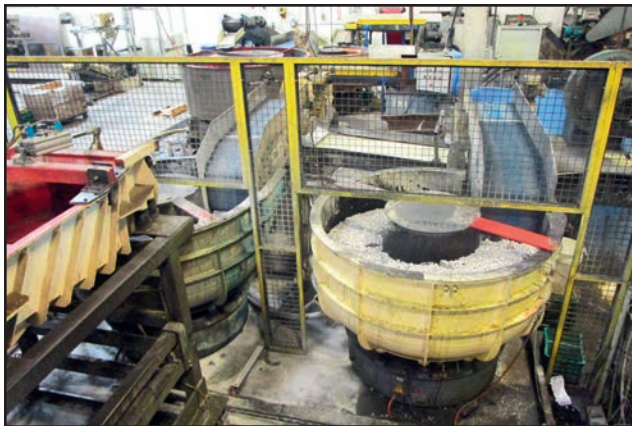
(2) ROSLER R 1050 A ROTARY VIBRATORY DEBURRERS