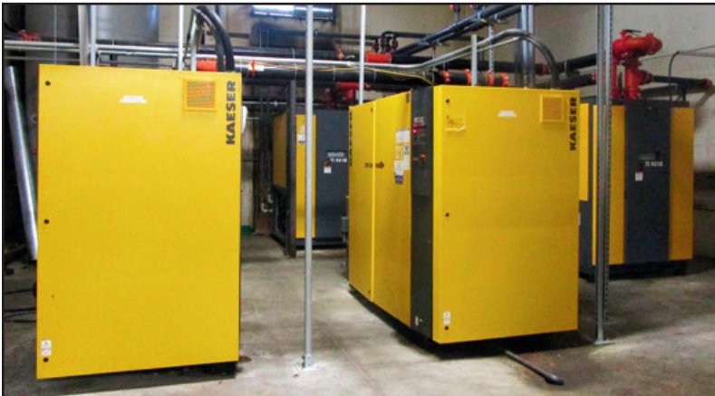
VIEW OF KAESER AIR COMPRESSORS AND DRYERS