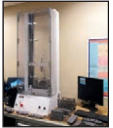
ATM TTS-10KN TENSILE TESTER