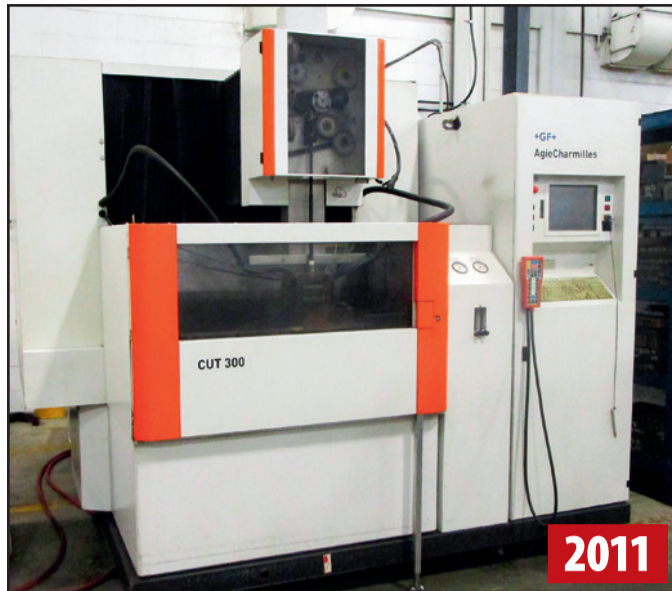
2011 CHARMILLES CUT 300 WIRE EDM