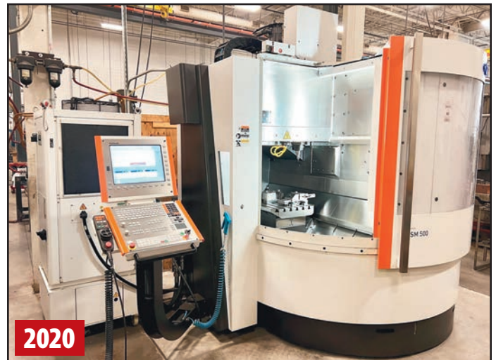
MIKRON HSM 500 HI-SPEED GRAPHITE VMC