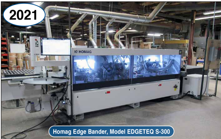
Homag Edge Bander, Model EDGETEQ S-300

ASSET LOCATION: 1000 Morris Street, Fond Du Lac, WI 54935