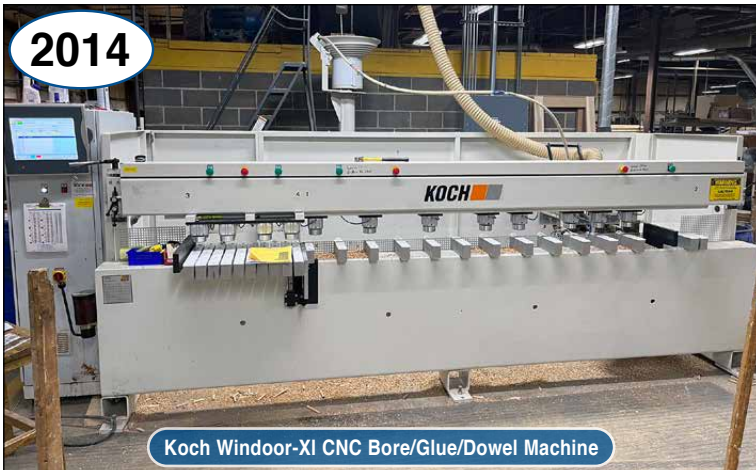
Koch Windoor-XI CNC Bore/Glue/Dowel Machine