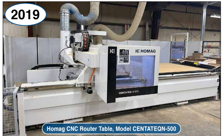
Homag CNC Router Table, Model CENTATEQN-500