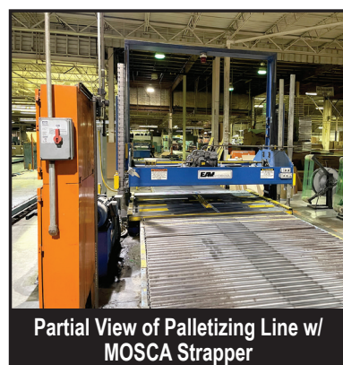
Partial View of Palletizing Line w/ MOSCA Strapper

SUPPLIES: Bulk Starch; Drums of Michelman Coat 40E, AW68-DR & CARTER EP-220-DR Oils; 60" Stretch Film, Rolls of Wire Stitching, Flexo Glue, Tape, Shrink Wrap, MOSCA & PET Strapping, Banding Clips, 400+ New, Plastic & Used Pallets, New & Used Ink