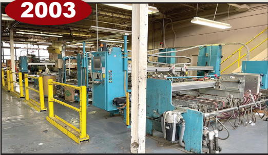
J & L Alliance Machine 150" Flexo Folder Gluer

2 MILLION POUNDS OF UNUSED & BUTT VIRGIN, RECYCLED LINER & MEDIUM ROLLS SUBJECT TO PRIOR SALE