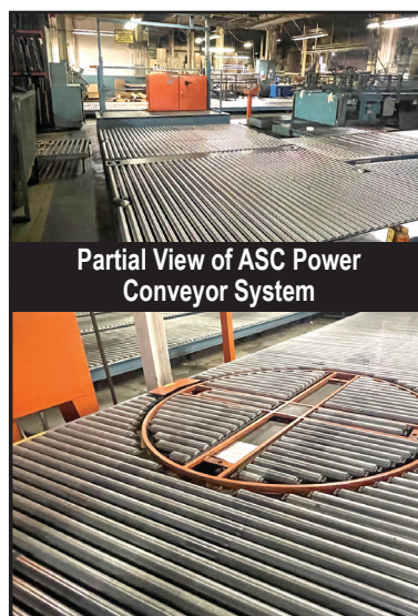
Partial View of ASC Power Conveyor System