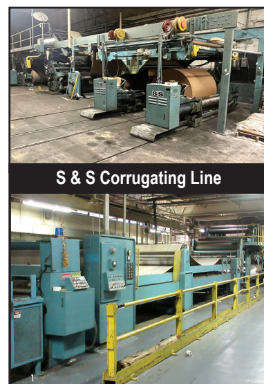
S & S Corrugating Line

TERMS: 18% Buyers Premium plus 6% PA State Sales Tax, unless exempt. Payment via wire transfer, cash, bank check, business check with bank letter of guarantee. ALL REMOVAL MUST BE COMPLETED BY NOVEMBER 22, 2023.