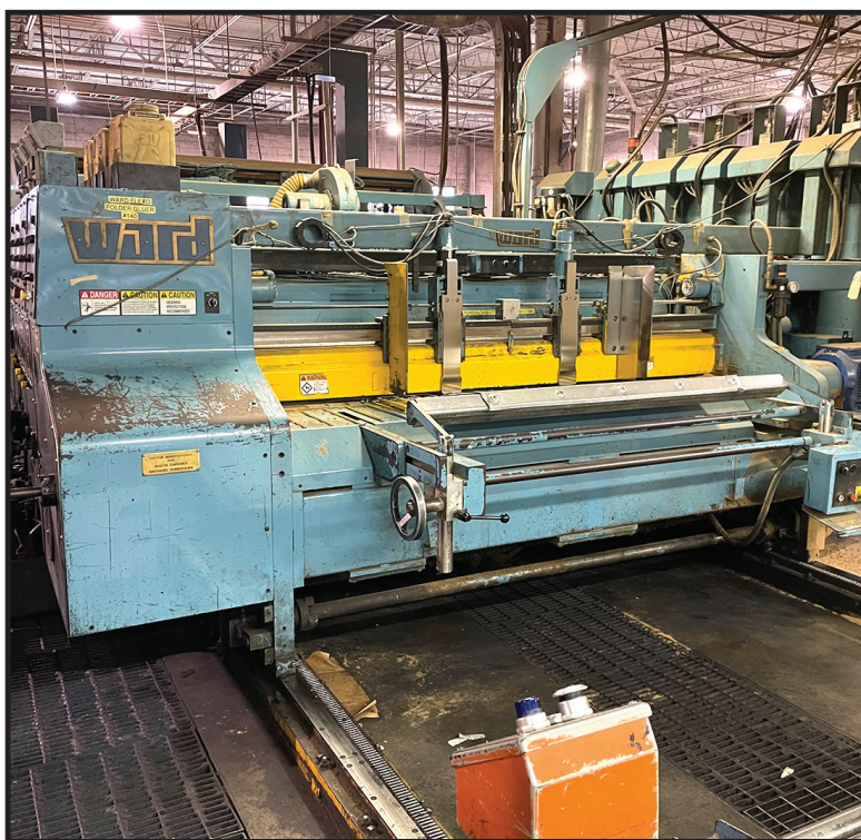
Ward 37-1/2" x 97" 3/Color Flexo Folder Gluer Die Cutter

Inspection: Friday, September 29th, 9:00 am to 3:00 pm