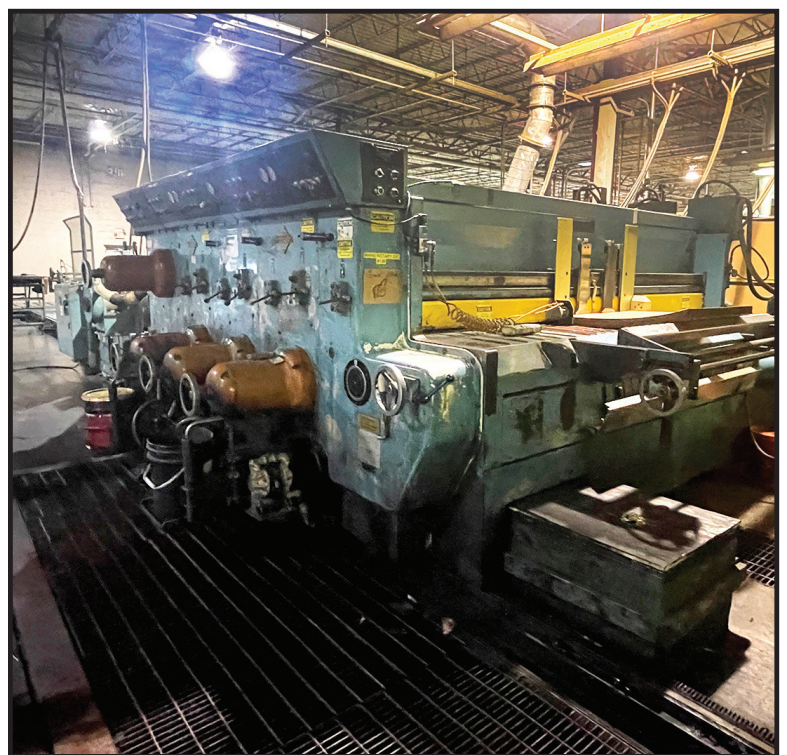
Ward 66" 125" 3/Color Flexo Die Cutter