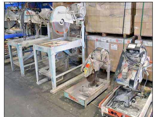
Lots of Target Saws