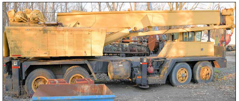
Grove TM275 LP, Low Profile Hydraulic Truck Crane, 30-Ton Capacity Drive Carrier, 141' Maximum Height, 360° Rotation

For Complete Information Please Visit: westbrook-auctions.com