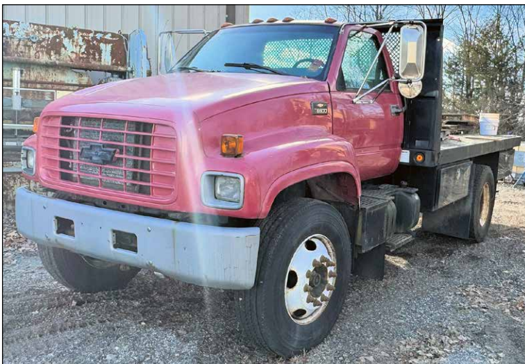
Chevrolet C6500 Flat Bed Truck, 8'x14' Bed, Single Axle, Dual Wheeled, Gasoline Engine, 41,000 Miles, 1999