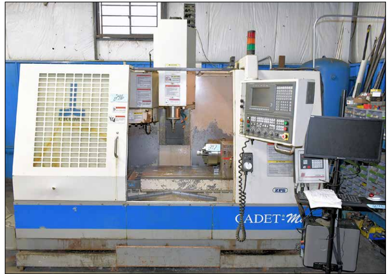
Okuma Cadet-Mate CNC Vertical Machining Center