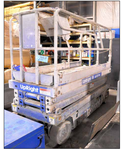
Upright 20N Electric Platform Scissor Lift