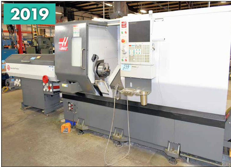
Haas ST30 CNC Turning Center with Haas Bar Feeder

LOTS BEGIN CLOSING ON: Wednesday, December 13th at 10:00am ET INSPECTION: Wednesday, December 6th and Tuesday, December 12th, 9:00am to 4:00pm ET LOCATION: 385 N. Mill Street, South Lyon, MI 48178