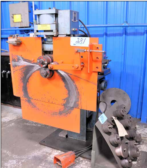
Lockformer Maplewood 520, 12ga Capacity Rotary Combination Machine with Tooling