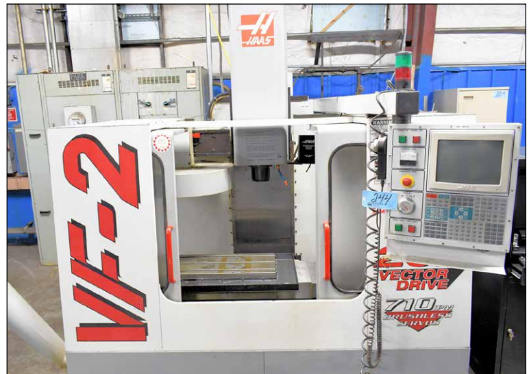
Haas VF-2 CNC Vertical Machining Center