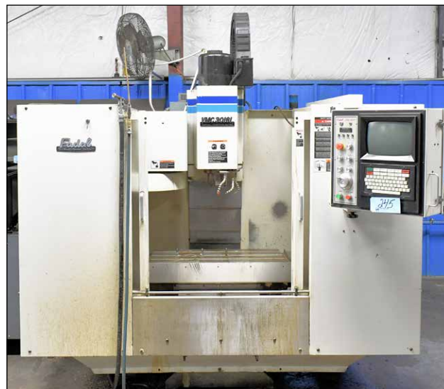
Fadal VMC 3016L CNC Vertical Machining Center