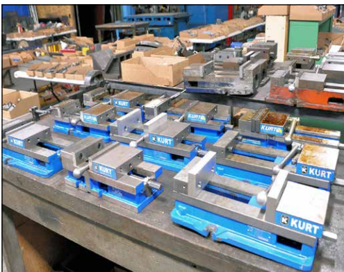
Large Assortment of Work Holding Vises