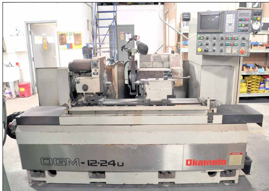
Okamoto OGM-12-24U, Universal ID/OD Cylindrical Grinder