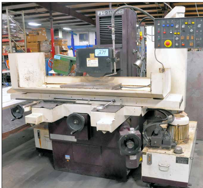
Chevalier FSG-3A1224 H, 12"x24" 3-Axis Auto. Surface Grinder