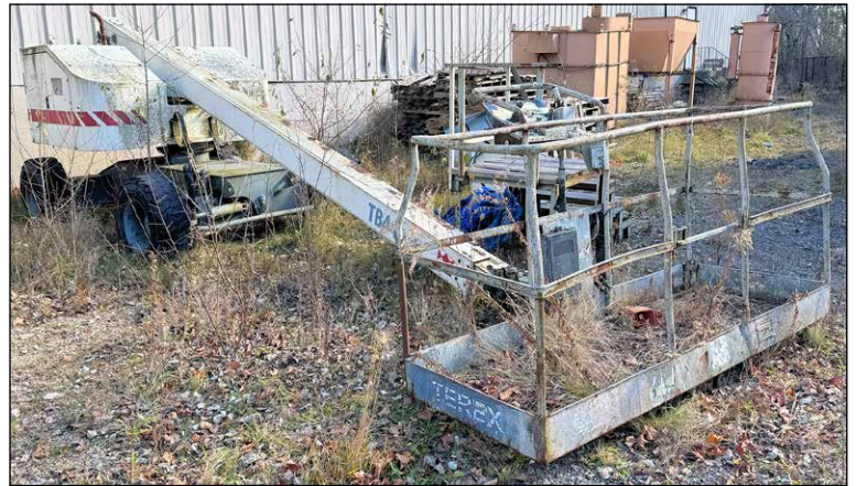
Terex TB44, 44' Dual Fuel (Gasoline or Propane) Powered Self Propelled Jig Boom