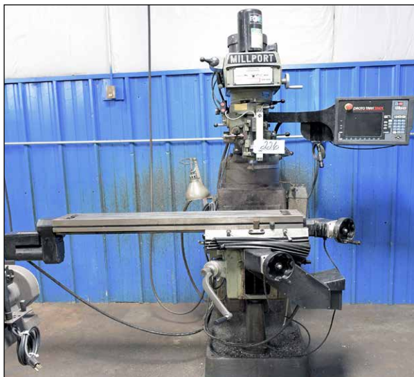
Millport 2-Axis CNC Vertical Milling Machine, with Newer Proto Trak SMX 2-Axis CNC Control