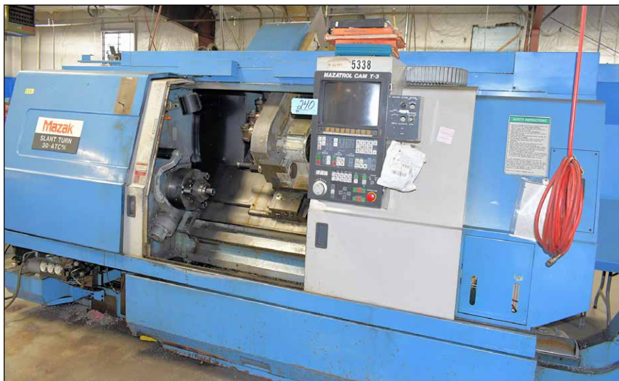
Mazak Slant Turn CNC Turning Center