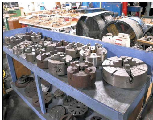
Large Assortment of Tooling & Accessories