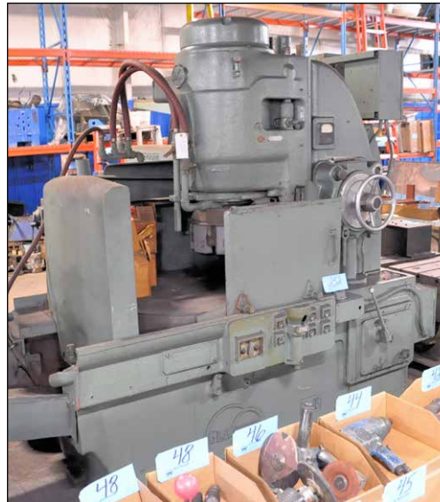
Blanchard No. 18 Rotary Surface Grinder, 36" Diameter, Magnetic Chuck, Grinding Shoe Supplies