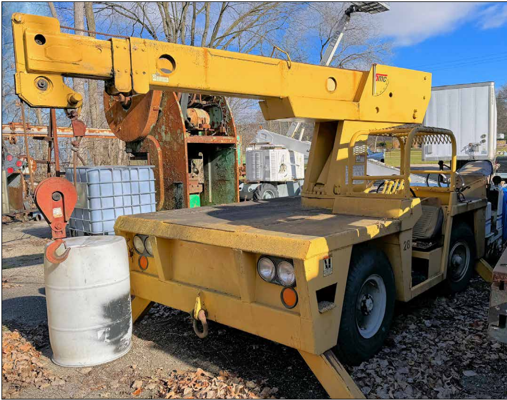
Pettibone 8-Ton Truck Crane, Perkins 4-Cylinder Diesel Engine, (Also Runs Propane)