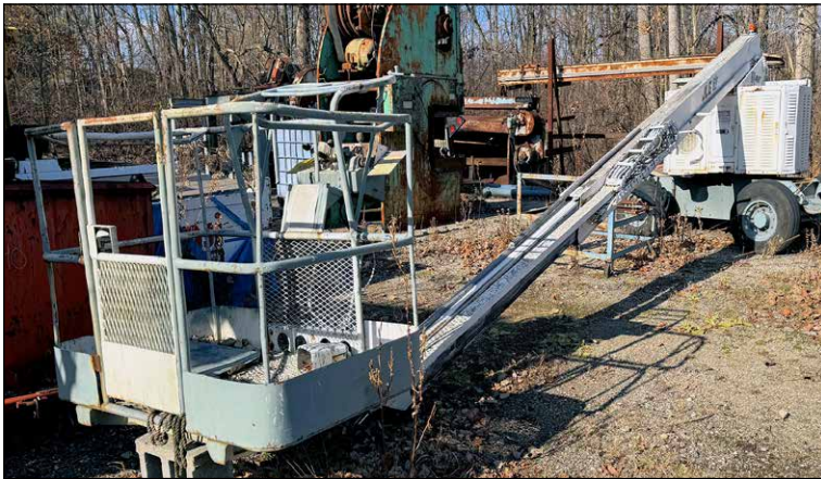
JLG 40HT, 40' Dual Fuel (Gasoline or Propane) Powered Self Propelled Jig Boom