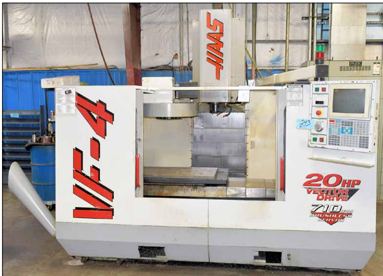
Haas VF-4 CNC Vertical Machining Center