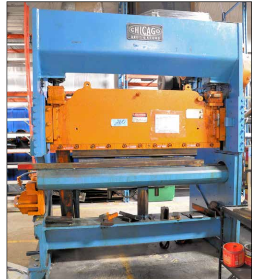
Chicago Dreis & Krump 67-C-SPL, 75-Ton x 68" x 10ga. Swing Gate Press Brake