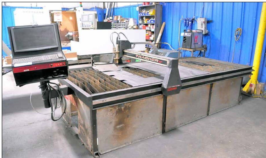
Tracker Pro CNC Plasma Cutting Machine, Tracker CNC Controller, 4'x11' Table, Hyperterm Powermax 105 Power Supply, Chiller, with Stand