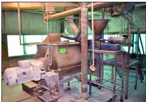
MUNSON X HD2 1/2-5-S316 batch mixer