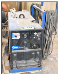
MILLER TRAILBLAZER 302 AC/DC welder/generator