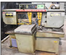
HYD-MECH S-20 SERIES II horizontal saw