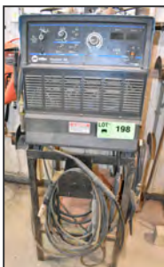
MILLER DIMENSION TIG/ARC/MIG welder