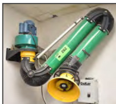
OSKAR flex-arm fume extractor