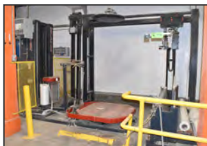
WULFTEC WHPA-300 pallet wrapper