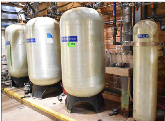
CANATURE water softener tank system

CONTACT 416.962.9600 TO CONSIGN EQUIPMENT AT AN UPCOMING AUCTION