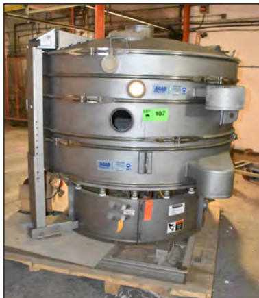
SWECO XS72Y1021066BT0NSDTLHC VIBRO-ENERGY vibratory screen separator