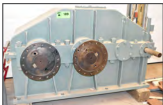
FOOTE-JONES gear box