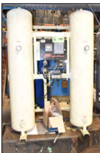
INGERSOLL RAND air dryer