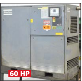
ATLAS COPCO GA 45 rotary screw type air compressor