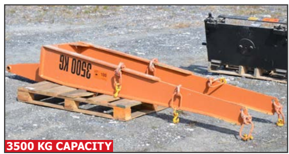
OMAR spreader boom attachment

Inspection is Tuesday, November 7 from 9 AM to 4 PM. All assets must be removed no later than Thursday, November 30 by appointment only.