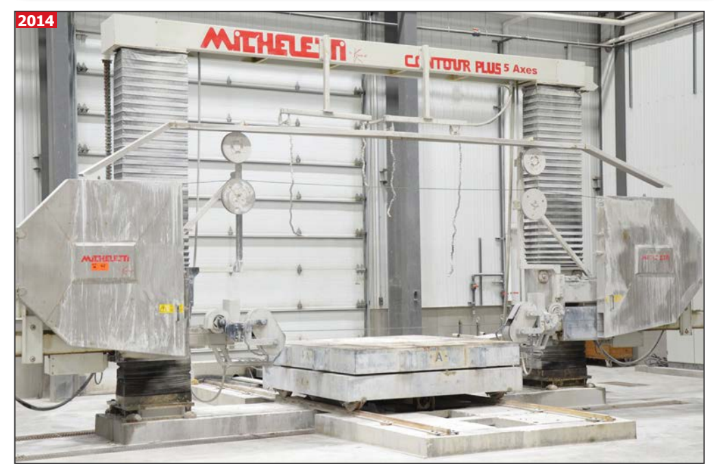
MICHELETTI COUNTOUR PLUS 5AX CNC 5-axis diamond wire profiling saw