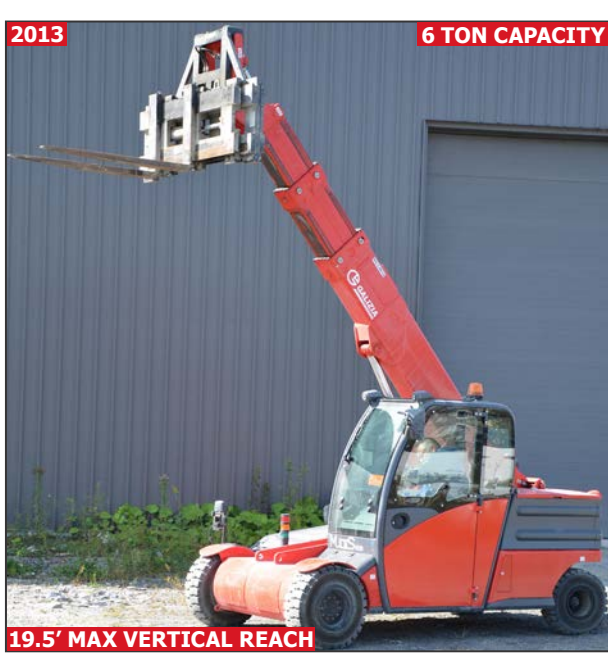
GALIZIA MULTIS 636 electric multifunction telehandler