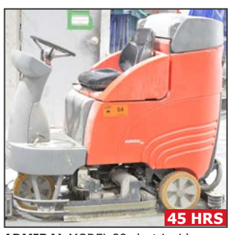
ADMIRAL MODEL 28 electric ride-on type floor scrubber