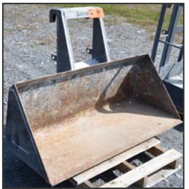
GALIZIA bucket attachment