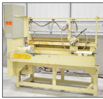
OMAG 88SL semi-automatic conventional polishing lathe