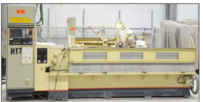
OMAG CN94TE CNC lathe