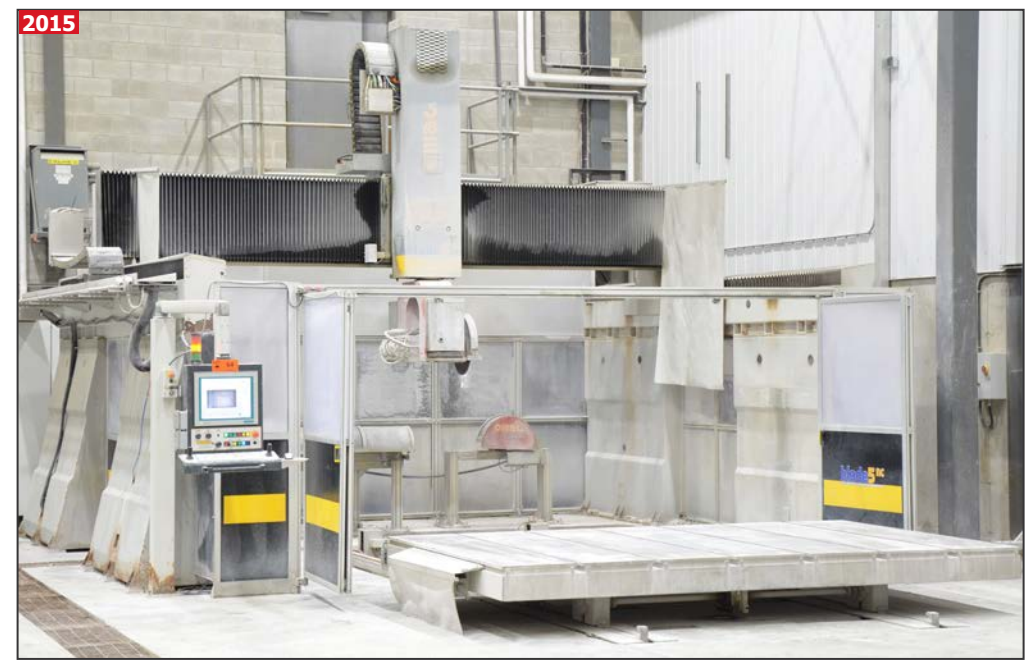
OMAG BLADE5NC 5-axis CNC bridge type vertical machining center