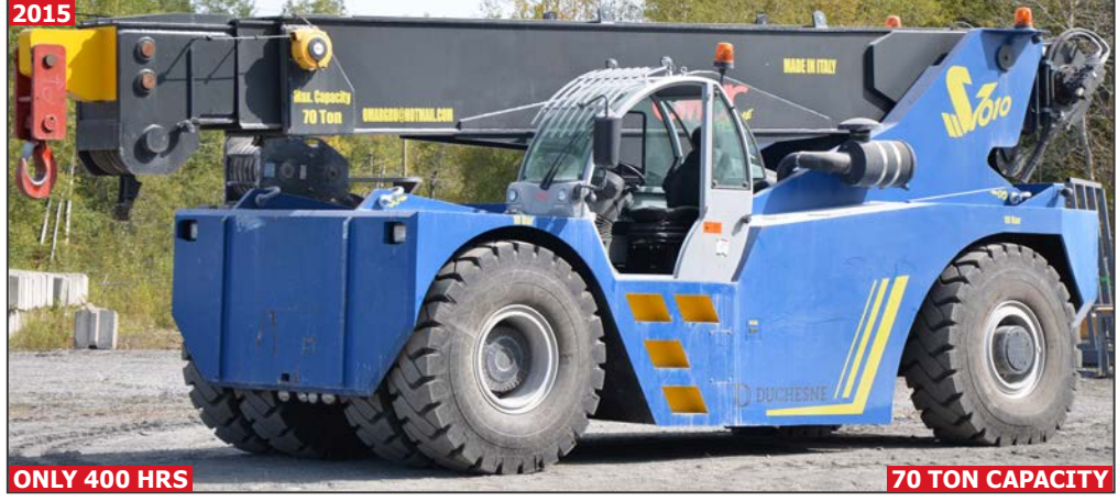
OMAR S7010 pick & carry mobile outdoor diesel crane