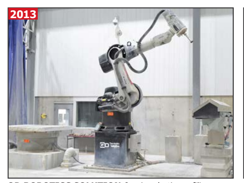
QD ROBOTICS SOLUTION 6-axis robotic profiling machine