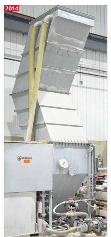
TESIMAS ALD60*120F30*5 compact wastewater treatment system