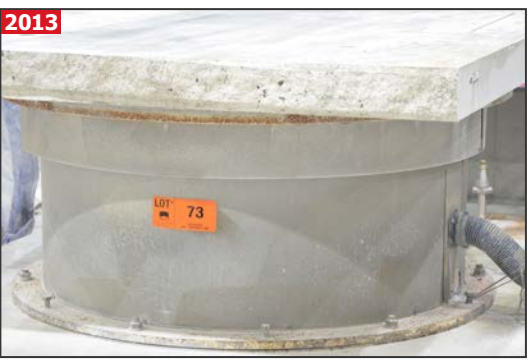
QD ROBOTICS SOLUTION 62" diameter CNC indexing rotary table

PRE-INSPECTIONS AVAILABLE - CALL 416-962-9600 FOR DETAILS!