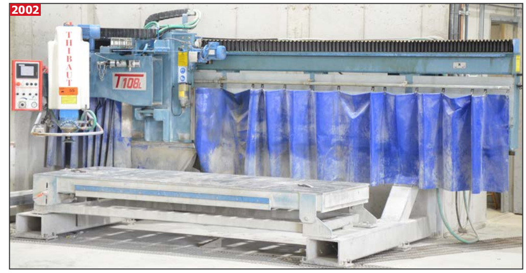
THIBAUT T108L multifunction stone working center