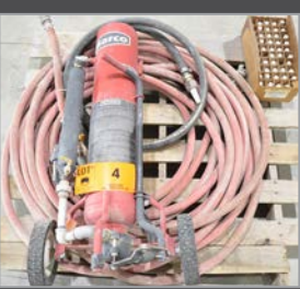
MARCO portable sand blaster