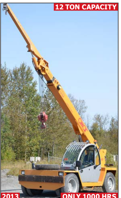
2013 ONLY 1000 HRS OMAR 1210 pick & carry mobile outdoor diesel crane