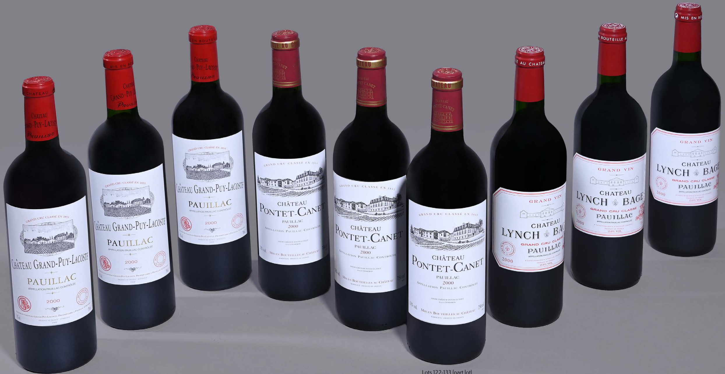
Lots 122-133 (part lot)