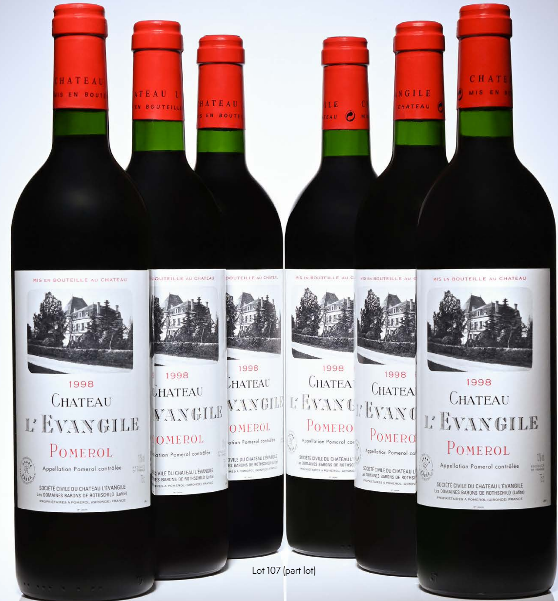
Lot 107 (part lot)