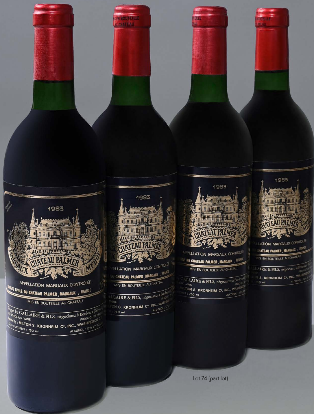
Lot 74 (part lot)

77 1983 Chateau Cheval Blanc Premier Grand Cru Classe A, Saint-Emilion Grand Cru OWC 12x75cl