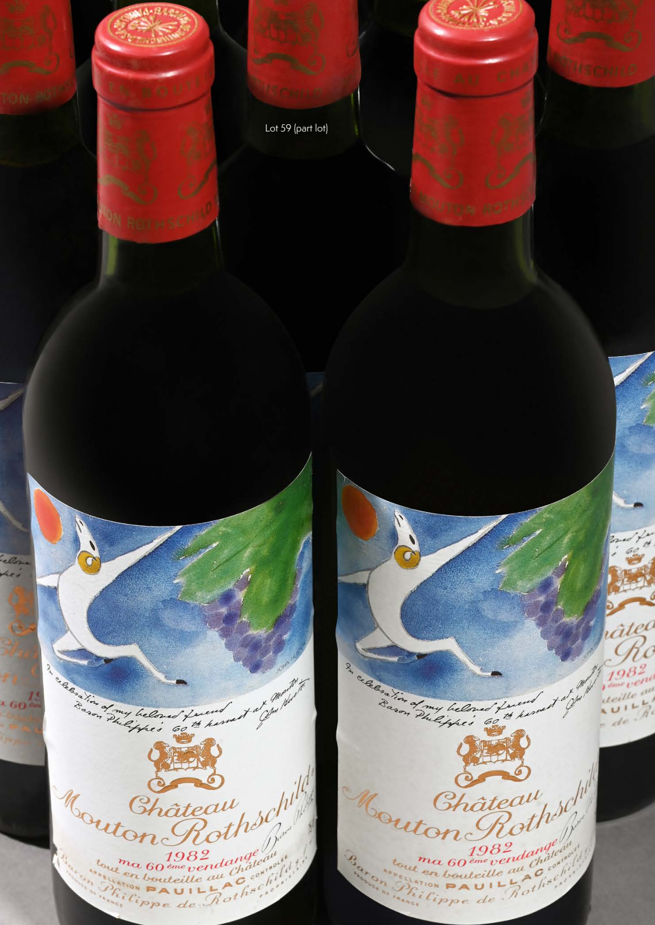
Lot 59 (part lot)