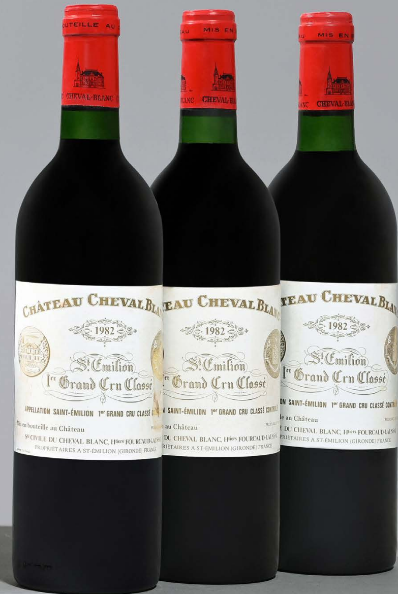
Lot 63 (part lot)