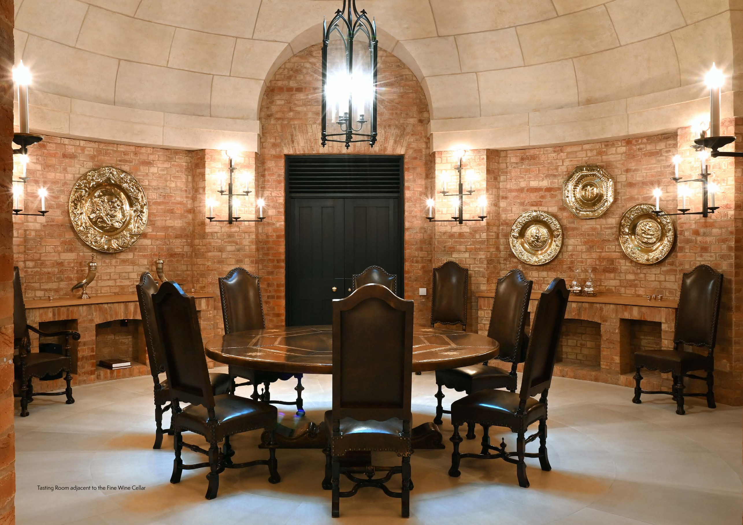
Tasting Room adjacent to the Fine Wine Cellar