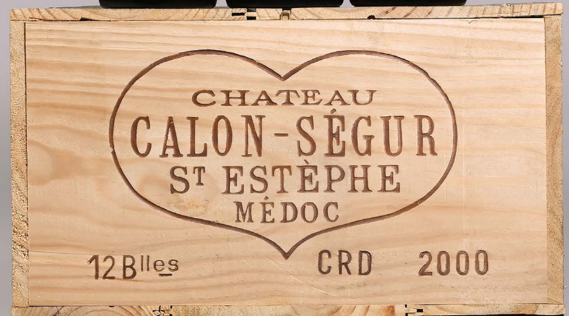
Lot 119 (part lot)