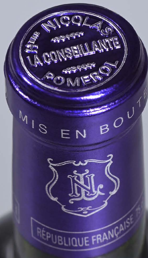
Lots 134-138 (part lot)

134 2001 Chateau La Conseillante, Pomerol OWC 12x75cl