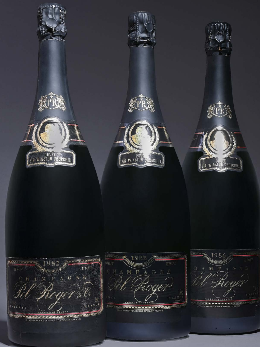
Lots 7, 12 & 13 (part lot)