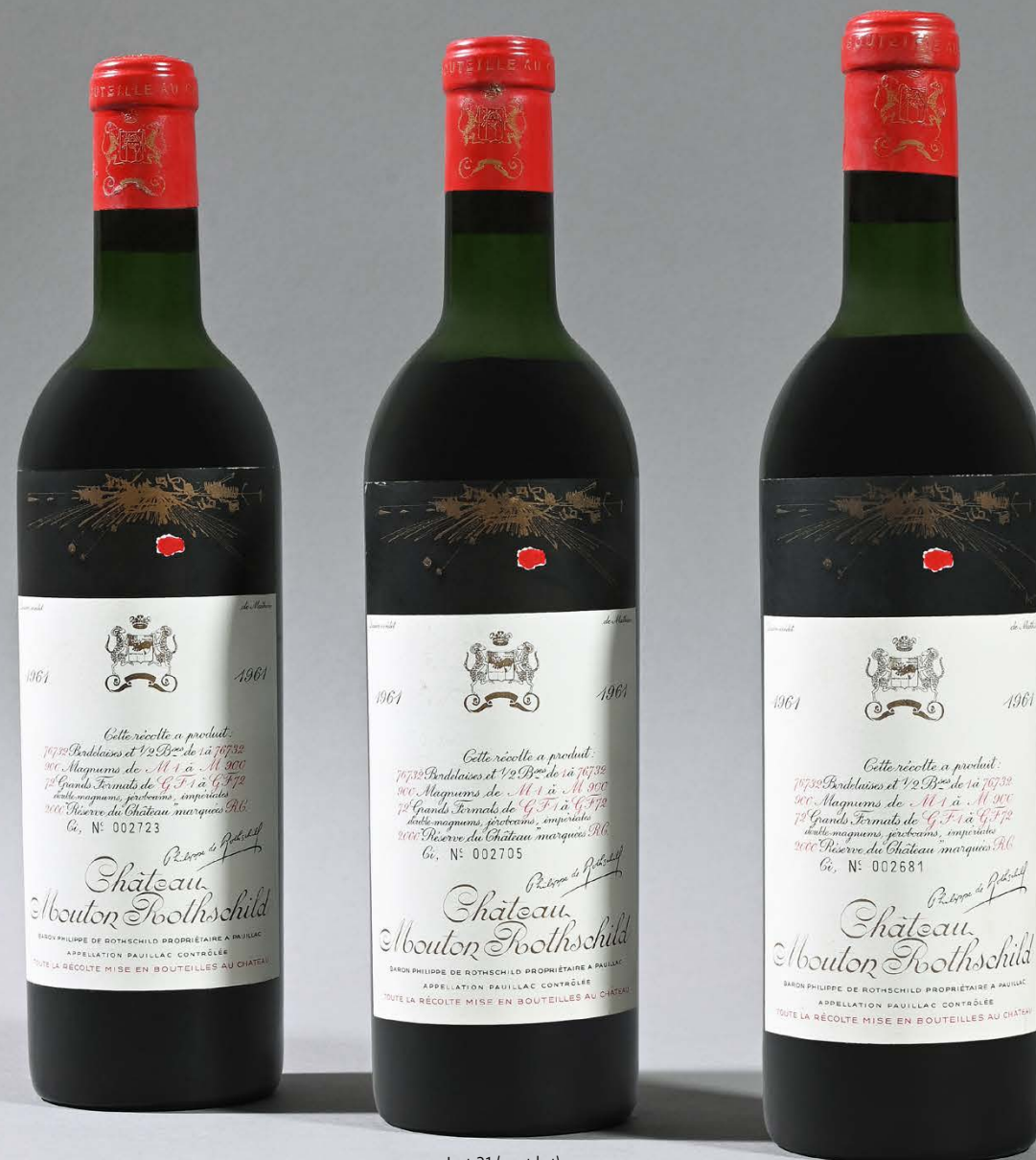
Lot 31 (part lot)