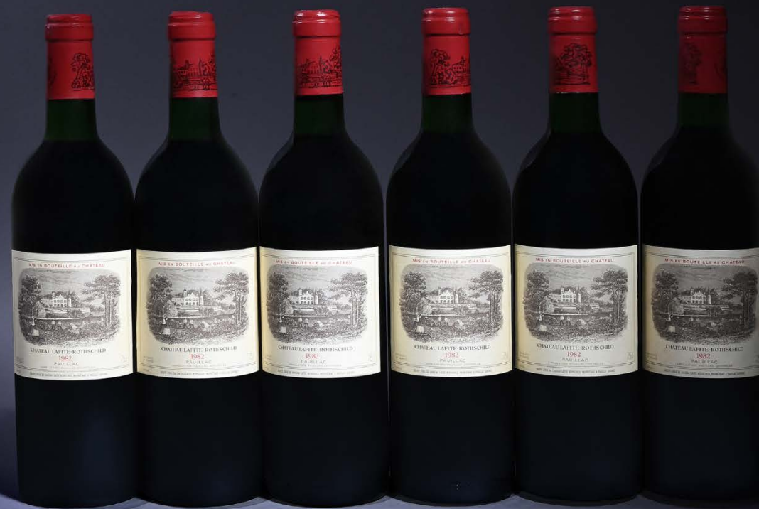
Lot 58 (part lot)