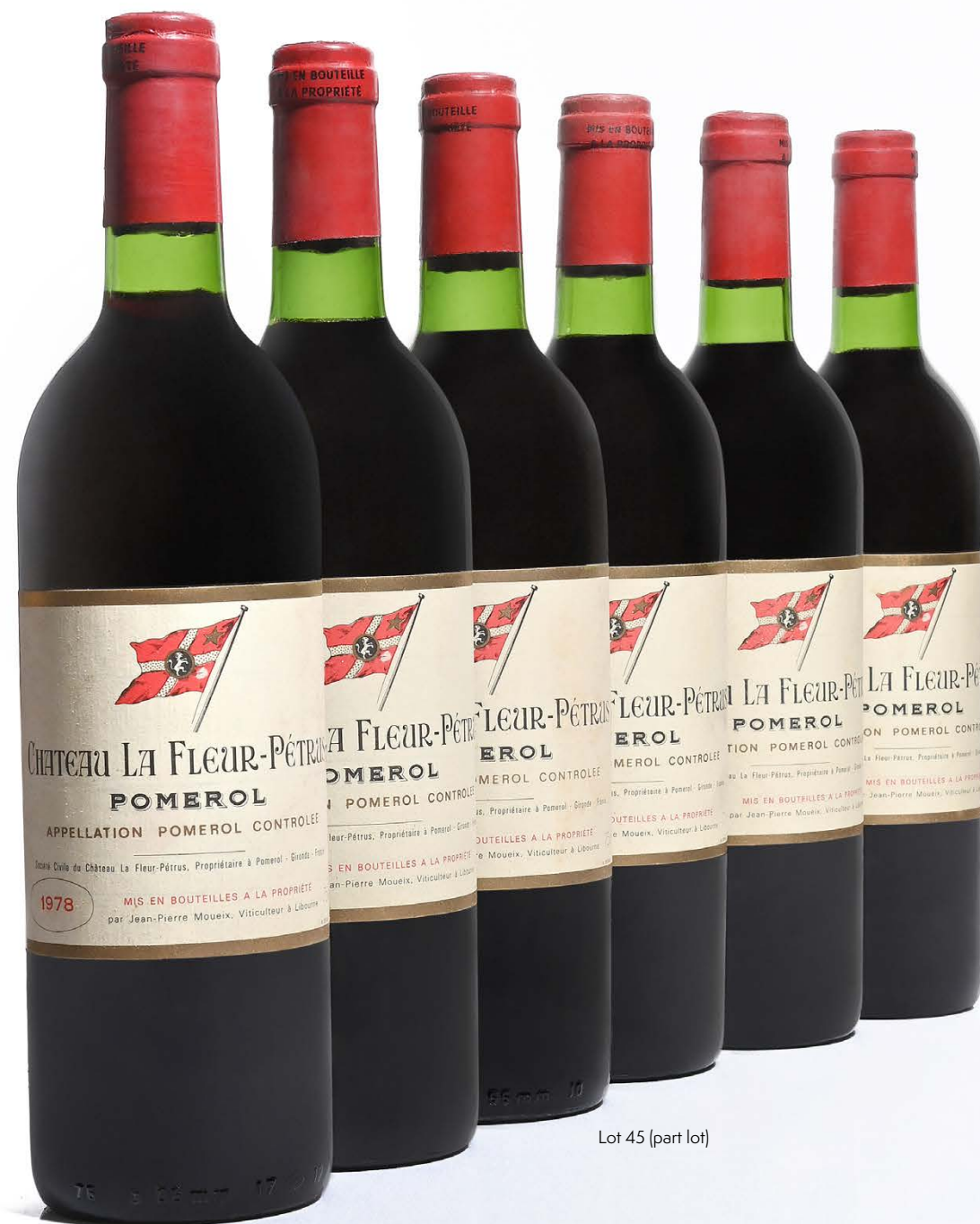
Lot 45 (part lot)