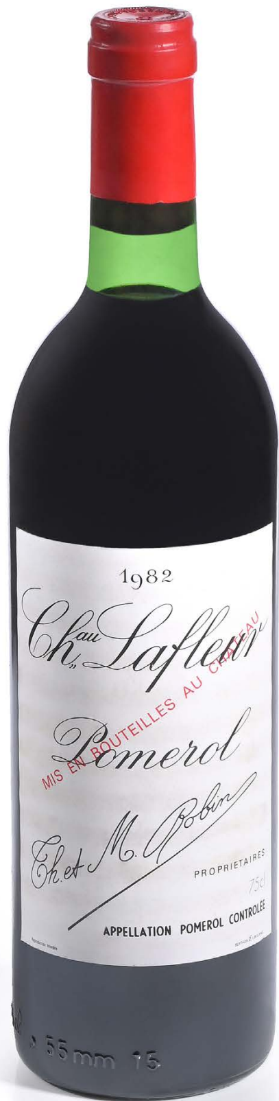
Lot 67 (part lot)

67 1982 Chateau Lafleur, Pomerol OWC 12x75cl