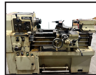
CADILLAC ENGINE LATHE