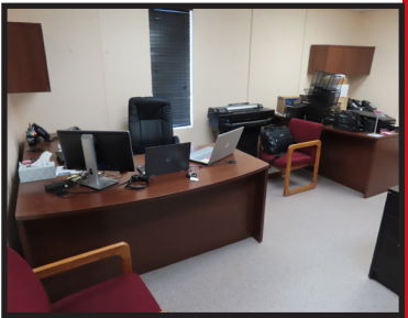
GREAT OFFICE EQUIPMENT!