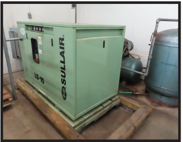
SULLAIR 25 HP SCREW