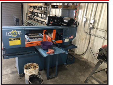
DOALL C-916 HORIZ. BANDSAW