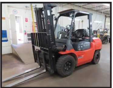
TOYOTA 8K FORKLIFT!!