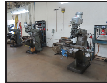
(3) BRIDGEPORT MILLS!