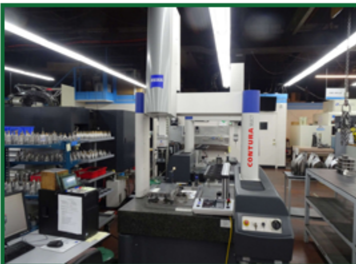
Zeiss Contura Select 7/7/6 Coordinate Measuring Machine

Pre-Auction Offers Invited For Major Assets