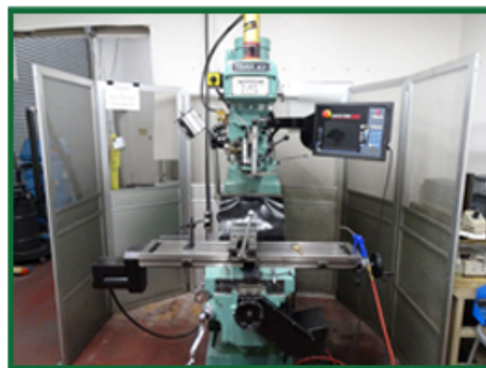
2017 Southwestern Industries TRAK K3SX CNC Knee Mill