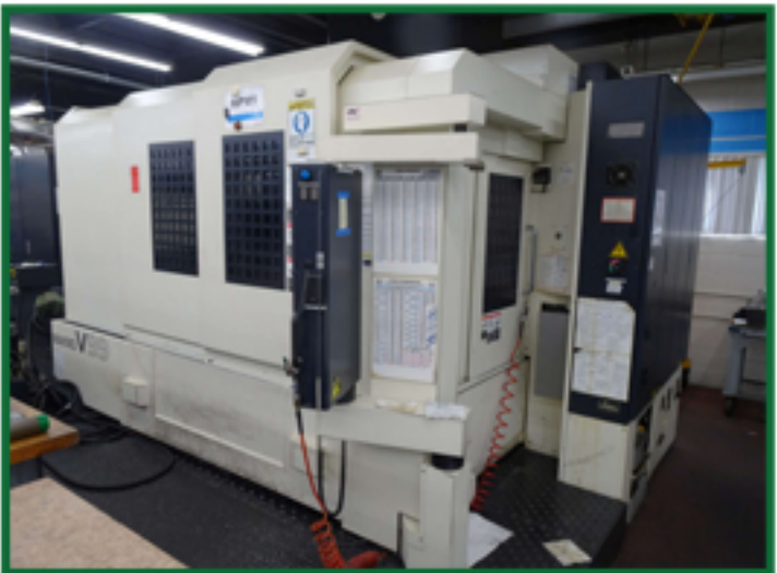
Makino V99 CNC Vertical Machining Center