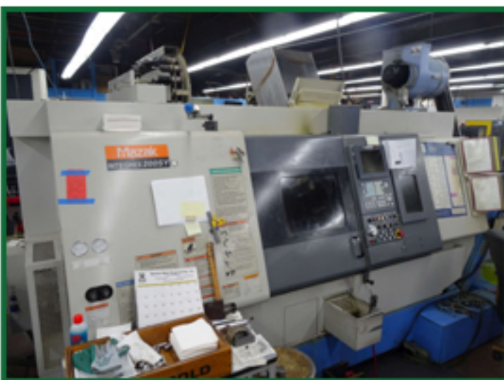
Mazak Integrex 200SY CNC Lathe