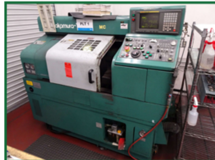
Nakamura-Tome TMC-15 CNC Lathe