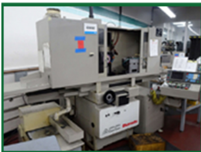
Okamoto 8" x 20" CNC Grinder, Model ACC-8-20DXNCP