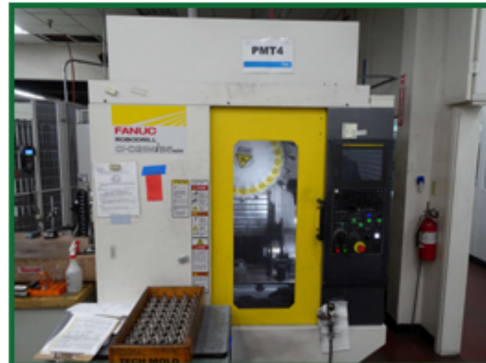
2018 Fanuc alpha-D21MiB5ADV 4-Axis CNC Vertical Machining Center