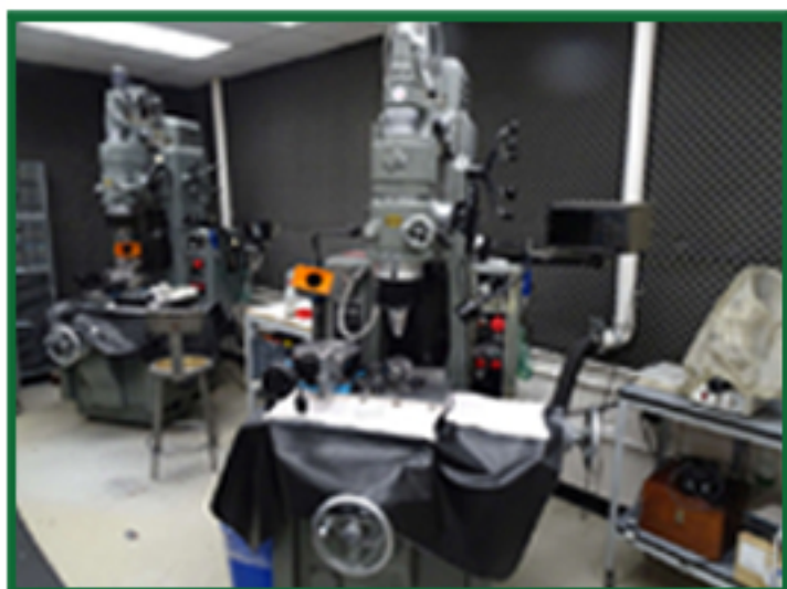
Moore G18 Jig Grinder

Inspection Location: 1735 W. 10th Street, Tempe, Arizona 85281-5207