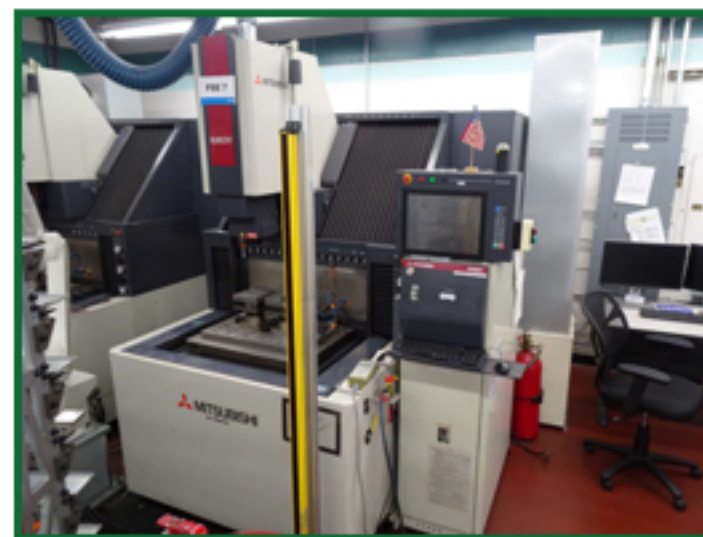
2008 Mitsubishi EA12V CNC Sinker EDM