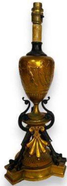
144 A late 19th century French neo-grec bronze and gilt bronze table lamp base The ovoid body with classical dancing maidens, on a triform base with eagle's legs and feet with anthemion, fitted for electricity, 47cm high including fittings. £300-£500