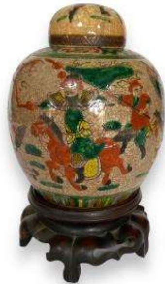
240 A late 19th century Chinese crackle glaze jar Decorated with warriors and Samurai, on a hardwood stand, the lid repaired, 21.5cm high (not including stand). £40-£60