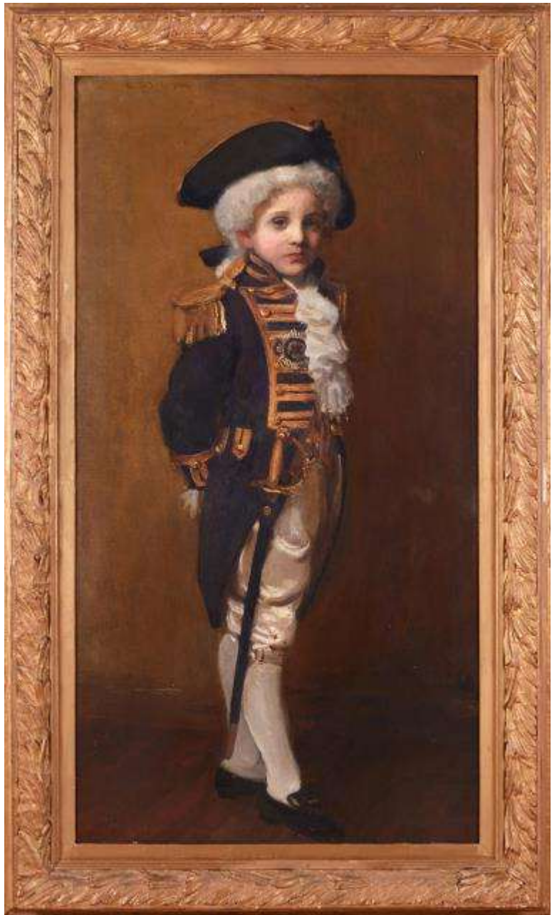
117 Frank Thomas Copnall (British, 1870– 1949) Pair of oil on canvas of two boys dressed as Nelson & Napoleon Each signed and one dated 1902 Each 133 x 69cm (2)