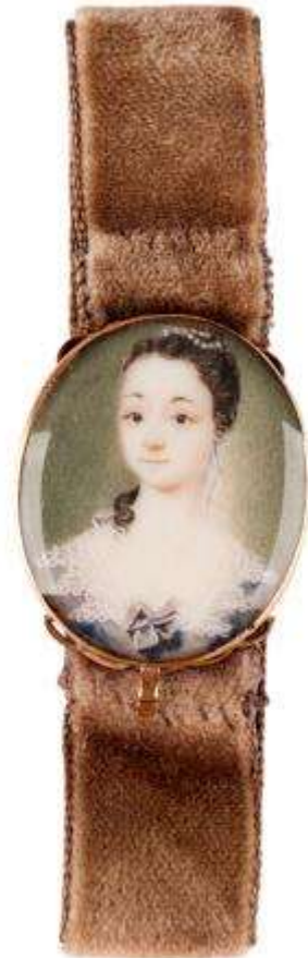
265 18th century Continental School A portrait miniature of a lady Her hair upswept and dressed with a band c pearls, wearing a blue dress with a white lace collar and a bow to her décolleté, watercolour on ivory, gold coloured bracelet mount, fixed to a later velvet band, with a label to the reverse inscribed '***annal Yorke, 2nd wife of Robert Carey, born about 1750, mother of Ws. As***', oval, 3cm high. £150-£200