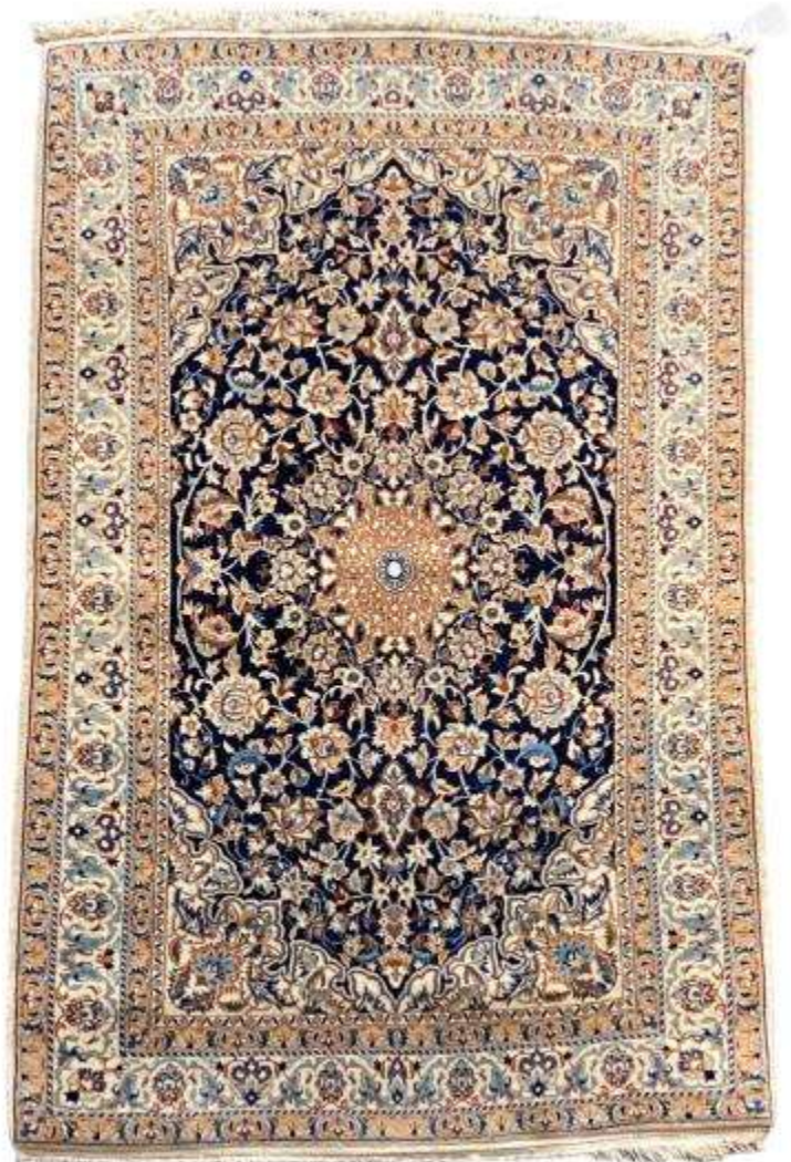
152 A fine vintage Nain rug with silk highlights, Central Persia 145cm x 129cm. £350-£450