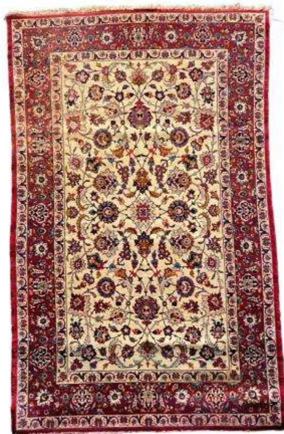
37 An Isfahan wool and silk rug 161cm x 106cm £400-£600