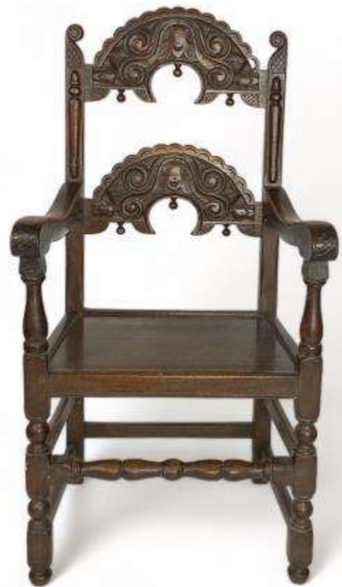
18 A 17th century style carved oak Derbyshire open armchair With carved horizontal splats, open arms and panelled seat above a turned fascia stretcher and double side stretchers, on block and turned feet, 58cm wide, 45cm deep, 115cm high, seat height 45cm. £250-£350