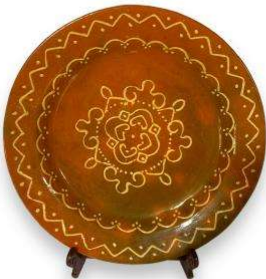
27 A vintage slipware decorated charger With a central motif and running motifs to the borders, 42.5cm diameter. £30-£50