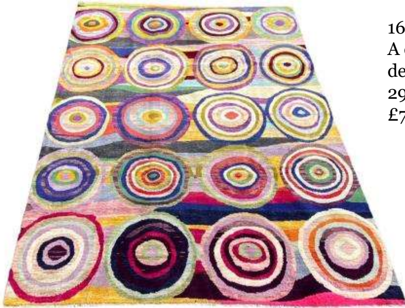
164 A contemporary Scandinavian design carpet 298cm x 239cm £700-£1,000