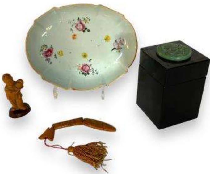
241 A group of Chinese items Comprising a shaped famille rose decorated celadon dish, a 20th century black lacquered box with a carved jade disc inset into the lid, an articulated fish and detailed carved wooden figure of a student. (4) £40-£60