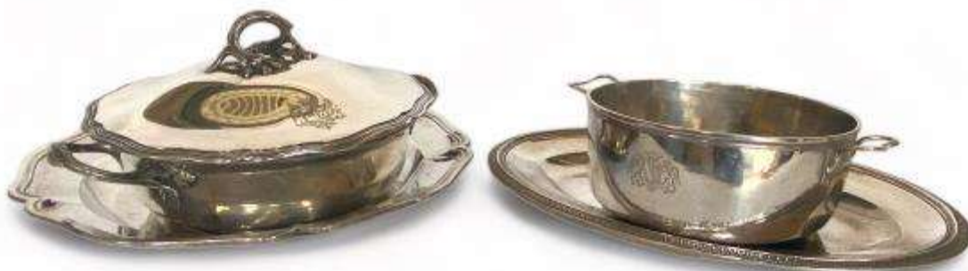
256 A Victorian silver plated tureen, dish and cloche A large 19th century silver plated boat shaped tureen and lid, 41cm wide, a Victorian silver plated embossed oval dish raised on feet, 31cm wide, and a late Victorian silver plate cloche by Maple & Co. Ltd, London, 35.5cm wide. (3) £60-£80

This lot containing ivory has been registered in accordance with Ivory Act (section 10) Ref. NYJC7F29