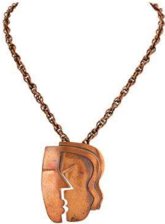
264 A vintage Rebajes, 'The Kiss' copper pendant necklace 28cm long, signed. £60-£80