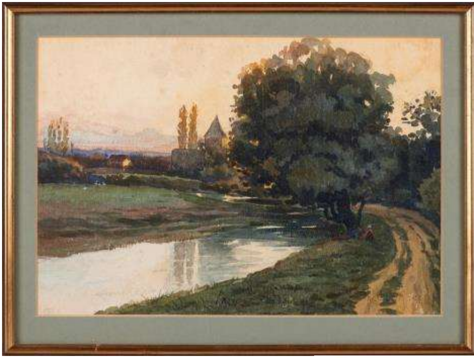
119 Roger de Brem River landscape Watercolour Signed and dated 1925 25cm x 35cm £30-£50