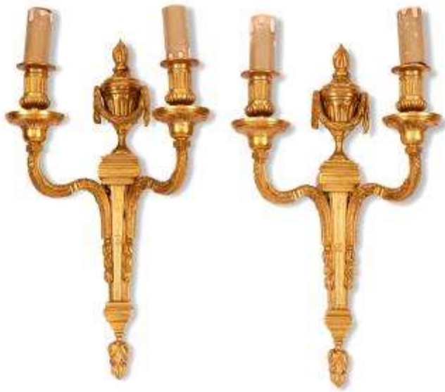
143 A pair of Louis XVI ormolu twin-light wall lights With swagged urns and flame finials, issuing scrolls arms, drilled and fitted for electricity, each 41cm high. (2) £150-£200