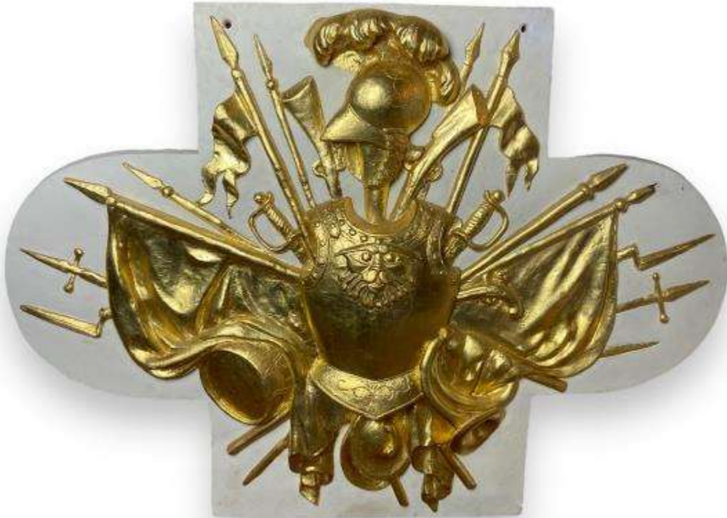
26 A white and gilt plaster military trophy wall plaque 97cm wide £300-£500