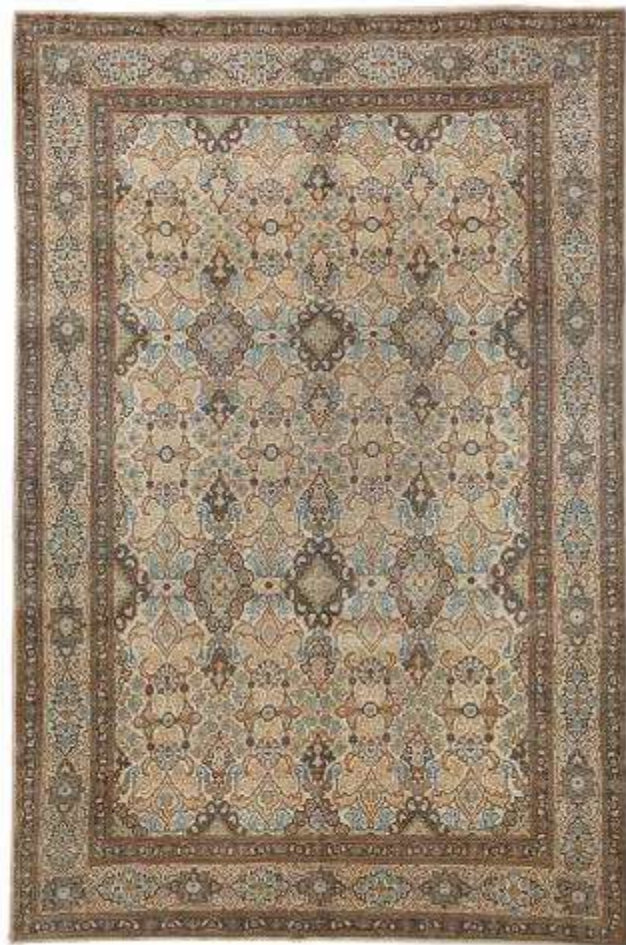
159 A vintage Tabriz carpet, North West Persia 306cm x 202cm. £600-£800