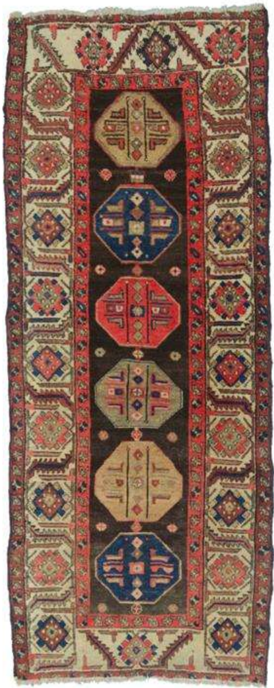
154 A Malayer runner, Central Persia, circa 1880 228cm x 90cm. £500-£800