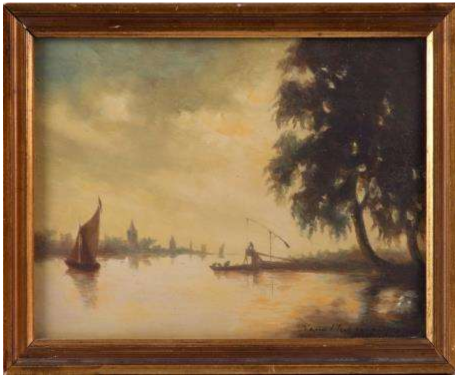
176 19th century school After the 17th century Dutch school A pair of river landscapes Oil on board Unsigned Each 15cm x 21cm (2) £200-£400