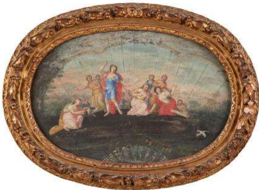
167 An 18th century French gouache design for a fan Contained within an 18th century carved giltwood oval frame, 23cm x 34cm. £500-£800