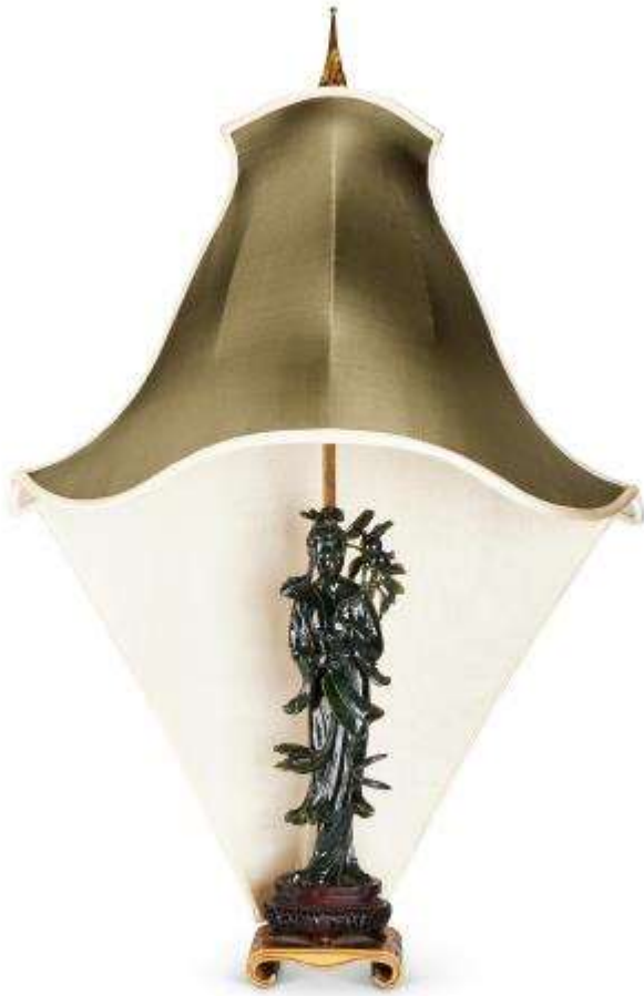
239 A 1920's Country House Chinese carved figural lamp in the form of Guan Yin With stylish silk shade, 76cm high. £200-£300