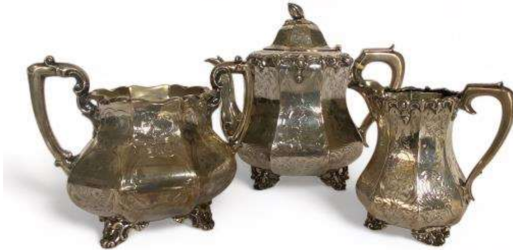
255 ¥ A Victorian silver three-piece tea set by Charles Reily and George Storer, London, 1850 Comprising teapot, sugar bowl and milk jug, of octagonal baluster form, on pierced foliate scroll feet, the teapot with ivory insulating bands, 54oz (1550 gm). (3) £400-£600

This lot containing ivory has been registered in accordance with Ivory Act (section 10) Ref. NYJC7F29