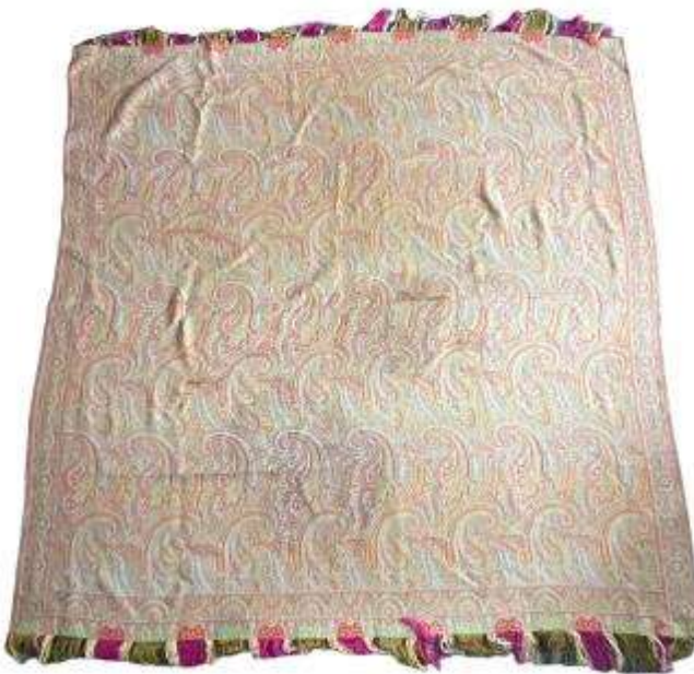
75 Two Victorian wool shawls One of Paisley pattern in red and gold with tassels, 170cm x 164cm, the other of red floral sprays on a cream ground, 146cm x 140cm. (2) £150-£200