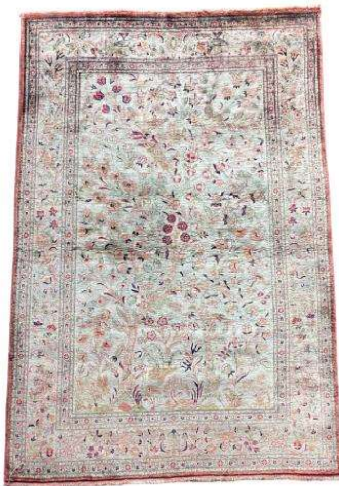
160 An antique Qum silk rug, Central Persia 157cm x 102cm £400-£600