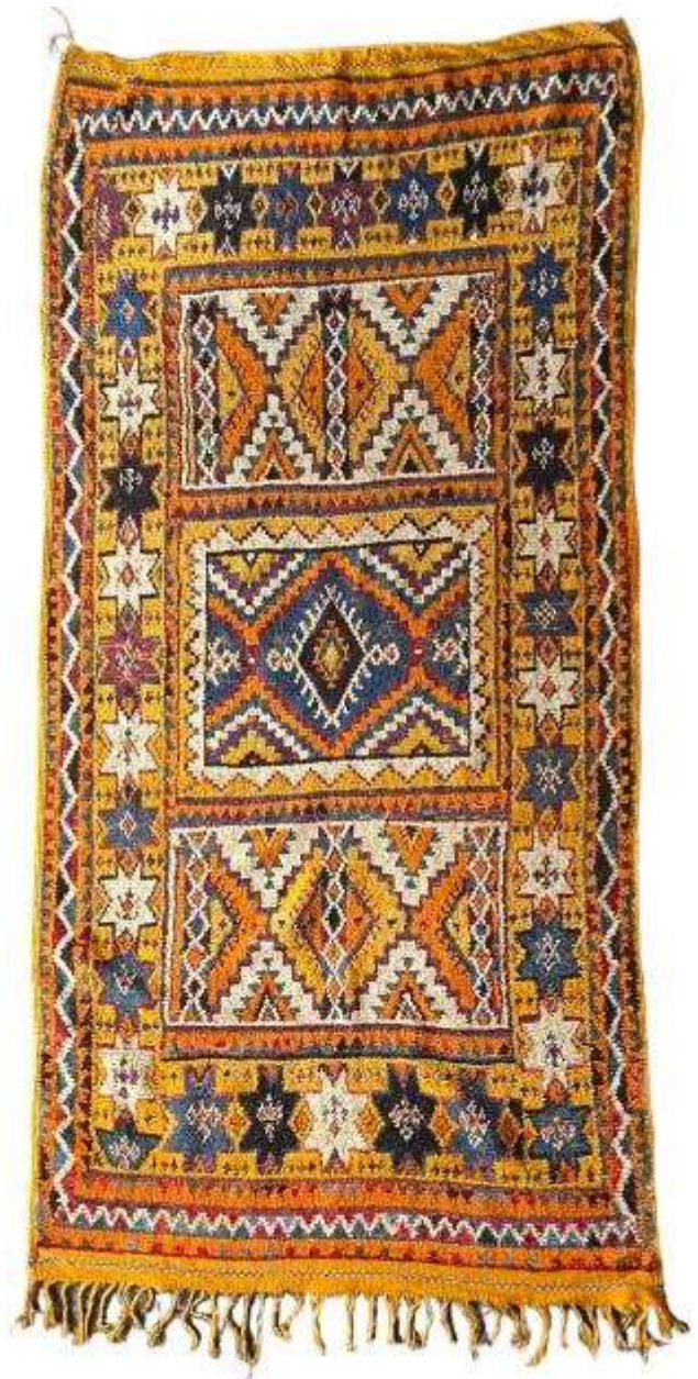
165 A vintage Moroccan wool rug 127cm x 270cm £200-£300