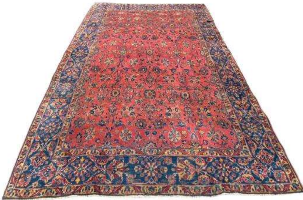
31 A Sarouk carpet, Persia, circa 1880 354cm x 281cm £1,500-£2,000