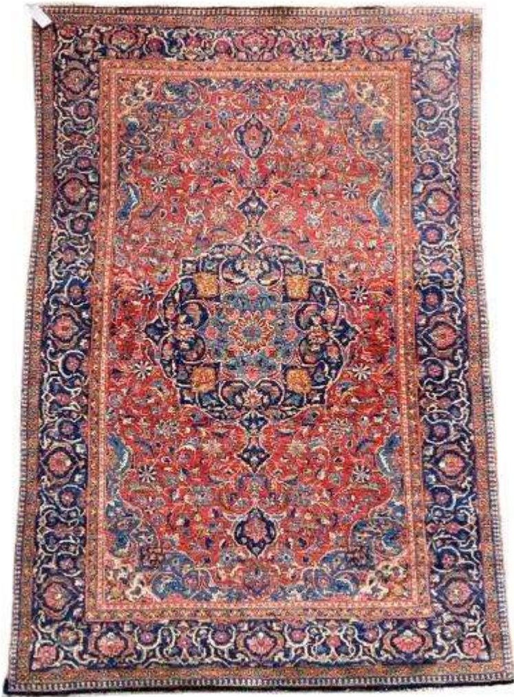
38 An antique Kashan rug, Central Persia 193cm x 133cm £400-£600