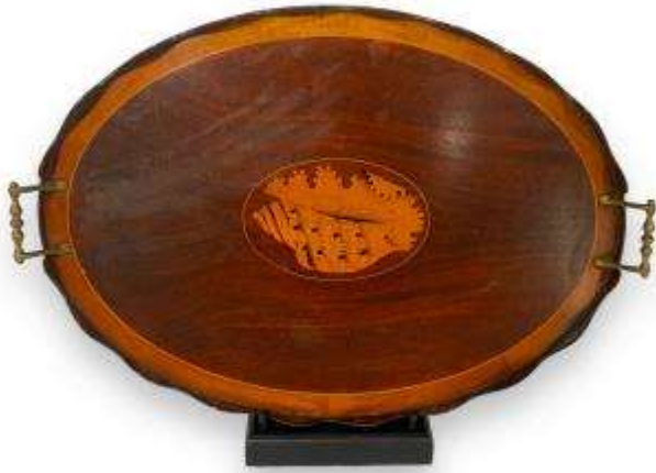
74 An Edwardian mahogany and marquetry oval twin handled tray in the Georgian style inlaid with a conch shell and with brass carrying handles, 59cm wide. £30-£40