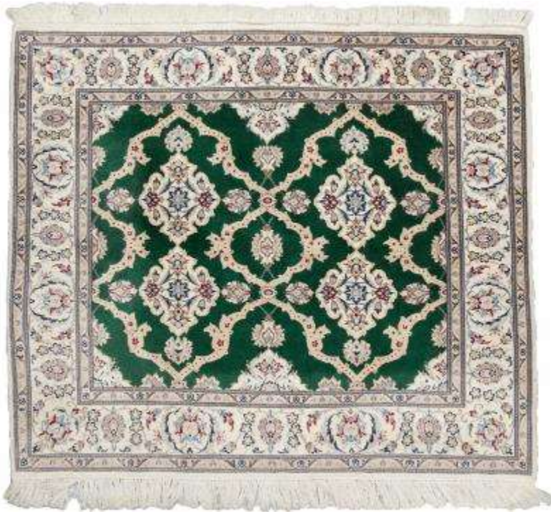
152 A fine vintage Nain rug with silk highlights, Central Persia 145cm x 129cm. £350-£450