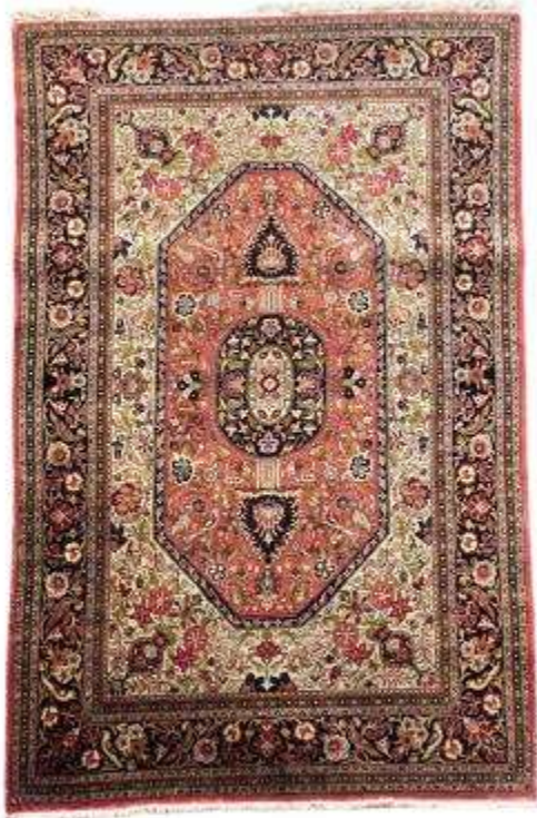
163 A Qum silk rug, Central Persia 161cm x 106cm £400-£600