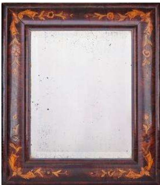
19 A late 17th century walnut and later sycamore floral marquetry cushion framed mirror With replaced bevelled plate, 69cm x 60cm. £300-£500