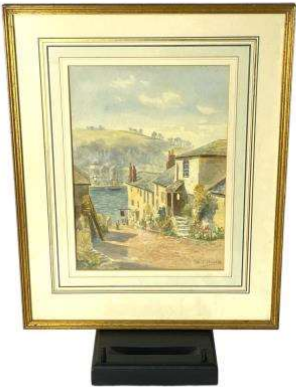
115 A J Howies Road to the Harbour Watercolour on paper Signed 32cm x 22cm Together with: Louisa Margaret Larking (b.1898) Landscape with farmhouse Watercolour and pencil 21cm x 33cm. (2) £150-£200