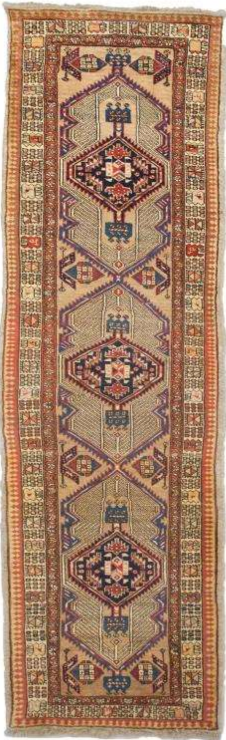
32 A vintage Sarab runner, North West Persia 333cm x 92cm. £500-£800