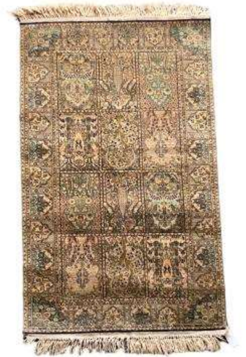
A silk Hereke style rug 126cm x 77cm £200-£300