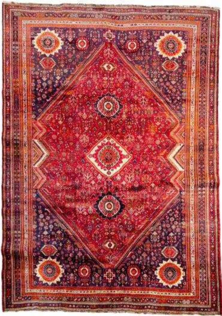
34 A vintage Qashgai carpet 304cm x 213cm. £1,000-£1,500