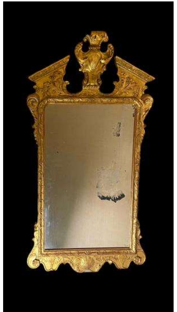
39 A George I carved giltwood and gesso mirror The later rectangular plate within an acanthus carved frame, on a punched ground; surmounted by a broken arch pediment centred by a leaf carved cabochon cresting, with shell carved undulating apron below, re-gilt, 117cm high, 62cm wide. £1,200-£1,800