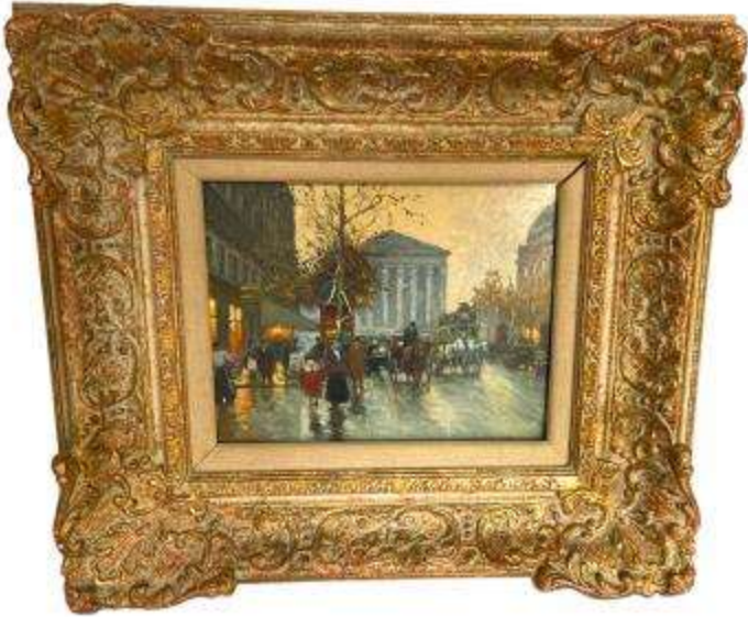
186 20th century Continental School Parisian Streets A pair of oil on boards in elaborate frames Unsigned Each 18cm x 23cm (2) £60-£100