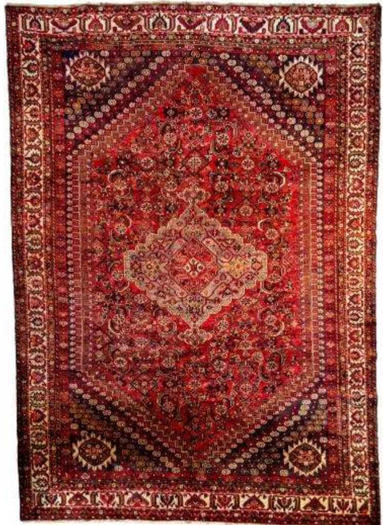
35 A Shiraz carpet, South West Persia 333cm x 250cm. £1,000-£1,500