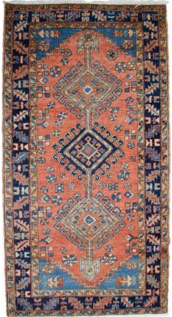
33 A Heriz rug, North West Persia, circa 1900 160cm x 97cm. £600-£800