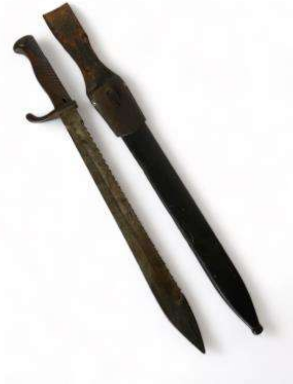
81 A Mauser WWI German sawbuck blade bayonet & leather scabbard Stamped WAFFENFABRICK MAUSER AG OBERNDORF, with a crown and W17 on the spine, 54cm long £150-£200