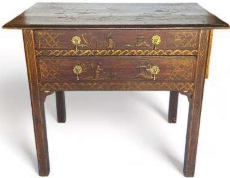
17 A George III red japanned lowboy Heightened with gilt chinoiserie, the rectangular top above two frieze drawers on square legs with pierced corner brackets, 84cm wide, 51cm deep, 71cm high. £800-£1,200