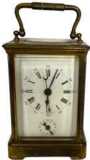
72 A brass carriage clock With enamelled dial with Roman numerals and subsidiary seconds dial, 18cm high. £200-£300