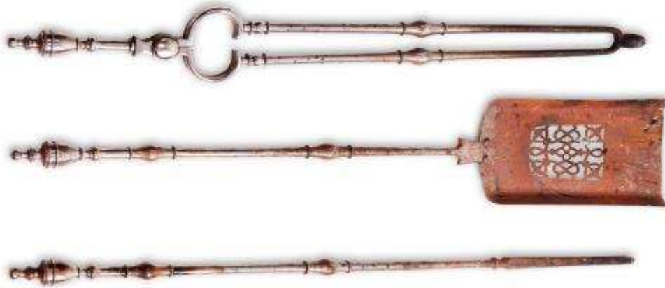
30 A set of three early 19th century polished steel fire tools Comprising a shovel, pair of tongs and a poker, with vase shaped pommels, the shovel 78cm long. (3) £200-£300