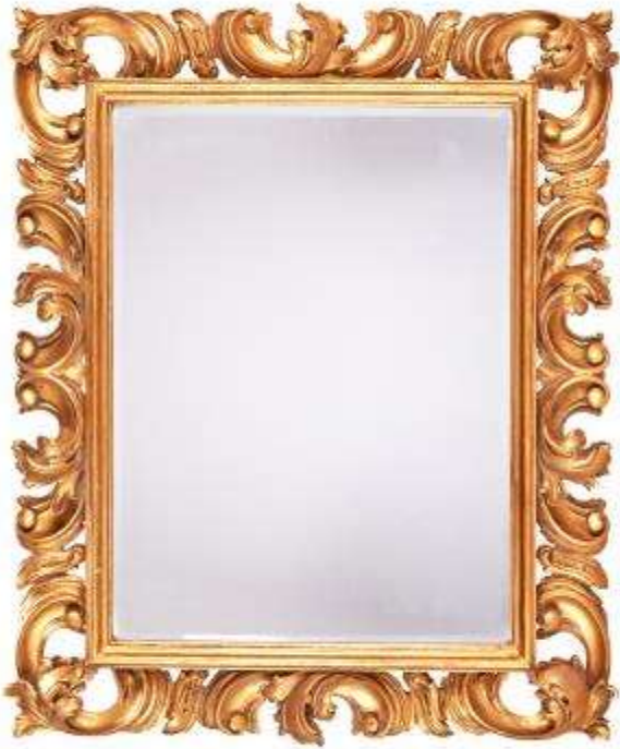
125 A 19th century carved gilt wood Florentine style wall mirror The rectangular bevelled plate within a moulded square frame surrounded by foliate scroll work, 82cm high, 67cm wide. £300-£500