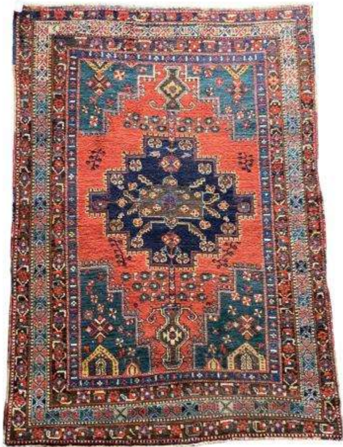
36 An antique Qashqai rug, Persia 192cm x 136cm £250-£350