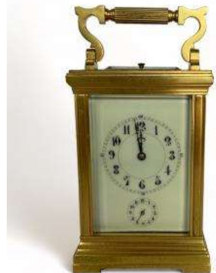
73 A French quarter-striking brass carriage clock With enamelled dial with Arabic numerals and subsidiary seconds dial, 19cm high. £700-£900