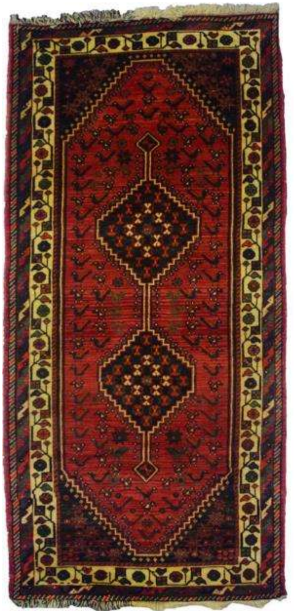
155 A vintage Bownat runner 199 cm x 94 cm £150-£200