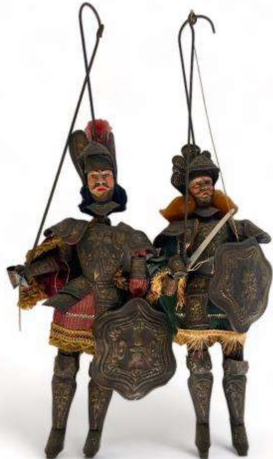
82 A pair of early 20th century Sicilian puppets of Orlando and Rinaldo Catania, the puppets themselves each 68cm high. (2) £60-£80