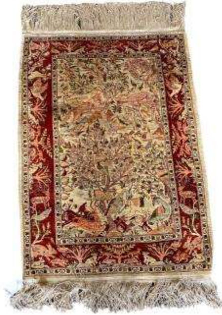
161 An antique Turkish silk Hereke rug 96cm x 68cm £250-£350