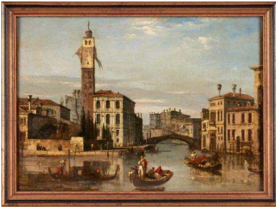
173 19th century Italian school San Geremia and Entrance to the Cannaregion and View of the Rialto Bridge A pair of oil on canvas Unsigned Each 25cm x 34cm. (2) £1,000-£1,500