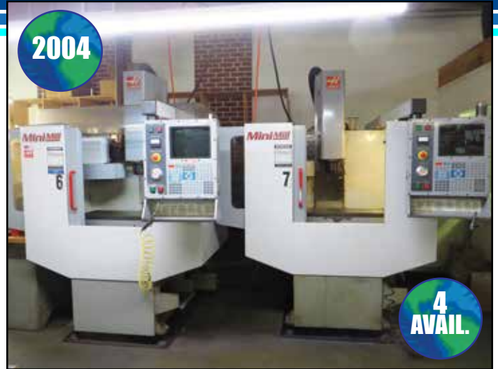
(4) HAAS MINI-MILL 3-AXIS CNC MILLING MACHINES