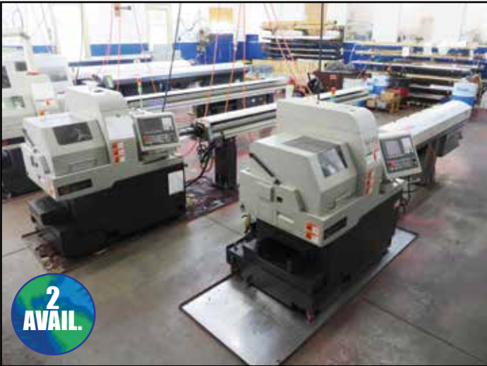
(2) HANWHA TECHM XP12S 4-AXIS CNC SWISS TYPE SCREW MACHINES