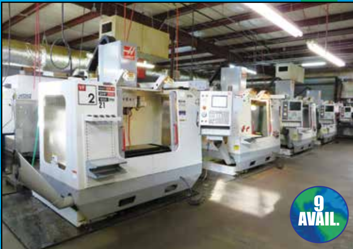
(9) HAAS VF-2D CNC VERTICAL MACHINING CENTERS