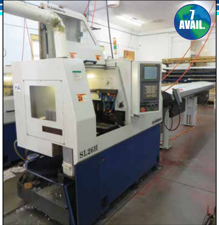
(7) HANWHA SL26H, SL20H & ML20H 4-AXIS CNC SWISS TYPE SCREW MACHINES