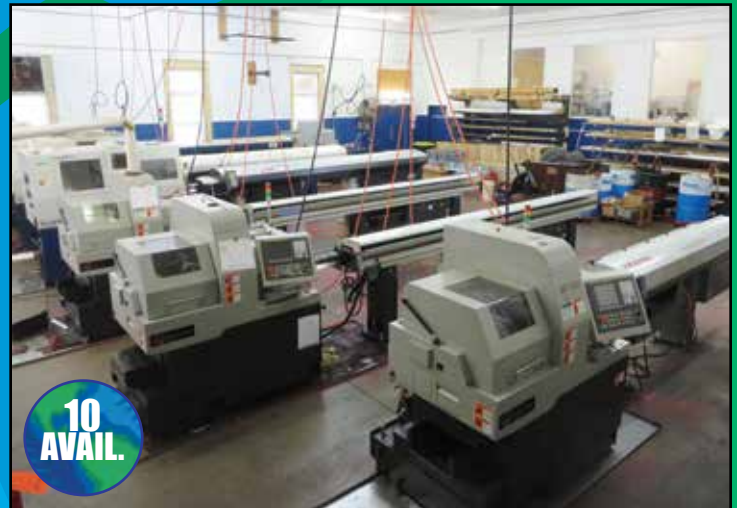
(10) HANWHA CNC SWISS TYPE SCREW MACHINES