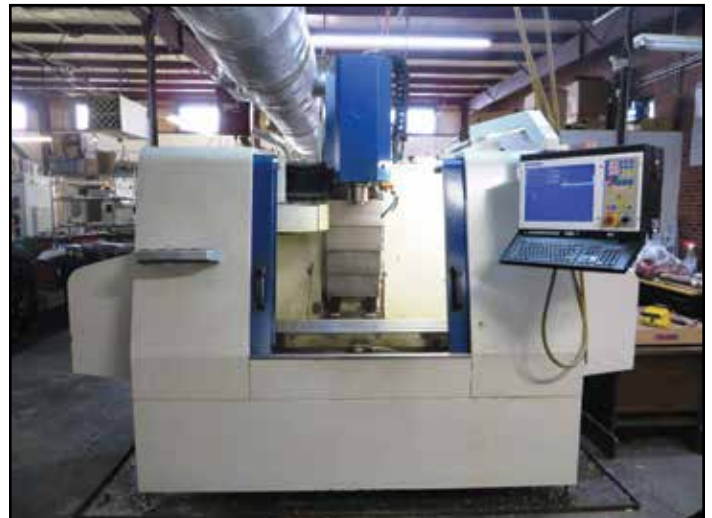
REMEDY 3-AXIS CNC MACHINING CENTER