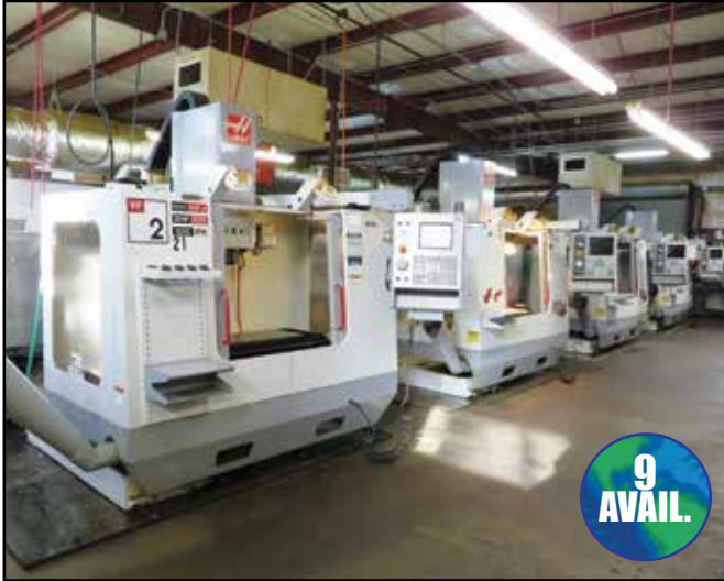
(9) HAAS VF-2D CNC VERTICAL MACHINING CENTERS

PRESORTED FIRST-CLASS MAIL U.S. POSTAGE PAID KOKOMO, IN PERMIT #154