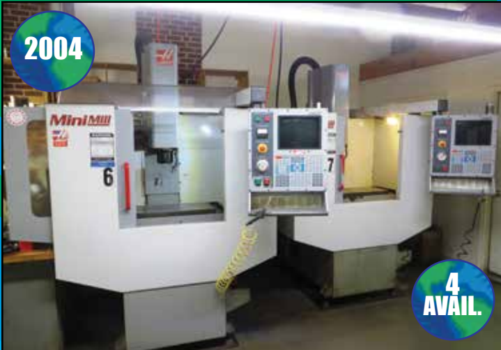
(4) HAAS MINI MILL 3-AXIS CNC MILLING MACHINES

Inspection: Tuesday, February 27th From 8:00 A.M. - 4:00 P.M. EST