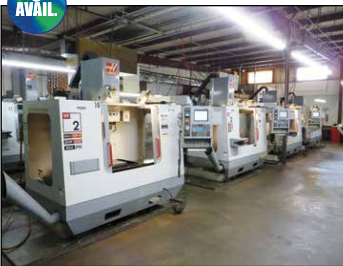
(9) HAAS VF-2D CNC VERTICAL MACHINING CENTERS