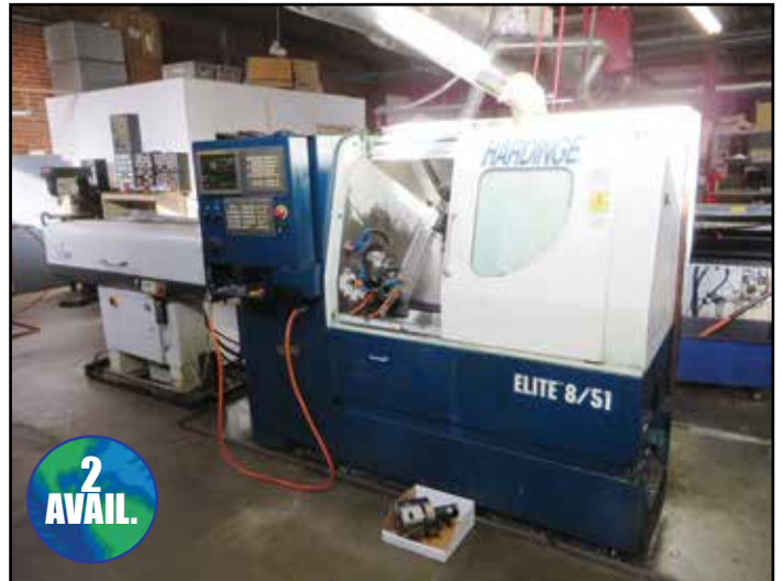
(2) HARDINGE ELITE 8/51 CNC TURNING CENTERS

Asset Sales, Inc. Does Not Pack, Ship, Crate, Transport or Rig Items. Buyers May Pick Up Their Items at the Auction Location or Can Arrange for a Third Party Logistics Firm to Manage the Removal Process for Them.