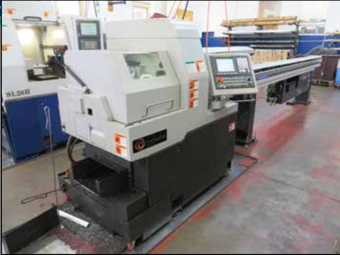
HANWHA TECHM XO16S 4-AXIS CNC SWISS TYPE AUTO SCREW MACHINE