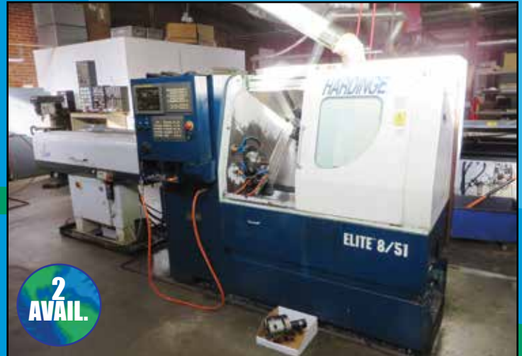
(2) HARDINGE ELITE 8/51 CNC TURNING CENTERS