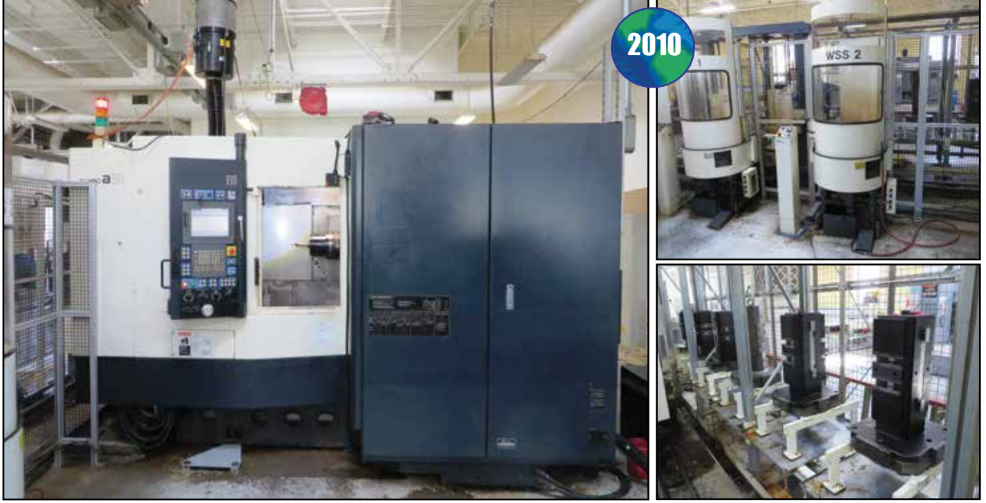
MAKINO A51 HIGH SPEED CNC HORIZONTAL MACHINING CENTER

(3) MAZAK Nexus 410A CNC Vertical Machining Centers with 16.1" x 22" Tables, #40 Taper Spindle Speeds to 12,000 RPM, Approx. 35.4" X-Axis, 16.1" Y-Axis, 22.4" Z-Axis Travels, 30 ATC, PC Fushion 640M CNC Controls, sn:163798, mfg.12/2003 • Second Location sn:167016, mfg.12/2003 • sn:182535, mfg.2006 Wired for 4th Axis