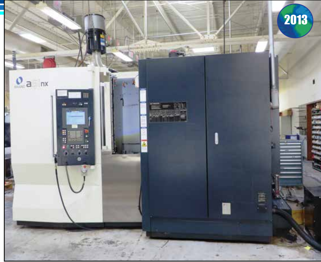
MAKINO A51NX HIGH SPEED CNC HORIZONTAL MACHINING CENTER

MACHINERY INSPECTION DATE & TIME - WEDNESDAY, JUNE 12TH FROM 8:00 A.M. - 4:00 P.M. EDT