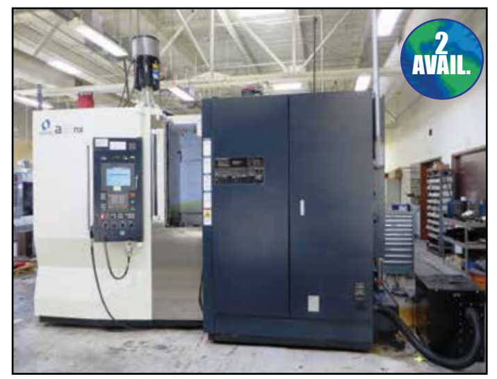
MAKINO A51NX HIGH SPEED CNC HORIZONTAL MACHINING CENTERS