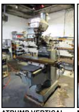
ATRUMP VERTICAL MILLING MACHINE