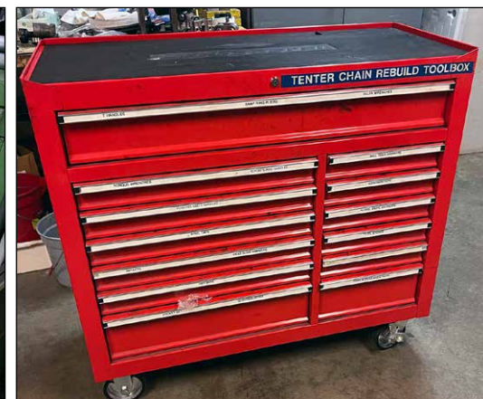
Views of Tool Cabinets