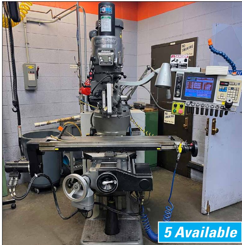
Bridgeport Series 1 EZ-Trak Vertical Mill