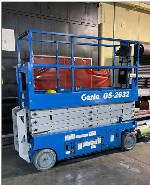
Genie GS-2632 Articulated Boom Lift