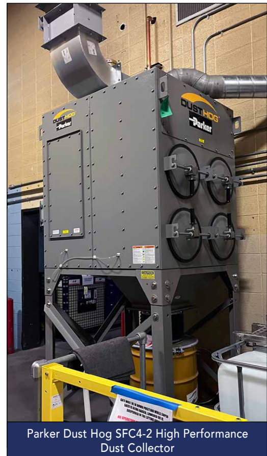
Parker Dust Hog SFC4-2 High Performance Dust Collector