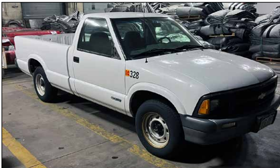
Chevrolet S10 Pickup Truck