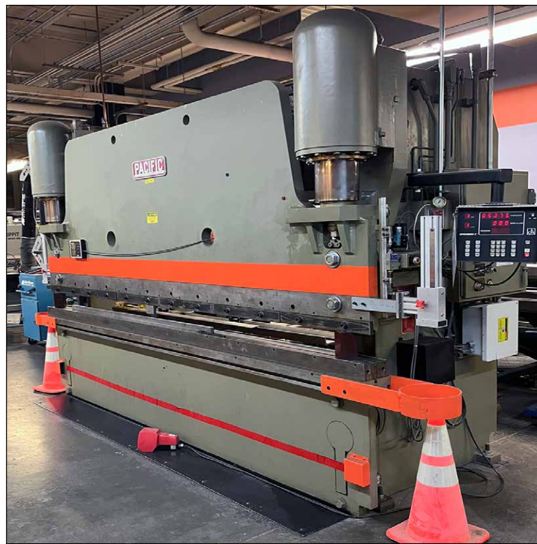
Pacific K-200-12 Hydraulic Press Brake