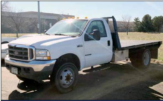
Ford F450 Flatbed Truck