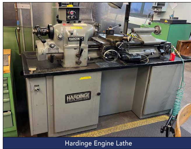
Hardinge Engine Lathe