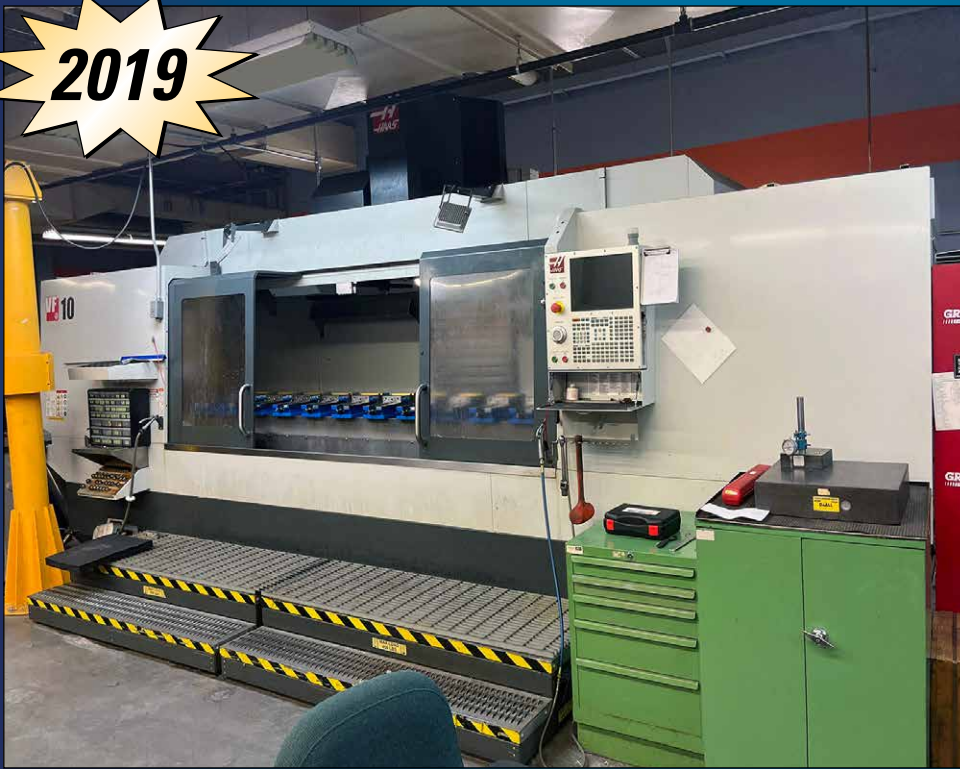
Haas VF-10/40 CNC Vertical Machining Center