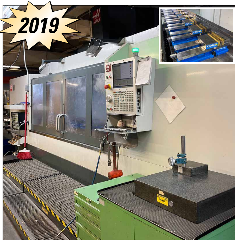
Haas VF-10/40 CNC Vertical Machining Center