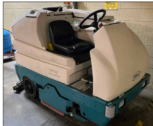
Tennant Floor Sweeper

Check Website for Terms and Conditions brileyfin.com