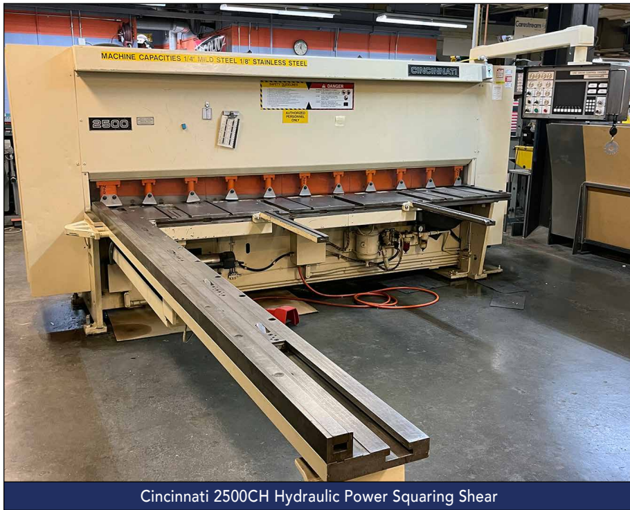
Cincinnati 2500CH Hydraulic Power Squaring Shear