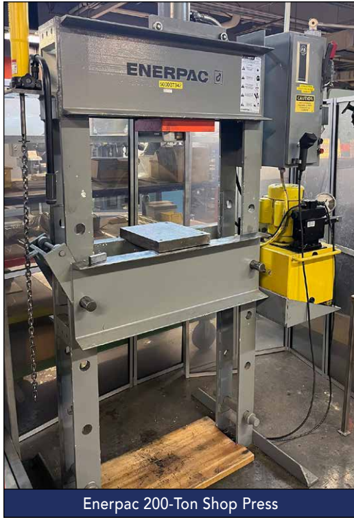
Enerpac 200-Ton Shop Press