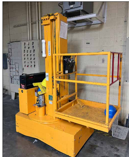
500 Lb. Vert-a-Lift