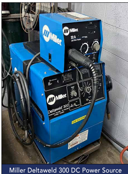
Miller Deltaweld 300 DC Power Source