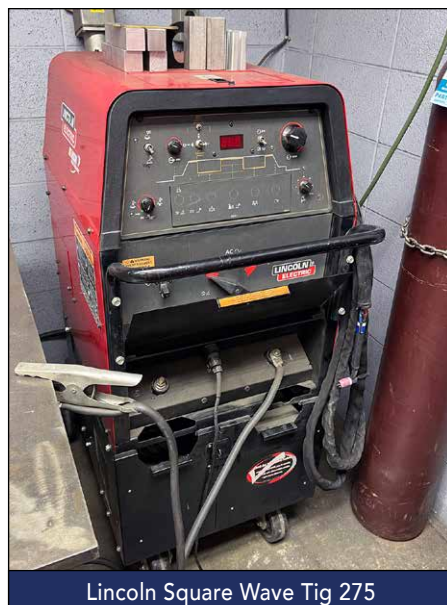
Lincoln Square Wave Tig 275