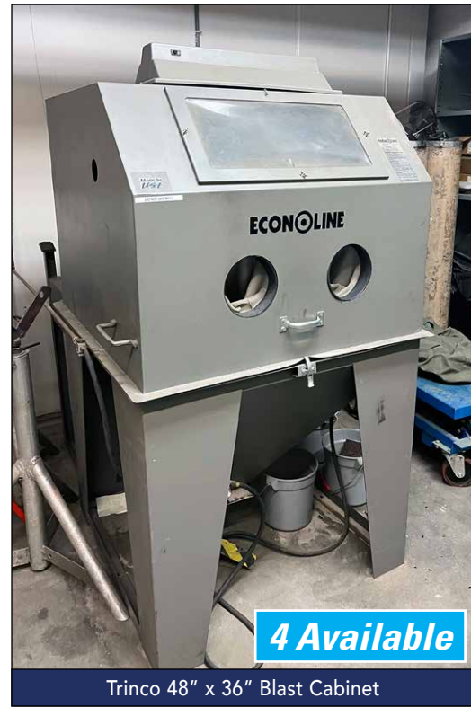
Trinco 48" x 36" Blast Cabinet