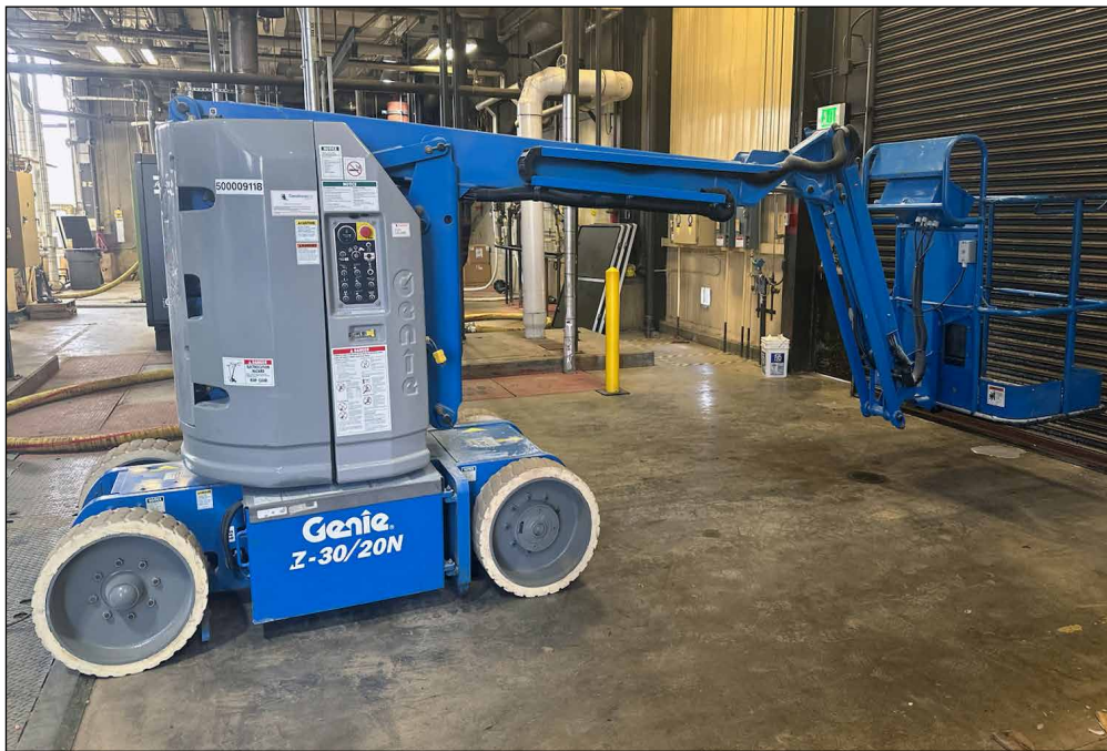
Genie Z-30/20N Articulated Boom Lift

More Trucks will be Added. Check Bidspotter for Updates.