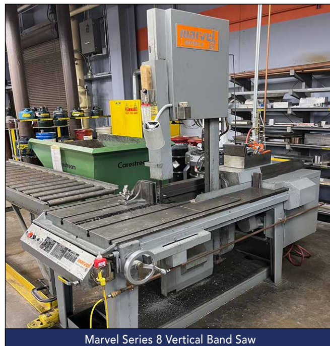
Marvel Series 8 Vertical Band Saw