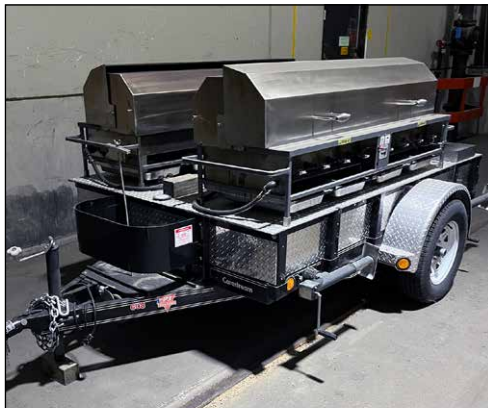
PJ Trailers Model 608 Single-Axle Modified Trailer, with Gas BBQ Systems