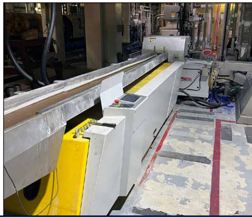
Views of NGR S: Gran 75 Plastics Shredder / Feeder / Extruder Combination Unit