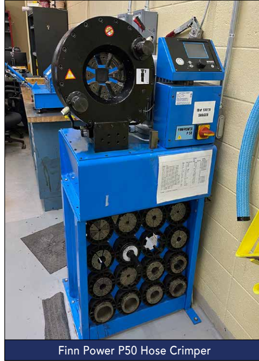
Finn Power P50 Hose Crimper