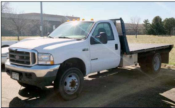
Ford F450 Flatbed Truck