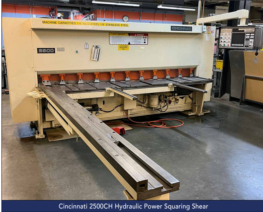
Cincinnati 2500CH Hydraulic Power Squaring Shear