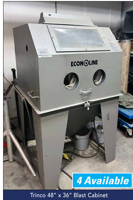
Trinco 48" x 36" Blast Cabinet