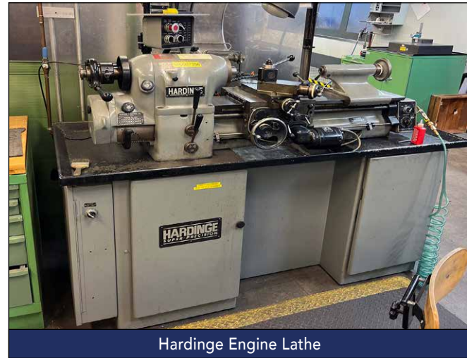
Hardinge Engine Lathe