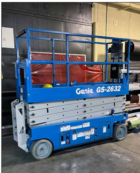
Genie GS-2632 Articulated Boom Lift