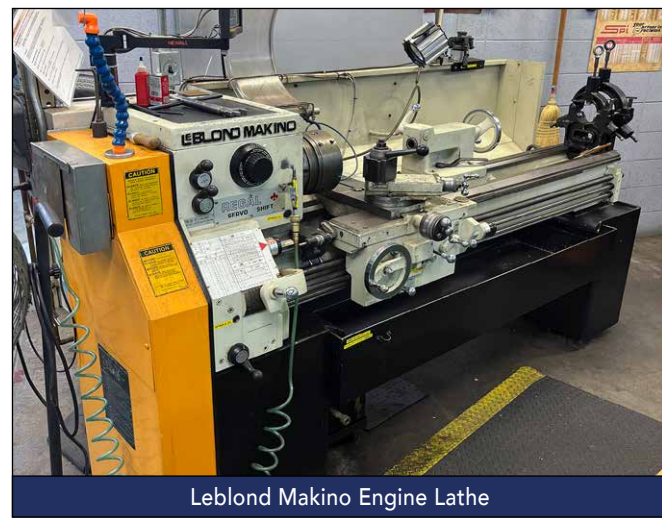
Leblond Makino Engine Lathe