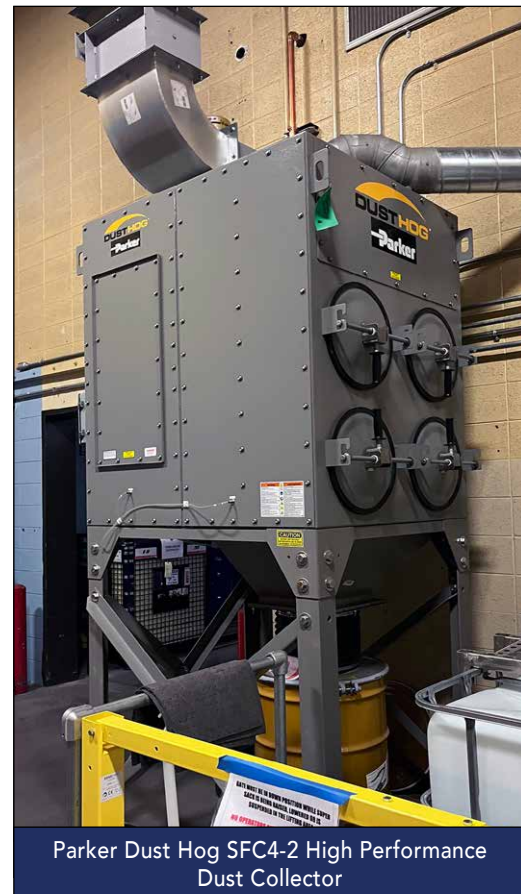
Parker Dust Hog SFC4-2 High Performance Dust Collector