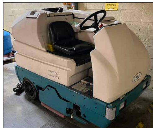
Tennant Floor Sweeper

Check Website for Terms and Conditions brileyfin.com