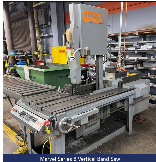
Marvel Series 8 Vertical Band Saw