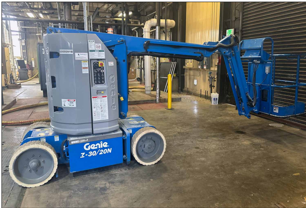
Genie Z-30/20N Articulated Boom Lift

More Trucks will be Added. Check Bidspotter for Updates.