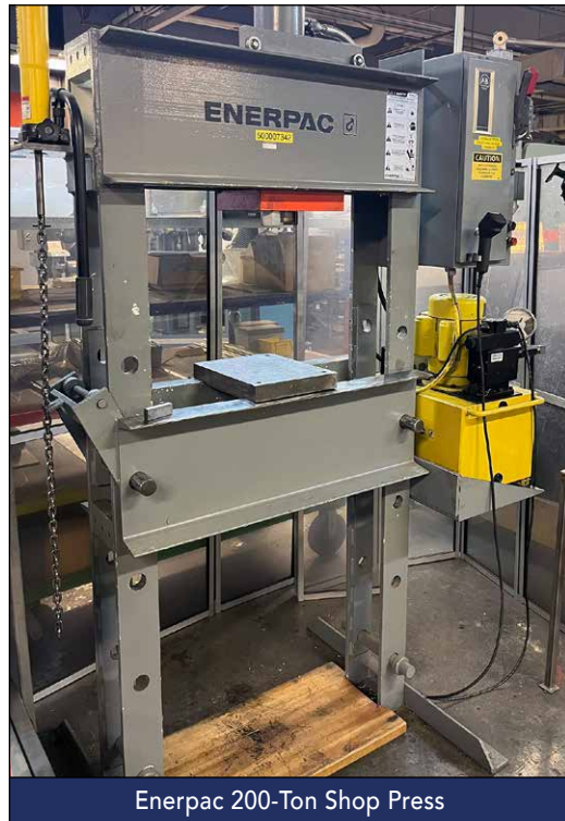
Enerpac 200-Ton Shop Press